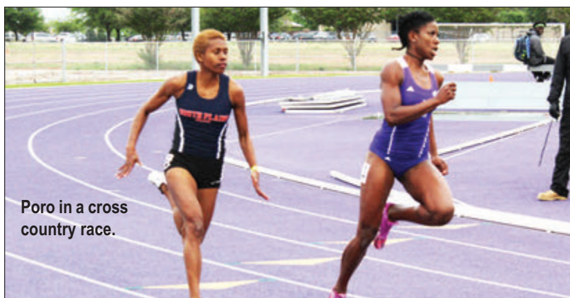
Poro in a cross country race.