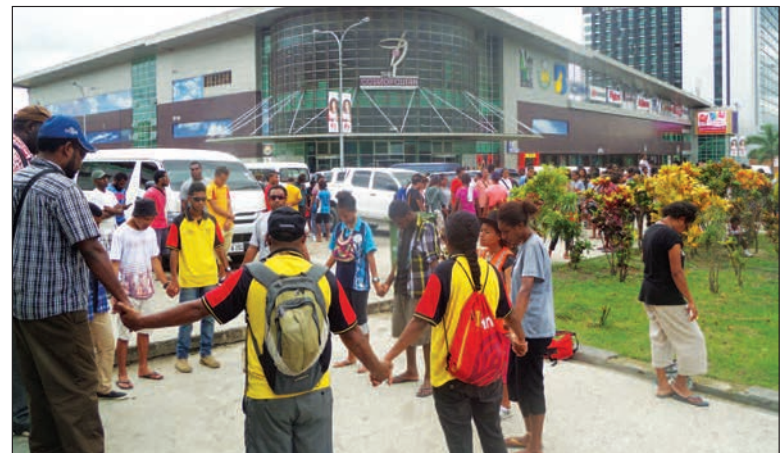
Youths holding hands and praying during the "Flash Mob" at Vision City.