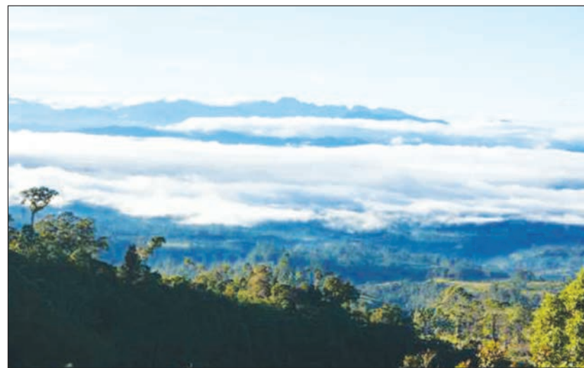
An outstanding panorama of Nebilyer and Hagen valleys from Magic Mountain Hideout.