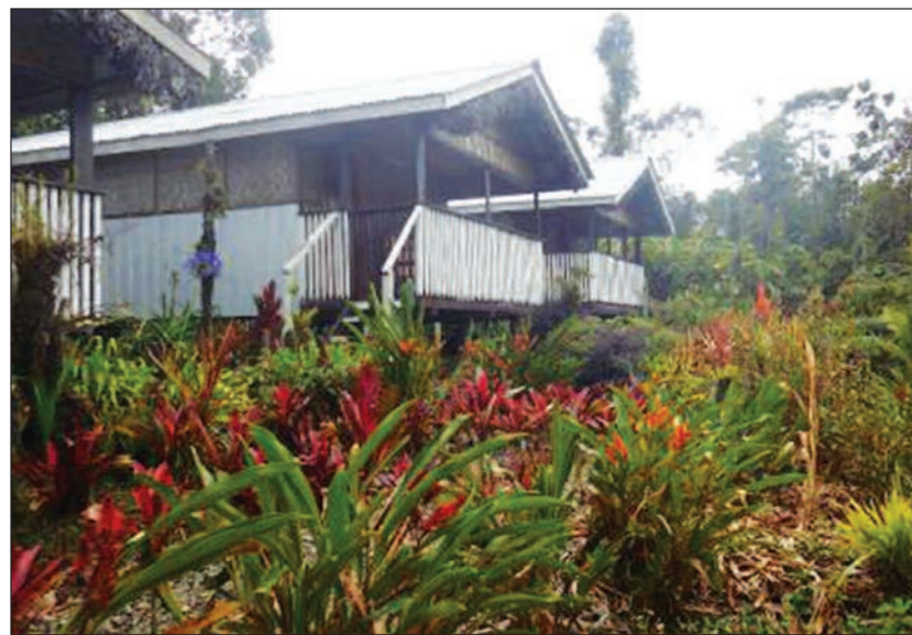
Magic Mountain hideout is adorned with different species of orchids.

The adventure expedition includes trekking and climbing Mt. Hagen which the capital city of Western Highlands Province is named after. If you want to go trekking but want something less arduous there are alternative tracks you can choose. Regardless of where you go you are sure to be enchanted by the abundant birdlife, orchids, and the mere beauty of the surroundings.