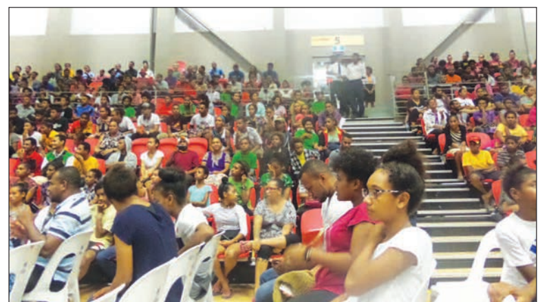
Youths filled the Sir John Guise Indoor Stadium to capacity on three nights.