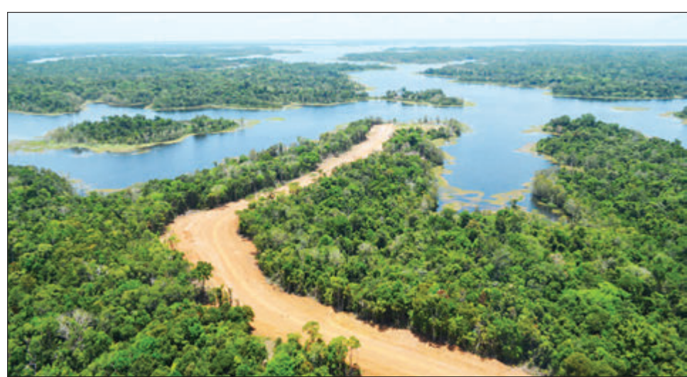
The Lake Murray end of the 45km stretch of road.