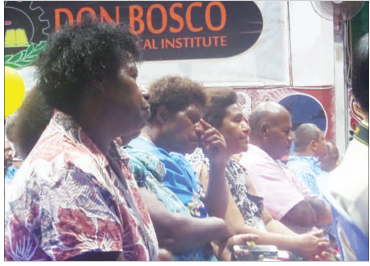
Some of the Standard Officers in attendance during the launch of the conference.