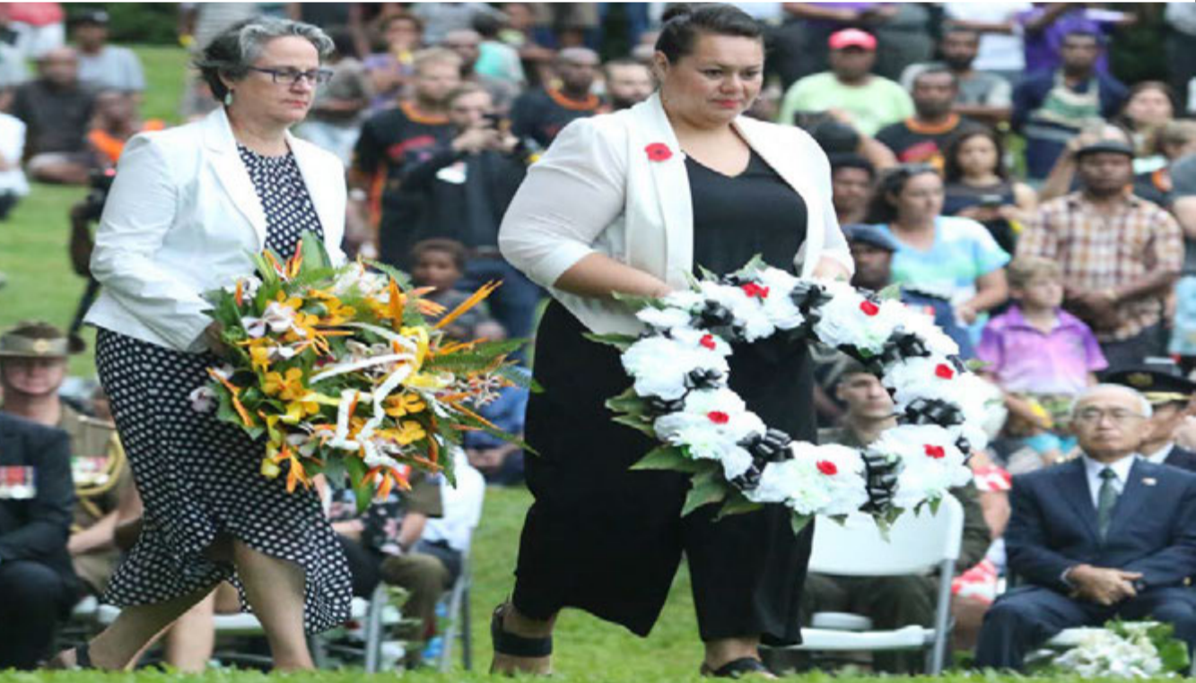
Tupela Deputi Hai Komisina bilong Australia na Nu Silan i kisim plawa bilong tupela long go lusim long soim sori bilong ol.