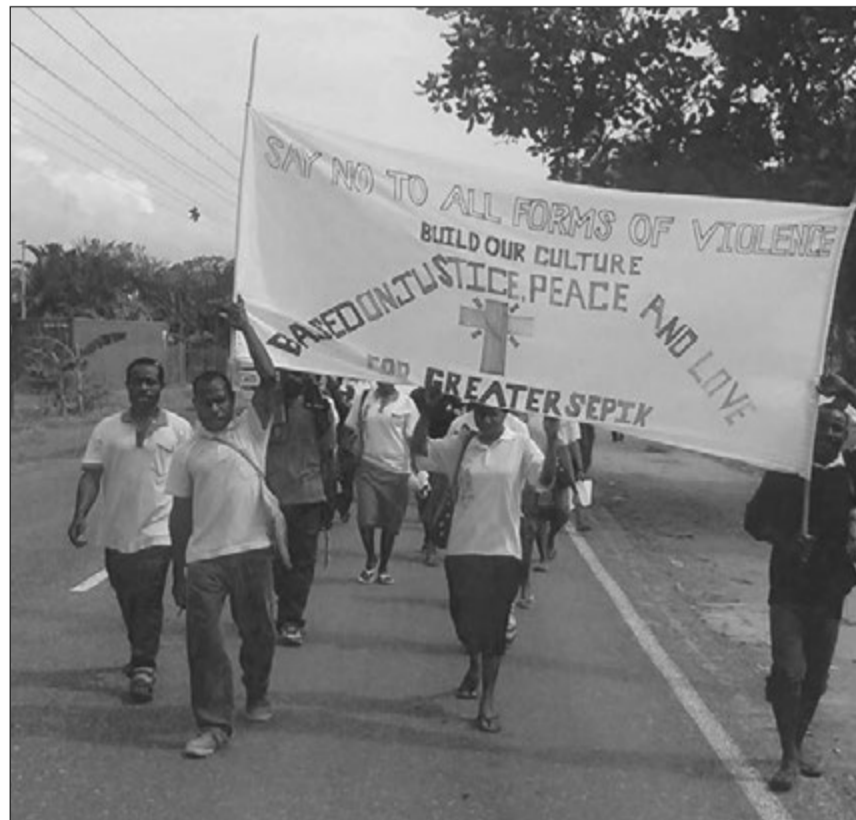
Ol yut i karim laplap ol i raitim tok bilong daunim vailens na wokabaut.