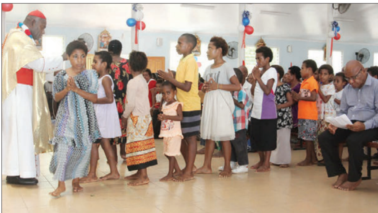
Kardinel John Ribat i blesim ol pikinini long insait long St Martin De Porres haus lotu long Sande.

Dispela peris long Morata i senisim tu sindaun bilong planti manmeri