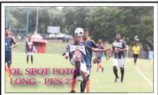
OL SPOT POTO LONG - PES 27