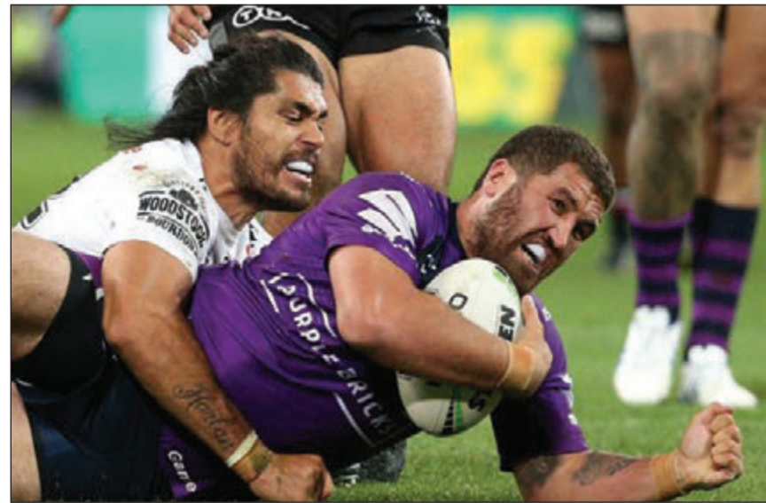
Ol Storms i strong na abrusim ol Warriors long win.

Ol kika bilong Storm olsem Cameron Munstwe, Croft na Cameron Smith i no inap