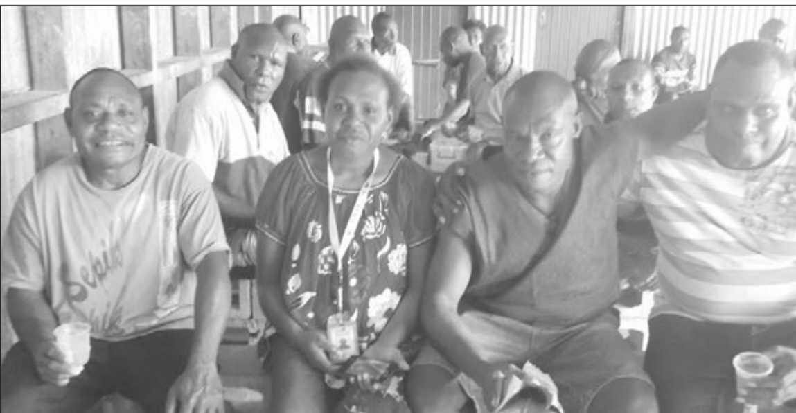
Wanpela meri long yut ministri bilong sios i sindaun wantaim ol kalabus man .