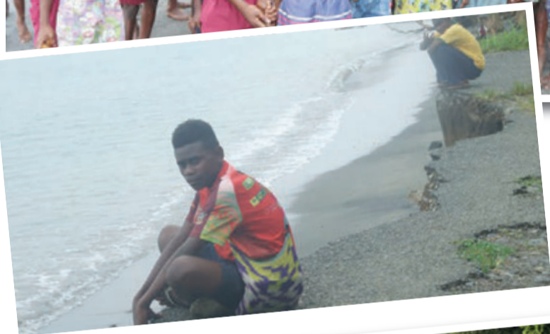
Solwara i bagarapim tru dispela rot long Makasili i go long Galilo na ol arapela viles.