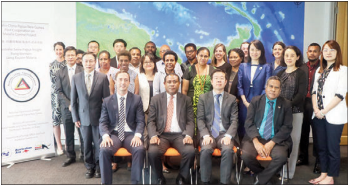
Ol lain i bin stap long miting long Pot Mosbi long 1 Epril.