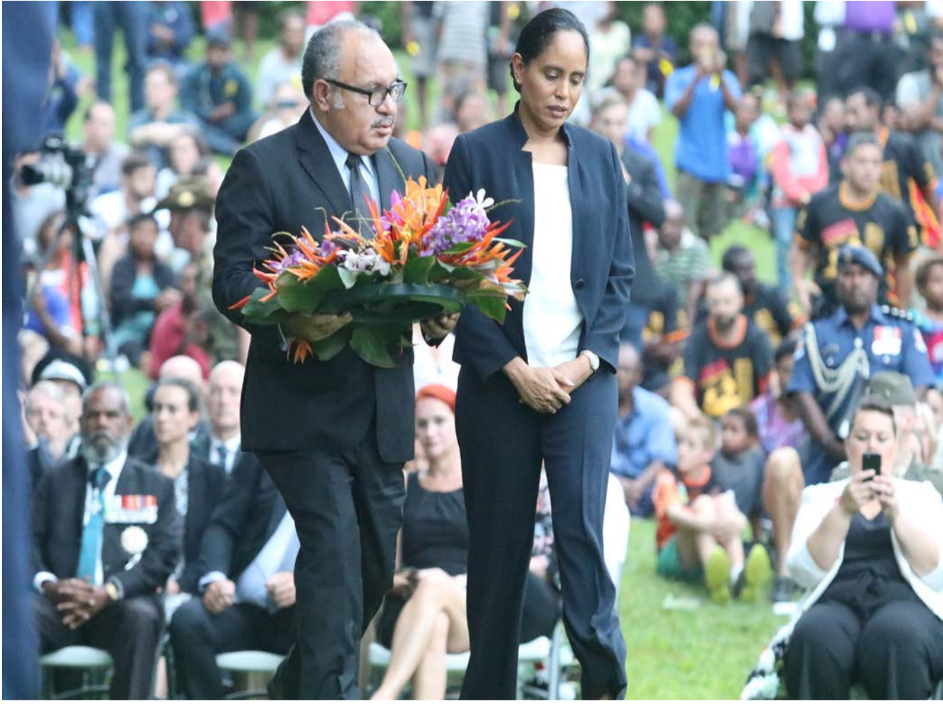
Praim Minister Peter O'Neill wantaim meri bilong em Linda Babao i go putim plawa long Bomana Woa Semetri tingim ANZAC De.