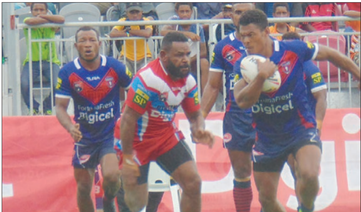
BINTANGOR Goroka Lahanis pait strong long holim taitel bilong ol taim nupela tim Sentral Dabaris i laik rausim dispela taitel long ol.

Tasol Dabaris i bin pilai strong long mekim Lahanis long lusim dispela foapela poin na ol i bin stap 18-14.