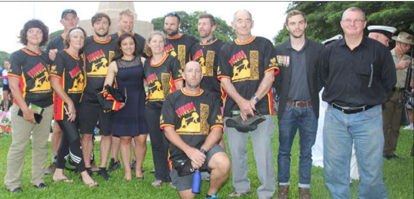
Oi lain bilong Australia husat i wokabaut long Kokoda trek na kamap stret long de bilong ANZAC de long woa matmat.