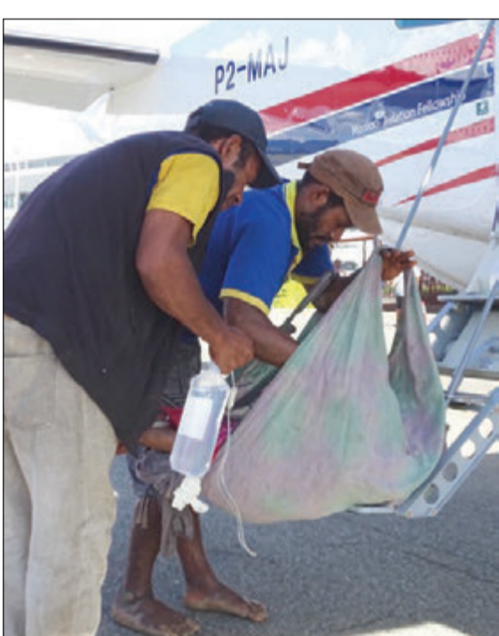
Poto: Go daun long balus long Mt Hagen. (MG)