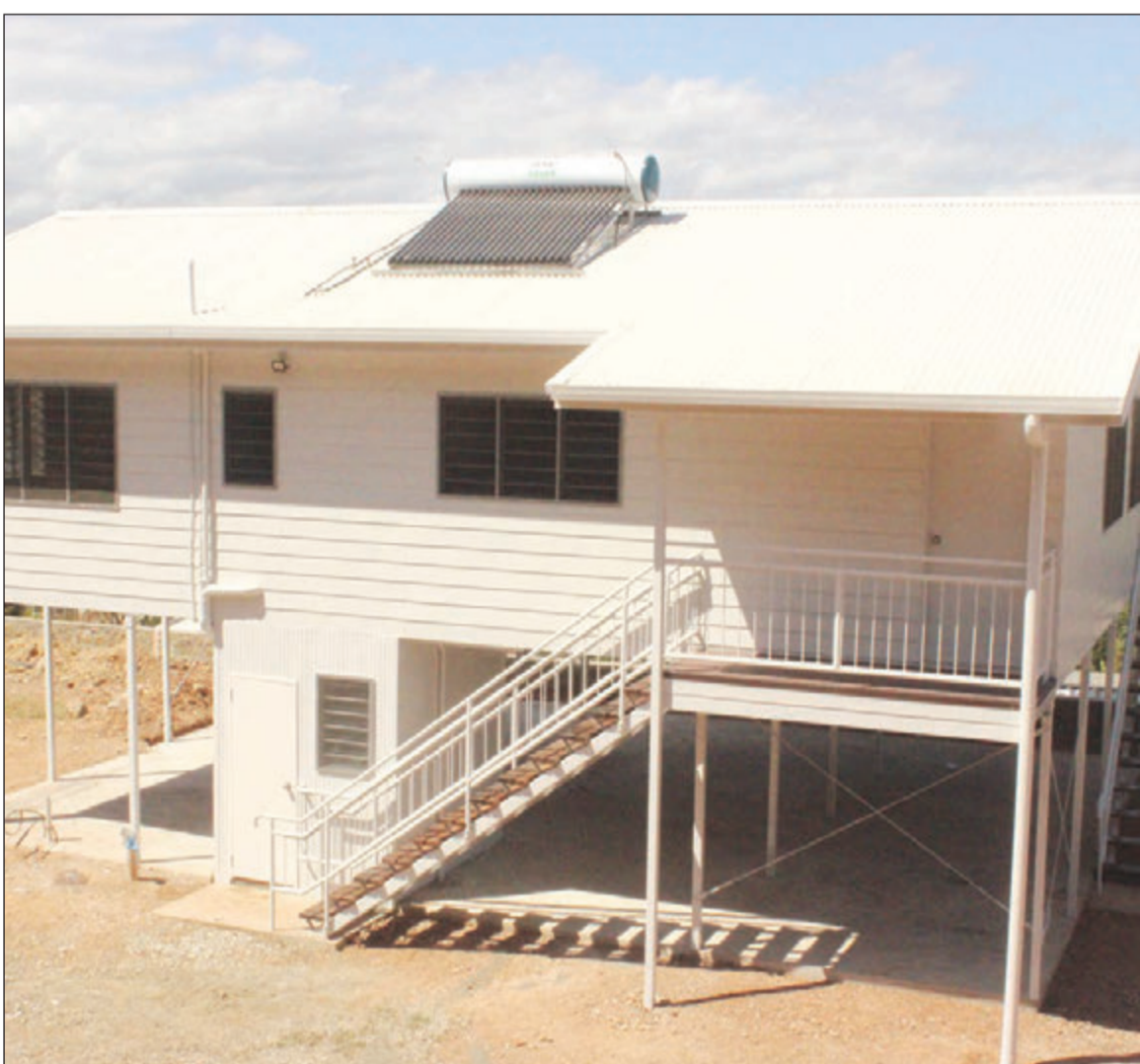
Sas bilong rentim kain gutpela haus i bikpela sas tumas long ol kastoma.

SAS bilong rentim ol haus i dia yet, wanpela ripot i tok.