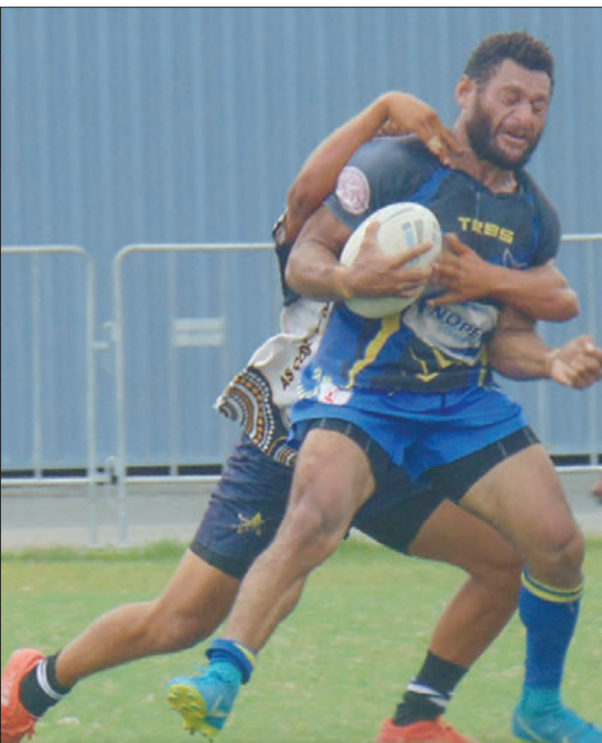
Hohola Flies pilai i bin holim bal strong tasol Butterflies holim lek bilong em na lokim ol wantaim 2-pela poin.