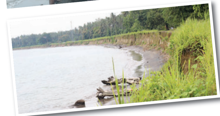
Rot arere long Makasili i bruk i go daun.

PLES Makasili i stap long Hoskins, samting olsem 1 na hap aua ausait long Kimbe taun long Wes Nu Briten provins. Dispela ples i stap arere long nambis na tude ol pipel i pilim bikpela hevi tru long solwara i katim rot bilong ol. Na ol i luksave tu long ol bagarap klaimet senis i ken kamapim.