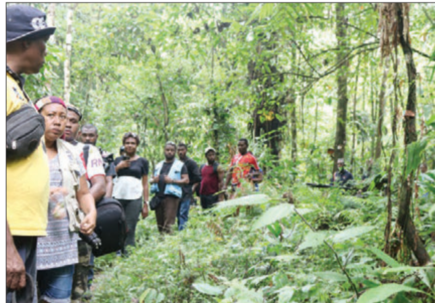
Ol ripota i go lukluk raun long Pokili Wail Laip Menesmen eria. Dispela bus i gat ol wailpaul na ol hot spring i stap long en.

LONG mun Epril, opis bilong Climate Change Development Authority (CCDA) wantaim Yunaitet Nesens Development Program (UNDP) i bin holim wanpela trening woksop bilong ol nius ripota long Kimbe, Wes Nu Briten provins.