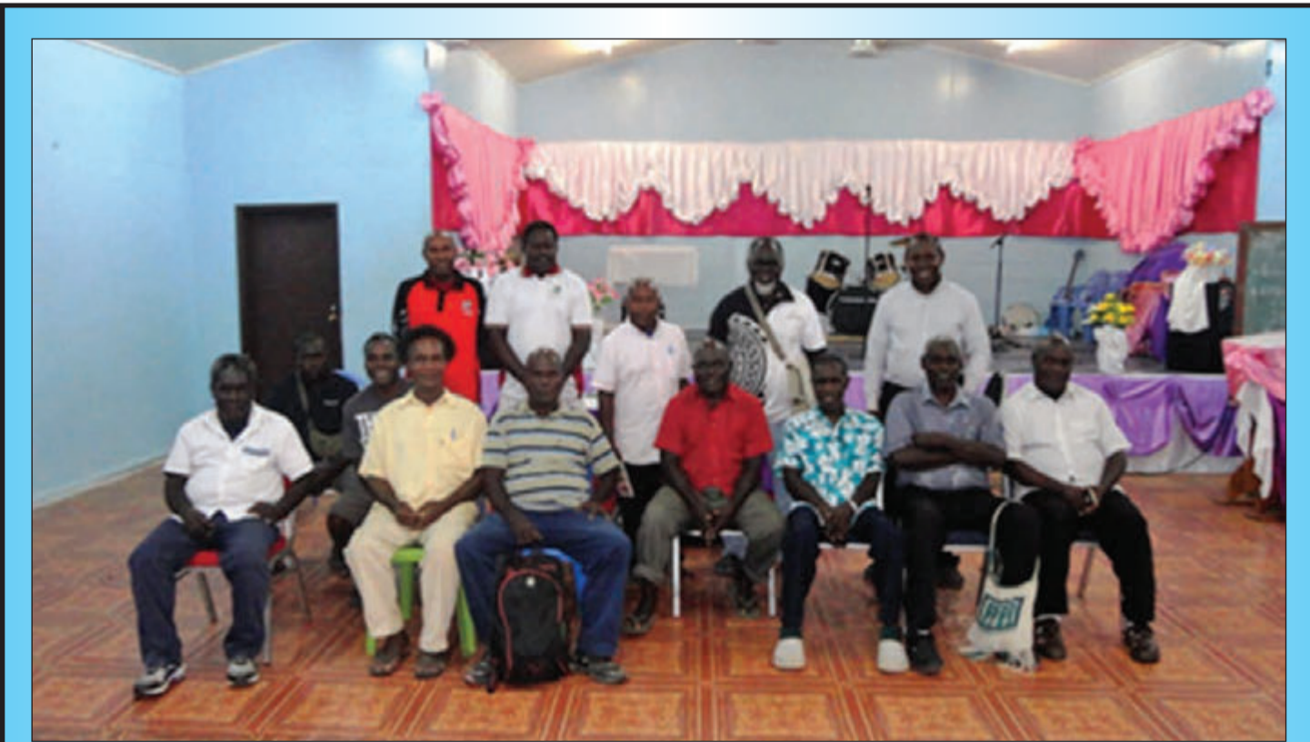
Bogenvil Kristen Sios Asosiesen (BCCA) eksekutiv memba i kisim poto bihain long miting bilong ol long Arawa long las mun.

Yunaitet Stet na ol narapela pren bilong PNG i stap strong long helpim long ikonimik na envairomen developmen we i gat rispek long kantri olsem wanpela independen kantri we i sanap antap long bilip na i save helpim stret ol pipel bilong en.