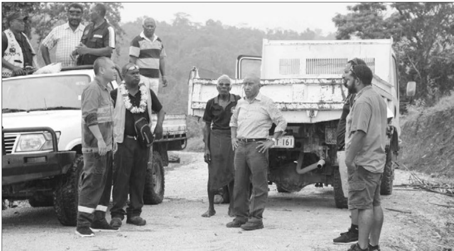
Rot bung long Lavongai, Nu Hanova Unity Rot.

Ol i lusim Nu Hanova na ran long bot bilong gavman, MV Autonomy i go long Mussau long Murat Lokal Level Gavman eria. Ol i kamap long Boliu wof long 6 klok apinun.