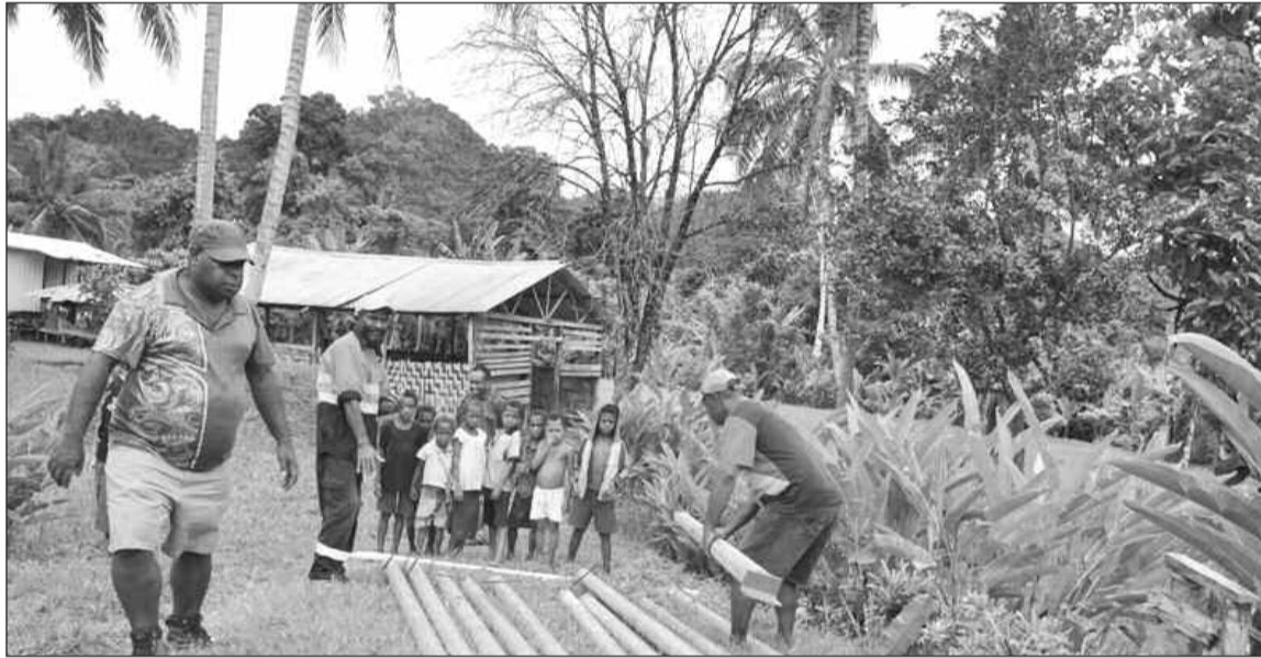
LOA lain bringim pos bilong wokim nupela haus bilong pastor long Ono Nazarin Sios