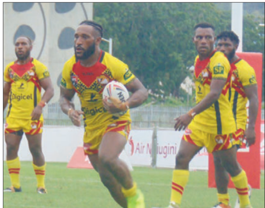
Poto kepsen: NCDC Vipers i bin painim hat long takolim Snax Tigers pilai long namba tu hap bilong raun foa Digicel Kap.