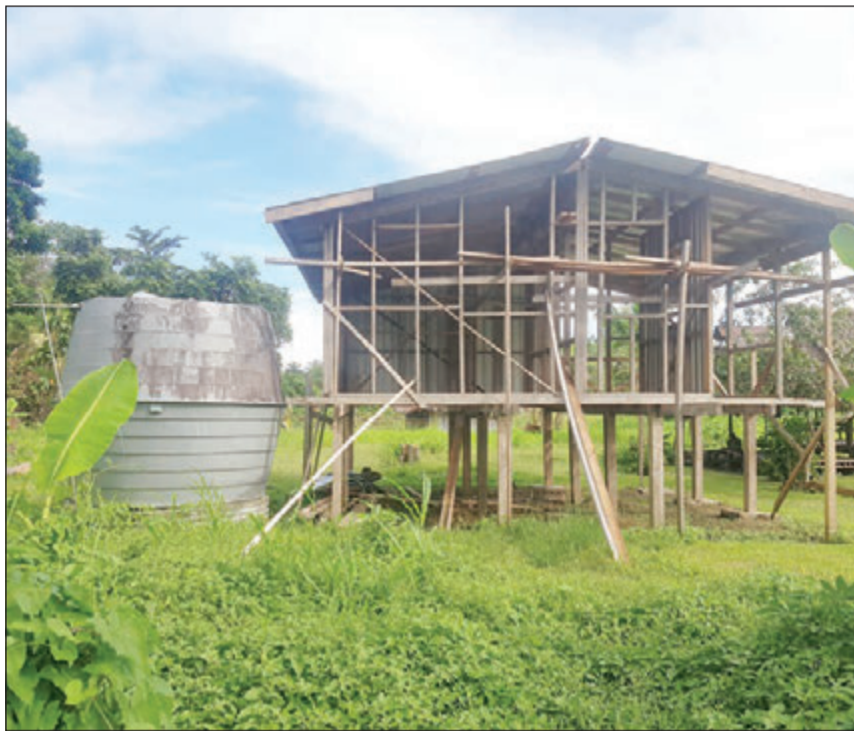
Poto kepsen : Wanpela haus bilong pasto long Apo Viles. Em i nidim moa K5,000 long pinisim gut.

Em i tok ol i nidim samt-ing olsem K5000 moa long baim ol timba, plai-wut na insait banis bilong haus.