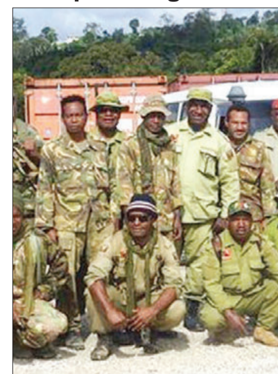
PNGDF go insait long Hela long helpim misineri na ol pablik sevan.