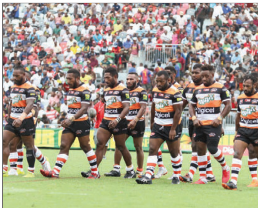
Lae Snax Tigers i redi long kisim malolo. Ol i bagarap stret bikipela siti Pom Vipers 28-4.