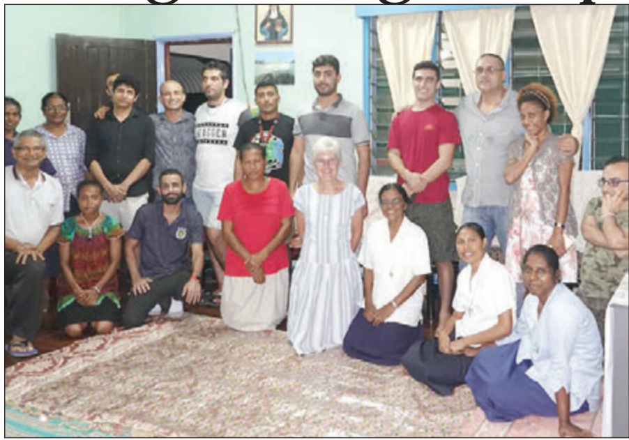
SJC sista i mekim Ista bung wantaim refuji.

hevi wantaim gavman o i sik i save kam na stap long wanpela lodj long Mosbi.