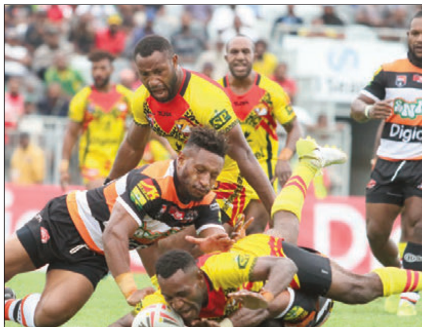
Hap bek bilong Vipers i go daun long trai lain bilong Tigers long putim wanpela trai tasol bilong Vipers.