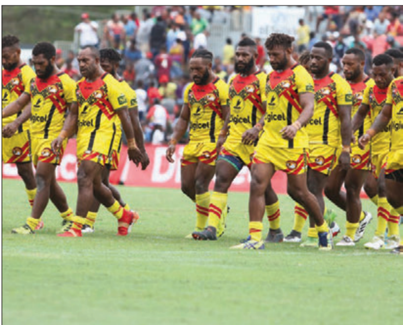
NCDC Pot Mosbi Vipers pilaia i redi long kam kisim malolo bihain long namba wan hap bilong pilai bilong ol.