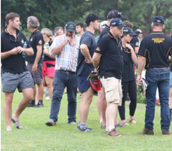
Oi Australia lain i lukluk long nem bilong ol soldia husat i pait long woa.