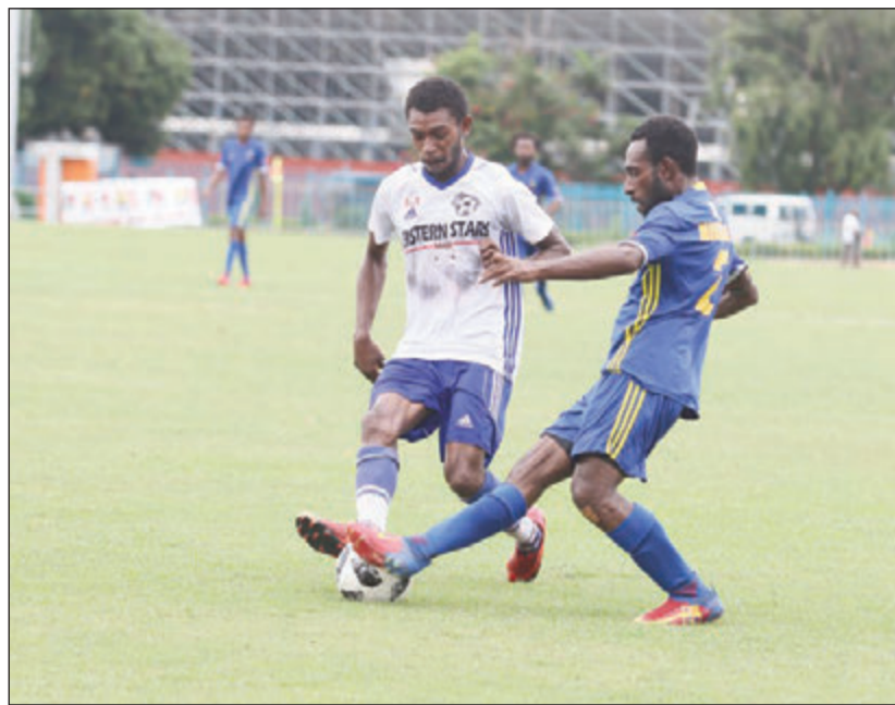
Winga bilong Star Maunten i traim long rausim bal long lek bilong mid-filda bilong Eastern Star.