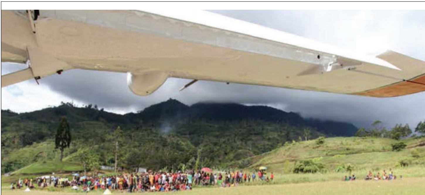
Bikpela lain pipel i wetim balus. (DM)

“Liklik gel ya i go stap long Kudjip Hospital long kisim tritmen long bagarap long bodi bilong em. Mama bilong em i bin boilim