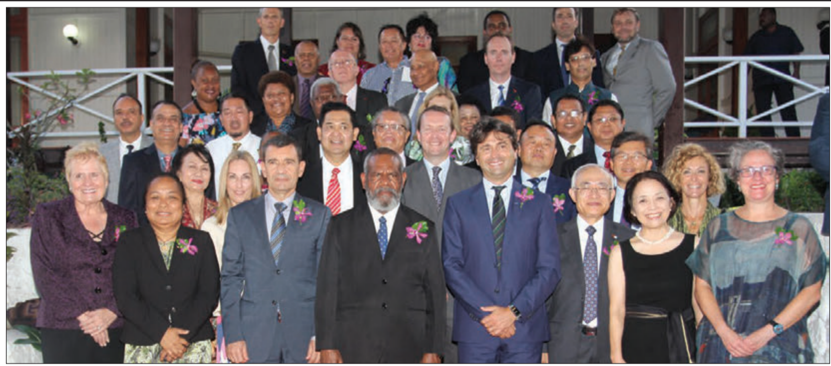
GUTPELA YUMI BUNG: Taim Papua Niugini i kisim Independens em i kamapim poroman wantaim planti arapela kantri long wol. Dispela ol kantri i gat mausman o meri i makim kantri bilong ol na stap long Pot Mosbi. Long wankain taim, PNG i salim ol mausman o meri bilong em i go long dispela ol kantri. Taim mausman o meri ol i kolim hai komisina o embeseda i save kam, namba wan samting ol i mekim em long bungim na salim gritings bilong ol i go long Gavana Jeneral. Long Tunde Gavana Jeneral, Sir Bob Dadae long namba wan taim i holim wanpela bung long amamasim ol hai komisina na embeseda. Poto i soim Sir Bob i kisim piksa wantaim dispela ol lain manmeri.