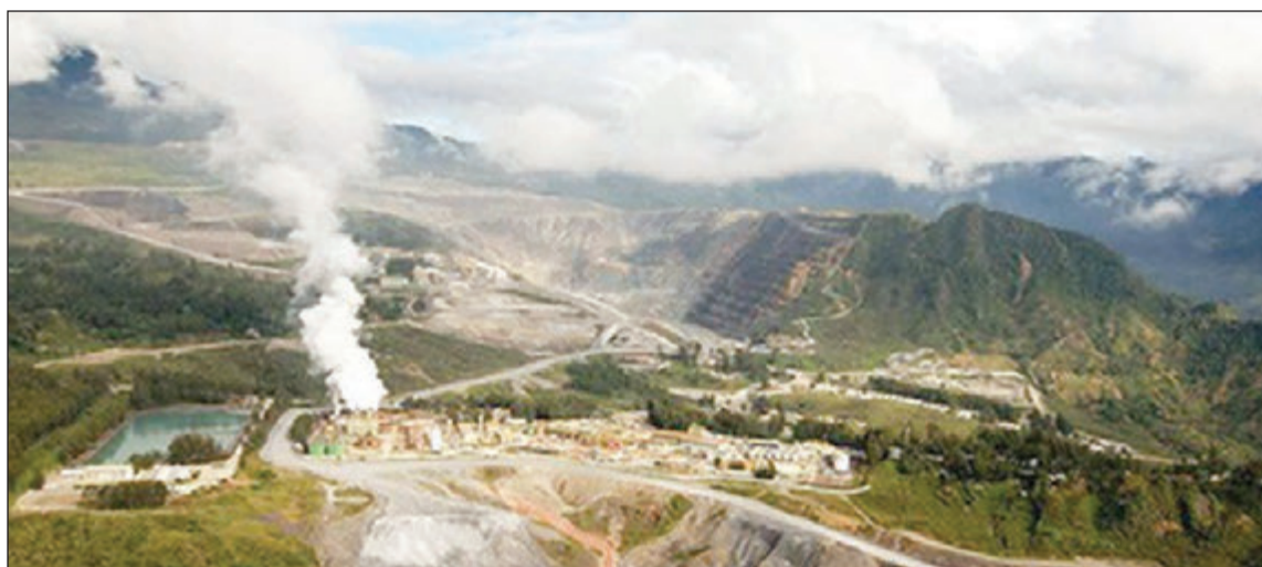
Porgera Main long Enga Provins.

Placer Pacific i kampani i developim main pastaim bipo long Barrick Niugini na Zijin i