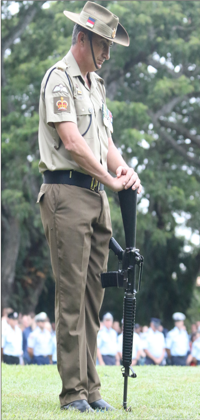
Wanpela bilong ol soldia bilong Australia i sanap wantaim gan i go daun long graun.