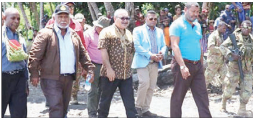
Ol pipel bilong Manam wetim promis bilong O'Neill nau hevi kamap gen.