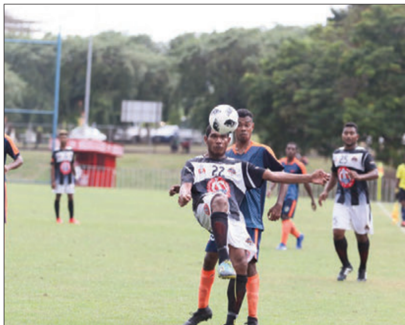
Rait fulbek bilong FC Komara i redi long mekim baisikol kik taim Julai bilong FC Bogenvil i kam long banisim em.