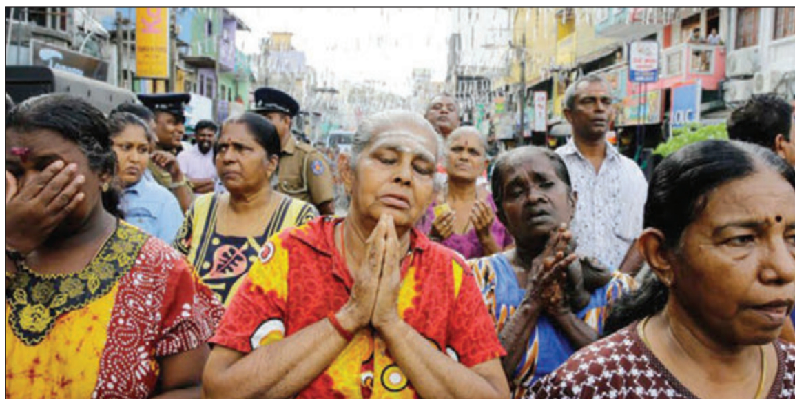
Ol Katolik long Sri Lanka i sanap long rot na pre long taim wanpela sotpela lotu i kamap ausait St Anthony sios we bom i bin pairap long Ista Sande na kilim ol pipel.

kros bilong politiks na slek gavman i mekim na gavman i no bin mekim wanpela samting hariap long taim ol i bin kisim tok save olsem ol teroris bai bomim sampela