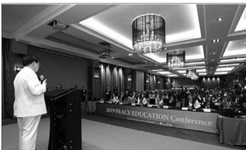
'Bel isi driman' ol sumatin i bin bung wantaim long Bel isi Edukesen Konfrens.

"Dispela em bikpela samting. Tasol dispela em wankain olsem olgeta rot bilong laip i save stat wantaim namba wan stap, long mekim awenes bilong bel isi i mas kamap pastaim long ol arapela bikpela samting. Wantaim dispela edukesen, ol pikinini i mas save gut olsem ol i gat pawa long mekim gutpela pasin antap long level bilong ol. Ol i ken senisim laip bilong ol na bihain taim laip bilong famili bilong ol. Mi traim long mekim ol luksave long i laip na rispekim, helpim arapela, na mekim ol luksave gutpela sumatin olsem tru-