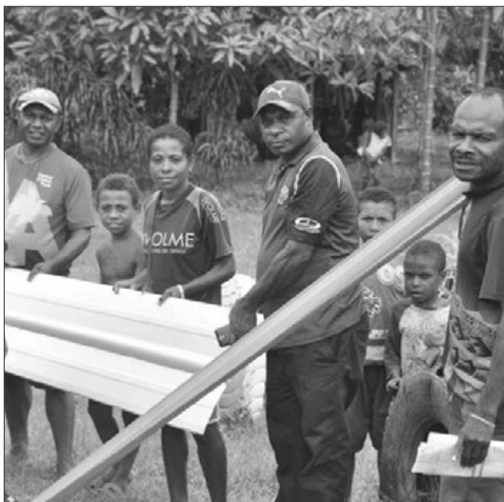
Helpim i go long Naru Luteran Sios