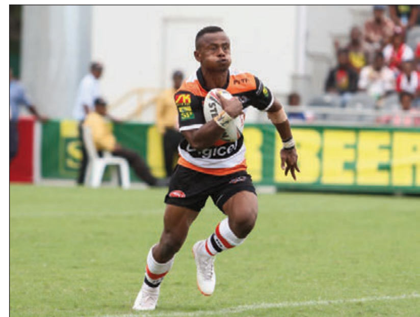
Ful bek bilong Lae Snax Tigers i kisim bikipela win long redi long brukim banis bilong Vipers. Em i mekim planti gutpela pilai na skorim namba wan trai bilong Tigers.