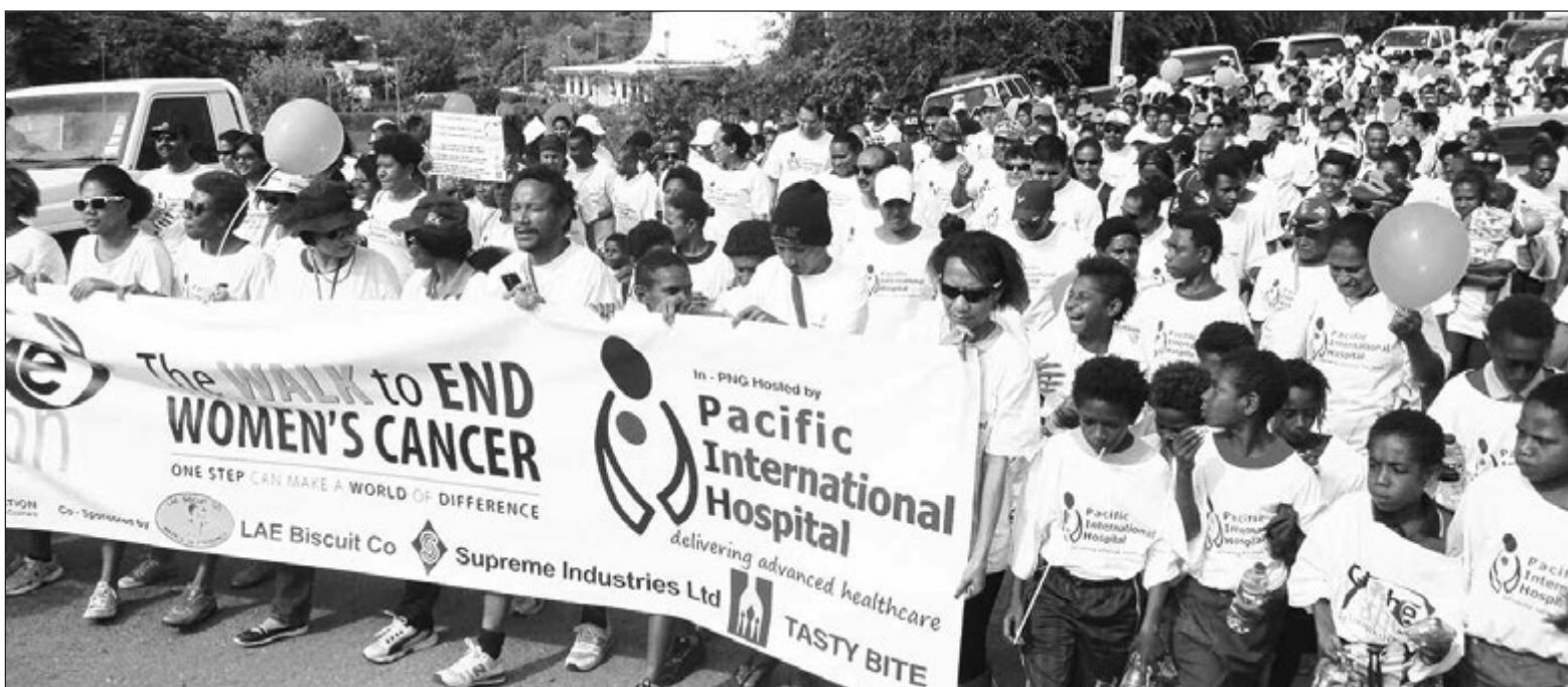
Globeathon wokabaut 2014

globeathon em long tok save long ol bikpela kantri long wol long wok Papua Niugini i mekim na sapos dispela ol kantri i laik helpim, ol i ken givim helpim isi.