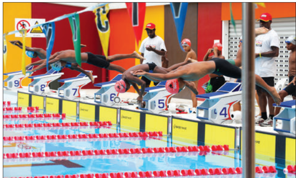
Ol man swim i statim fri stail.