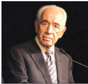
Shimon Peres i toktok long ol memba bilong Foren Pres Asosiesen long taim em i bin lukluk raun long wanpela taun bilong Israel, Sderot, long 2014.

SHIMON Peres, pastaim presiden bilong Isrel na wanpela bilong ol man i kirapim nesen bilong Isrel na banisim kantri long ol birua stap raun long en long Midel Is na man bilong strongim pasin bilong bel isi long Midel Is i dai long dispela wik, na em i gat 93 krismas olgeta.