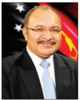
Praim Minista Peter O’Neill

Em i tok gavman i wok long putim moa mani long kirapim ol rot na