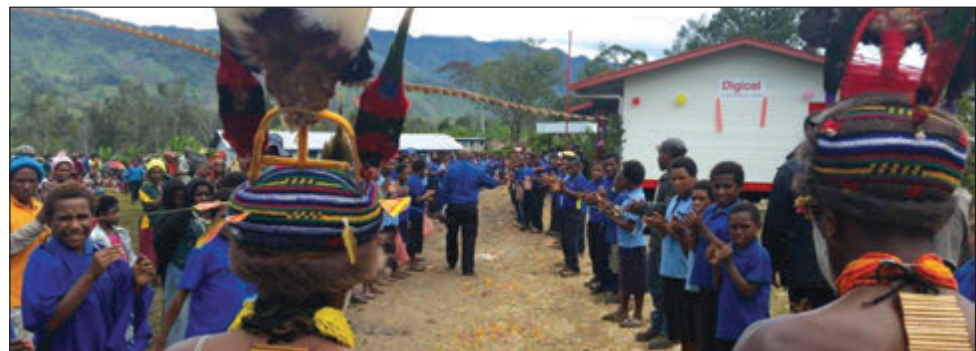
Map praimeri skul sumatin i go pas long ol deliget bilong Digicel i go long nupela dabol klasrum.

tenkyu long Digicel olsem wanpela gutpela piksa koporet sitisen long PNG.