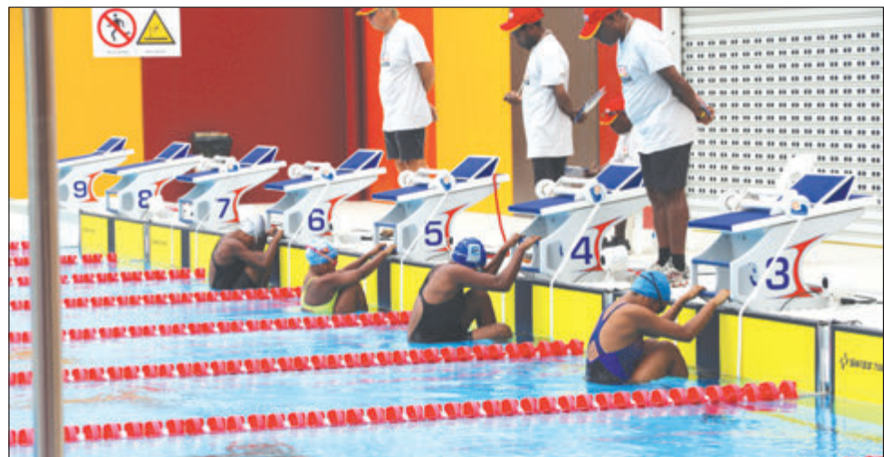
Ol meri redi long mekim bek strok swim.