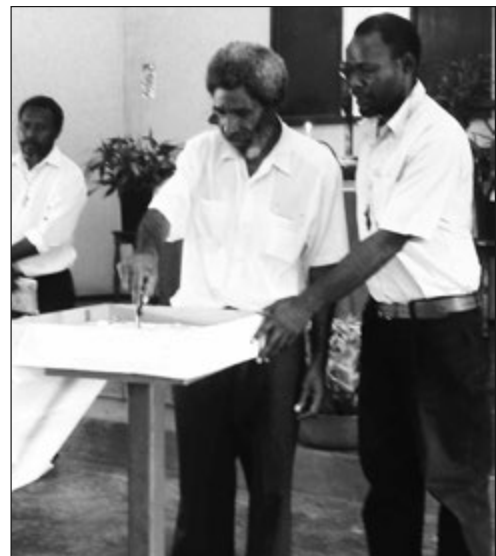
Katim kek long selebretim 18 krismas bilong peris.

go pas long lukautim dispel konpres we i bin lukim moa long 100 deleget long tripela peris long taun olsem Sen Mathew long not