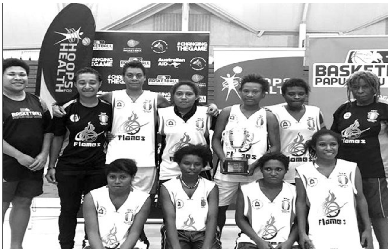
OI meri NCDABA i sanap bung wantaim na i soim tropi bilong ol

OI Daru i kamap namba tri ples long divison bilong ol man bihain long ol i daunim ol Kupiano, 79-67.