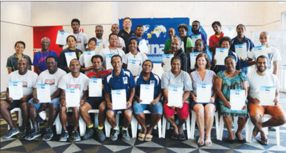
Ol swiming kosa wantaim setifiket bilong ol bihain long wanpela wik skul.