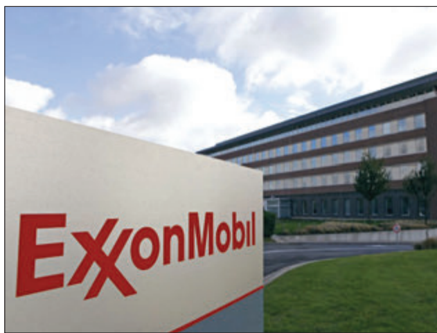
Hetkwata bilong ExxonMobil long Belgium long Yurop.

long ol nupela LNG projek na arapela ol LNG projek long Canada na Nigeria i helpim ExxonMobil long balensim mani winmani taim prais bilong oil n ages i pundaun.