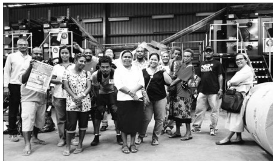
Sios Midia grup long woksop i raun i go long Post Courier long lukim rot we niuspepa i wok long en.

Olsem na yumi mas sindaun na harim tok olsem Maria, na bihain yumi kirap na mekim wok olsem Martha. Dispela tupela pasin bai strongim laip bilong yumi na bai bringim amamas long laip na wok bilong yumi.