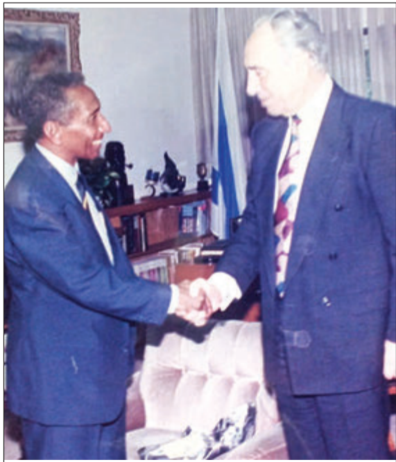
Presiden Shimon Peres i sekhan wantaim Sir Julius Chan long Tel Aviv, long 1993.

Long yia 1993, Sir Julius olsem Fainens Minista bilong PNG Gavman i