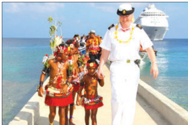
Ol turis i kam long bikpela krus sip long Alotau, Milen Be Provins

Is Nu Briten, Nu Ailan na Maun Hagen. Bai yumi kamapim strongpela patnasip wantaim ol opreta bilong hotel, ges haus, tua kampani, na arapela ol man-