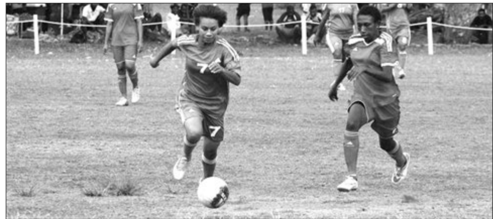
SOKA salens bilong Nesenel Kapitel Distrik Pablik Sevent Soka Asosiesen (NCDPSSA) i go het long Bomana.

OI i bin kliaim tupela bikpela hap bilong pilai taim ol gem i kamap gut long ol tripela wik i go, we klostu long 30 tim aninit long 6-pela divisen, 'A' lig bilong Man na Meri, 'B' lig bilong Man na Meri na Anda 19, i inapim tupela pilai hap.