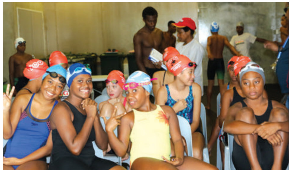
Ol liklik swima bilong Boroko Swimming klab na Lae summing klab i redi long go insait long pul.