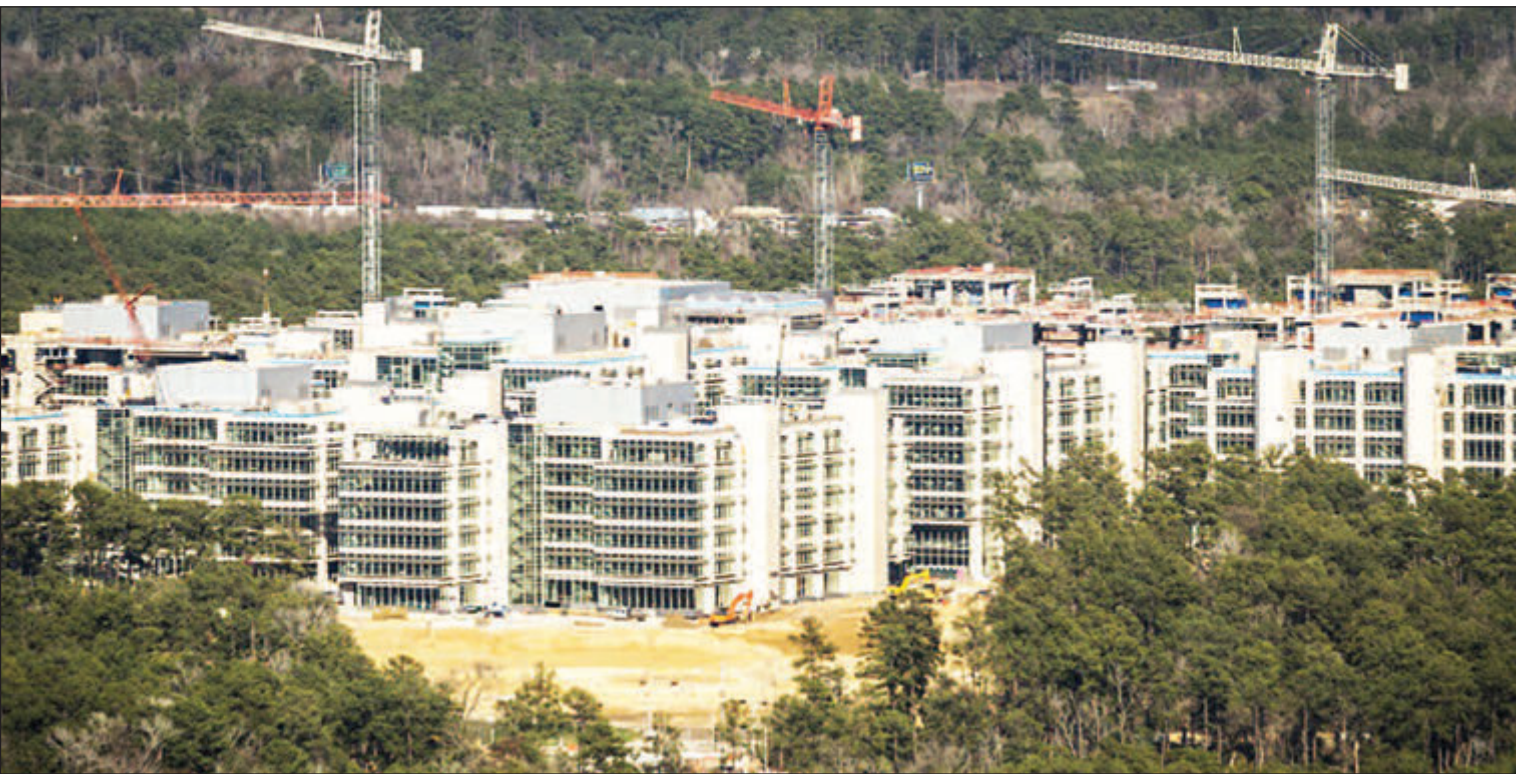
Nupela hetopis na kempas bilong ExxonMobil Corp long Woodlands, Texas, Amerika.

WANPELA gavman ejensi i wok long mekim ol wok painimaut long sekim sapos ExxonMobil Corp i bihainim ol lo bilong kamapim kompetisen o resis long baim InterOil Corp.