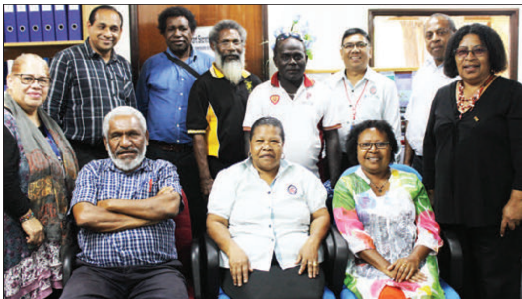
Ol prinsipel bilong 11-pela Teknikal Koles na Polyteknik institut wantaim DoE wanwok.

Plantu sumatin husat i save lusim gret 8, 10, 12 na bikos i no gat inap spes long ol bikpela institusen ol bai stap nating. . TVET sekta bai bungim hevi bi-