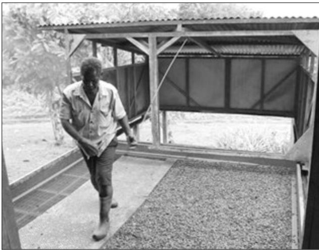
PNG kakao ol i mekim soklet long en.

Em i tok kakao festival we ol i bin holim long Arawa na Buin, i bin soim aut long ol intanesenel spklet ol kain