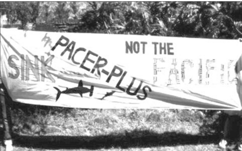
Toktok agensim Pacerplus wok trade.