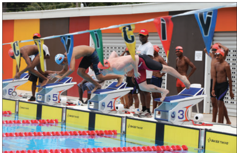
Ol man swima i statim fri stail.