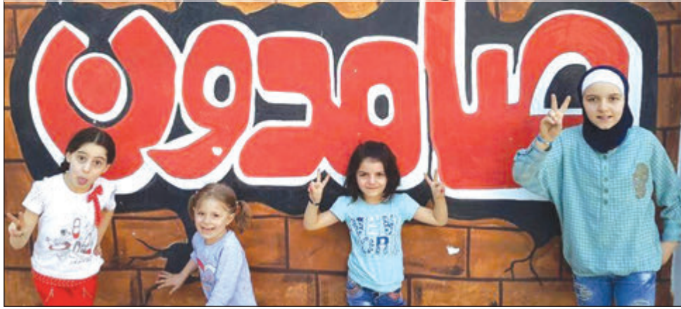
Ol skul pikinini long Aleppo i sanap aninit long sain i tok 'sanap yet.'