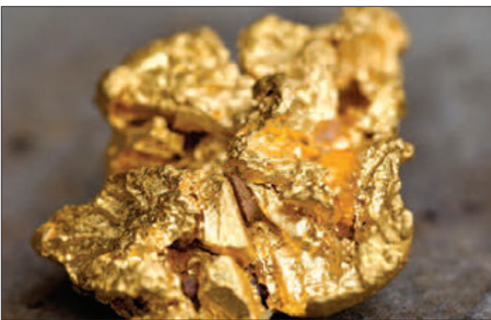
Mt Kare Gold Consultants laik baim aluvial gol long Porgera.

“Dispela kain pasin i ken bagarapim nem bilong kantri bilong yumi. Yumi mas wokbung wantaim long larim planti turis i kam insait long kantri,” Mista O’Neill i tok.