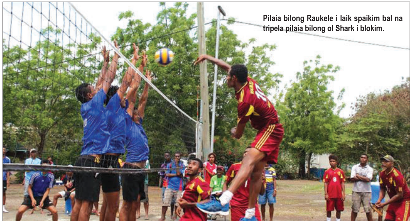
Pilaia bilong Raukele i laik spaikim bal na tripela pilaia bilong ol Shark i blokim.

Dispela win i skruim ol Raukele i go insait long ol semi fainal bilong A gret na ol Shark i go aut long top foa fainal bilong Fairfax sisen.