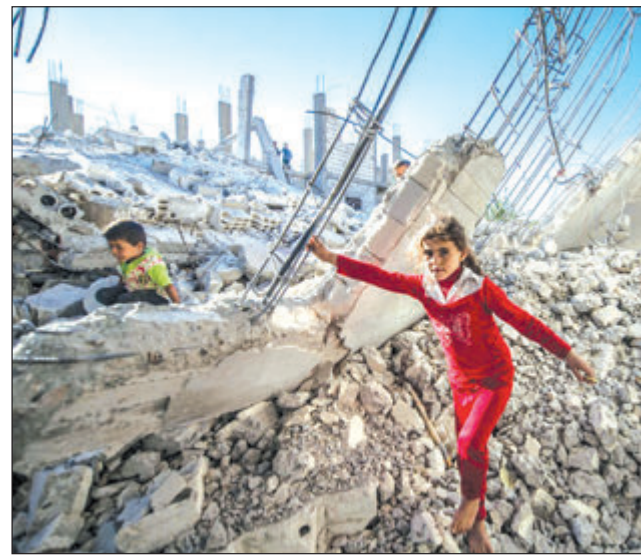
Ol pikinini sanap namel long ol haus bom i bagarapim long Jarabulus distrik, Aleppo.

GAVMAN bilong Syria wantaim pren bilong en Rasia i wok long bomim gen Aleppo long Sande, tasol ol skul pikinini long Isten distrik i statim nupela skul yia long Sande.