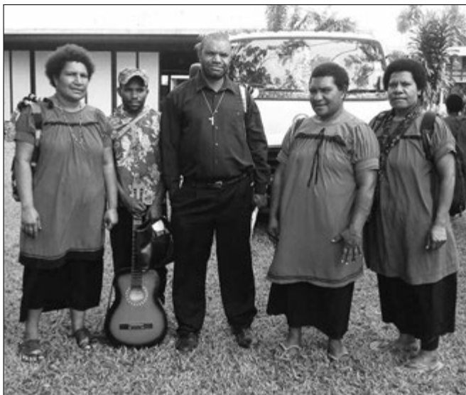
Ol mama na pasto i redi long go insait long lotu na selebren.

Seket tu i bin holim namba tu konpres bilong ol long tripela de long Nesanel Spots institute hap.