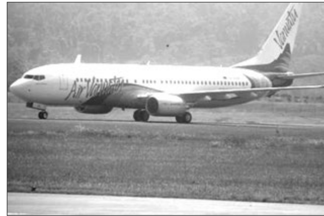
Balus bilong Air Vanuatu.

Ol bai toktok long sait bilong ea na solwara transpot namel long Vanuatu na Nu