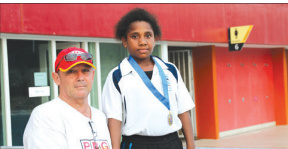
Tonie Akunai i kisim medol bilong em. Stonie i kamapim gutpela timing bilong em.