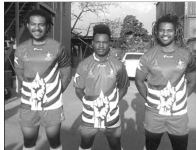
Em ol memba bilong Wes Papua Warriors Ragbi tim.

Win bilong ol tu i bin kamap long wan kain taim we 6-pela lida bilong Pasifik, em Solomon Ailan na Vanuatu i bin go pas long en long