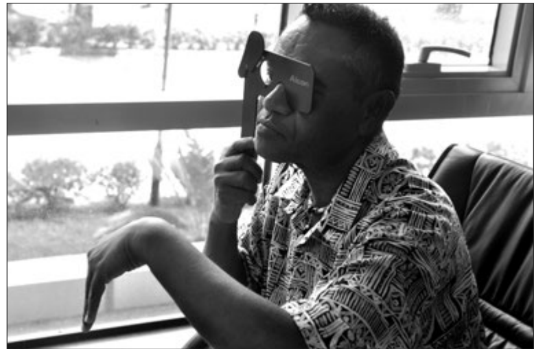
Onie Toluvaaba i traime skelim ai bilong em stap.