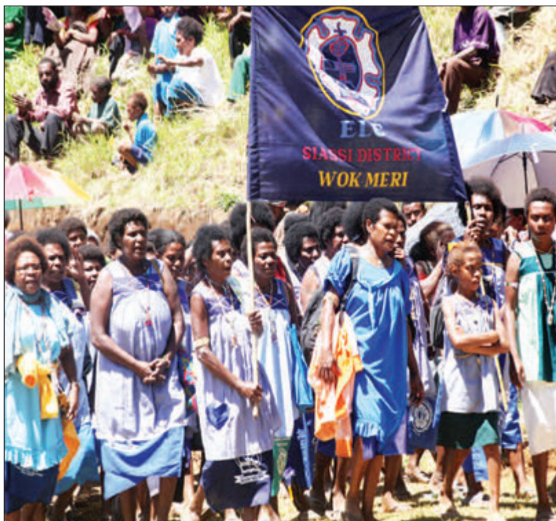
Ol Siassi meri husat bai kisim konprens long 2018.

Em i tok long dispela Konprens namba 15, em i lukim Manus Provins i kamap