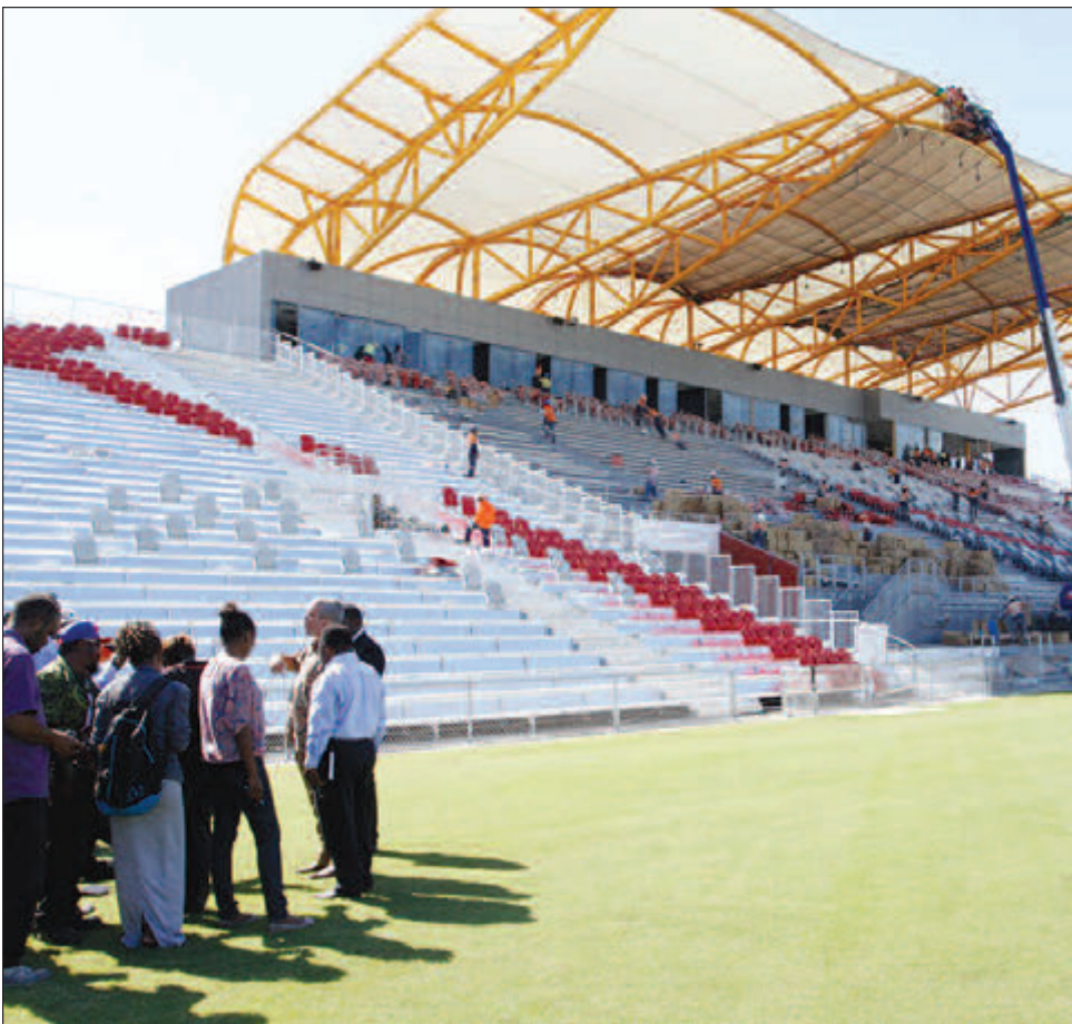
BAI REDI NAU: Minista bilong Spot na Turis i tokaut long ol nius manmeri olsem Ragbi stedium bai redi long pinis bilong Febuari.