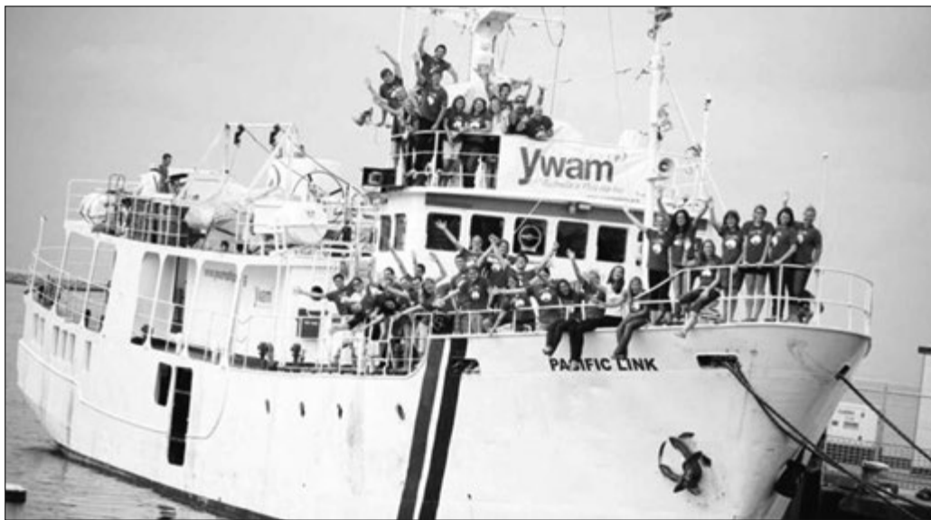
YWAM Misin Medikal Sip Medikal Sip MV Pacific Link kam bek gen long PNG na statim nupela wok long Madang.

TMV Pasifik Link em i bin namba wan sip bilong YWAM Medikal Sip, na em i bin stat wok long Galp na Westen Provins pastaim long ol i pinisim wok bilong em long 2014 na long 2015 nupela sip MV YWMA PNG i kisim ples bilong en long helpim ol pipel long ol-