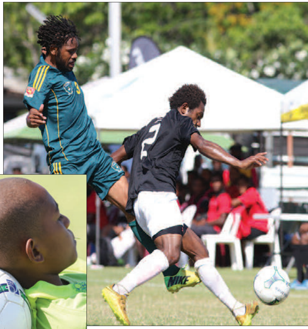
KAM KISIM MI: Midfilda bilong Rapatona i autim bal taim straika bilong Erema i kam klostu. Rapatona i win 3-1