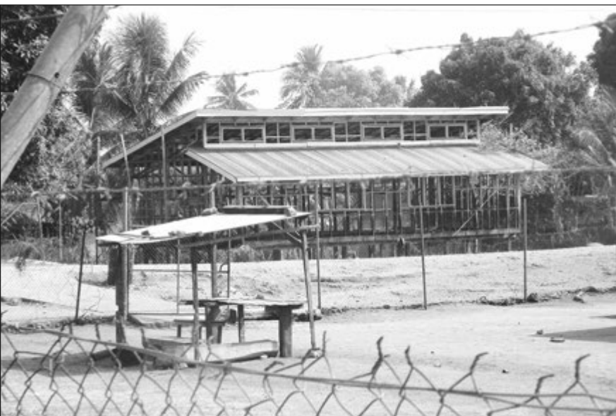
Wasu LLG Maket stap nating wantaim bun bilong haus i sanap das karamapim.

President Yasing i laikim Wasu mas bruk lusim Tewai Siassi distrik na go bung wantaim Kabwum distrik olsem wanpela LLG bilong ol.