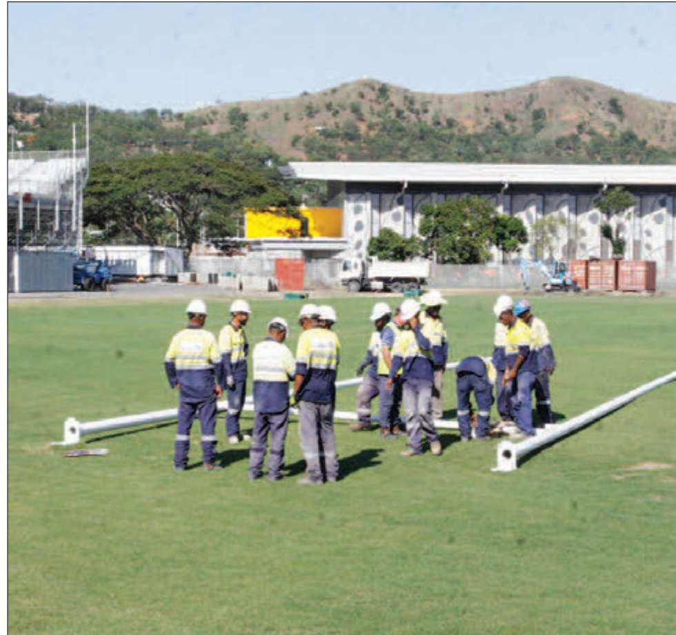
SANAP NAU: Ol wok man bilong nupela ragbi stedium i rdi long go sanapim gol pos bilong ragbi.