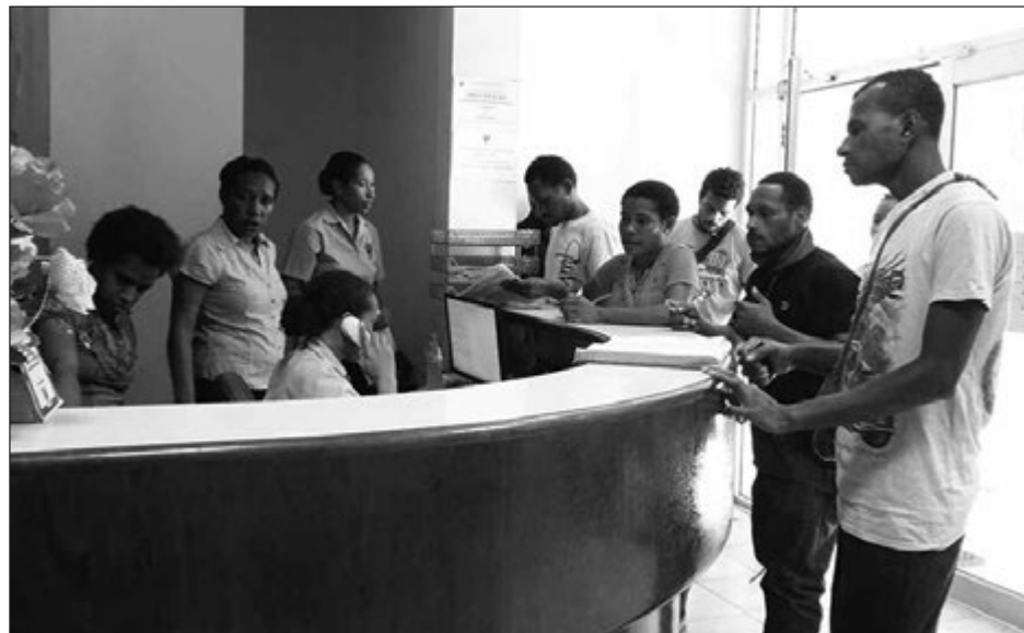
Ol sumatin i rejista long ITI long Badili insait long Pot Mosbi.