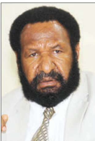
Oposisen lida, Don Polye

Em i tok i gat nid i stap long fandim ol narapela spot long kamapim ol nupela gutpela