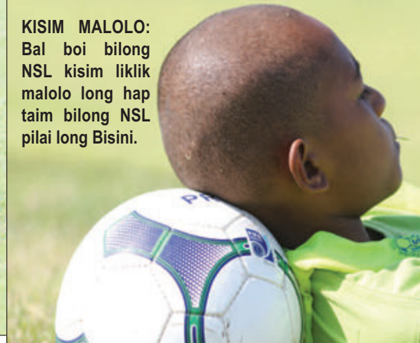
KISIM MALOLO: Bal boi bilong NSL kisim liklik malolo long hap taim bilong NSL pilai long Bisini.