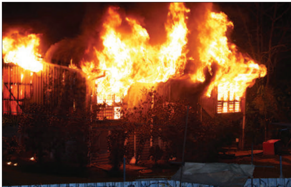
Haus i paia long Gerehu Stage 3 insait long Pot Moresby.