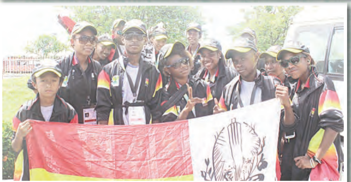
MADANG: Ol yangpela memba bilong tim Madang.