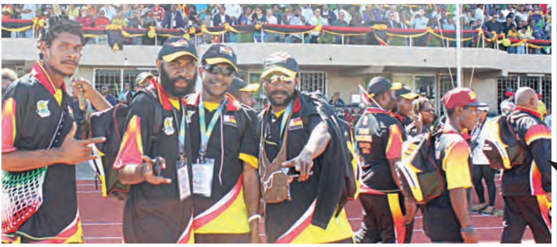
MADANG: Ol soka boi bilong tim Madang.