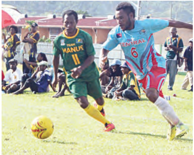
Manus Vs Sentral.

TOKSAVE: Salim ol spots dro bilong yu kam long Feks; 325 2579, e-mel; bveo@wantok.com.pg o kam lusim long Wantok Niuspepa opis long Able Building Complex long Central Waigani, NCD.