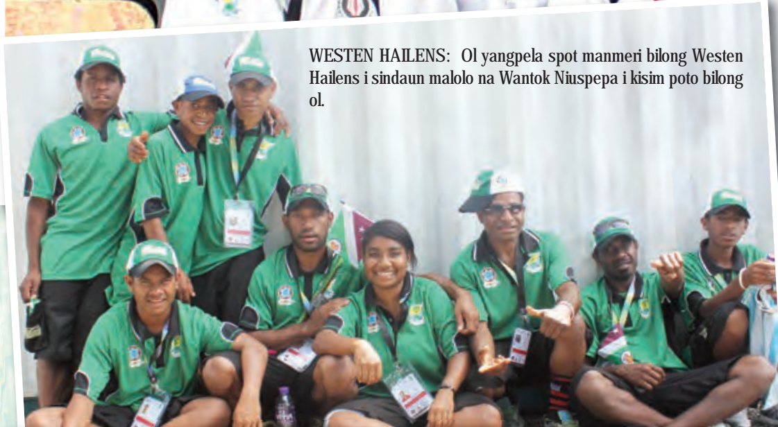
WESTEN HAILENS: Ol yangpela spot manmeri bilong Westen Hailens i sindaun malolo na Wantok Niuspepa i kisim poto bilong ol.