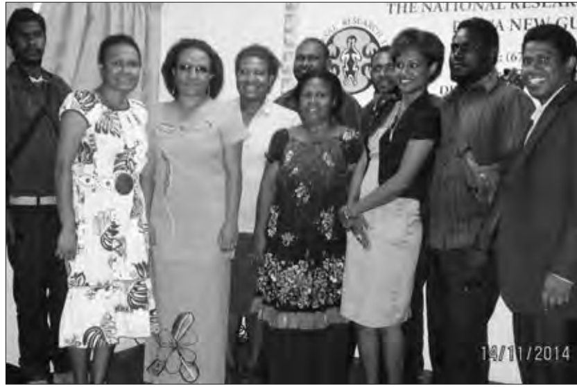
NRI KOS MIDIA GREDUET: Dispela em sampela long ol nius manmeri long Mosbi i bin greduet long Ikonmik Analisis Polisi kos.

Dispela kos i bilong helpim ol manmeri i kliia long ol polisi o rul o lo long givim stia na long dispela kos, ol lain i bin lainim ol samting long ikonmik polisi eria na ol i ken