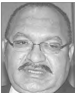
Praim Minista, Peter O' Neill

Praim Minista, Peter O' Neill, i amamas na tok tenkyu long ol i kamapim dispela ripot we bai strongim wok bisnis long PNG wantaim ol investa.