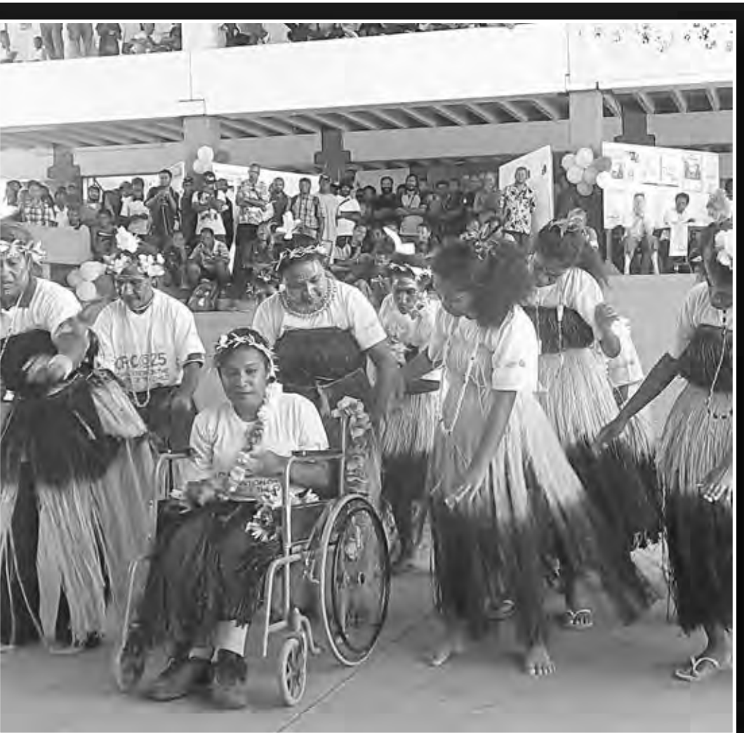
LUKSAVE LONG DE BILONG OL PIKININI: Ol Chesire Homs lain i danis na wokabaut i go wantaim sampela disebol pikinini long opim selebrensen.

Long ol pipel i kisim Australia Award long 2015, moa long 50 pesen em ol meri.