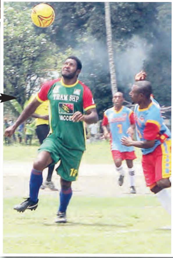
Sauten Hailens Vs Sandaun.