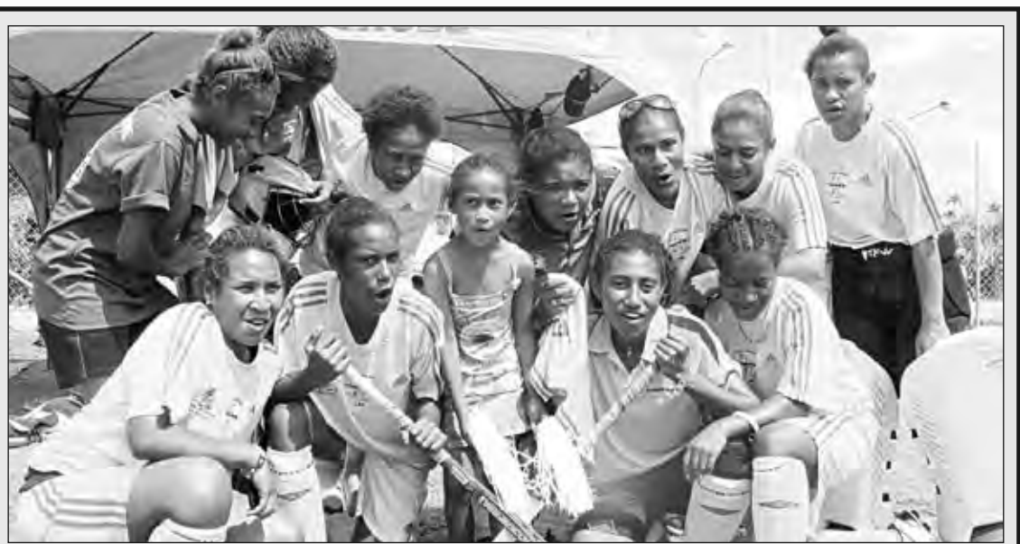
ASA SUMBA! Ol meri Morobe, bipo long ol i go salensim ol Manus long hoki gren fainel.

Em i tok ol bai karim dispela tonamen i go long ol arapela rijon bilong Papua Niugini long klostu taim.