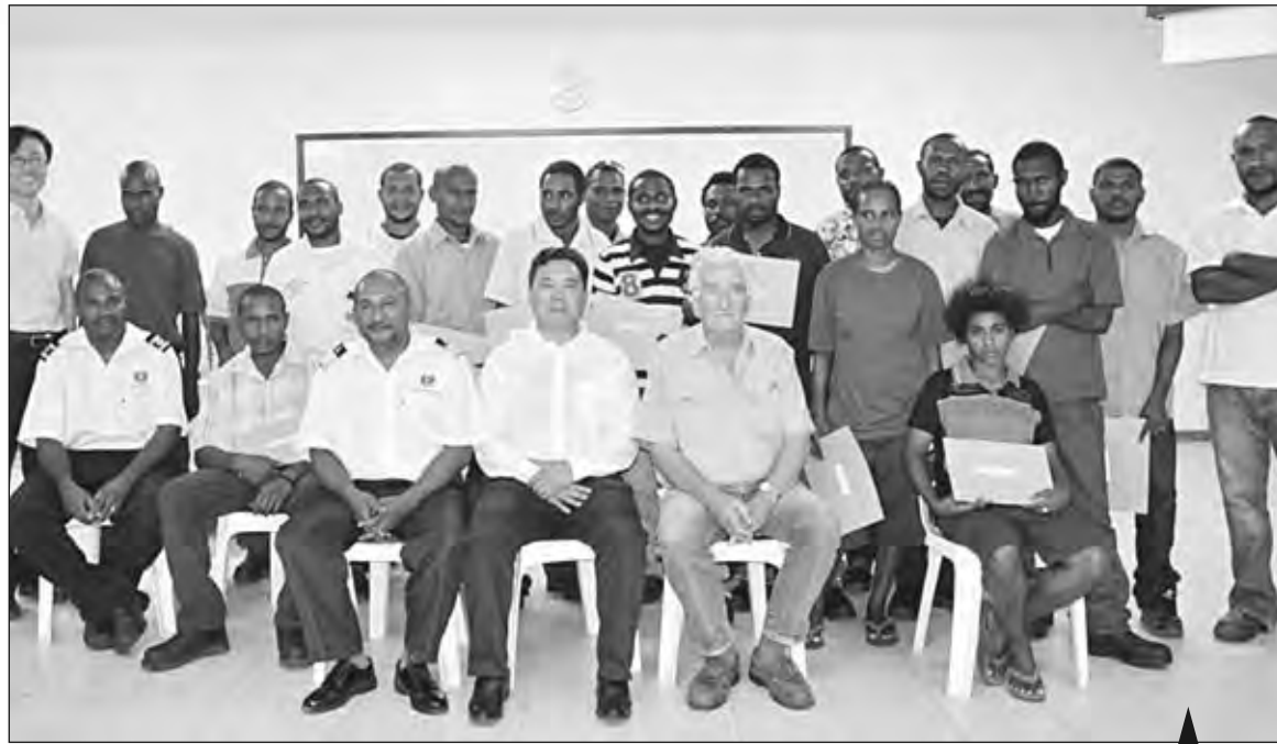
Grup poto bilong ol lain yangpela lain bilong Ramu Projek papagraun husat i stap 5-pela wik pri-vokesinol trening long PNG Maritaim Koles