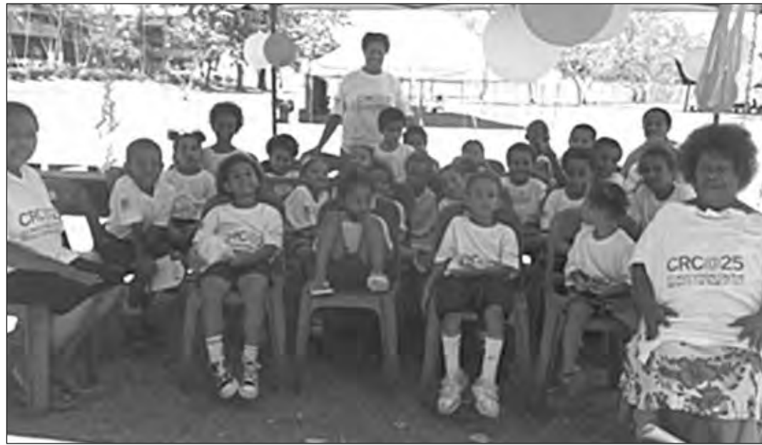
Ol Yunivesiti Pri skul sumatin bilong i kam stap insait long amamas long de bilong ol pikinini.