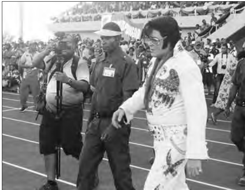
ELVIS PRESLEY: Wanpela man husat i ekt olsem Rock and Roll supa sta bilong bipo, Elvis Presley, i bin raun long 2014 PNG Gems.