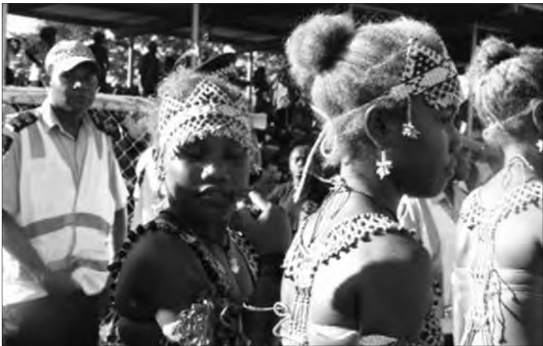
Ol pikinini meri Malaita long Solomon Ailan i soim amamas olsem wanpela meri i win long nesanel ileksen.