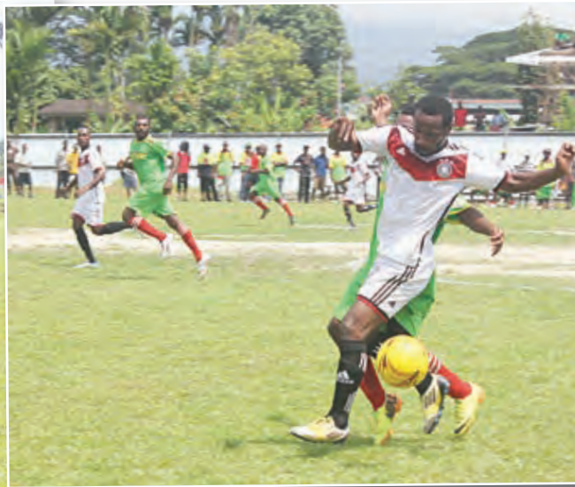
SEPIK NA ORO: Wampela pilaia bilong Oro (wait) i pulim bal na pilaia bilong Is Sepik i traim long kisim bal long em.