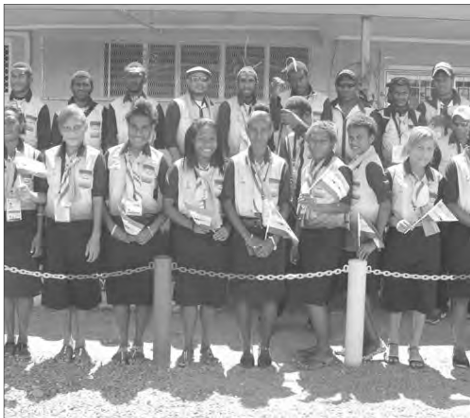
Ol yangpela spot manmeri bilong tim Morobe.

Ol i tok ol i les long daunim nem bilong Morobe long ai bilong ol famili bilong ol, na ol bai soim stret trupela kala bilong Morobe spot.