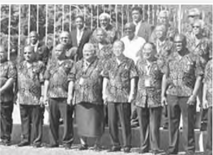
Ol Pasifik lida wantaim Jenerel Seketeri bilong Yunaitet Nesens, Ban-Ki-Moon.