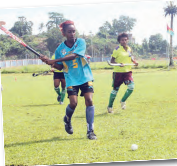
PAITIM BAL: Yangpela meri bilong Wes Nu Briten i laik paitim hoki bal.