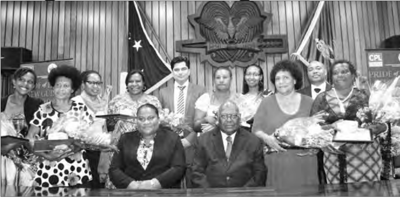
CPL Praid ov PNG Awod. Gavana Jeneral, Gren Sif, Sir Michael Ogio na Ledi Esmie Ogio i sindaun long fran na kisim poto wantaim ol 6-pela wina bilong ol awod na ol jas bilong ol long Stet Fangsen Rum las wik.

GREN Sif na Gavana Jeneral bilong Papua Niugini, Sir Michael Ogio, i amamas na tok tenkyu long 6-pela meri nating husat i go pas long helpim na givim sevis I go long ol man na meri insait long wan wan komyuniti bilong dispela kantri.