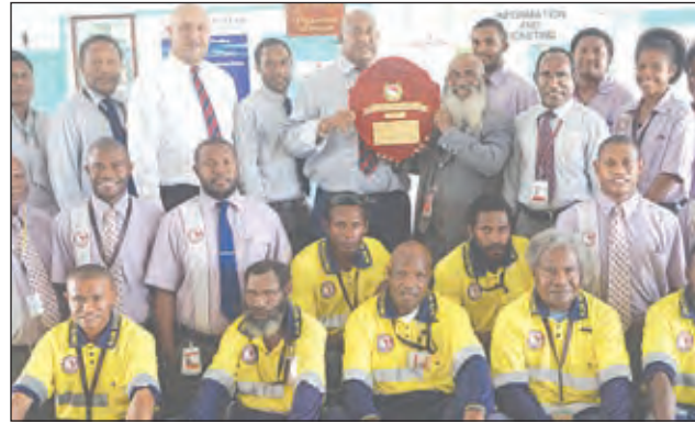
MIPELA KAM GUT YA! Ol woklain bilong Madang Air Niugini i mekim gut na winim sil long namba tri kwata long dispela yia long mekim gut wantaim rekot long ol ran bilong balus i bihainim taim stret bilong ol.