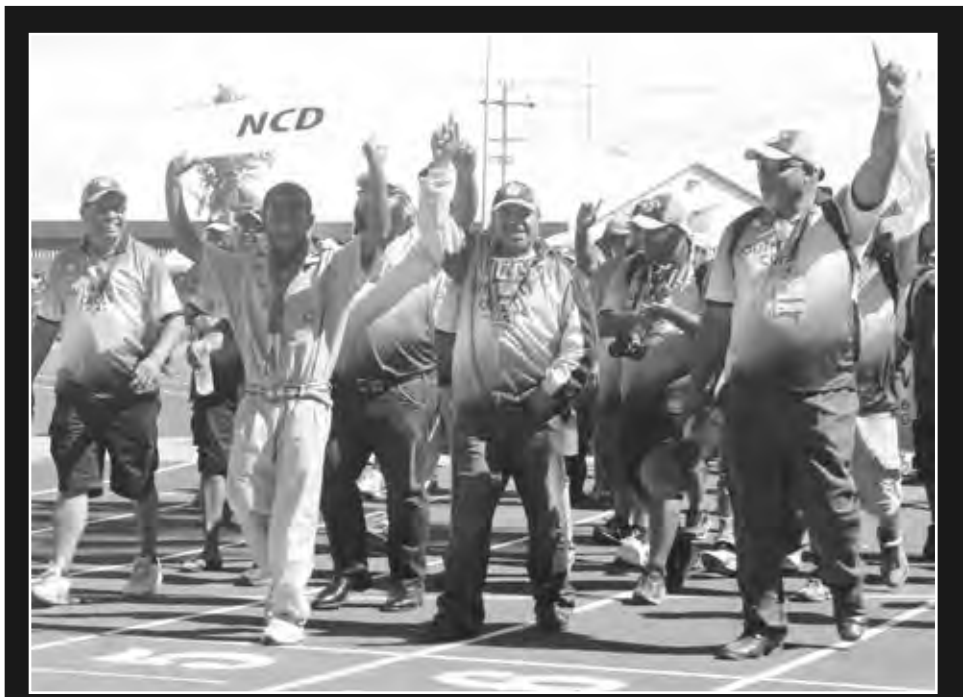
LIDA BILONG NCD: Gavana bilong NCD, Powes Parkop i bin go pas long wokabout wantaim ol memba bilong tim NCD long seremoni bilong opim PNG Gems.

Ol pikinini bilong Hela i amamas long harim mining bilong Tura osem em i wanpela pren na ol i kolim em long tok ples bilong ol "Neneka" minim pren.