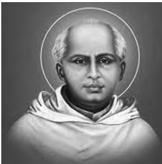
TUPELA NUPELA SANTU: Santu Kuriakose Elias Chavara na Santu Euphrasia Elavathingal Evuprasiamma.

Em bin gat bikipela laik long kamap pater na peris pris bilong Sen Joseph i bin skulim em. Taim em i gat 18 krismas, em bin go skul seminari na long 1829, em bin kamap pater.