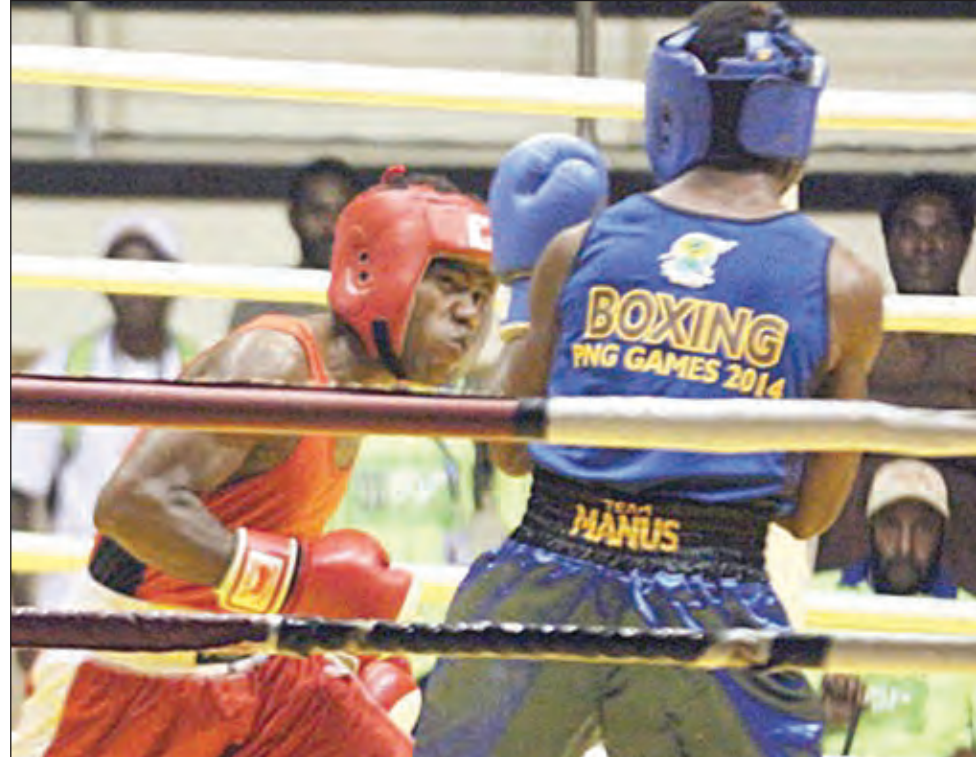
SAK KAIKAI TEL BILONG PUKPUK: Boksa bilong Manus i bin winim boksa bilong Sepik long wanpela strongpela pait.