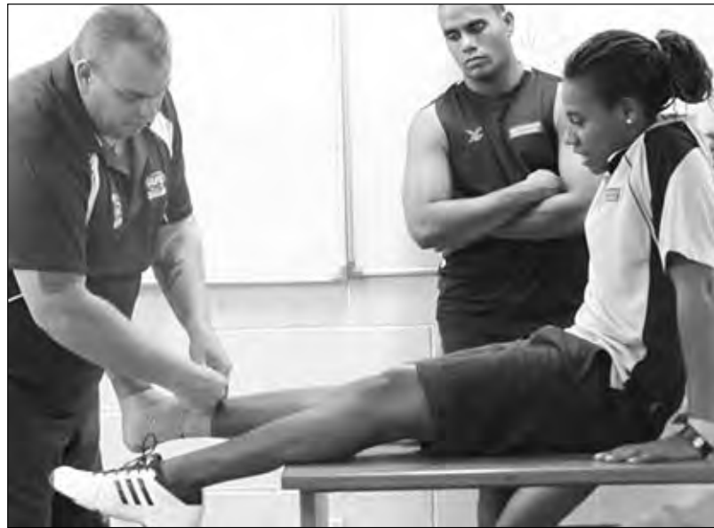
REDI LONG PNG GEMS: Wanpela UPNG Medikel sumatin long trening we Australia Sports Medicine lain i givim long redim ol sumatin long namba 6 PNG Gems i kamap nau long Lae, Morobe Provins. Teti (30) Medikel sumatin i stap nau long PNG Gems. Go insait long PNG Gems bai redim ol dispela sumatin spot lain long redi long Saut Pasifik Gems neks yia.