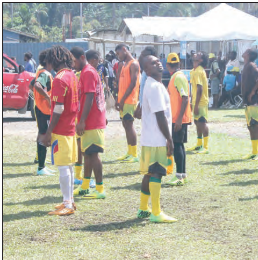
OL MANGI PS: Ol mangi Sepik i trening liklik bipo long ol i go insait long ples bilong pilai.

TOKSAVE: Salim ol spots dro bilong yu kam long Feks; 325 2579, e-mel; bveo@wantok.com.pg o kam lusim long Wantok Niuspepa opis long Able Building Complex long Central Waigani, NCD.