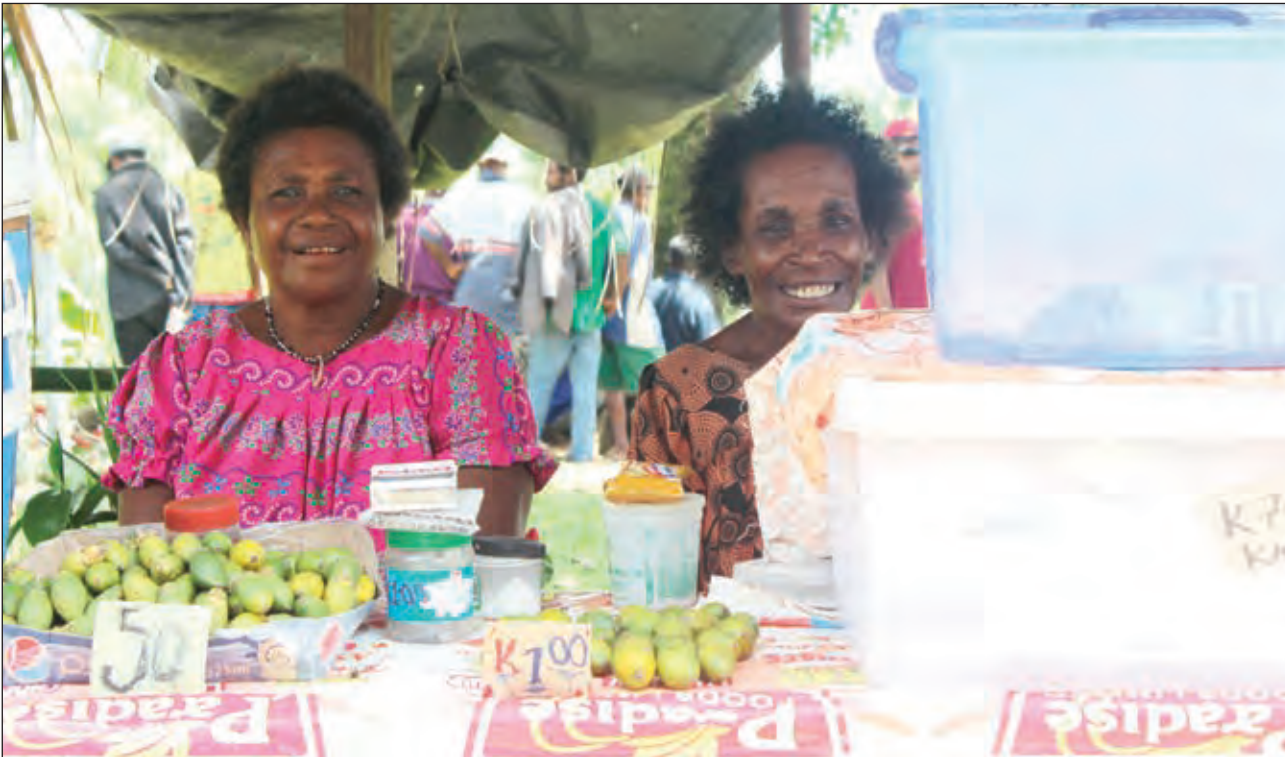
Ol mama bilong ples i kam mekim ol liklik maket long Lae siti.

Sampela bilong ol dispela liklik maket em ol lain bilong