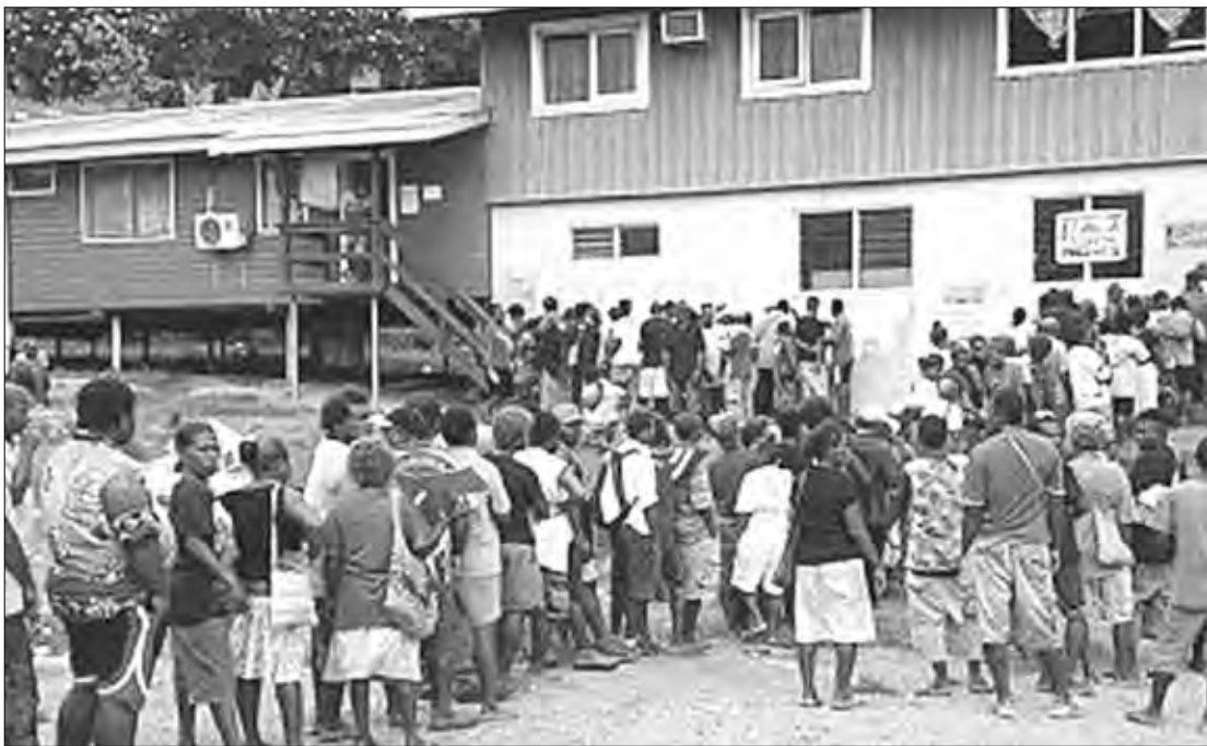
Ol pipel long Honiara i sanap long vot long ileksen bilong Solomon ailan.