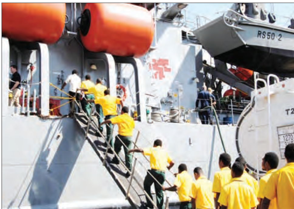
Ol sumatin bilong Hohola Yut Developmen Senta i raun i go antap long sip taim em i kam sua long Mosbi.

Wanpela askim ol i putim olsem sapos wanpela man i painim sampela samting bilong WW2 na eria we balus i bruk na stap long en, ol i ken