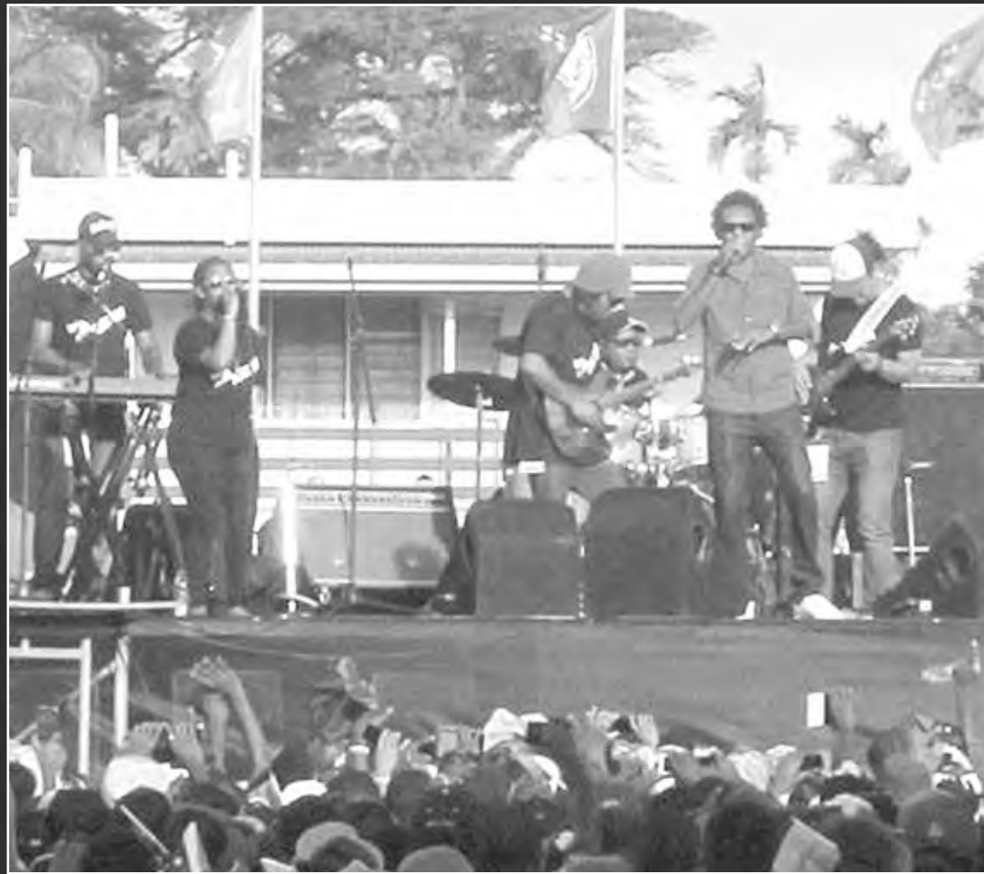
Poto Kepsen: Jokema i pefom long Sir Ignatius Stedium long Lae

Taim Jokema i pairapim dispela singsing, olgeta manmeri i go wail na singaut. Ol manmeri bilong blok husat i no bin gat tiket na kam insait long stedium i bin sanap ausait antap long ruf bilong ol haus na kar na soim kain kain stail danis bilong ol.