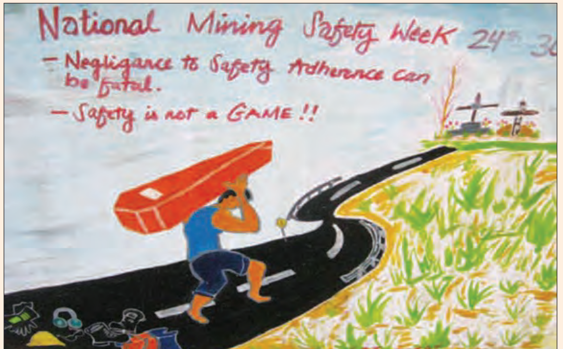
Piksa soim stori bilong seifti kalsa.