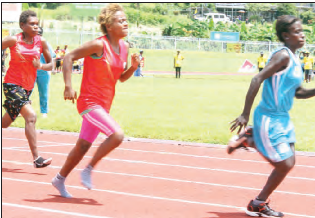
PARA SPOT: Ol etlit bilong Para Spot i ran strong na san tu i hatim ol.