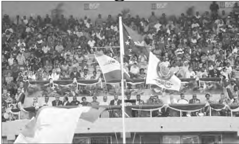
Ol manmeri, ol sponsa, na ol lida long seremoni bilong opim 2014 PNG Gems.

Em i bin tok bikpela tok tenk yu tu long Bank South Pacific (BSP) na ol arapela sponsa husat i givim bikpela sapot long mekim kamap dispela 2014 PNG Gems.