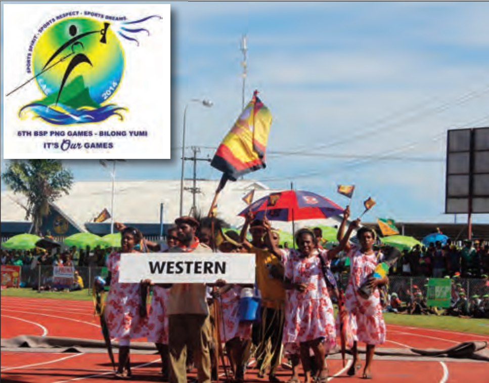
TIM WESTEN: MASKI midia i toktok kain kain toktok olsem tim Westen bai no inap long pilai long 2014 PNG Gems, wanpela liklik grup bilong tim Westen i bin wokabaut long seremoni bilong opim PNG Gems.