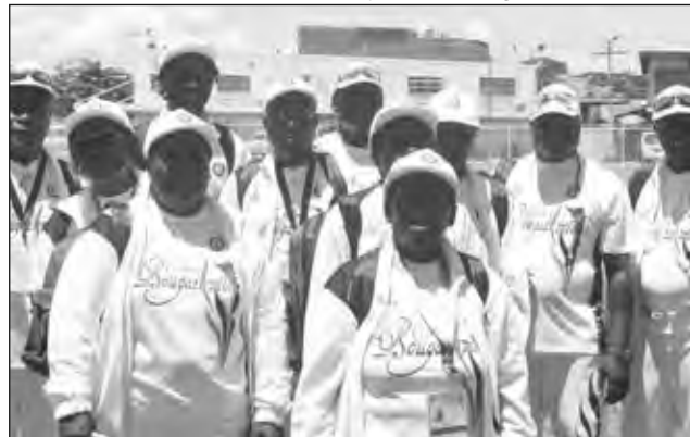
Medikol tim bilong tim AROB long St Mary long Lae.