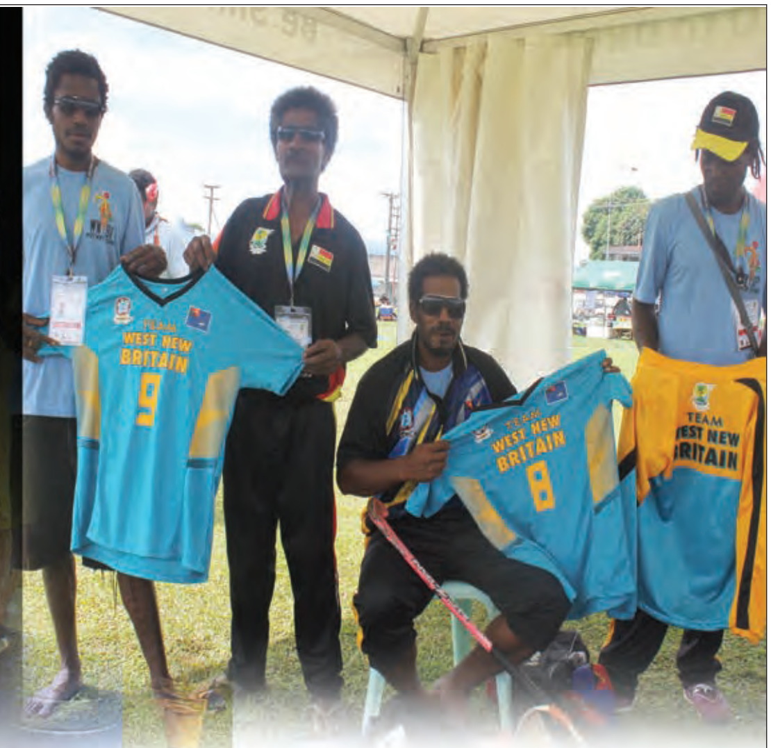
Ridim stori long pes 25