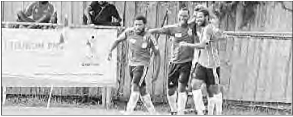
Ol pilaia bilong Oro FC i amamas bihain long ol i skoim wining gol.

Na long Lae, ol Lae FC i winim Besta 3-1. Lae i sindaun namba foa long lata, na sapos ol i win long neks wik, ol bai pilai long ol fainel. Besta i no gat sans nau long pilai long ol fainel, tasol ol bai pilai las gem bilong ol wantaim Admiralty long dispela wiken.