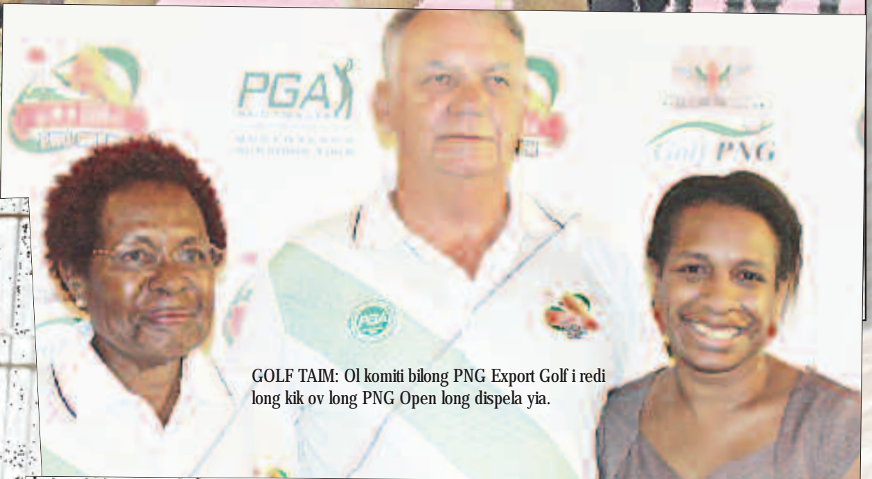
GOLF TAIM: Ol komiti bilong PNG Export Golf i redi long kik ov long PNG Open long dispela yia.