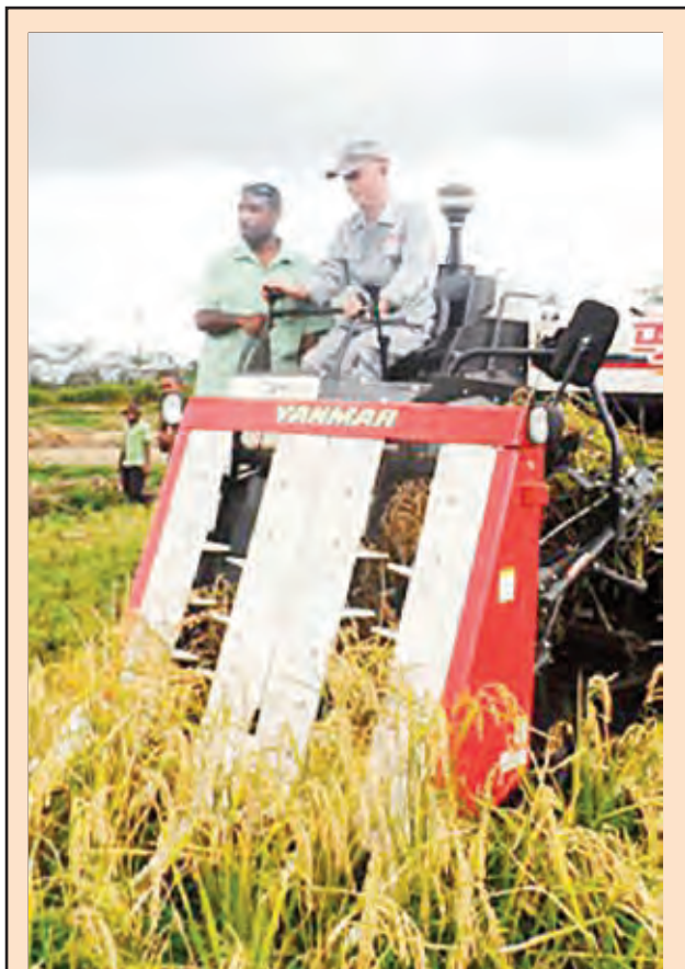
Piksa bilong nupela mesin bilong pikim rais i kam long Saina i pikim rais long Hailans Egrikalsa Koles long Maun Hagen, WHP.

Moa lo 30pela polis man wok ananat lo kominiti polis unit lo Hagen i wok insait lo maket olgeta dei lo lukaut bilong PPC na dispela i mekim maket envirmen i stap gut.