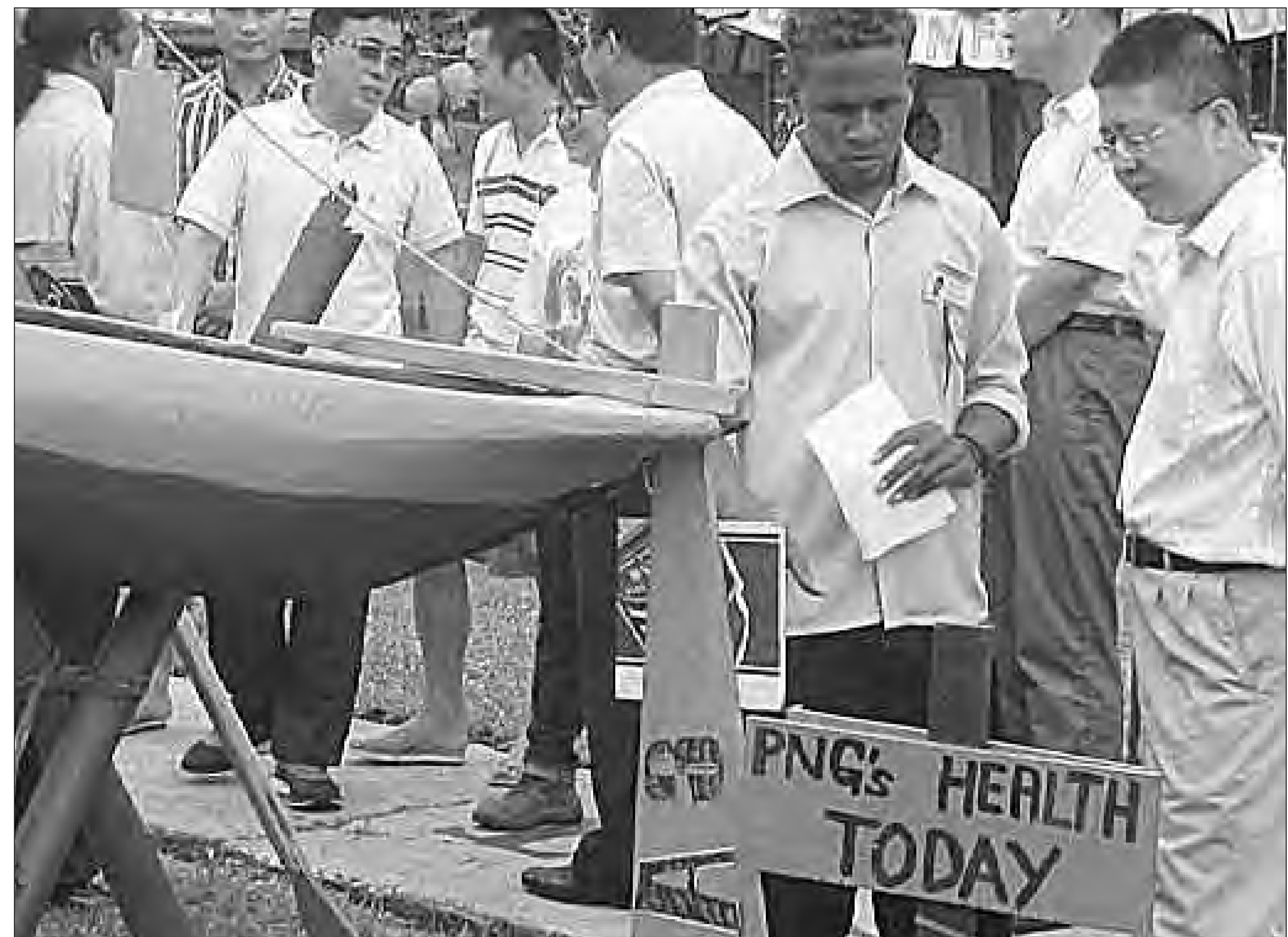
Ol bosman bilong Ramu NiCo lukluk raun long Open De.