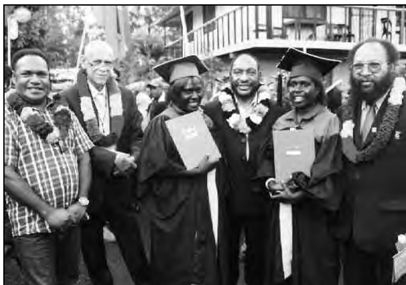
Tugumana Komyuniti Helt Woka Trening Koles long Wapanamanda, Enga Provins i lukim greduesen bilong 45 helt woka. Tupela meri long Atonomas Rijon bilong Bogenvil husat i bin klostu lus long Rabaul Queen birua tupela yia i go pinis, tasol ol i bin a abrusim bagarap na nau tupela i pinisim skul na kisim setifiket bilong wok.

Ol lain oposisen bilong Australia i tok pasin em Praim Minista Abbott i bin mekim long stopim wanpela wokabout bilong em i go long Indonesia long