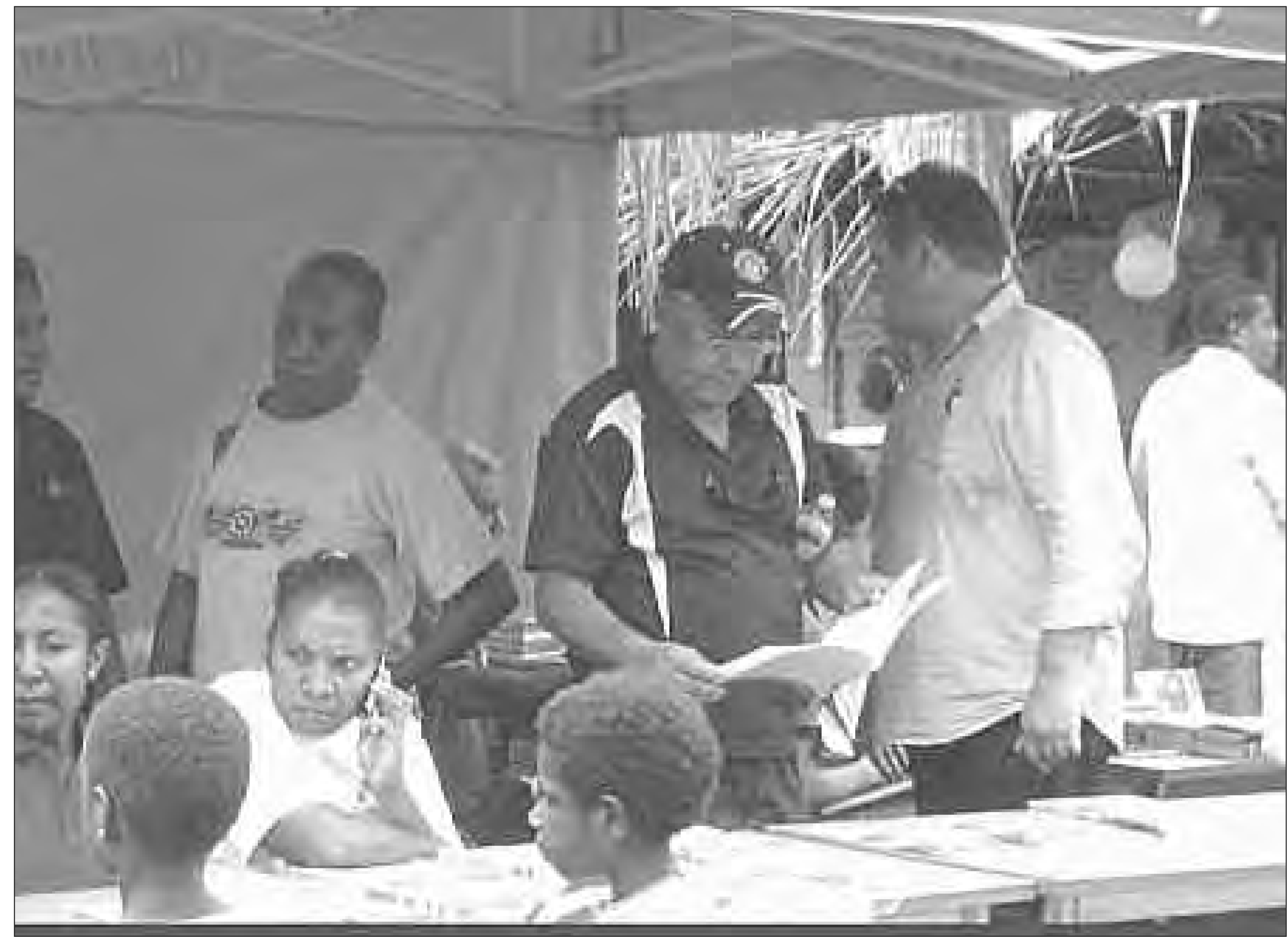
Ol Ramu NiCo wok lain long stol.