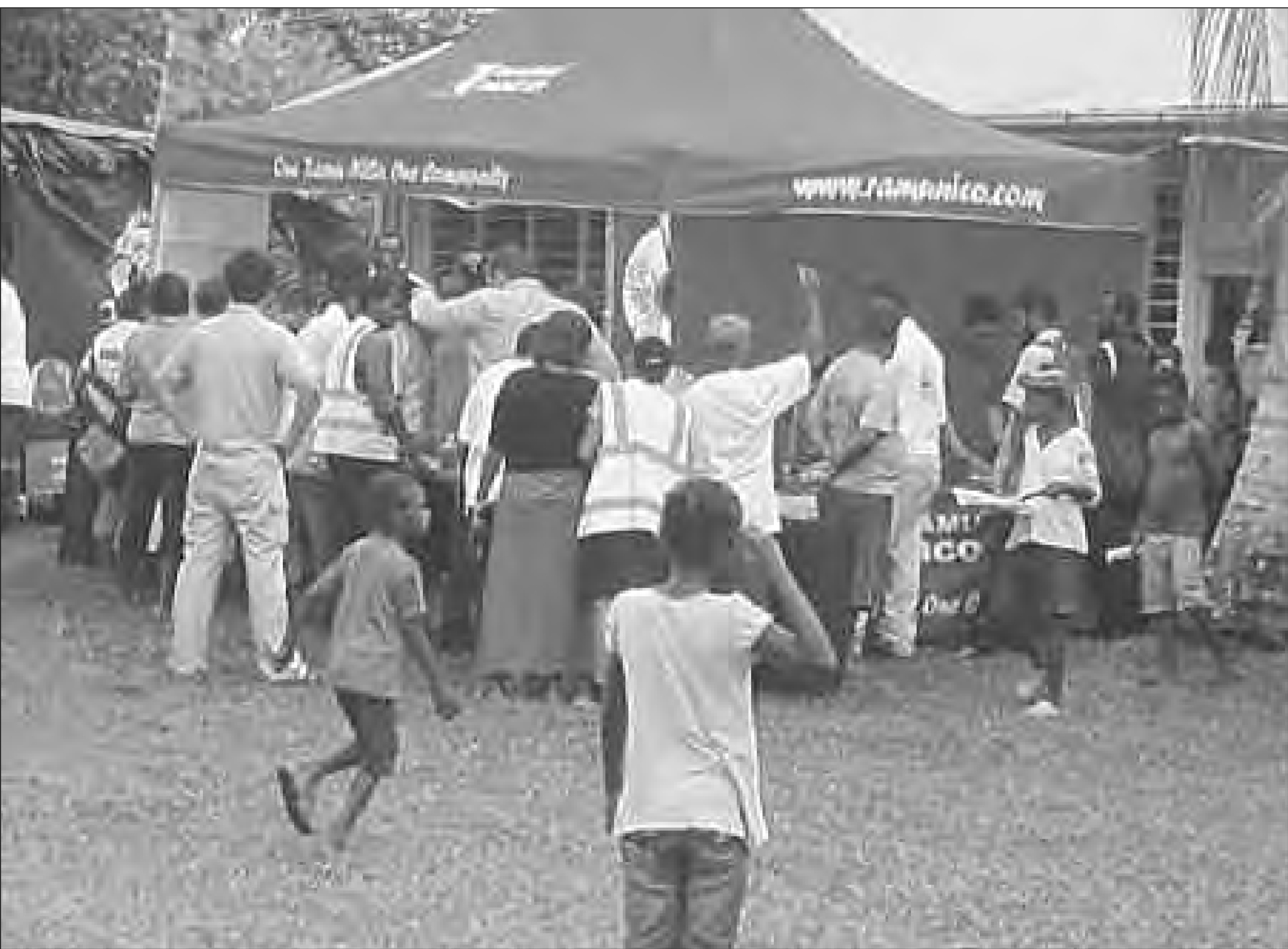
Stal bilong Ramu NiCo long DWU Open De.