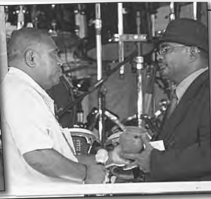
Demas, husat i kisim wanpela awod na givim wanpela graun pot i go long Kas T bilong Yumi FM olsem wanpela presen.