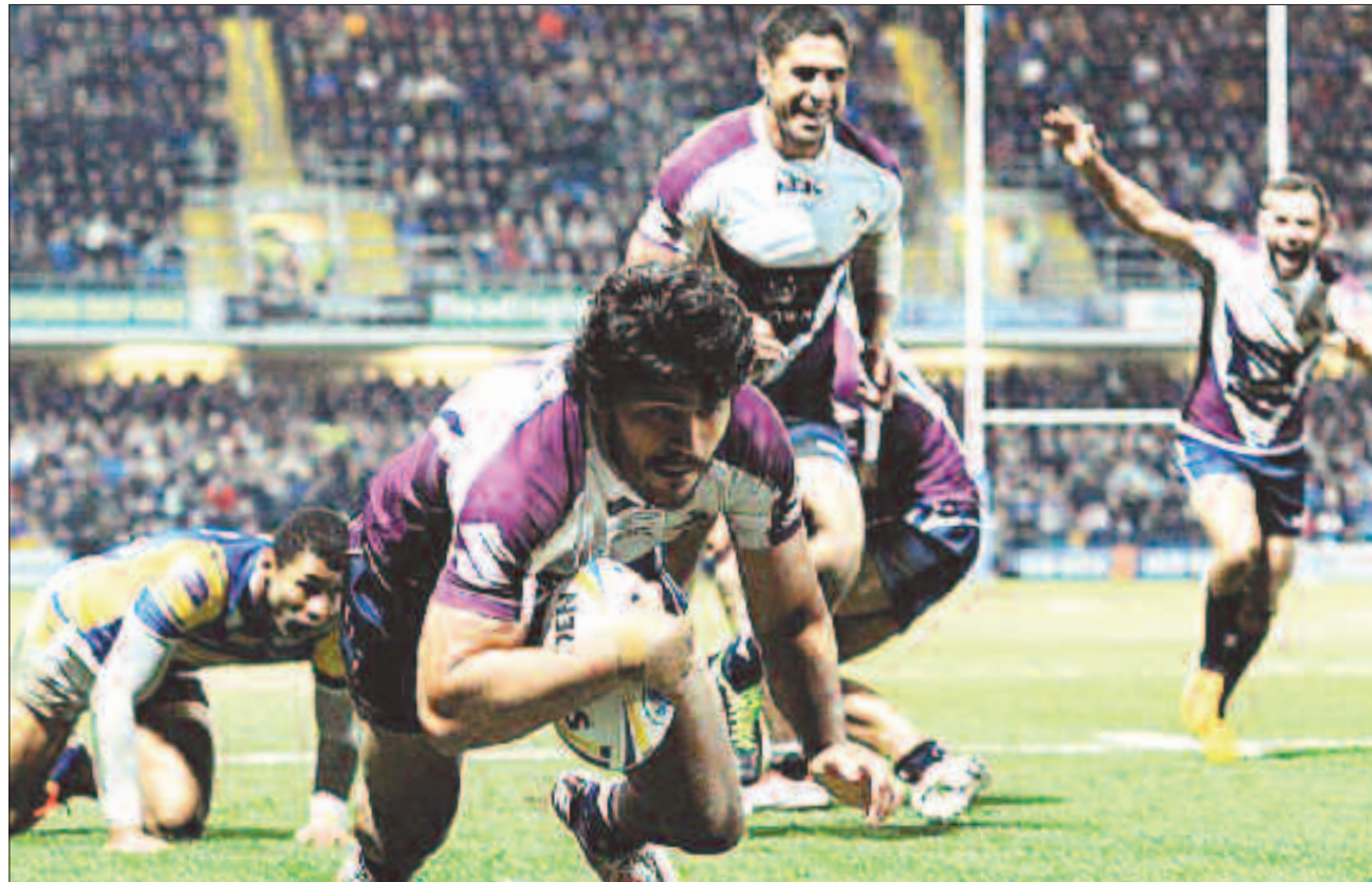
STORMS: Nu Silan pilaia Tohu Harris bai pilai wantaim Melbourne Storms i go inap long 2017. Harris i bin winim Rookie of the Year awod long las yia na Melbourne Storms i gat bilip long em long apim nem bilong klap bilong ol.