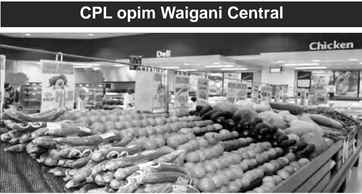
Insait long Central Waigani Stop N Sop dipatmen supamak.