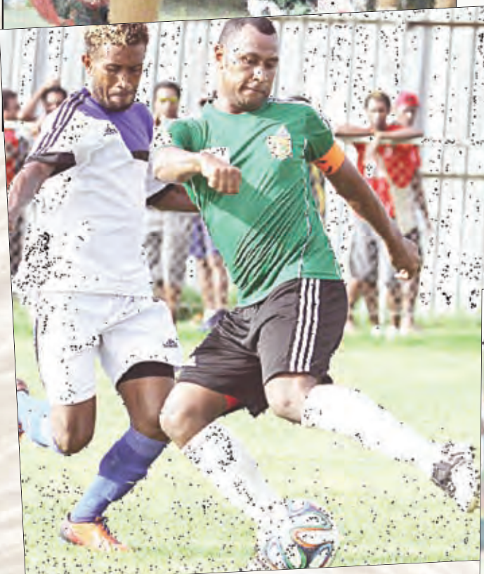
MI TUPELA TRAM: NSL soka resis name long Easten Star na Oro FC long Bisini soka graun long wiken. Oro kam bek bihain long win 3-2.