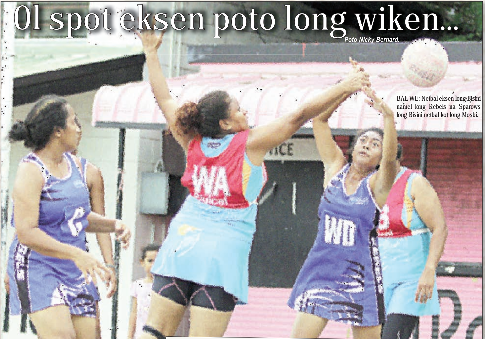
BAL WE: Netbal eksen long Bisini namel long Rebels na Sparows long Bisini netbal kot long Mosbi.