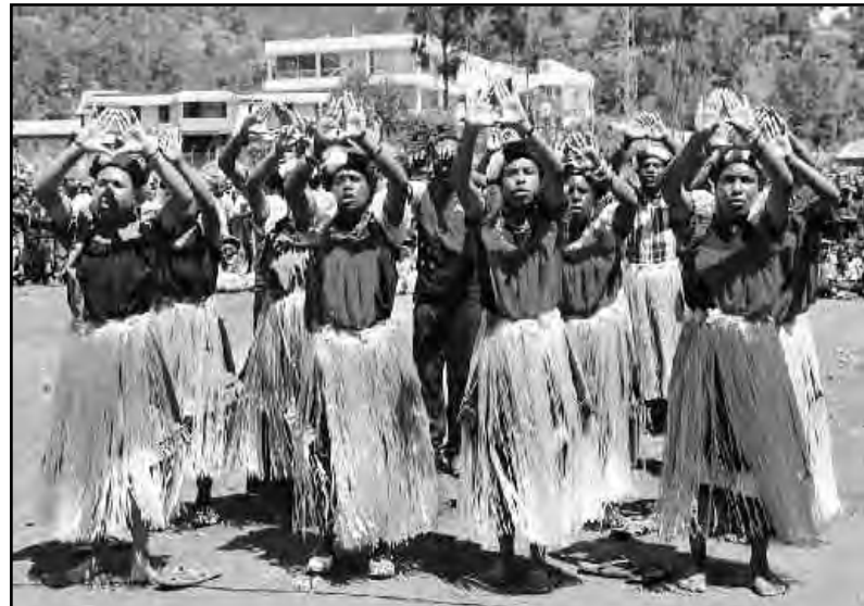
Pompus Katolik Yut bilong Wabag, Enga Provins i singim song na danis long yuniti bilong Enga long taim Helt Minista na Provinsel Gavman i sain-im Enga Provinsel Helt Atoriti long las wik.