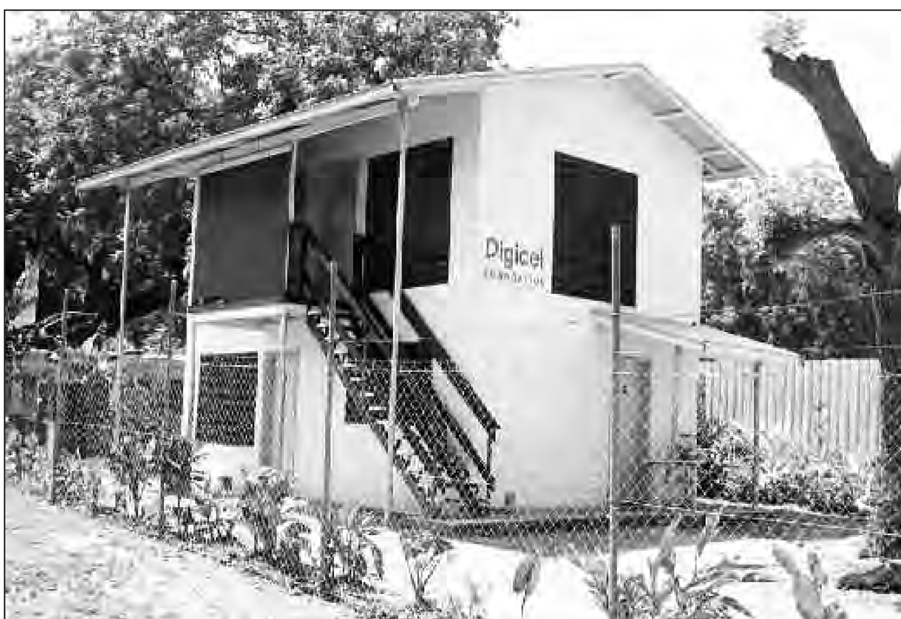
Meri Seif Haus long Kaugere.

Klostu taim nau bai ol dispela meri seif haus i senis. Dispela ol senis bai mekim ol senta i kamap gutpela bilong ol meri na pikinini husat i painim ples bilong hait na banisim ol yet long ol hevi ol i bungim long han bilong