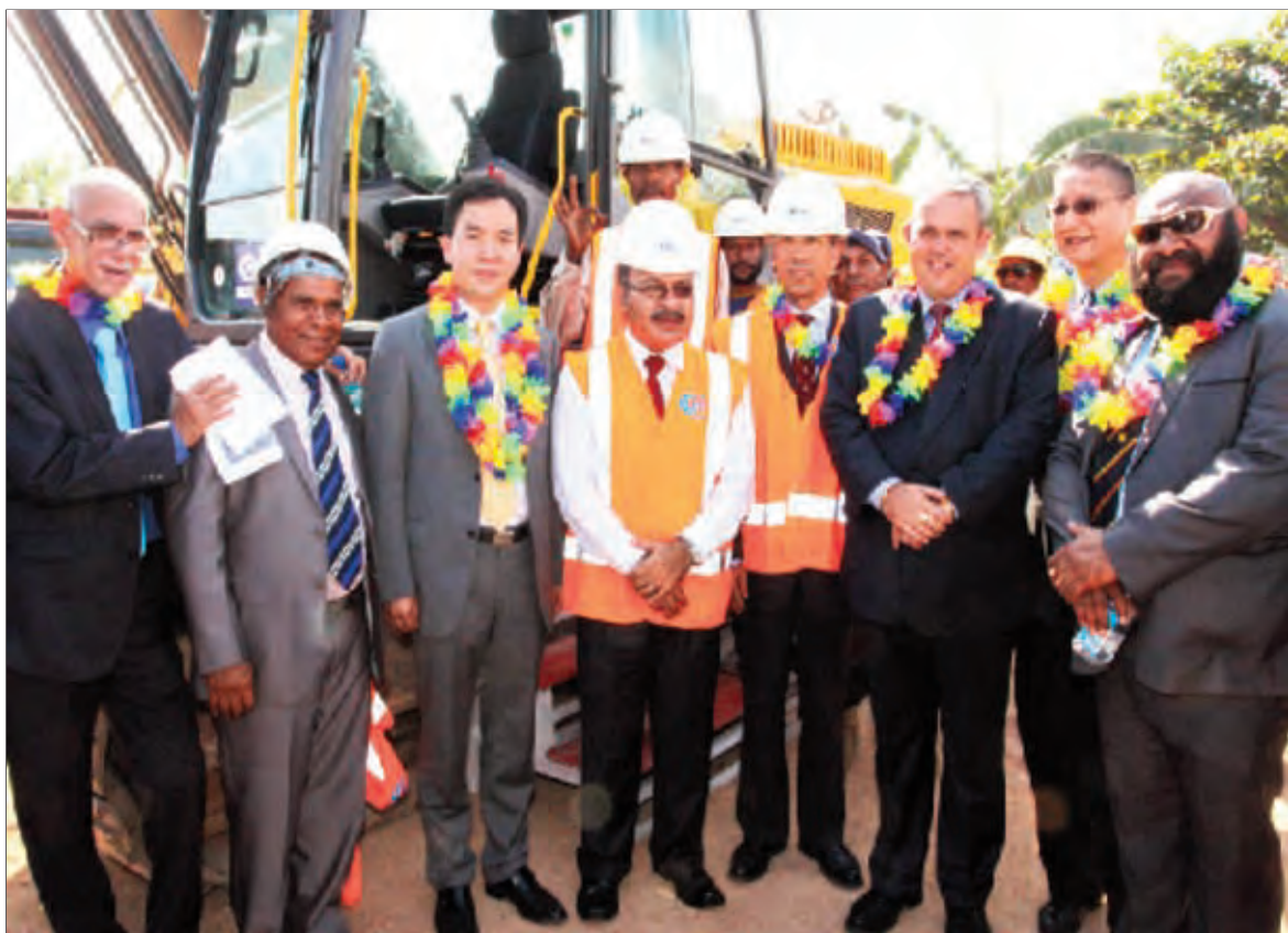
Ol lida bilong Papua Niugini na Saina long graun breking seremoni bilong nupela 4 lein rot long Pot Mosbi.

Embeseda i tok Saina i amamas long helpim Papua Niugini bikos tupela kantri i save wok pren long planti taim, na ol bai helpim Papua Niugini long kamapim ol rot na infrastraksa, na helpim kantri long strongim ikonomi.