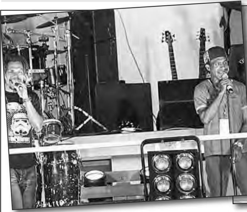
Tati i singim wanpela top singsing bilong em.