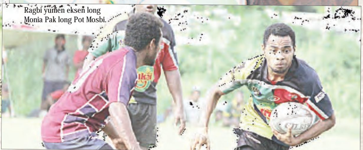
Ragbi yurien eksen long Monia Pak long Pot Mosbi.

TOKSAVE: Salim ol spots dro bilong yu kam long Feks; 325 2579, e-mel; bveo@wantok.com.pg o kam lusim long Wantok Niuspepa opis long Able Building Complex long Central Waigani, NCD.