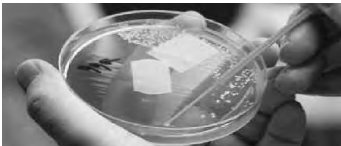
Ol lain bilong World Health Organisation i wokim tok lukaut olsem strongpela marasin o Anti-Biotic olsem long piksa hia i no strong moa na no gut planti pipel bai stat long dai gen long ol liklik sik.