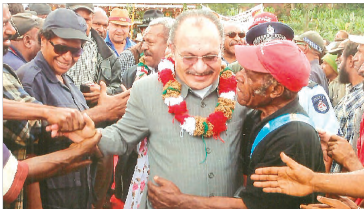
LONSING: Ol pipel bilong Goroka i amamas na raunim sekanim Praim Minista Peter O'Neill taim em i lonsim Kopi Industri long Nesenel De Pak long Goroka, Isten Hailans.