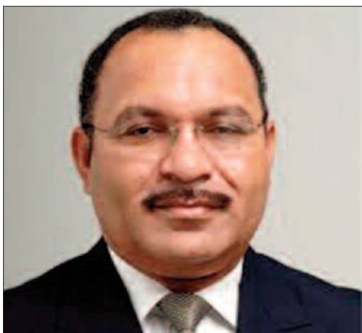
Praim Minista Peter O Neill i luksave long ol wan solwara bilong yumi long Solomon Ailan long taim bilong hevi.

"Long makim maus bilong ol pipel bilong PNG, mi laik tok sori long ol famili husat i kisim bikpela bagarap long Solomon Ailan.