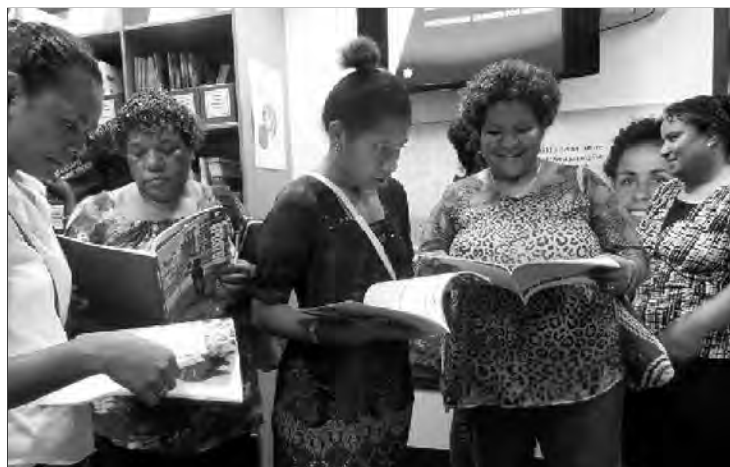
Sampela mama na ol yangpela meri husat i stap long tok save taim bilong ol meri las wik.

Australia Awot, aninit long Dipatmen bilong Foren Afeas na Tred i makim ol Sarere na Sande