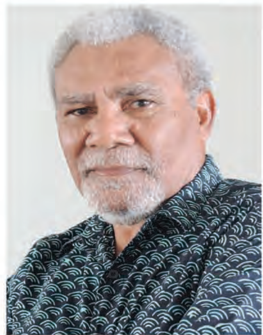
Intenesenel Senta bilong Invesmen Setelmen Dispiut (ICSID).

Midia rilis bilong Stet i tok, PNGSDP i karim olgeta samting bilong em i go long Australia pinis. Dispela tok em i no tru. PNGSDP i gat hetkwata long Pot Mosbi na em i stap yet. Em i gat ol opis tu long Daru na Singapore. PNGSDP i statim pinis intenesenel abitresen long kotim Stet long