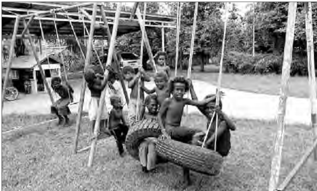
I GAT TAIM BILONG OLGETA SAMTING: Maski hevi i stap, ol liklik pikinini Solomon Ailan i amamas pilai long siso long DBTI Institut, Honiara.

bilog Melanesia i bin tok welkam taim ol lain i kamap long institute na serim ol kaikai, ol singsing na pre wantaim.