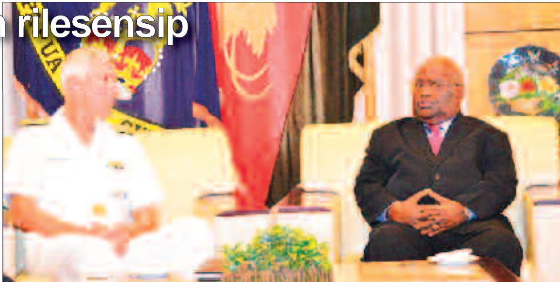
Gren Sif Gavana Jenerel Sir Michael Ogio i toktok wantaim Admiral Samuel K Locklear.

Em i tok long 70 yia long bipo, Wol Wo 2 i bin bagarapim laip bilong ol manmeri long Pasifik, na em i gat komitmen long lukim olsem dispela kain bikpela pait bai i no