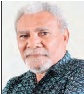
Siaman bilong PNGSDP, Sir Mekere Morauta

Sir Mekere i tokaut olsem dispela kot long Singapore i