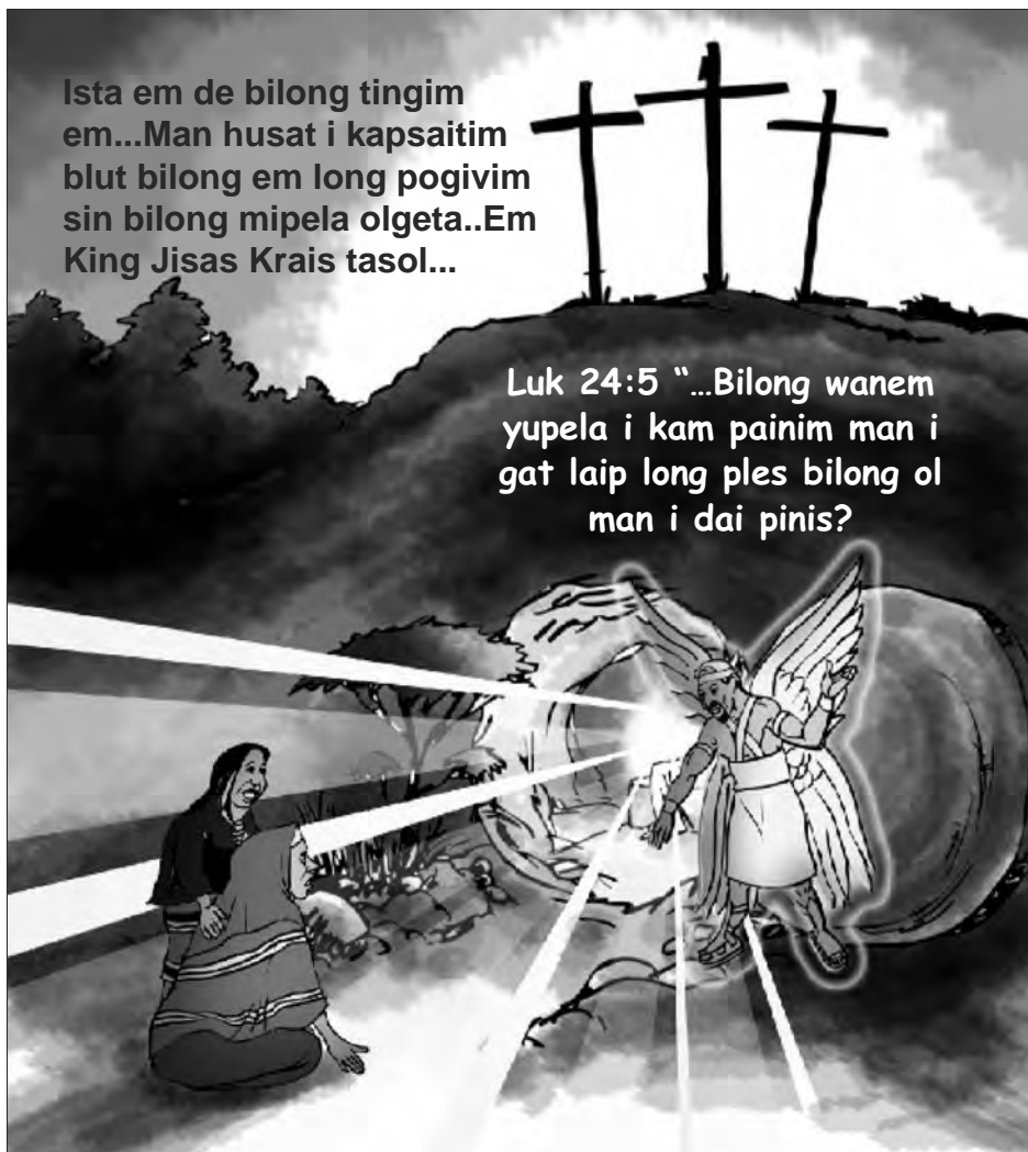
Ista em de bilong tingim em...Man husat i kapsaitim blut bilong em long pogivim sin bilong mipela olgeta..Em King Jisas Krai tasol...

Dispela klos we ol Roman soldia i putim long em i makim sin bilong yumi, na rop i gat nil long het bilong em i