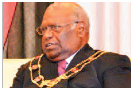
GREN Sif na Gavana Jenerel, Sir Michael Ogio, wari long boda asua...

sekyuriti em i wanpela bikpela samting we