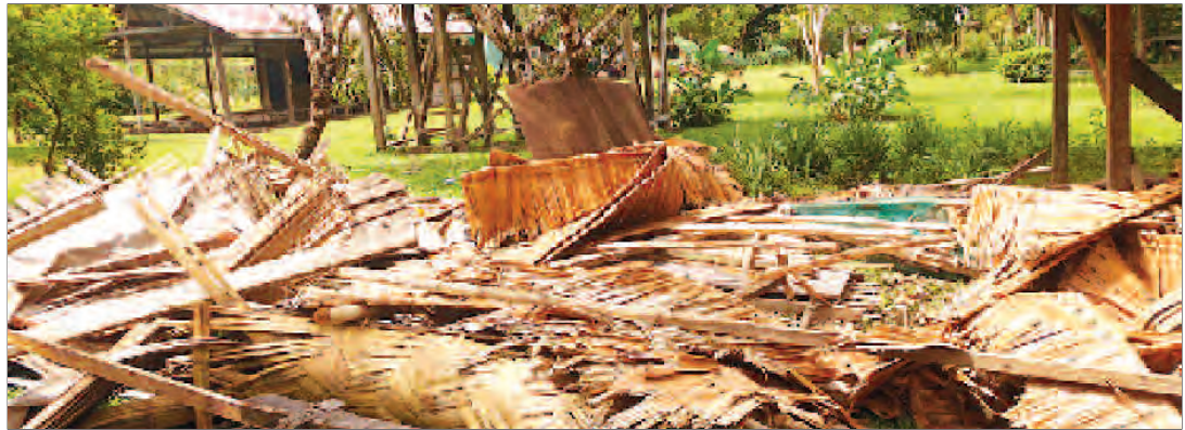
Ol sampela haus i bagarap na silip taim bikpela guria i kamap long ples Orukupu long Buin.

Em i tok no gat man i dai, tasol bikpela bagarap i bin kamap long ol haus, ol propeti na ol gaden kaikai.