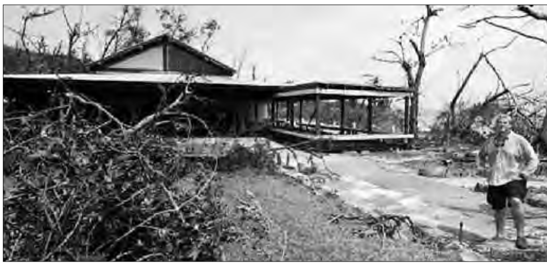
BAGARAP: Lizard Ailan em wanpela risot ailan long Not Kwinslen i kisim bagarap long Saiklon Ita.