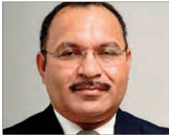
Prais Minista, Peter O'Neill...

MEMBA bilong Kande na bipo Tresera bilong kantri, Don Polye i tok em i laik dibet o tokpait wantaim Prais Minista, Peter O'Neill, long ol sampela bikpela disisen bilong kantri i kamap aninit long O'Neill gavman.