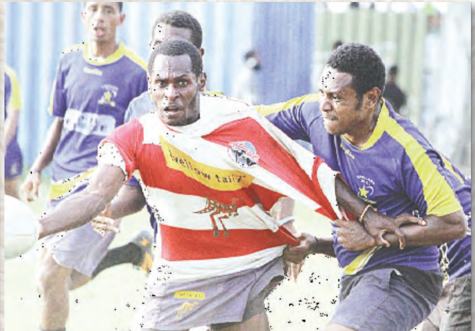
MASKI LONG TAKOL LONG JESI: Ragbi yunien eksen long Bava pak long wiken.