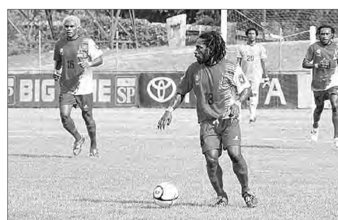
Ol Hekari i stap namba wan long NSL kompetisen na ol i redi tu long OFC long dispela mun.

Ol Eastern Star i bosim las spot long lata na sapos ol i no winim ol laspela gem bilong ol, ol bai kamap namba wan tim long aut long kompetisen.