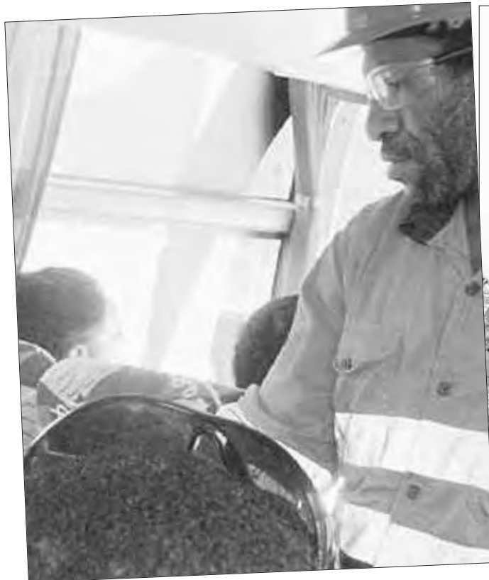
Sefti opisa sekim win long alcohol level.