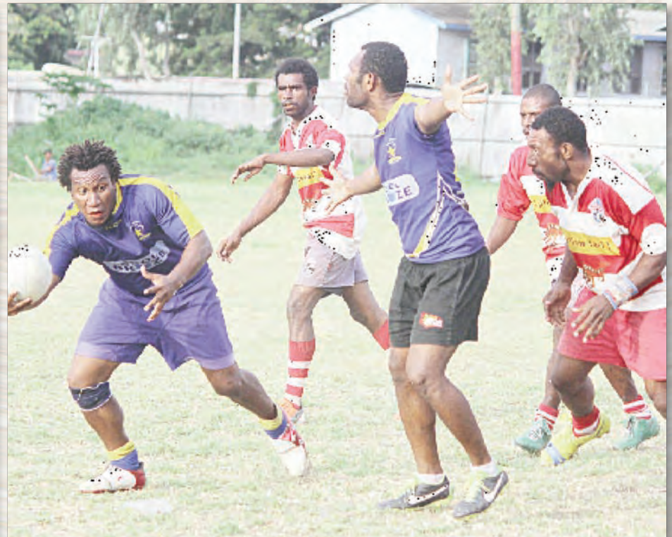
KAM ON REF: Ragbi yunien eksen pilai long Bava Pak nau ol kolim long Monian Pak.

TOKSAVE: Salim ol spots dro bilong yu kam long Feks; 325 2579, e-mel; bveo@wantok.com.pg o kam lusim long Wantok Niuspepa opis long Able Building Complex long Central Waigani, NCD.