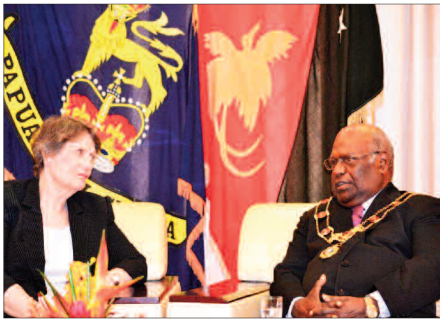
Gavana Jenerel Gren Sif Sir Michael Ogio i toktok wantaim Edministreta bilong UNDP, Helen Clark, long Gavman Haus, Pot Mosbi.

Em i namba tu taim bilong Helen Clark long kam long PNG. Namba wan taim em i kam em long taim em i bin stap olsem Praim Minista bilong Nu Silan.