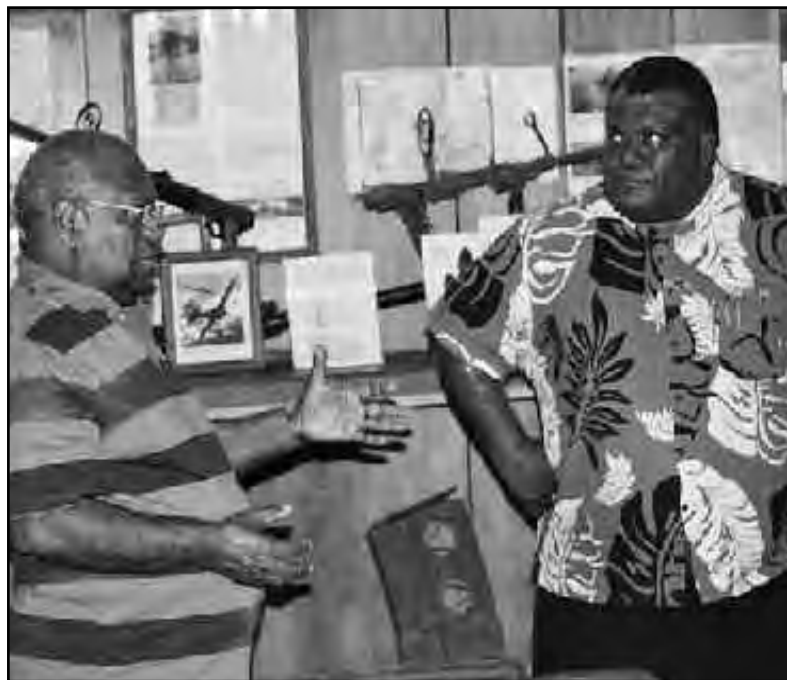
BUNG WANTAIM LIDA: Gavana Jenerel Sir Michael Ogio i toktok wantaim wanpela bikman bilong Is Nu Briten Provinsel Gavman.