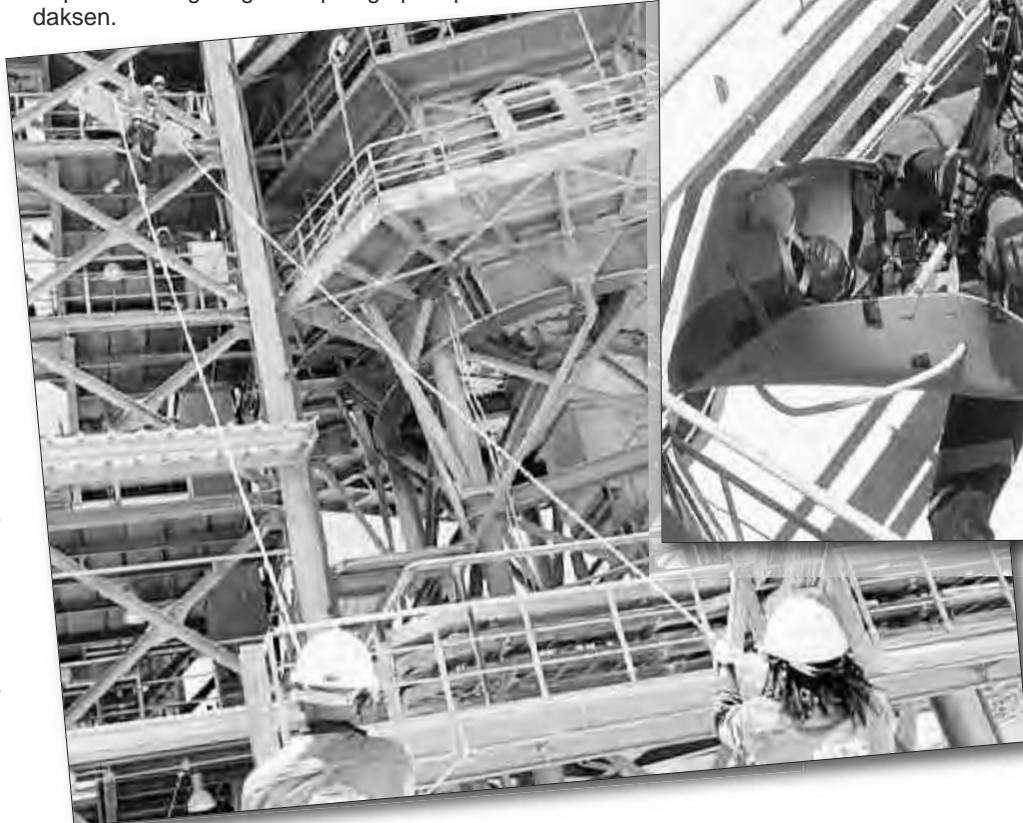
ERT Rop-reskiu trening long BSK.