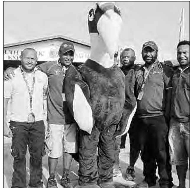
Tura i sanap wantaim ol representiv bilong Telikom.