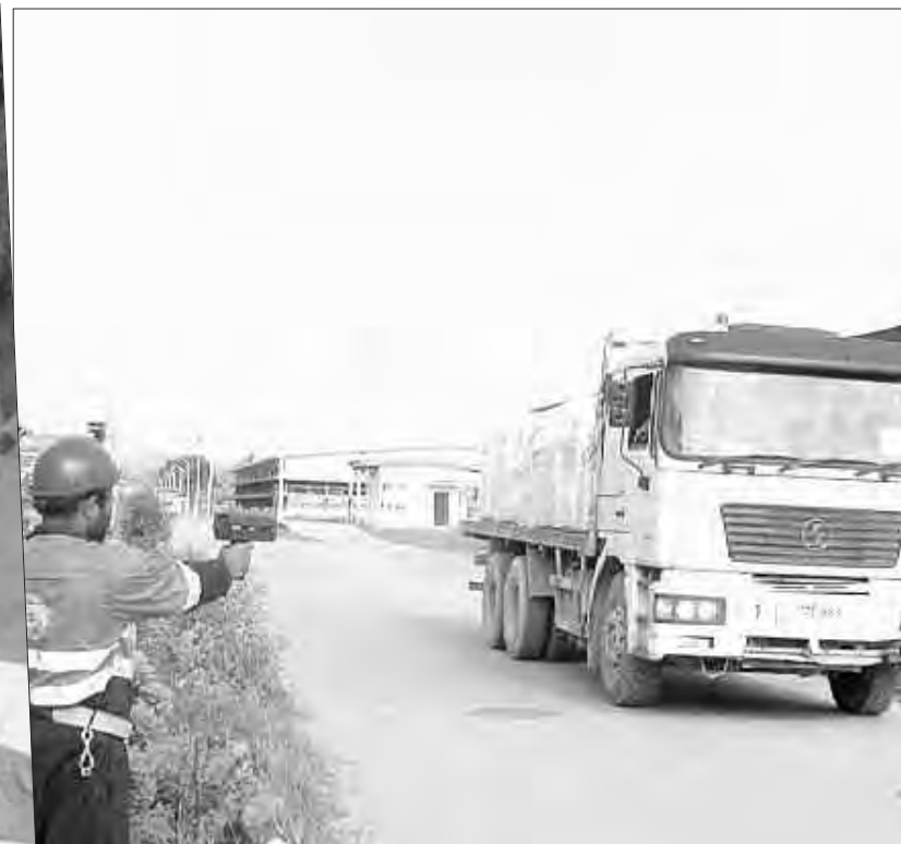
Sefti opisa sekim spit blong kar.