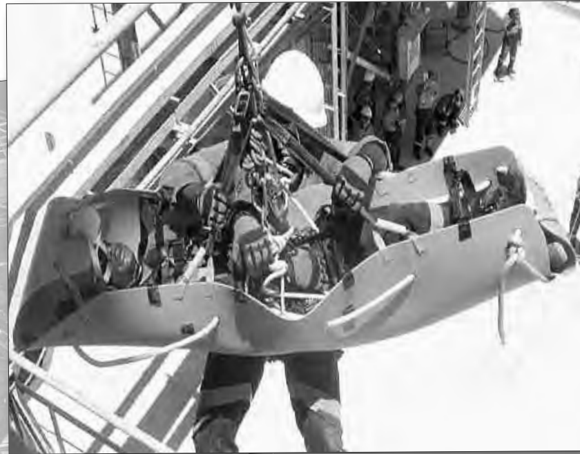
ERT tim mekim ekksesais long Sefti Wik.