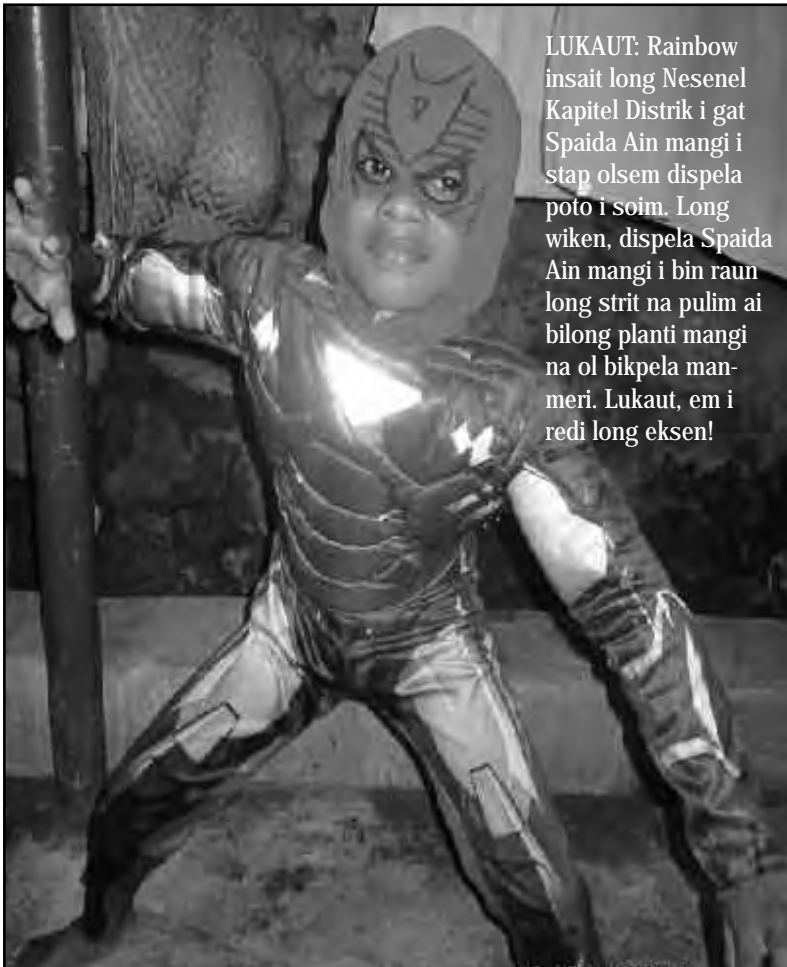
LUKAUT: Rainbow insait long Nesanel Kapitil Distrik i gat Spaida Ain mangi i stap olsem dispela poto i soim. Long wiken, dispela Spaida Ain mangi i bin raun long strit na pulim ai bilong planti mangi na ol bikpela man-meri. Lukaut, em i redi long eksen!