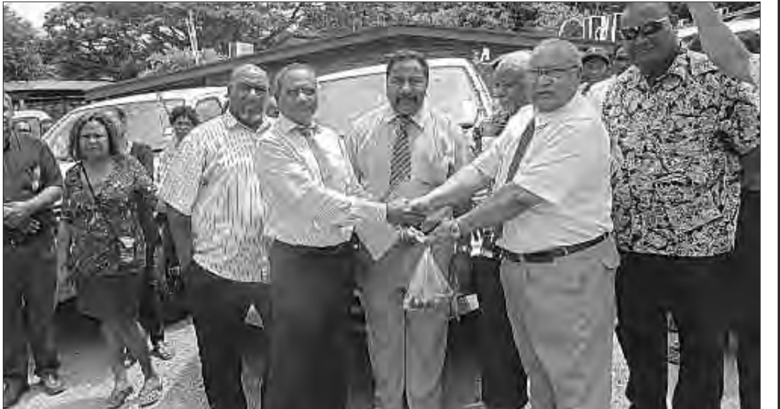
Gavana Haoda givim kar ki.