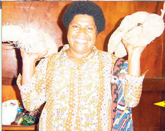
WOKIM SAKSAK: Saksak i wanpela kaikai bilong planti pipel long PNG. Long Sepik, Manus na Galp Provins, saksak em i bun tru. Poto hia i soim tupelo meri Galp i wokim saksak.