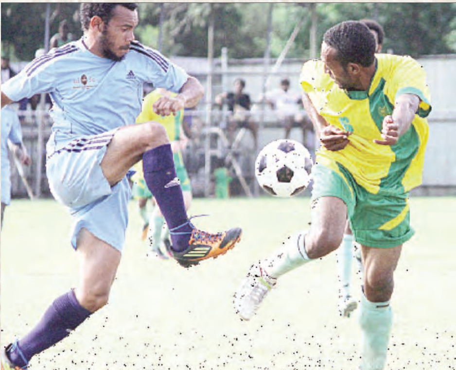
BAL WE? Pilai bilong Difens i traim long bek kik tasol Uni pilaia i kam pinis na putim lek.