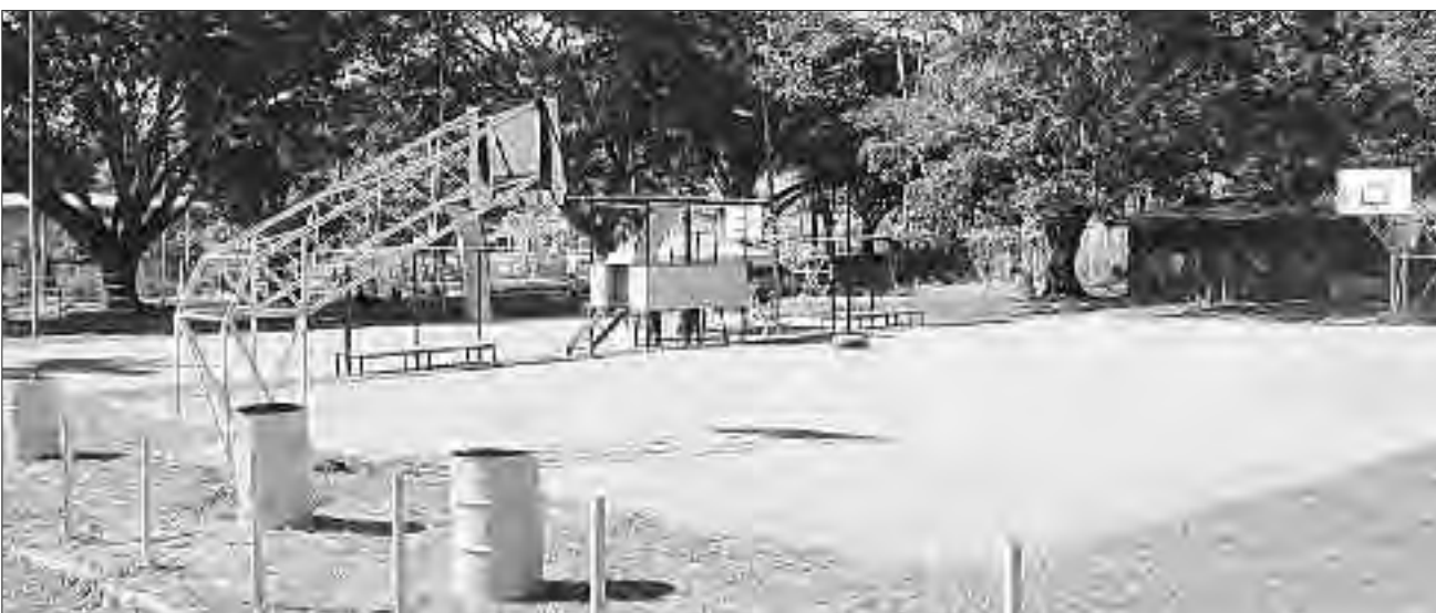
Spot fasiliti long Murray Bareks i stap long gutpela mak long ol spot manmeri long yusim.

Em i tok tenk yu long BSP tu long wok ol i save mekim long kamapim ol gutpela spot fasiliti bilong ol spot manmeri long kantri.