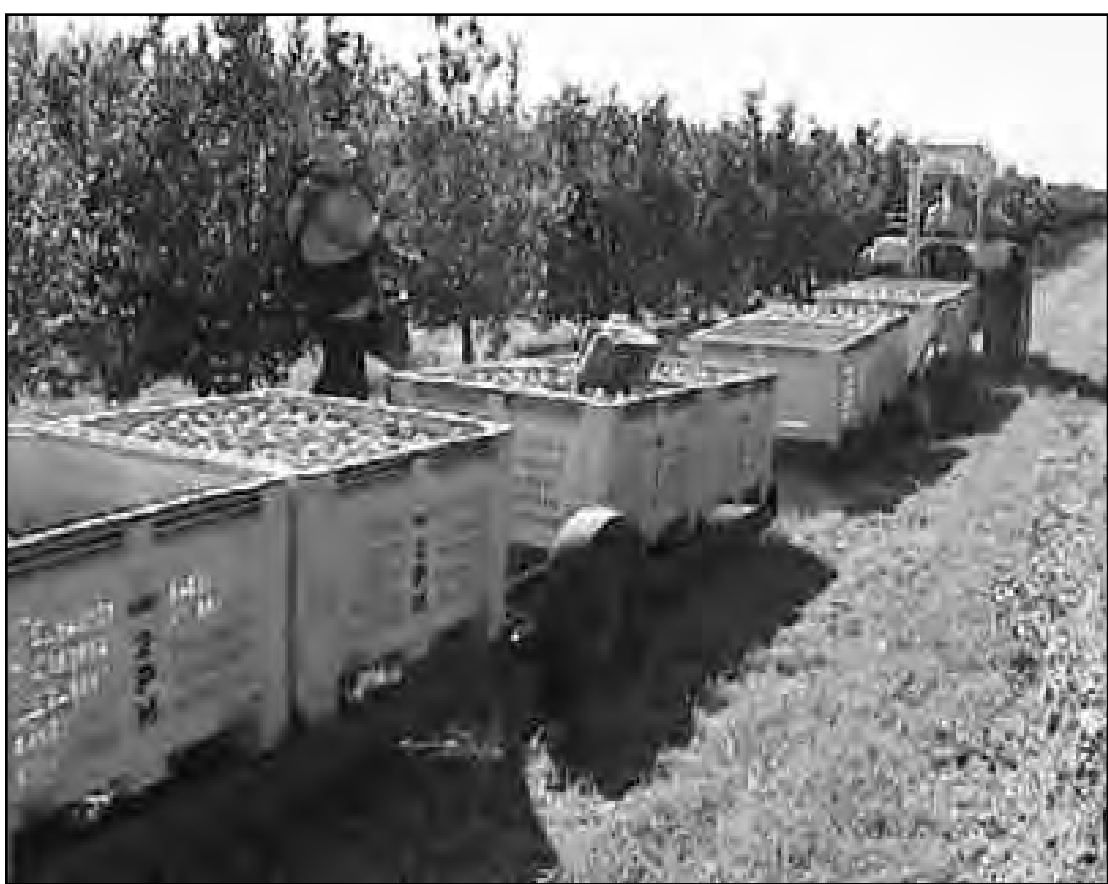
PASIFIK SISENEL WOKA: Piksa bilong ol Pasifik sisenel woka we wanpela i wok long wanpela muli fam long Australia.