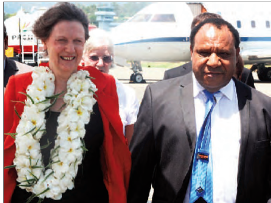
Foren Areas na imigresen Minista, Rimbink Pato i amamas long tok welkam long Edministreta bilong Yunaitet Nesen Developmen Fan, Helen Clark long kam long PNG.

Minista bilong Nesenel Plening na Alotau MP, Charles Abel na Milen Be Gavana Titus Philemon i opim Milen Be Provinsel haus sik wantaim ol skul haus long Santa Maria Hai Sku.