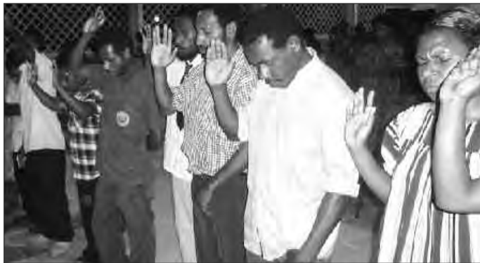
Ol TSCF sumatin i kisim prea long mekim gutpela misin wok long dispela yia.

Pasto bilong Asembli of God long Nuigo Sios i bin go pas long lotu na em i autim tok long Gutnius we i stori bilong wanpela bikman i salim ol wokman i go long kisim ol fren i kam long bikpela kaikai bilong en. Tasol ol i gat planti stori ekskius olsem na em i salim ol wokman