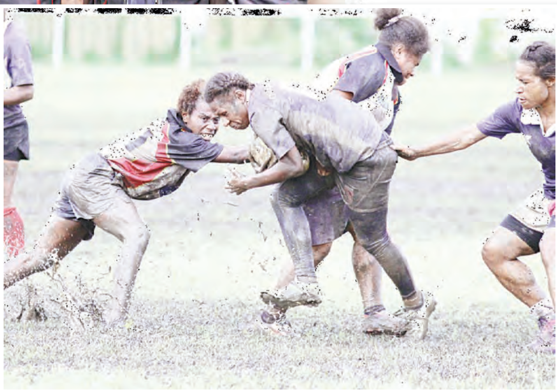
AI SORI: Pilaia bilong Chiefs i kaikai tit long brukim banis bilong Spartans tasol ol i holim em gut tru maski ples i welwel long gren fainal bilong ragbi yunien seven bilong ol meri long Pot Mosbi.