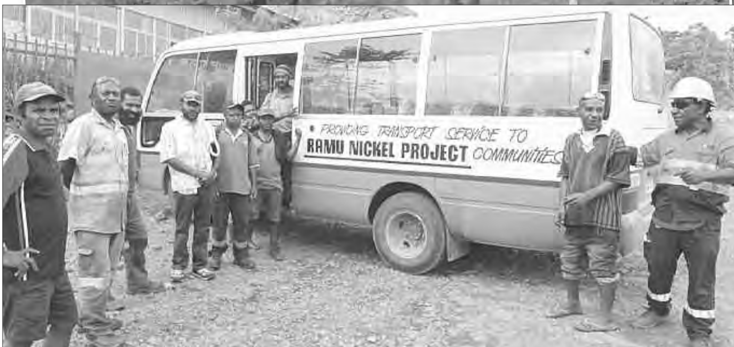
Bas sevis we ARIKRO Investment Ltd i kamapim long KBK Main.

Ramu NiCo i bin Kamapim Raibus Sikiriti, Raibus Ltd na NCS-Raibus na givim igo bek long ol papagraun.