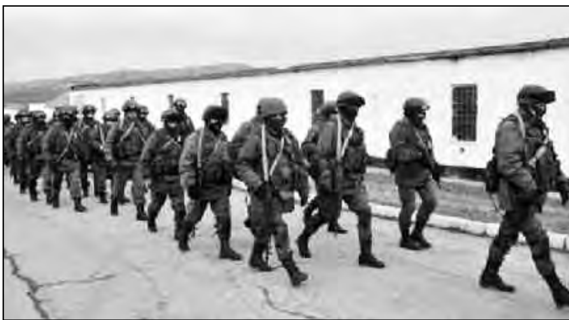
Ol soldia wantaim gan i blokim rot long boda bilong Ukraine klostu long Perevalne