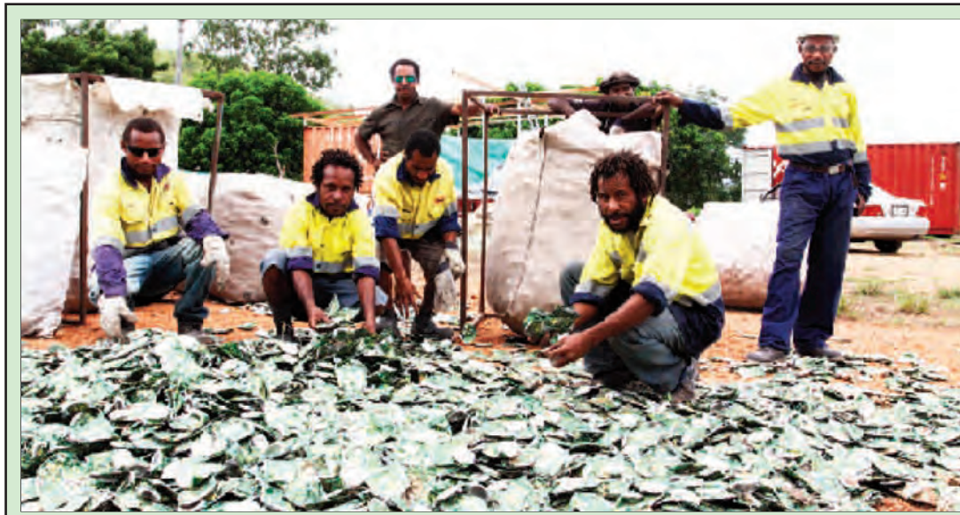
RISAIKLIN SKWAD: Ol raitlain husat i kolektim ol ken na ol arapela metal long Taurama i amamas nau olsem Supa Valu, BSP na Digi-cel i opim ol eijen bilong ol long Taurama ples... Wok bai isi tru long go baim kaikai, yusim ATM, EFTpos na kisim flex na top long hap.

BSP i tok benk i gro bikos i bin gat planti kastoma i wokim bisnis wantaim benk. Planti ekspensen program bilong ilektronik benking long EFTPOS na Mobail benking i bin gro na helpim benk long kisim gutpela winmani.