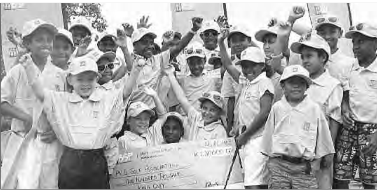
Ol yangpela golf pilaia i amamas wantaim kala bilong BSP.