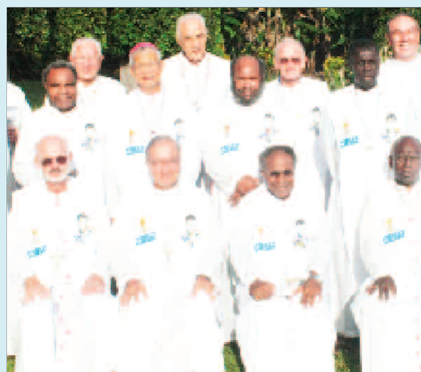
Sampela ol Bisop i memba bilong CBC i mekim strongpela toktok long ol asailam sika. Fail foto

Long wankain taim tu, Australia na PNG i tok orait pinis long bung long wanpela taim olgeta mun na toktok long asailam sika risetmen wok na ol arapela samting i karamapim dispela long Manus.