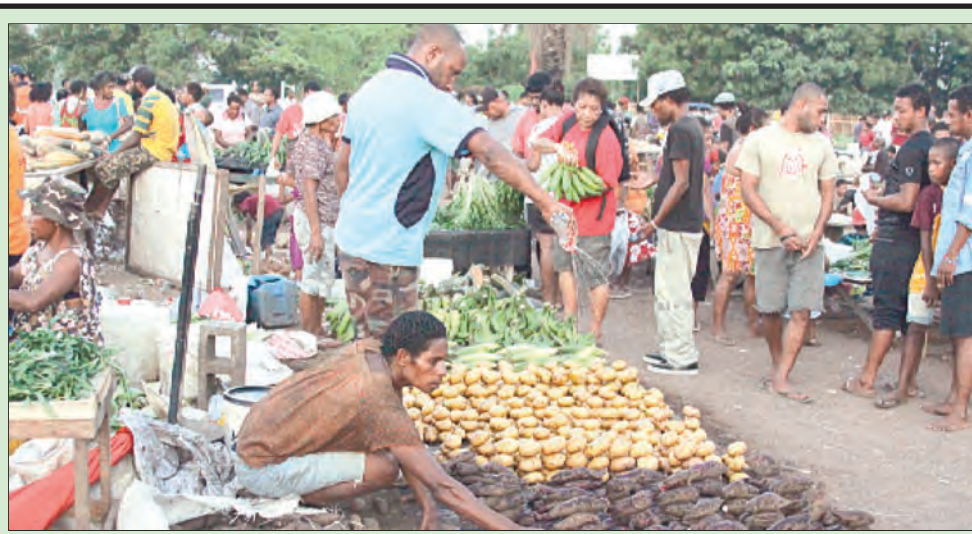
MAKET I NO ISI: Taim bilong ren long Mosbi na ol maket long siti i kam gut wantaim ol gaden kaikai olsem kaukau, poteto, banana na ol kumu olsem long dispela pototo.

Tude, samting olsem 20 famili long Usino Wod 3 LLG i groim rais na lukautim ol famili bilong ol, na tu, salim long kisim mani.