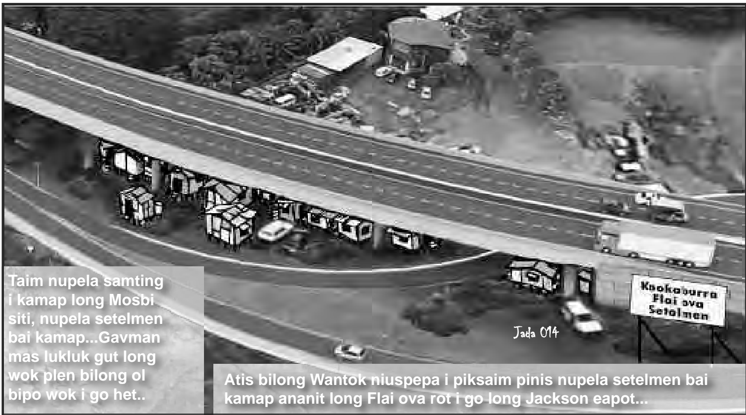
Taim nupela samting i kamap long Mosbi siti, nupela setelmen bai kamap...Gavman mas lukluk gut long wok plen bilong ol bipo wok i go het..