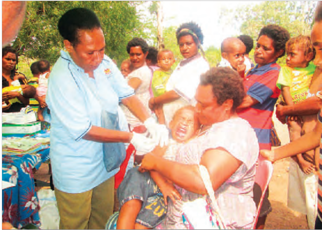
Ol NCD helt wokmanmeri i mekim imunaisesen wok raun bilong ol pikinini long olgeta hap bilong siti las yia.

Wimens Ikonomik Oportuniti inisitiv bilong ExxonMobil i sapotim CEDPA GWIM program. Em i wanpela program i save kamap long olgeta hap