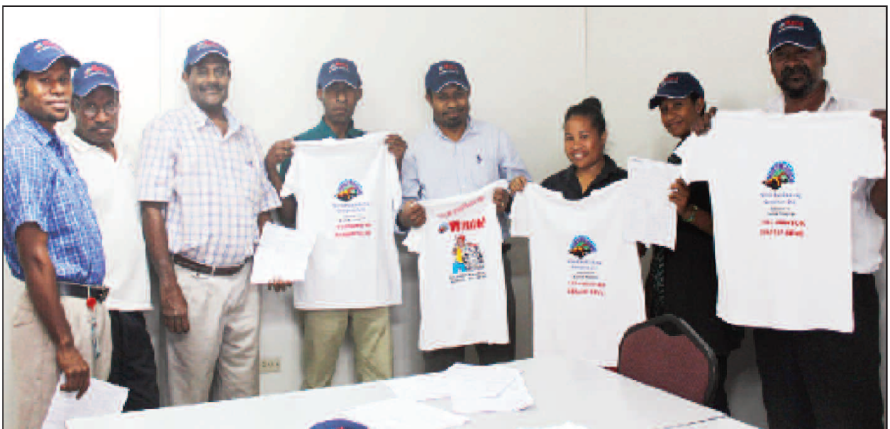
Ol wokman meri bilong Wantok Niuspepa i amamas wantaim ol t-siot na kep bilong dispela ridasip promosen bai stat tude na i go long foapela wik.