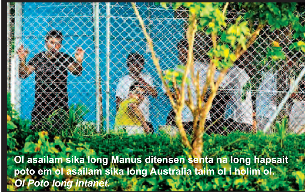
Ol asailam sika long Manus ditensen senta na long hapsait poto em ol asailam sika long Australia taim ol i holim ol. Ol Poto long Intanet.

Catholic Reporter bilong Mas isu i stap insait- P9,10,19,20