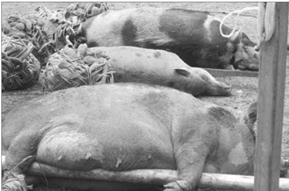
PIK NA MOA PIK: Aiyoo! Ol draipela mama bilong pik na ol arapela kaikai olsem i bin pulap long tok welkam long wokabaut bilong Mista O'Neill long olgeta hap bilong Bogenvil.