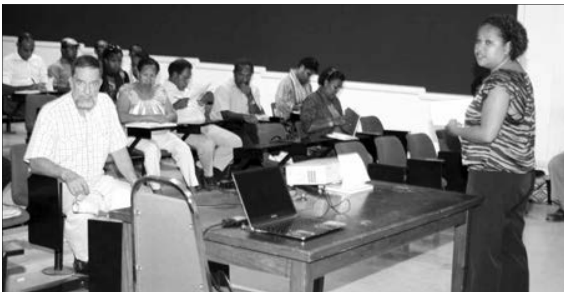
Profesa Mola i sindaun insait long forum wantaim ol Transperensi wokmanmeri na ol arapela dokta.

Tasol em i tok olsem i bin gat tupela narapela kampani tu i bin aplai long mekim dispela wok na ol i bin