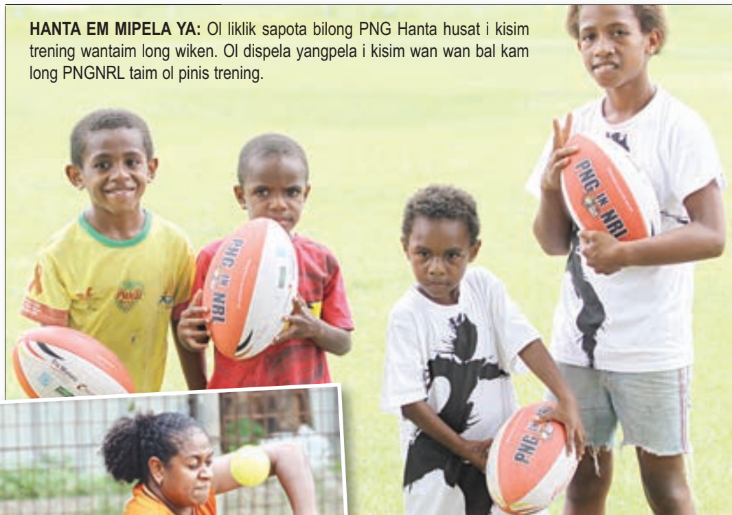
HANTA EM MIPELA YA: OI liklik sapota bilong PNG Hanta husat i kisim trening wantaim long wiken. OI dispela yangpela i kisim wan wan bal kam long PNGNRL taim ol pinis trening.