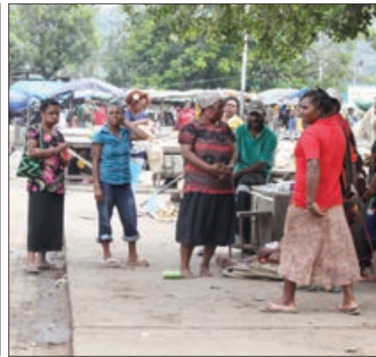
PIPIA PULAP: Malaoro maket i pas bikos pasin bilong hait na salim buai insait long maket i pulap tru. Pipia tu i no isi long ples bilong tromoi pipia. Taim bilong NCDC long klinap.