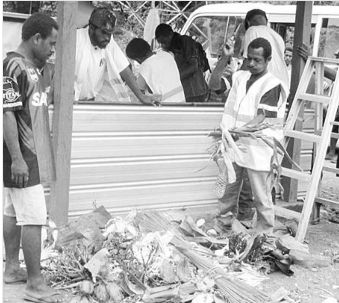
Ol opisa i rausim ol nupela banana na plawa na katim na rausim ol long ol pasindia bilong PMV trak.

Long Madang yet, bikipela prodaksen bilong kopra i save kam long Sumkar na Bogia distrik bikos planti ol bikipela plantesen i stap long hap. Narapela distrik tu em Raikos, tasol hevi long trenspot i stopim rot bilong ol fama long Raikos i go salim kopra bilong ol.