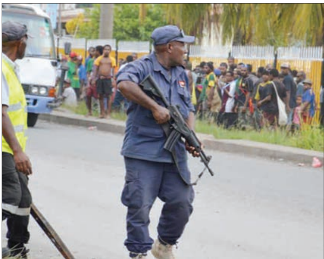
Polis man i sanap wantaim gan long stopim pablik long stilim kago long Pelgens long Lae.

Ol manmeri husat i save stap long Kamkumung long Lae, i bin tokaut long Fesbuk