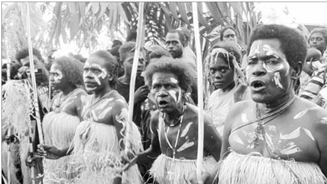
WELKAM LONG BUIN: Ol mama bilong Buin, Saut Bogenvil i mekim save long amamas, singsing kiaku na danis taim Praim Minista O'Neill i go long Buin las wik Tunde. Bikpela selebresen i bin kamap long Buin Taun we ol pipel i makim Buin, Siwai, Bana na Torokina Distrik i bin soim pasin kastom long tok welkam long praim minista na deligesen bilong em.