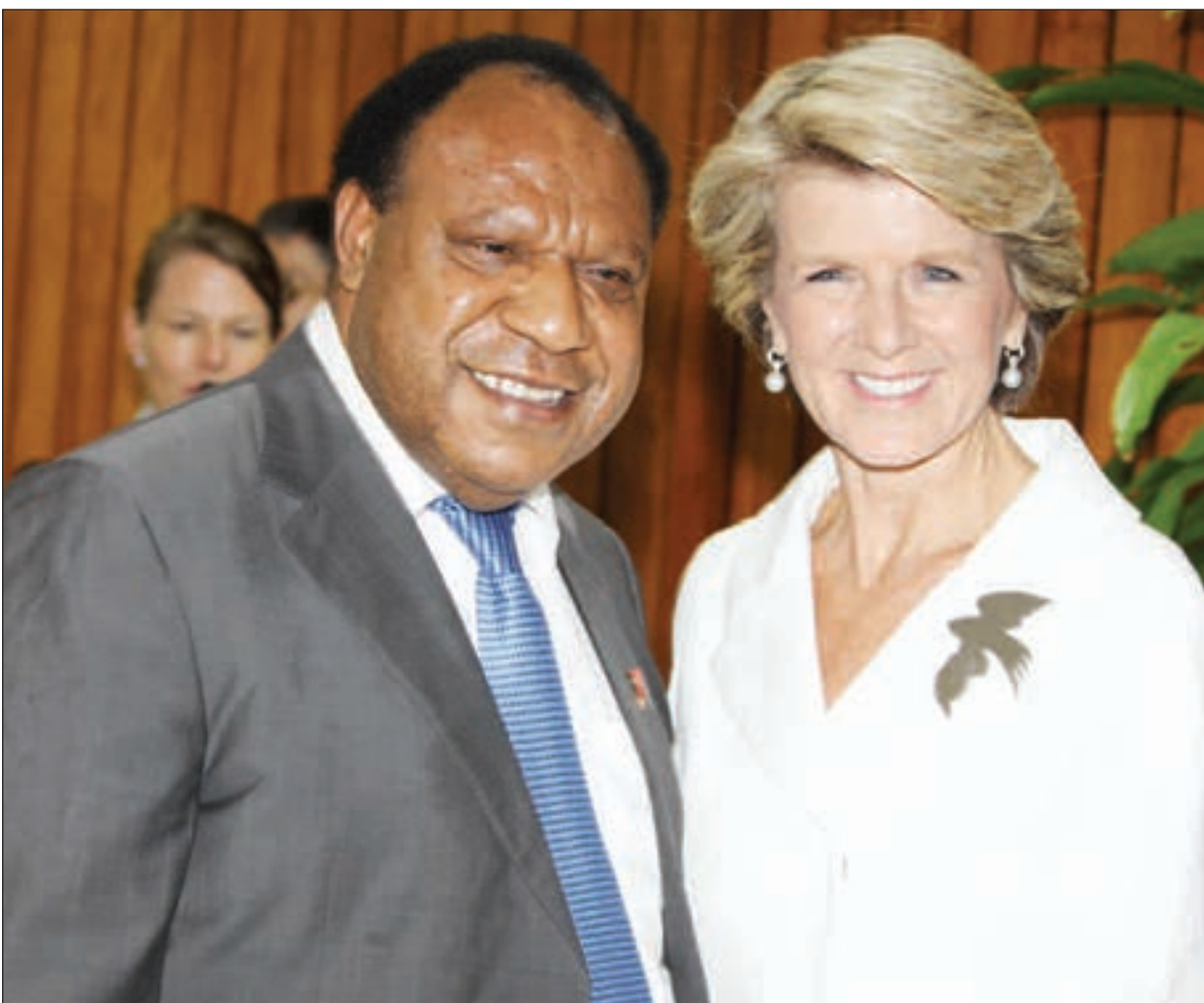
Foren Afeas minista bilong PNG na Australia, Rimbink Pato na Julie Bishop i tokaut long ol toktok i kamap namel long Bishop na ol gavman lida long kantri. Bishop i amamas long wok bilong Asailam Sika long Manus na tok Australia bai mekim isi long PNG i kisim visa. Bishop bai go long Lae long tude na bungim Australia AFP polis. Tupela gavman i toktok long strongim wok bisnis na groim ikonimi bilong tupela kantri.