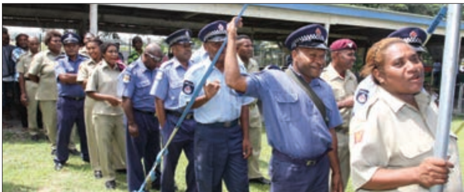
Ol polis na woda i mas kam long taim bilong opim kot yia long Godons Naserene Sios.

Bilong wanem yupela i no rausim ol samting blong pait long han blong sapotas bilong memba.