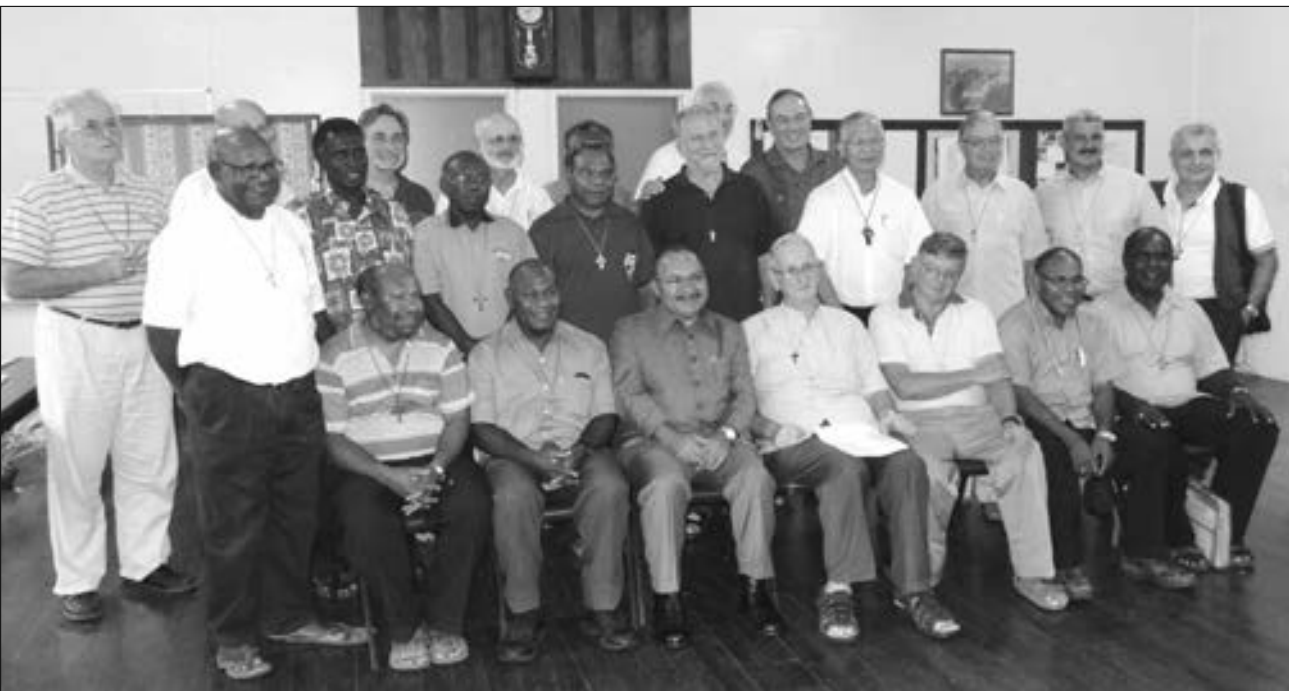
OL BISOP NA PM: (Namba 3 i sindaun) Praim Minista Peter O'Neill wantaim ol bisop bilong Katolik Sios bihain long Anuel Jenerel bung bilong ol long Madang long las yia.