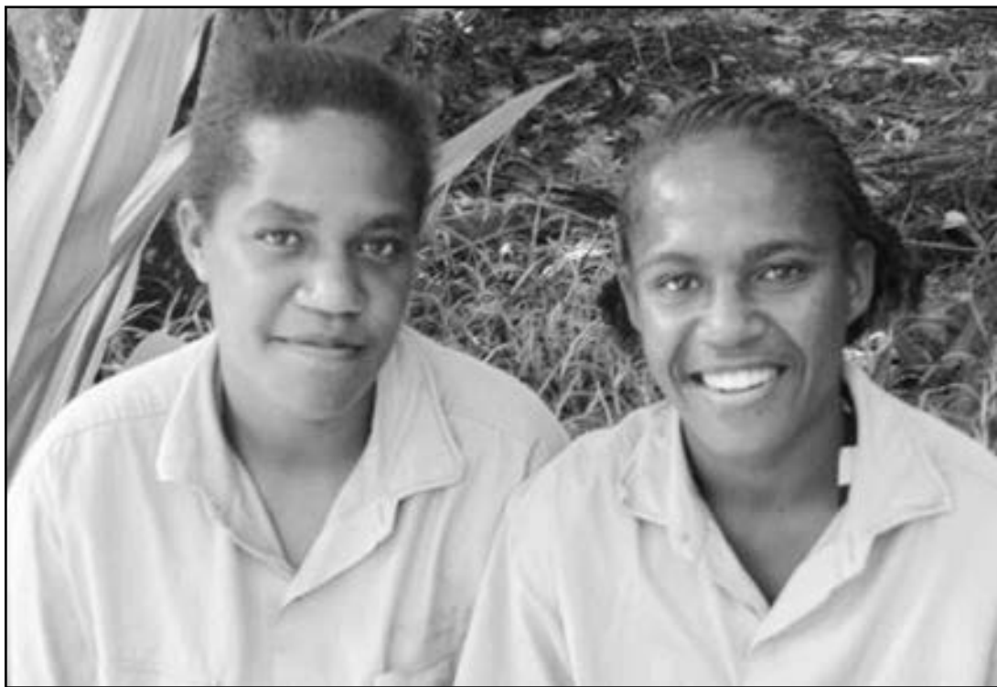
Ol yangpela meri Vanuatu..