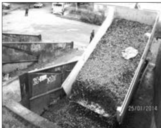
NCDC woklain i kapsaitim buai long Tapot na bi-ahin bai rola i kam krugutim ol.

Ol dispela lain polis na buai ban enfosmen lain i tok sapos ol lain long maket i autim nem bilong ol lain i salim buai, bai ol i opim maket gen. Long Tunde ol dispela lain i bung na i kisim toktok olsem bai i gat tambu