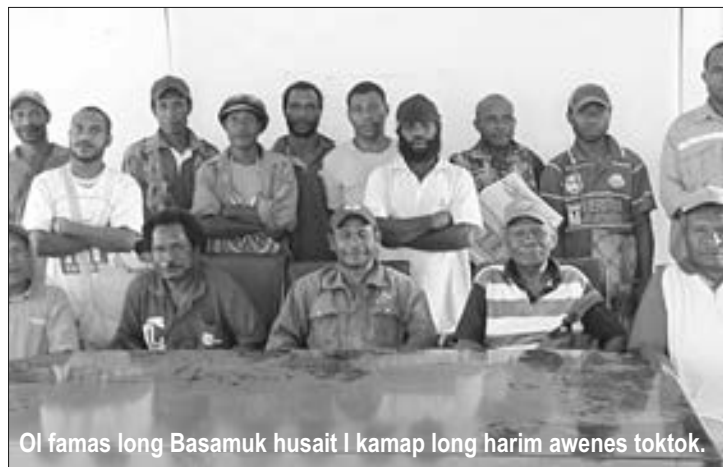
Ol famas long Basamuk husait i kamap long harim awenes toktok.