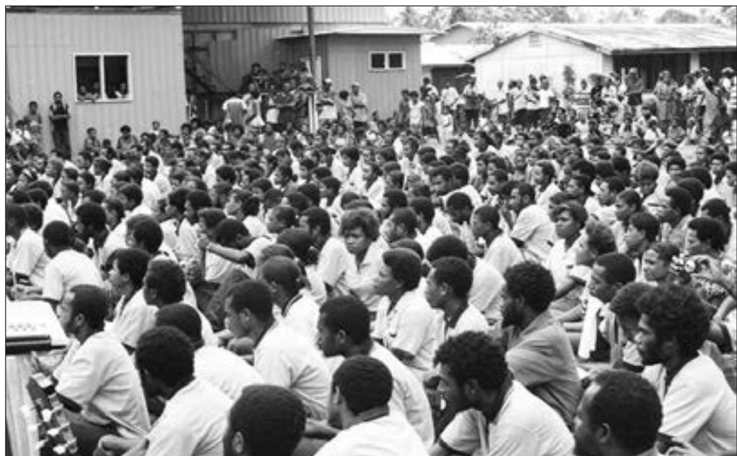
HARIM GUT: Ol sumatin bilong Dregahafen Teknikol Sekenderi Skul long Finsafen i sindaun na harim ol toktok bilong Praim Minista O'Neill taim em i lukim skul.