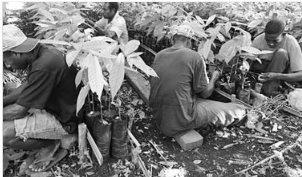
Ol badas bilong PNGCCI i bisi badaim kakao.