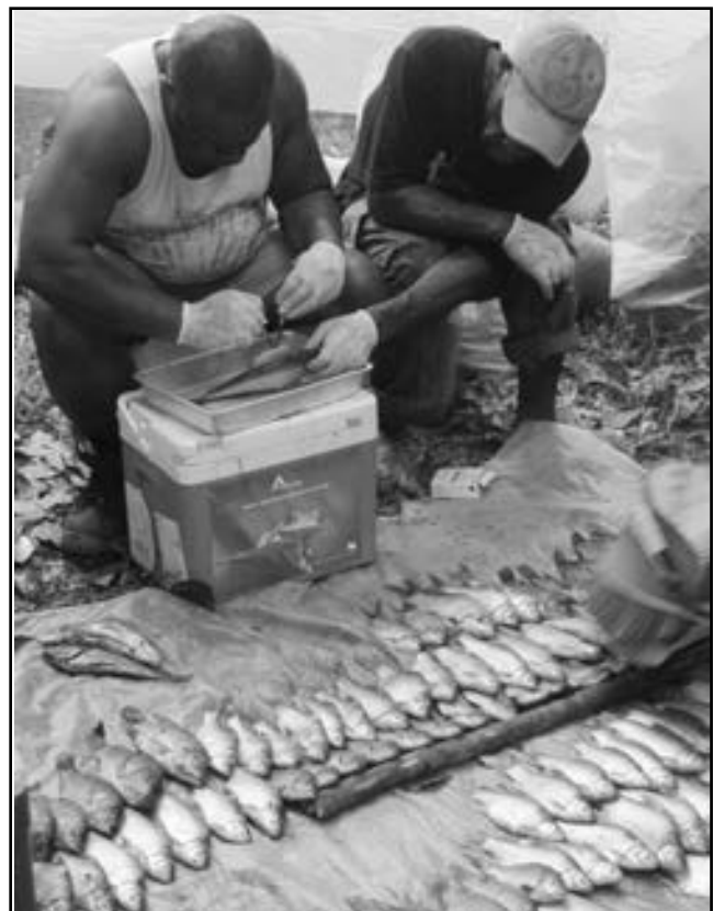
GLASIM PIS: Ol woklain bilong Outback Ecology long Madang i glasim ol Ramu pis.