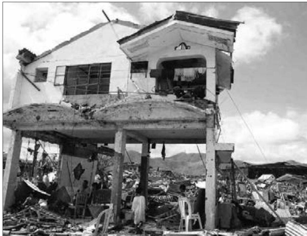
Piksa i soim ol pipel bilong Tacloban siti long Sentral Filipins bihain long Taifun Haiyan i hamaim ol.