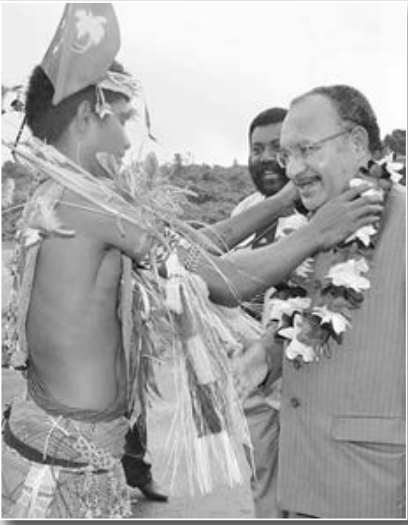
WELKAM: FINSAFEN Distrik i bin lukim Prait Minista, Peter O'Neill na delegesen bilong em i raun i go lukim ol pipel na ol wok kamap long hap long las wik. Hia yumi lukim wanpela sumatin i makim pipel na ol skul sumatin i welkamim em.