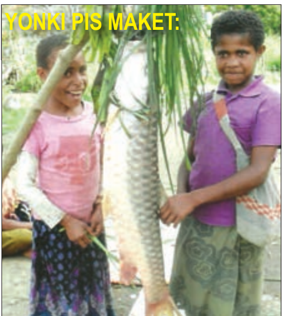
YONKI PIS MAKET: SAPLAI bilong kainkain pis long wanpela rot sait maket long Okuk Hailans Haiwe namel long Kasam Pas na Kainantu i no save ran aut. Maski sapos yu laikim pis i kuk pinis o i no kuk, pis em ol i save salim olsem ol poto i soim. Tupela pikinini meri i salim long 8 Mail maket long Yonki - Isten Hailans.