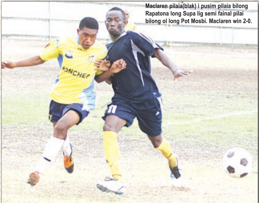
Maclaren pilaia(blak) i pusim pilaia bilong Rapatona long Supa lig semi fainal pilai bilong ol long Pot Mosbi. Maclaren win 2-0.

TOKSAVE: Salim ol spots dro bilong yu kam long Feks; 325 2579, e-mel; bveo@wantok.com.pg o kam lusim long Wantok Niuspepa opis long Able Building Complex long Central Waigani, NCD.