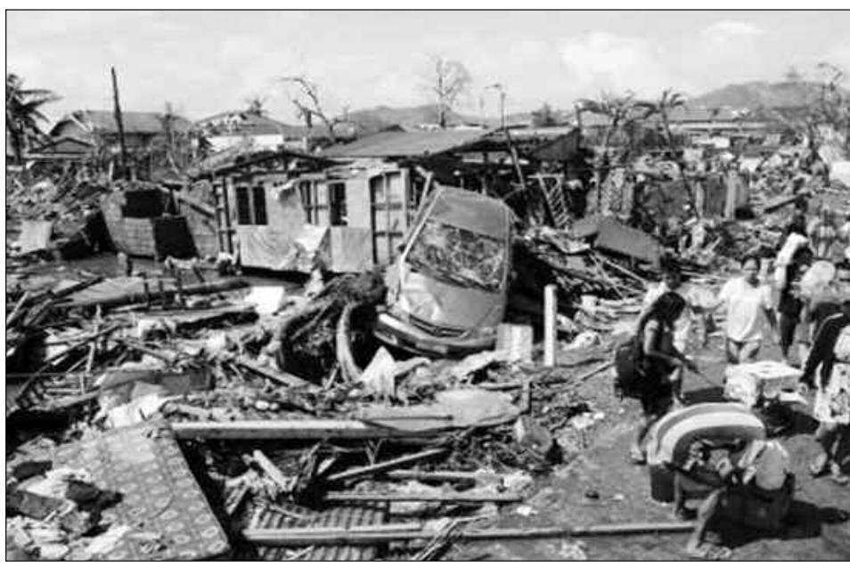
Sampela ten tausen manmeri i dai long taifun Haiyan long Filipins. Hia ples i bagarap tru na ol manmeri long ples i rausim kago na lusim ples.