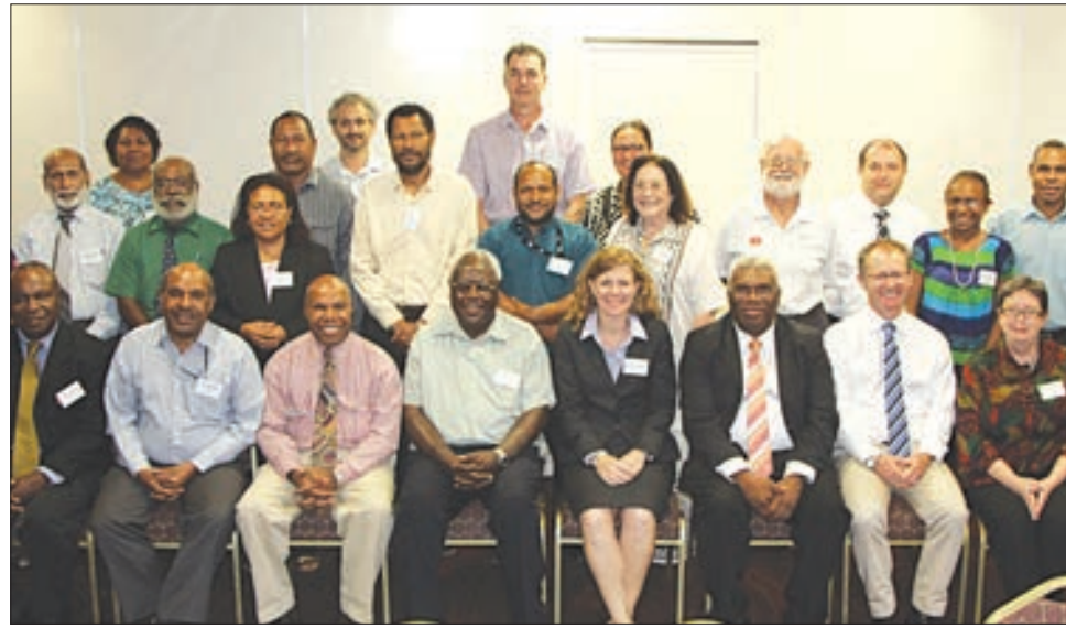
Ol senia opisa bilong tupela yunivesiti i holim woksop long Pot Mosbi.