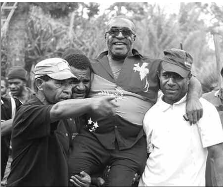
AMAMAS: Ol pipel bilong ples Waigar long Kerowagi distrik, Simbu provins i amamas na singaut bikmaus na karim Gavana bilong Morobe Kelly Naru, taim em i givim K50.000 long ol las wik Sande. Dispel mani em bilong helpim ol long luksave long sapot bilong hevi bilong graun bruk na bagarapim ol samting sikispela mun i go pinis.