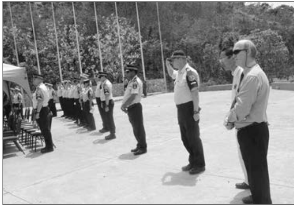
TINGIM: Dispela wik Mande 11/11/2013, i bin lukim wol i tingim ol soldia i bin dai long Wol Woa 1 o namba wan pait long wol 99 krismas i go pinis. Ol i kolim dispela de "Armistice Day" o Rimembrens de o long Tok Pisin, de bilong tingim ol lain i dai pinis. PNG, i bin tingim dispela de we ol Return Services League or RSL i bin go pas long wanpela seremoni long Ela Bis, Mosbi. Ol lain bilong ol Hai Komisin na Foren Embasi, PNG Difens Fos na ol arapela moa i bin stap insait long seremoni we ol bikman i bin mekim ol toktok na tu, putim ol plawa long tingim ol soldai i bin pait strong long fridom, demokresi na gutpela sindaun planti kantri em PNG i stap insait tu long en. Neks yia bai 100 krismas bihain long WW1.

Praim Minista bipo, Paul Keating, i givim bikipela toktok o Remembrens Adres. Em i makim 20 yia bihain long em i bin mekim bikipela toktok long makim dai bilong wanpela Soldia em ol i no save long nem bilong en o unknown Australian soldia em i bin dai long Wol Woa 1.