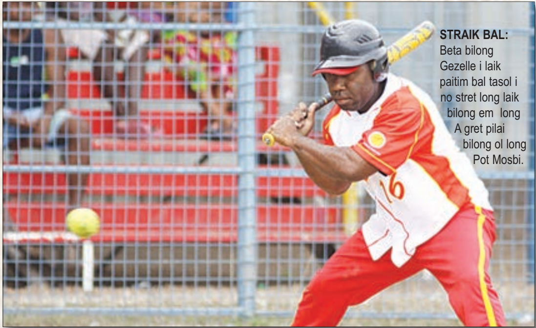
STRAIK BAL: Beta bilong Gezelle i laik paitim bal tasol i no stret long laik bilong em long A gret pilai bilong ol long Pot Mosbi.