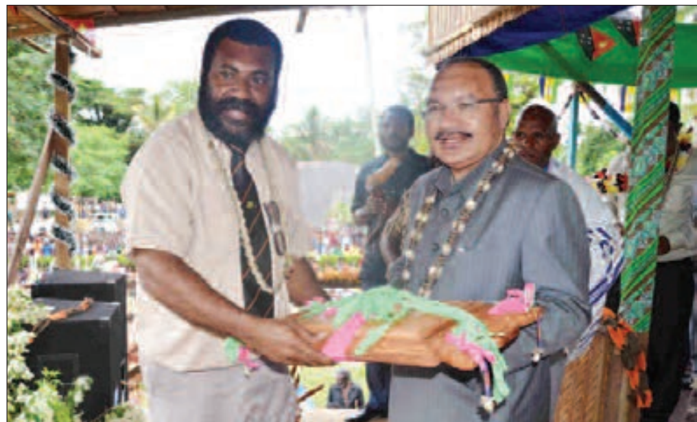
5 YIA PLEN BILONG FINSAFEN: Spika bilong Palamen na memba bilong Finsafen Zurenuoc i prisnim Finsafen 5-yia divelopmen plen i go long Praim Minista O'Neill.

Em i tok insait long las 12-pela mun, gavman i mekim sampela strongpela disisen