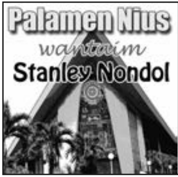
pinis long NCDC bilding bod long stopim wok developmen na tok wok