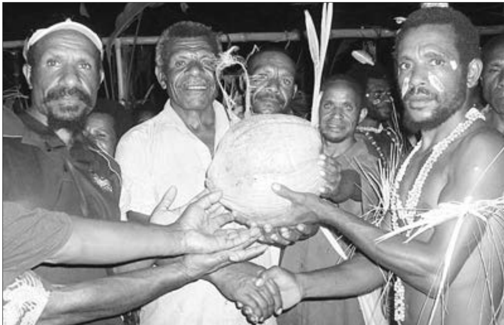
SENISIM LONG SOIM WANBEL: Ol ELC PNG lida bilong Kesowai wok misin eria i senisim kokonas wantaim ol wanlain bilong ol long Bena seket bai lukautim 2014 konprens.