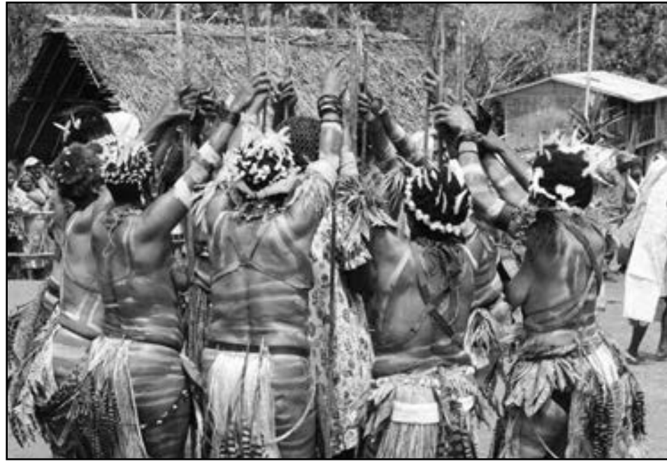
STAIL PASIN TUMBUNA: Ol meri long Leik Kutubu eria, Sauten Hailans wokim wanpela tumbuna pasin long Kundu na Digaso Festival.