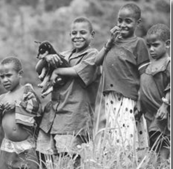
NAISPELA PLES: Faivpela pikinini na wanpela dok i amamas long raun long kol maunten ples long Goroka, Isten Hailans.