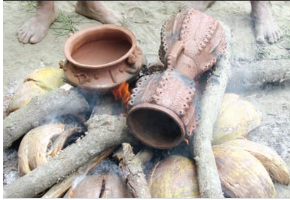
OL SOSPEN GRAUN: Ol i putim ol sospen graun na kundu antap long paia long strongim ol.