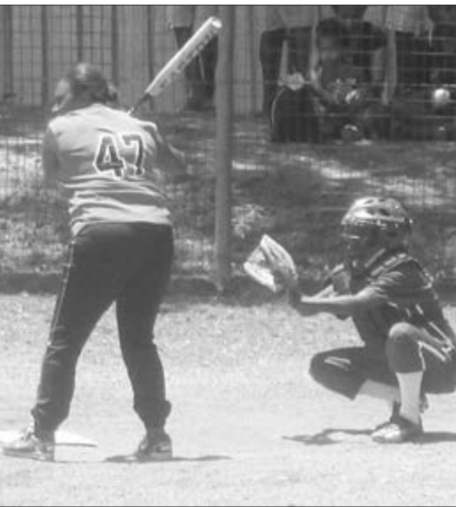
Namba 47 bilong ol Wulf i redi long paitim bal.

Na long las ining, ol Wulf i mekim sampela moa ran long winim gem.