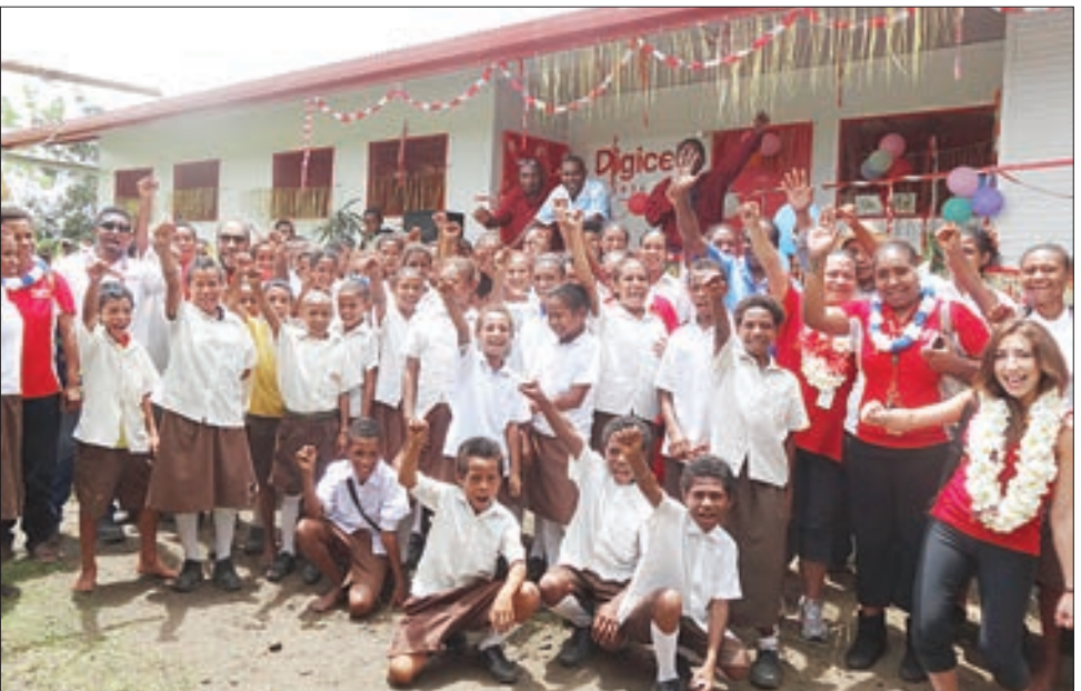
Sivitatana sumatin wantaim Digicel Faundesen tim

Dispela sik bilong bel em i no stap ples klia tumas tasol em i save kilim planti lain long PNG.