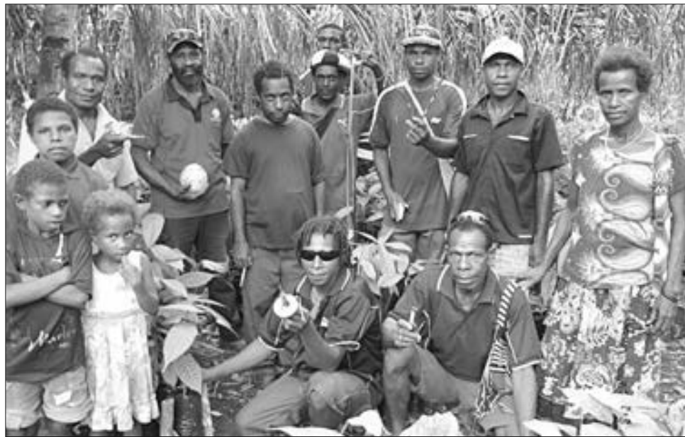
Ol badas bilong PNGCCI wantaim kakao famas long Basamuk.

Ol fama i amamas na i holim wanpela miting na i makim wanpela interim ofis aninit long nem Basamuk Kakao Koporetiv Sosaiti wantaim helpim bilong Ramu NiCo Komyuniti Afes fil ekstensen ofisa em ol i makim em olsem interim siaman long helpim wok long pastaim i go inap ol kamapim stret koporetiv sosaiti.