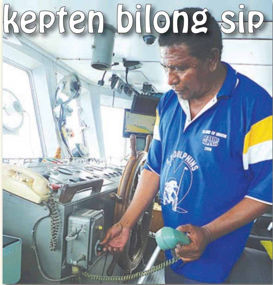
Kapten Kari i soim ol kain pon ol i yusim antap long sip.

Em i tok planti yangpela man na meri save pinisim skul tude na ting olsem ol i gat save na laik painim gutpela wok