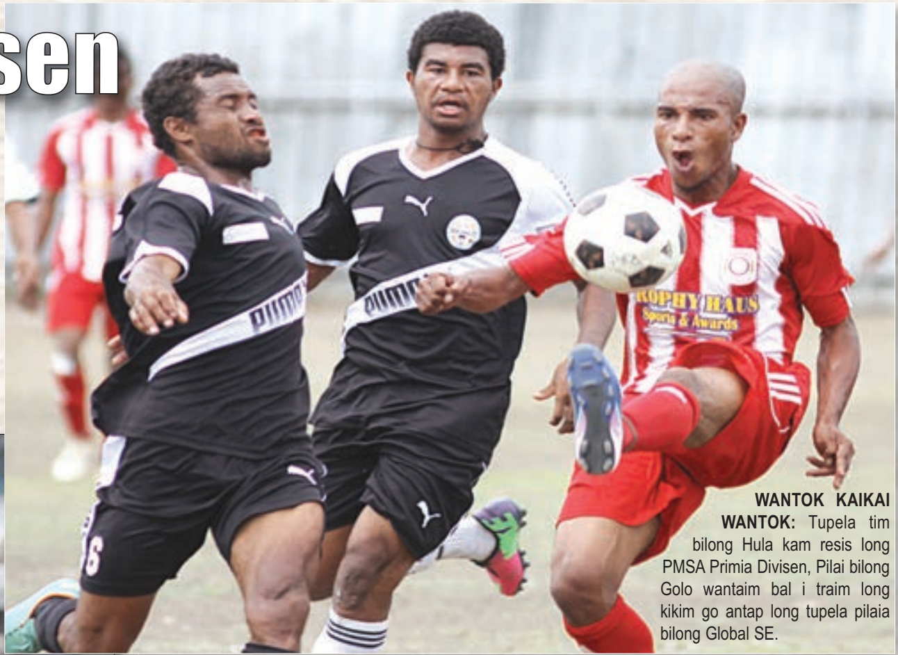
WANTOK KAIKAI WANTOK: Tupela tim bilong Hula kam resis long PMSA Primia Divisen, Pilai bilong Golo wantaim bal i traim long kikim go antap long tupela pilaia bilong Global SE.