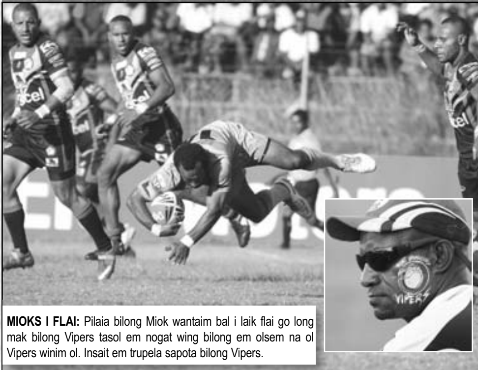
MIOKS I FLAI: Pilaia bilong Miok wantaim bal i laik flai go long mak bilong Vipers tasol em nogat wing bilong em olsem na ol Vipers winim ol. Insait em trupela sapota bilong Vipers.