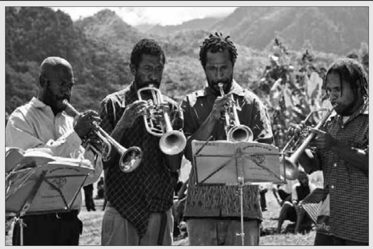
PILAIM TRAMPET: Ol yangpela bilong Luteran Sios Musik Ministri i pilaim nesanel entem musik bilong ol long brukim graun seremoni we i makim konprens bilong ol Luteran Sios meri long Boana Distrik, Morobe Provins.

ADB i bin stat long 1966 na i gat 67 momba kantri, 48-pela em i kam long Esia-Pasifik risen yet. insait long yia 2012, ADB i bin helpim ol kantri long risen wantaim mani mak long $21.6 bilian, $8.3 bilian em ol i bungim wantaim arapela dona oganaisesen long mekim wok.