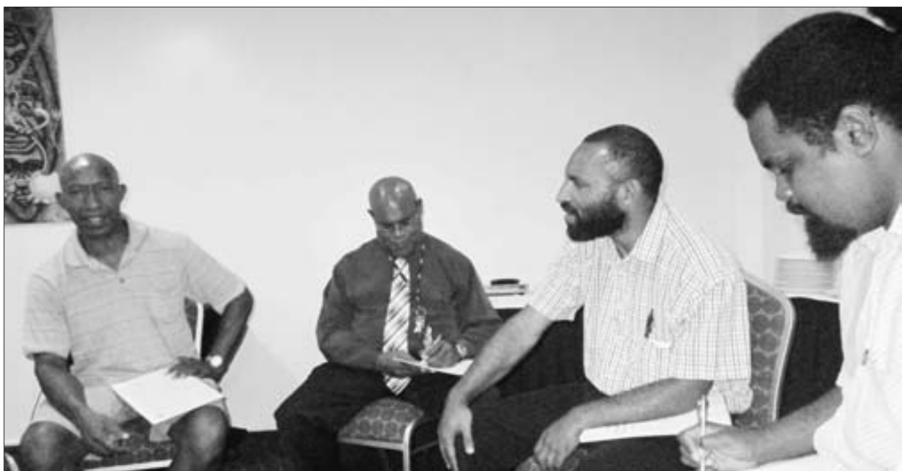
DISKASEN GRUP: Wanpela grup i toktok na bungim ol tingting long kirapim bek Famili Sapot Grup bilong helpim ol yangpela pikinini i gat sik long tingting.

lotu na saplen, pater, ministra o pasto long Laloki bilong givim spirituel helpim na gutpela stiatok i go long ol siklain, ol woklain na komyuniti long Laloki.