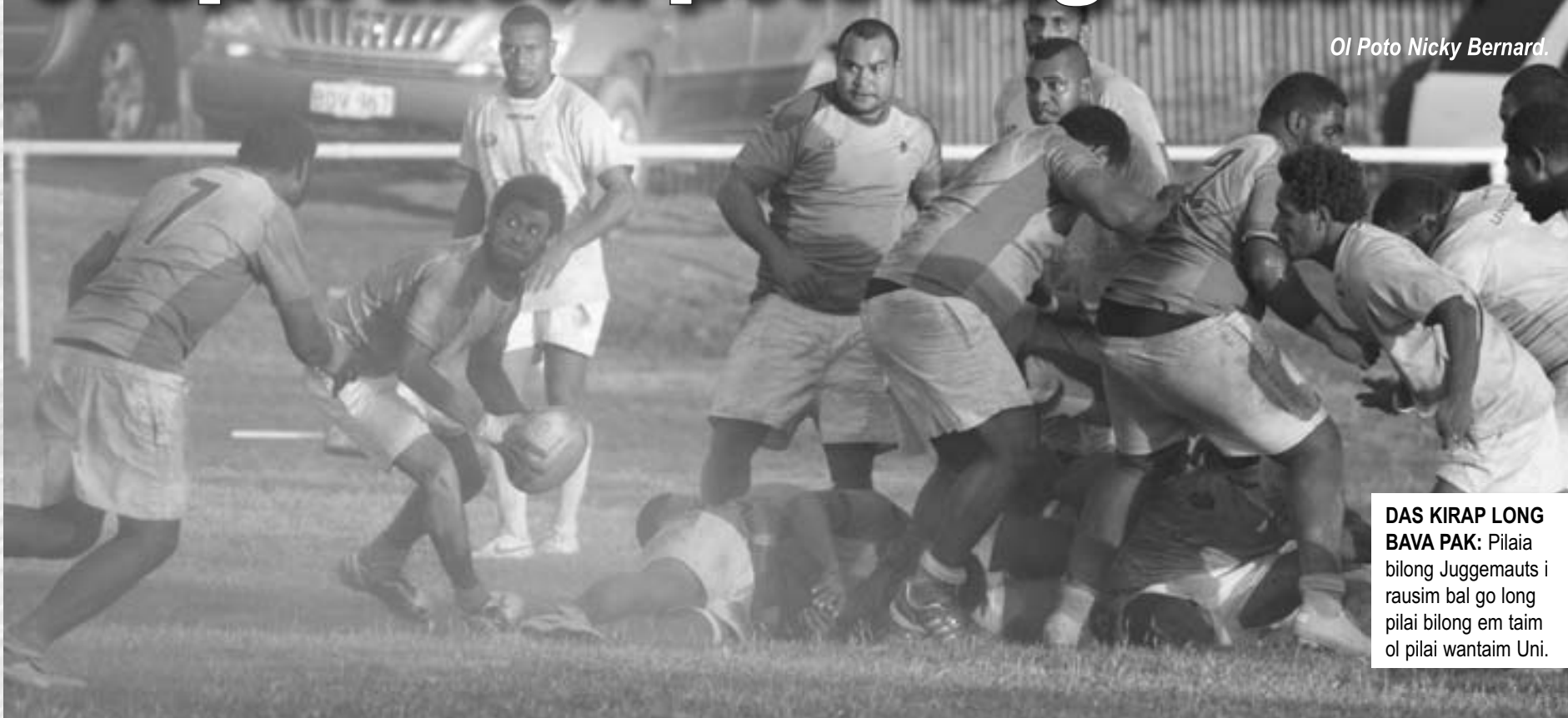
DAS KIRAP LONG BAVA PAK: Pilaia bilong Juggernauts i rausim bal go long pilai bilong em taim ol pilai wantaim Uni.