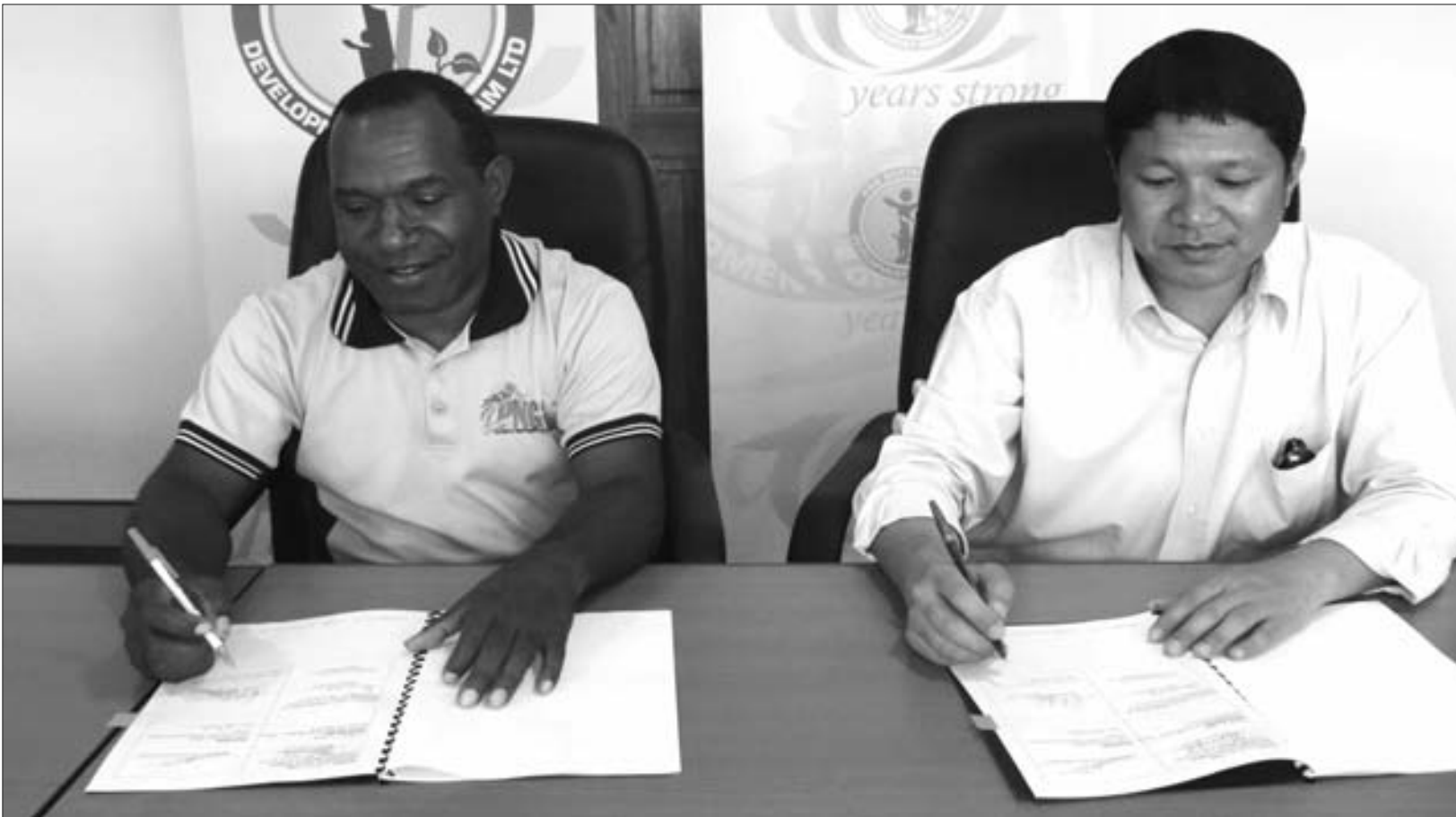
SAINING: Ol opisek bilong Baptis Yunien n a PNGSDP i sainim agrimen long Mande.