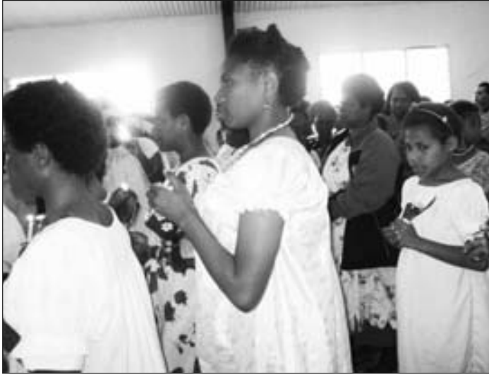
SIOS SEVIS: Stat bilong lotu sevis na ol lain yangpela i wokim proseso i holim ol kendel na go insait long haus lotu.

O'Neill /Dion Gavman i gat bikipela wari long pasin bilong stilim mani na yusim krangi ol mani bilong ol pablik progrem ol i fandim pinis. Dispela i mekim na Dipatmen bilong Nesenel Plening i putim sampela banis na wanpela long ol em long rivyuwim o glasim ol progrem bilong gavman.