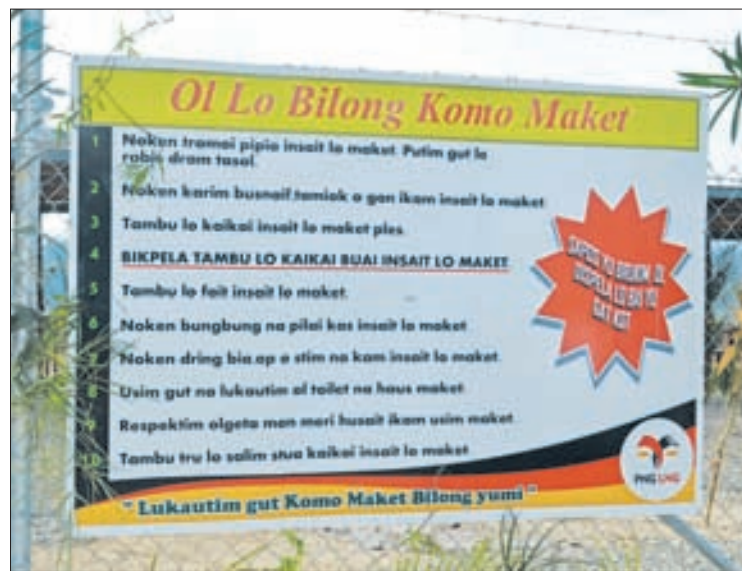
MAKET LOA: Em nau, dispela ol maket loa i bilong gutpela long olgeta Bihainim na ol samting bai ron gut tasol.

Ol opisa i go pas long ol ekstensen sevis long agrikalna ministri bilong Kiribati na Tuvalu i bin stap tu long dispela trening woksop.