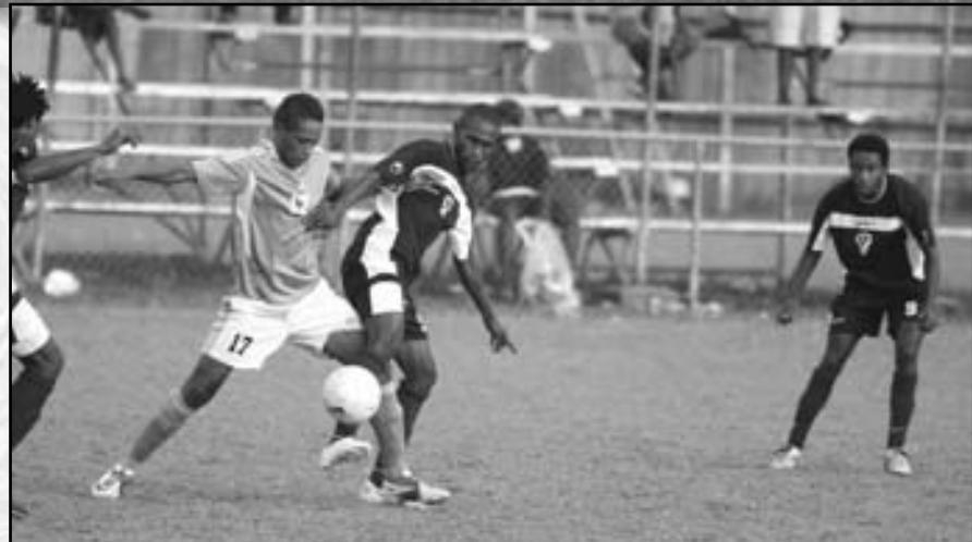
Pilaia bilong Mungkas (17) wantaim bal i traim long abrusim Yamaros pilai long MSL pilai bilong ol long Bisini.