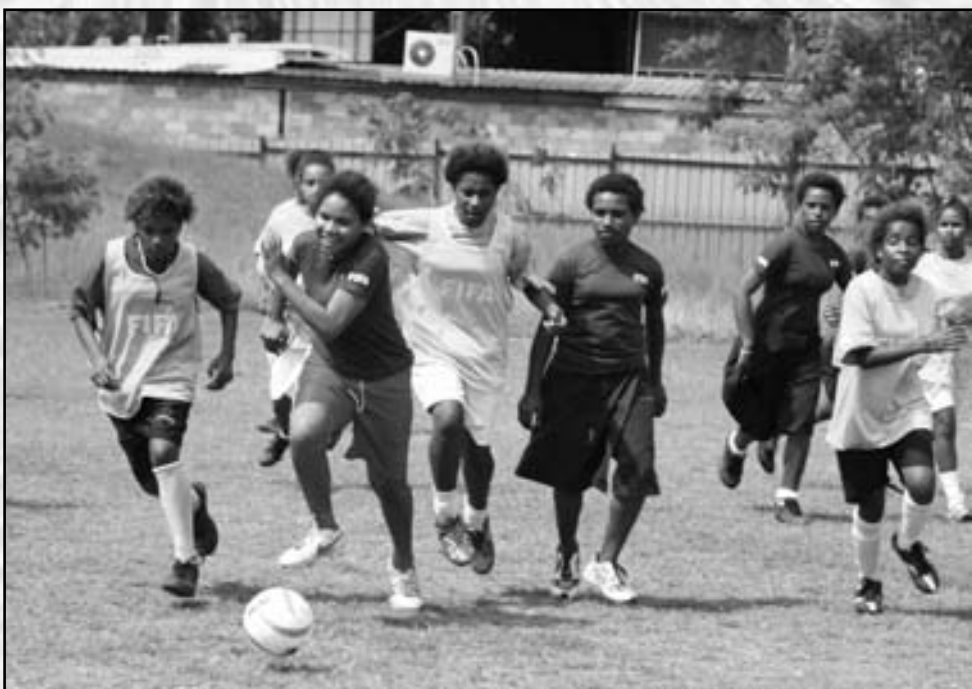
FIFA kanivol bilong ol meri long Se John Gais Stadium. Dispela soka kanivol em bilong lainim ol meri krismas bilong 10 na i go inap long 16-pela krismas long save long we bilong pilai soka.