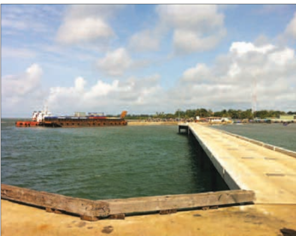
NUPELA BRIS BAI HELPIM DARU: Hia em nupela Trestle Bris bai helpim ol pipel na Daru i lukim sampela developmen.

PNGSDP i wok long fandim ol narapela bikpela projek long Daru. Wok i stat pinis long Daru wara saplai na surij apgret bai kos samting olsem K52 milian long bildim.