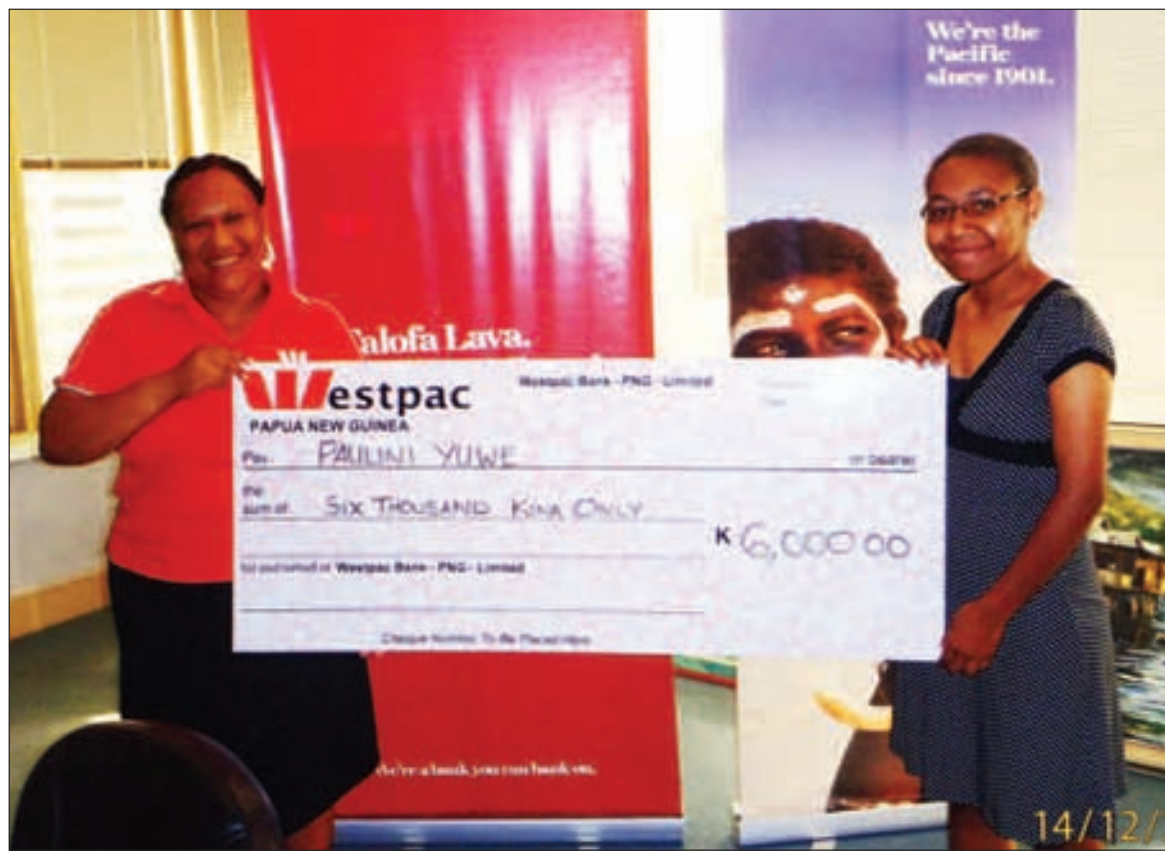
Westpac Benk wokmeri soim giaman sek bilong K6,000 gren we wanwan wina bai winim long edukesen gren.