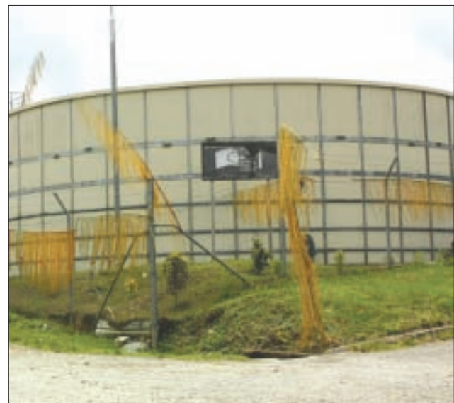
MAPRIK WARATENG: Hia em bikpela teng i holim wara bilong Maprik taun em Yuropien Yunien i bin fandim na lonsim long las wik.