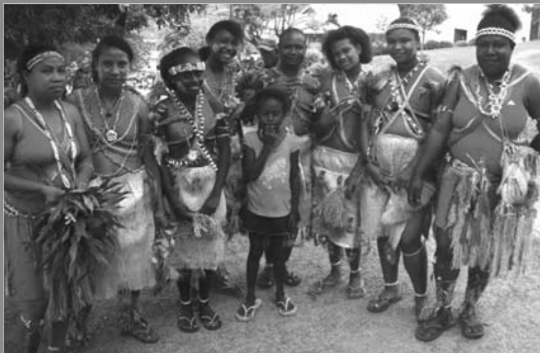
REDI: Ol yangpela meri perisina bilong Kingfisa Liteji grup bilong Sen Peter Sanel Erima Peris, i redi long putim kamap samsam danis bilong ol long selebretim pestode bilong petron Santu, Santu Peter Sanel long Epril 28, 2013.