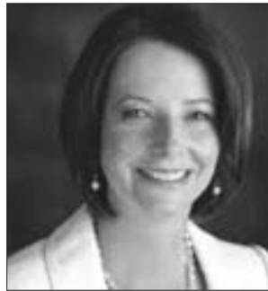
PRAIM MINISTA BILONG AUSTRALIA: Julia Gillard

TUDE Mei 11, bai lukim Praim Minista (PM) na namba wan meri PM bilong Australia i krugutim PNG long tripela de wokabaut na lukluk raun bilong em.