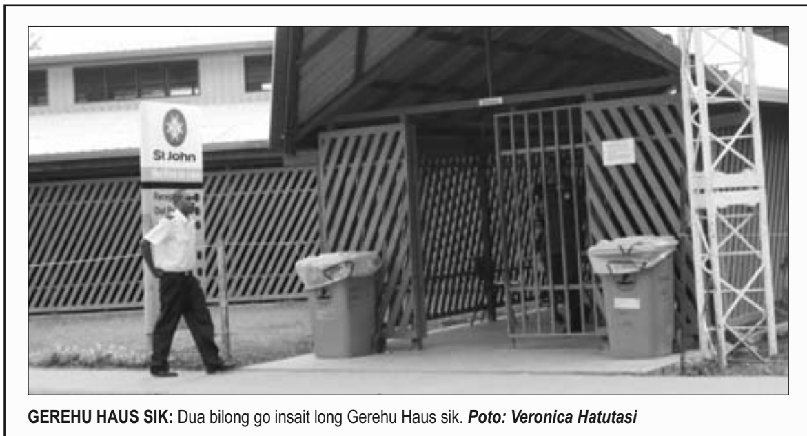
GEREHU HAUS SIK: Dua bilong go insait long Gerehu Haus sik.

Kot bilong Bulolo taunsip bai kamap long narapela taim bihain. Ol manmeri i ting olsem dispela kot tu bai kamap long dispela taim tasol, kot i tok dispela disisen bilong graun bai kamap long narapela taim bihain.