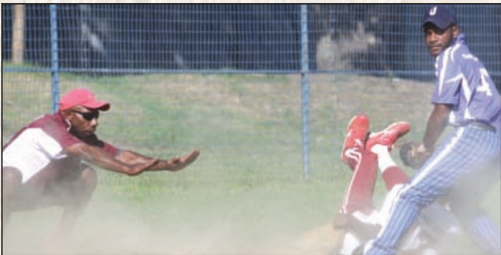
HOLIM LONG HAP: Rana bilong Eagles i kisim bes hariap tru taim pilaia bilong Bradas i traim long autim em.