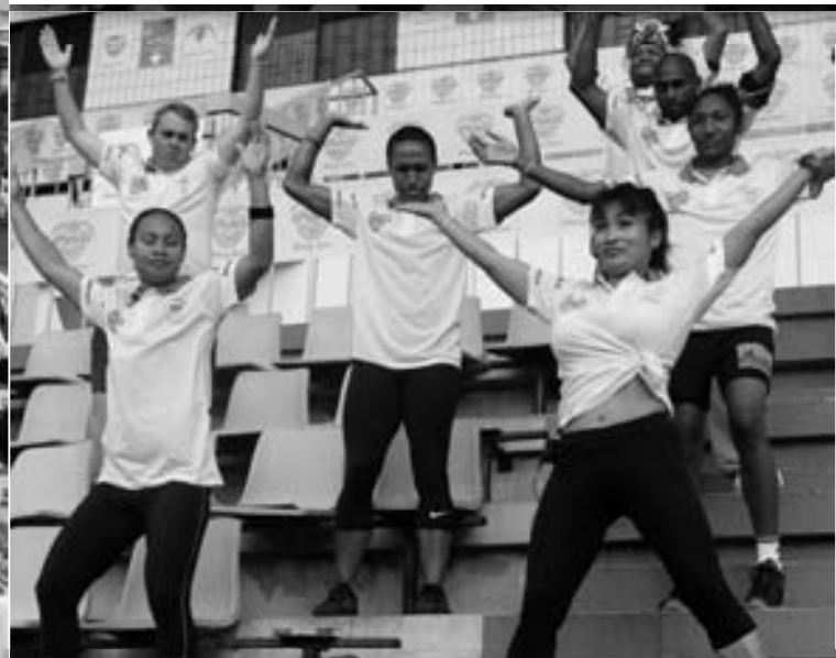
HATIM SKIN: Sampela ol PNG etlit bilong 2012 Olimpik Gems i go pas long sampela liklik ekseis long hatim skin bipo long Fun Run i stat long Mosbi las yia.