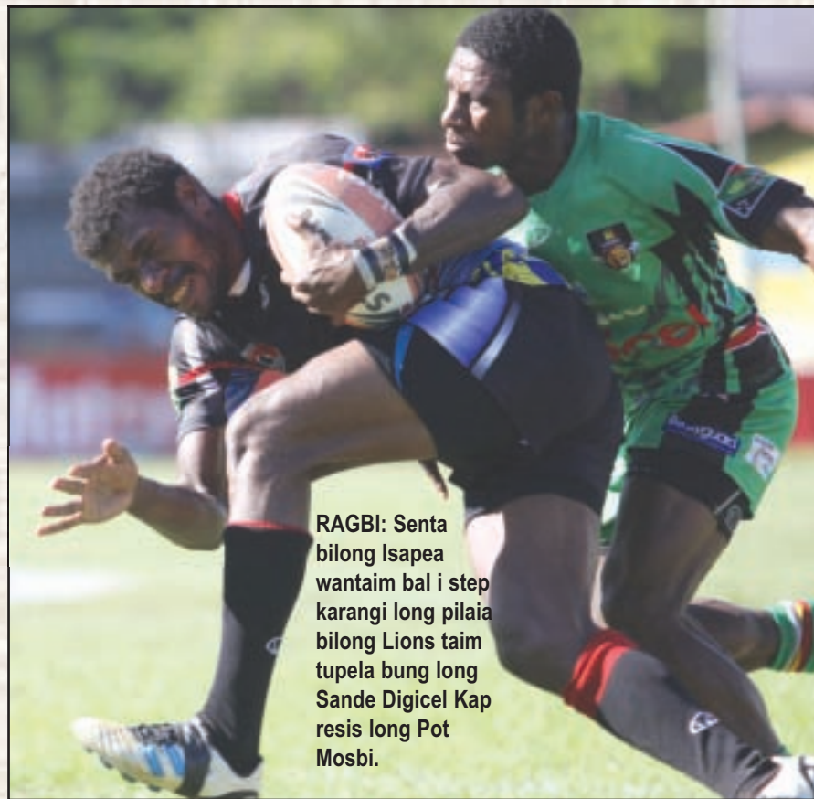
RAGBI: Senta bilong Isapea wantaim bal i step karangi long pilaia bilong Lions taim tupela bung long Sande Digicel Kap resis long Pot Mosbi.