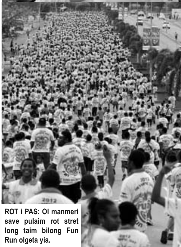
ROT i PAS: Ol manmeri save pulaim rot stret long taim bilong Fun Run olgeta yia.