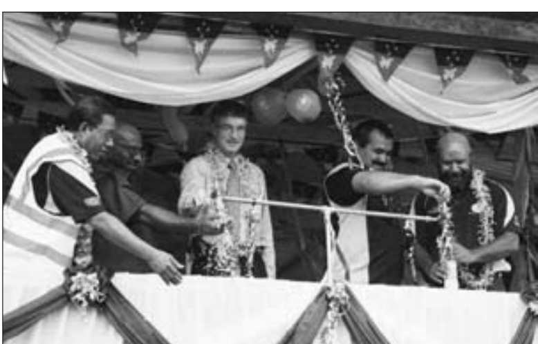
Wanpela wok mak bilong EU long makim 63yia long wokbung wantaim 27 kantri ananit long European Union.

Namba wan bikpela pait long wol (WW1) na namba tu bikpela pait (WW2) i bin stat long Europ na bihain i go long olgeta hap bilong graun, olsem na Schumann i kirap na i tok inap long kamapim pait na ol kantri bilong Europ i mas bung wantaim, paitim toktok na helpim ol yet. Nau EU em i wanpela gutpela poroman bilong PNG na ol arapela kantri long wol long bringim bel isi