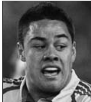
HAYNE GAT SANS: Fulbek o wing?

Uate i bin pilai long gem wan na tu las yia, tasol ol i rausim em long gem namba 3 long Brisben.