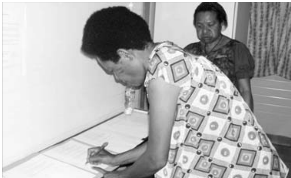
Wanpela wimen LOA eksekutiv bilong Kostal Paipain i sainim pepa.