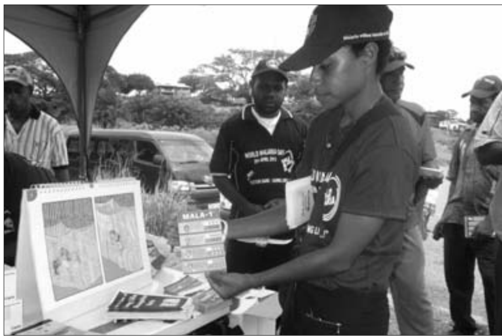
Wokmeri bilong NCD Helt soim skin pas bilong putim MALA-1 saplai taim sikman i go kisim marasin long Wol Malaria De

Ol i ripotim tu sik ya long Is Nu Briten na Morobe Provins.