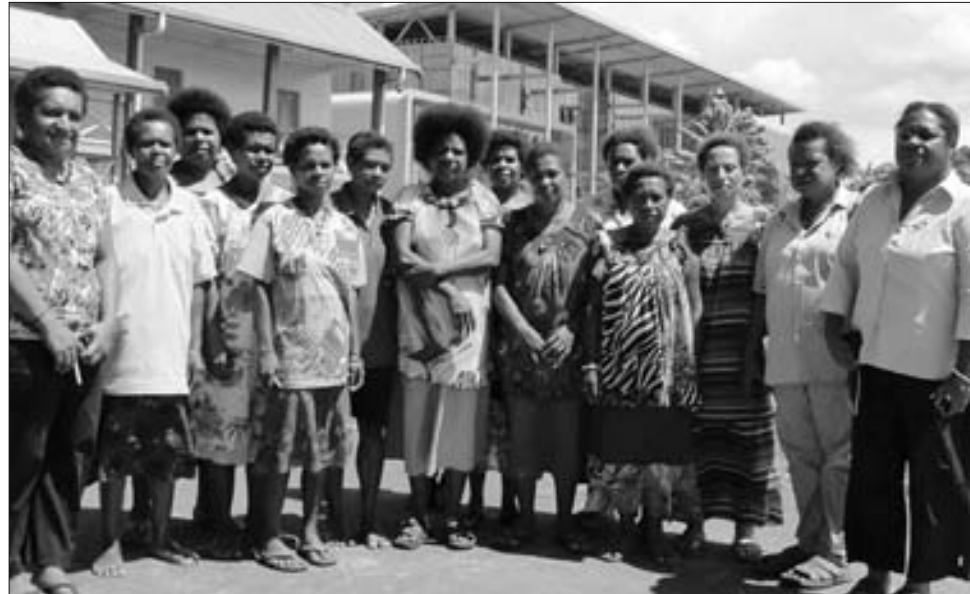
Ol wimen LOA eksekutiv wantaim ol lain trena long Madang i sanap long grup foto.