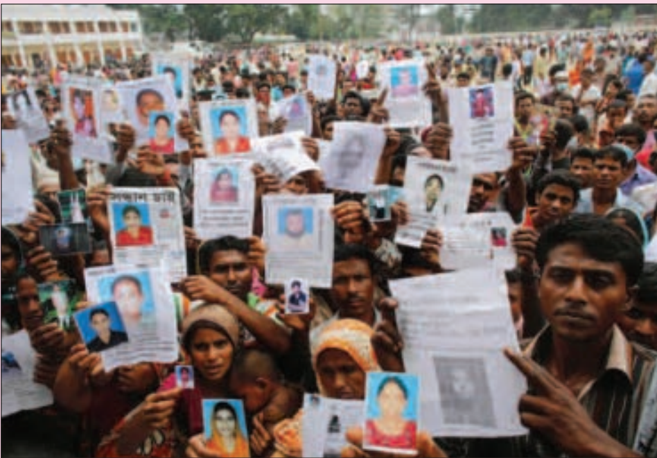
PAINIM FAMILI: Ol lain famili bilong ol wokmanmeri long wanpela klos fektori i holim ol poto na piksa bilong ol wanfamili bilong ol bihain long bikpela bilding we ol i wok long en, Rana Plaza bilding i bin bruk i go daun long Sande.