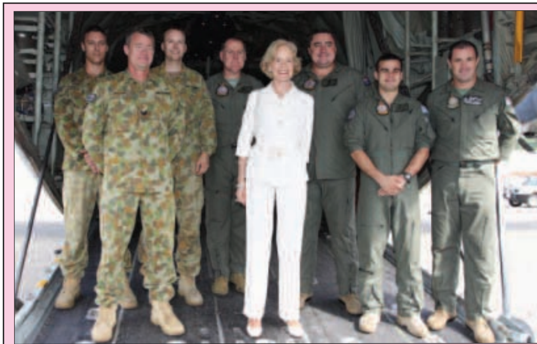
KAM BEK: Gavana Jenerel bilong Australia, Quentin Bryce i kalap long ami balus bilong Australia long go long Alotau tasol bikpela ren na em kam bek long Pot Mosbi, em sanap wantaim Pilot bilong balus na ol wokman bilong em long beksait bilong dua i op.

Wantaim 45 bebi i dai taim mama i karim long mak bilong 1,000 laip bebi na tu, 230 mama i karim i dai long mak bilong 100,000 laip mama, PNG i kamap namba wan kantri insait long Pasifik rijen wantaim dispela hevi.