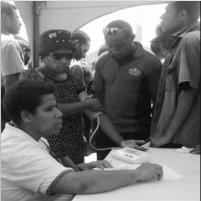
St. John Ambulens Klinik nes sekim mak bilong blut bilong ol pablik long Gordons maket.