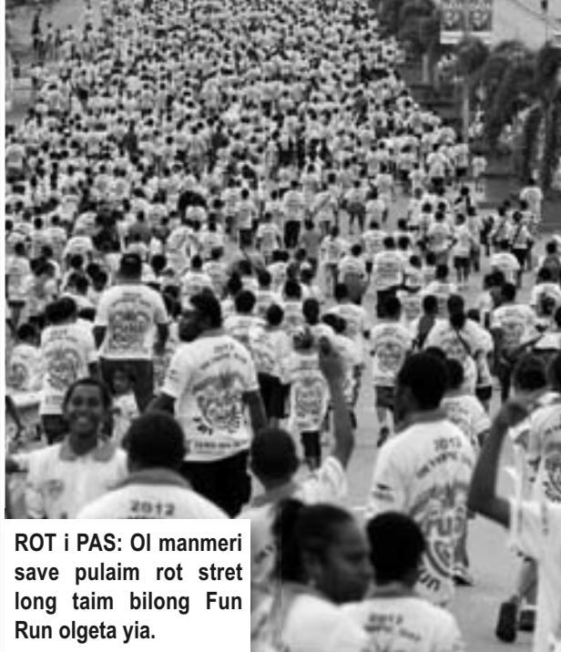
ROT i PAS: Ol manmeri save pulaim rot stret long taim bilong Fun Run olgeta yia.