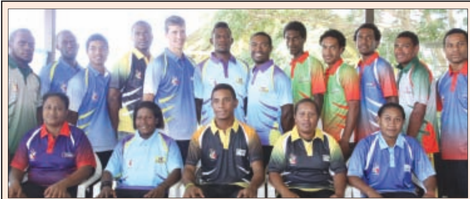
Olgeta kepten bilong kriket we ol pilai long Hebou Sil.

Dispela nupela banis simen i gat ples bilong salim na baim ticket, i gat ol sain bod sapos yu putim nem bilong kampani bilong yu na tu em hantap moa we ol man i no inap go antap long en.