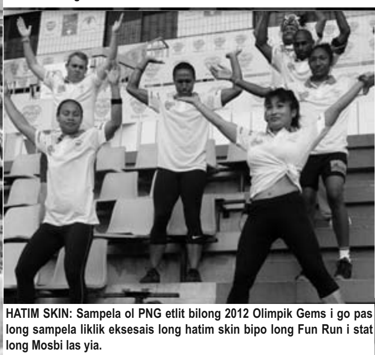
HATIM SKIN: Sampela ol PNG etlit bilong 2012 Olimpik Gems i go pas long sampela liklik ekseis long hatim skin bipo long Fun Run i stat long Mosbi las yia.