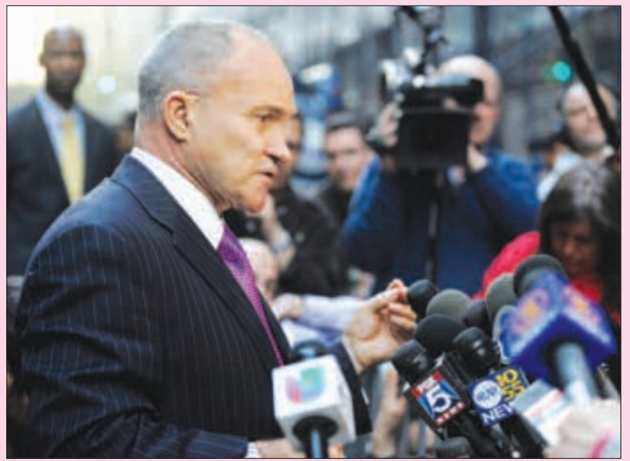
WIL BILONG 9-11 BALUS SOIM PES: Polis Komisina bilong Nu Yok (New York), Raymond Kelly i tokaut long ol nius midia long fran bilong 51 Park Place, we ol i painim wanpela wil bilong wanpela long ol bikpela balus ol teroris i bin yusim long pasin terorisim long Septemba 11, 2001. Dispela wil em ol i painim i bin pundaun na pas long baksait bilong bilding i sanap baksait long en long 50 Murray Street long Manhattan. (POTO: AAP IMAGES)