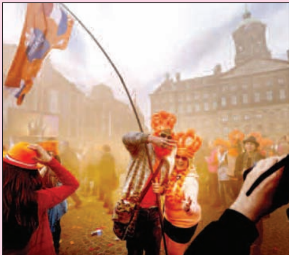
AMAMAS LONG KING: Ol pipel bilong kantri Netalens (Netherlands) i selebretim nupela king bilong ol, Willem-Alexander, long Tunde dispela wik.