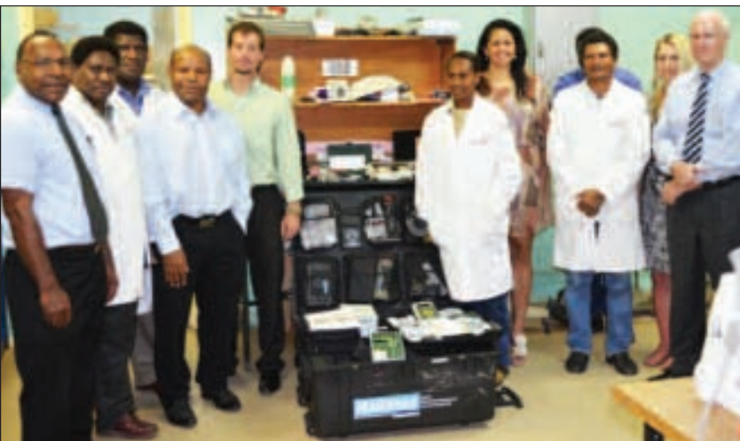
GIVIM LONG HELPIM: Ol lain teknisen i kisim ol nupela masin na ol narapeala samting moa i sanap wantaim ol lain long EHL long taim bilong prisening ol masin.

Antap long ol masin ol teknisen i kisim, ol i givim tu ol anestetik masin, ol ventileta, ol monita long sekim ol sik-lain long bet, ol masin long kipim ol nupela bebi i no taim bilong ol yet na mama i karim, ol masin bilong monitaim ol na ol steralaisa.