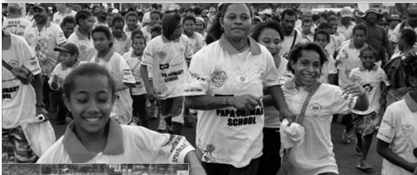
RESIS: Ol manmeri amamas long bung wantaim na ron long 2012 Trukai Fun Run long Mosbi.