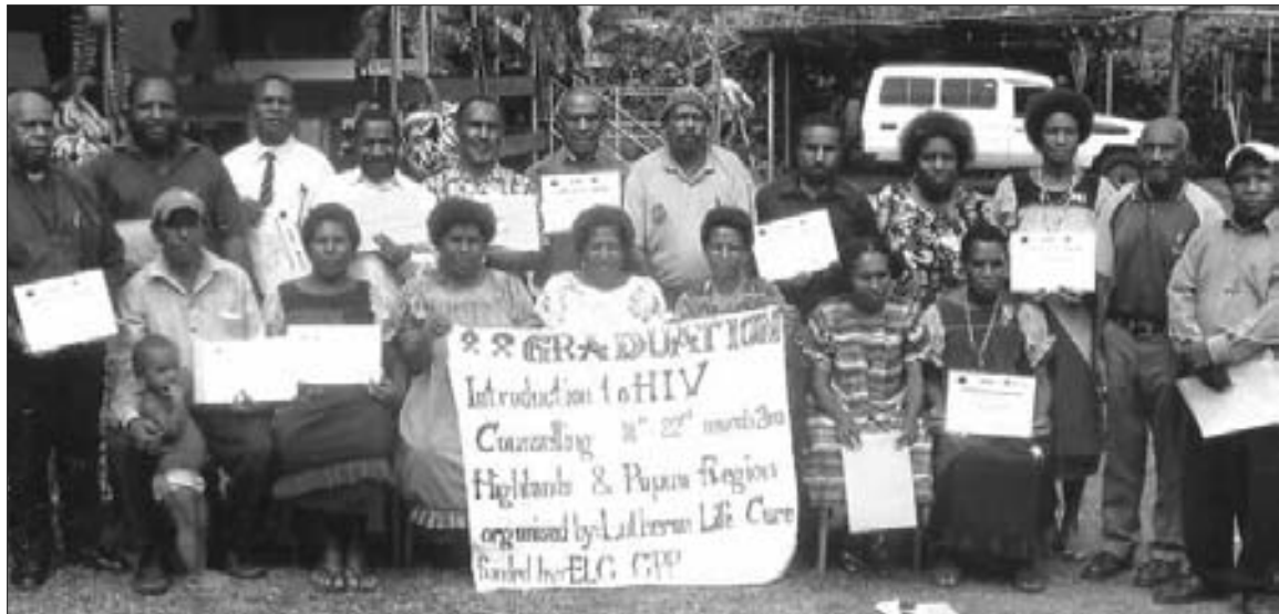
KISIM KAUNSELING TRENING: Ol woka na leiman-meri bilong ELCPNG husat i bin kamap na sindaun long wan wik HIV/AIDS Kaunseling trening woksop long Goroka, Isten Hailans long las mun.

LLC i luksave long dispela hevi bikos i no gat gutpela wok kaunseling olsem na em i bin kirapim wanpela wan-wik trening woksop long Goroka, Isten Hailans we ol