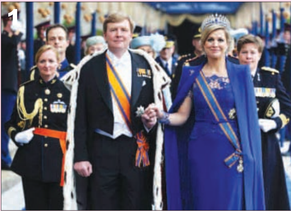
KING WILLEM NA KWIN MAXIMA: King Willem-Alexander na meri bilong em Kwin Maxima bilong kantri Netalens i wokabaut bihain long ol i go long lotu long Neuwe Kerk sios long Amsterdam long Tunde. Netalens i selebretim Kwins De bilong ol long Tunde, we i makim lusim wok bilong Kwin Beatrix na luksave na makim bilong namba wan pikinini man bilong em, Willem-Alexander.