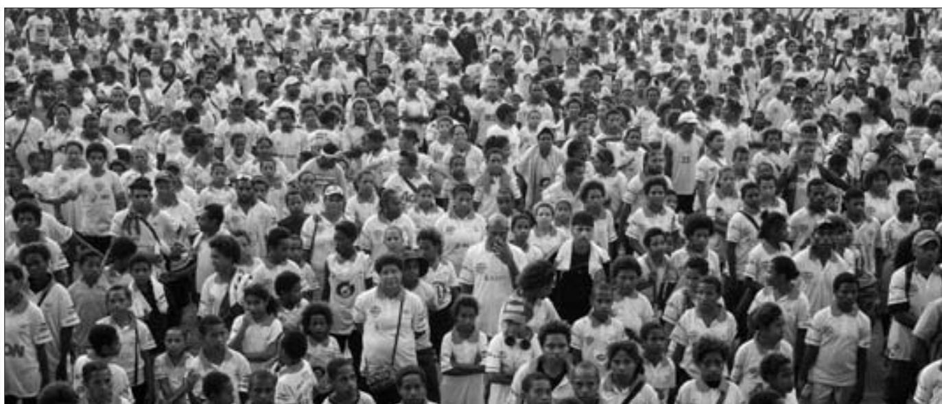
PLES i PAS: Ol manmeri pulap long Sir John Guise stedium long Mosbi long 2012 long sap insait long Trukai Fun Run resis.

Long taim bilong Trukai Fun Run, olgeta manmeri husat i laik stap insait long dispela