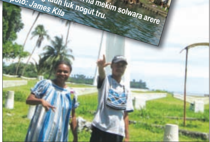
Gras i gro arere long Kalibobo lait-haus. Husat save klinim?

stat long Tusbab Bis i go olgeta long Kalibobo na i go olgeta long Madang Risot Hotel i no moa klin olsem bipo.