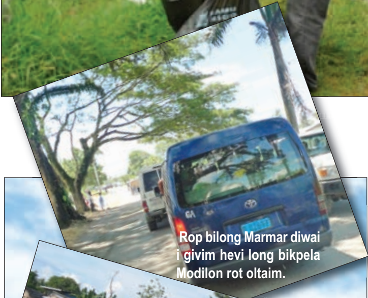
Rop bilong Marmar diwai i givim hevi long bikpela Modilon rot oltaim.