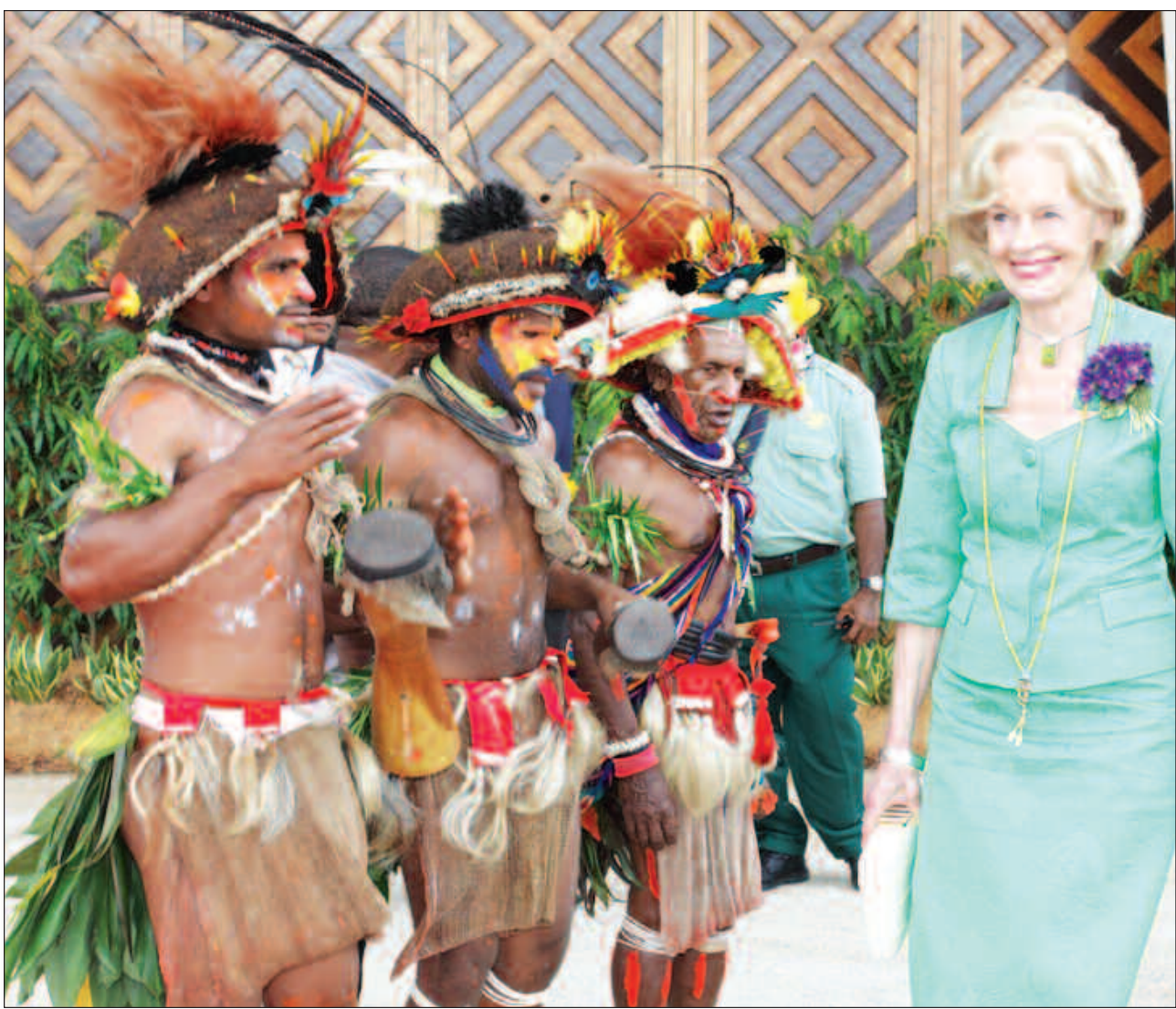
WIGMEN WELKAM: Gavana Jenerel bilong Australia, Quentin Bryce i lukluk long ol Hela Wigmen taim em go raun long Palamen long Trinde dispela wik.

Laiptail stori long graun bruk long Kawarwa ples long Madang... P15