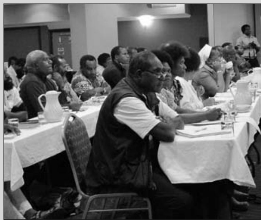
SIOS MEDIKEL KAUNSAI BUNG: Sampela long moa long 200 wok manmeri bilong Sios Medikal Kaunsel i bin sindaun long wanpela wik Anuel Jenerel bung bilong ol long las wik long Holide In, Pot Mosbi.

Lidaman i tok i no gutpela long sampela sios i tok baksait long Katolik Sios, tasol long ol lain husat i save autim tok long go aut na kisim i kam insait long sios ol lain tematan o dispela i no save yet long God.