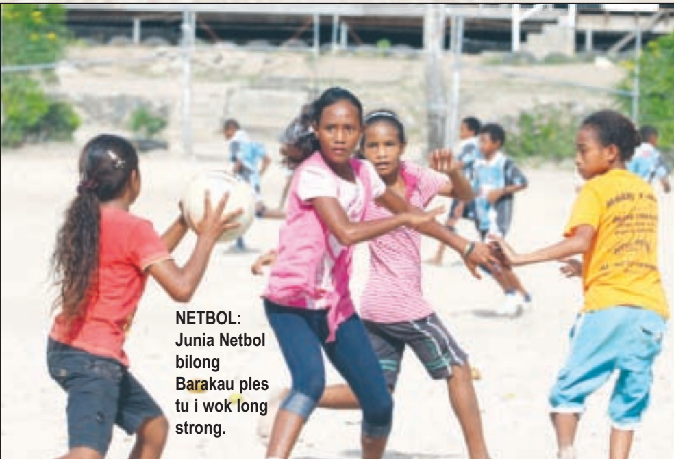
NETBOL: Junia Netbol bilong Barakau ples tu i wok long strong.

TOKSAVE: Salim ol spots dro bilong yu kam long Feks; 325 2579, e-mel; bveo@wantok.com.pg o kam lusim long Wantok Niuspepa opis long Able Building Complex long Central Waigani, NCD.