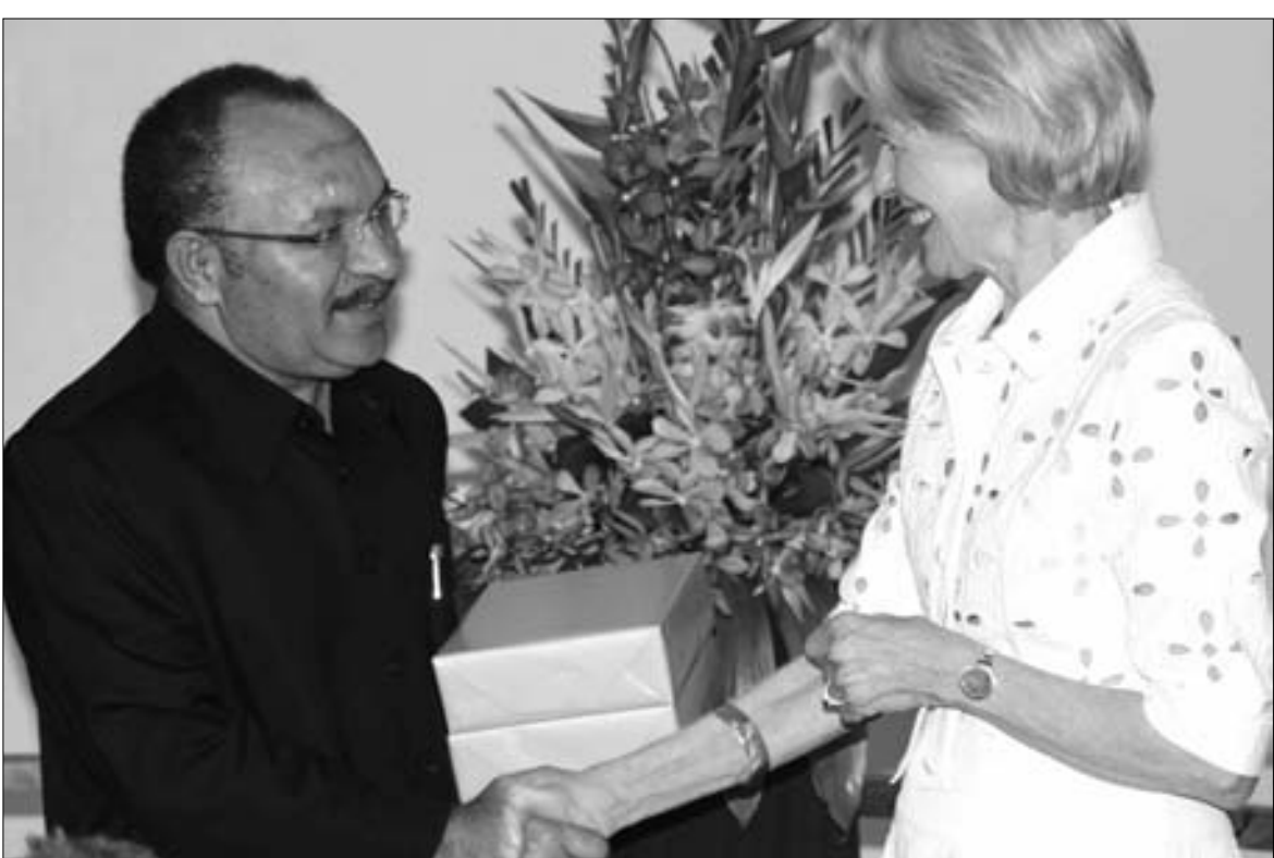
TUPELA LIDA BUNG: Praim Minista Peter O'Neill i bungim na welkamim GG Quentin Bryce taim em kamap long kantri long dispela wik Mande.

Luteran Sios em i wanpela bikipela sios insait long kantri, bihainim Katolik, na i save kamapim planti wok bisnis na tu, bihainim plen bilong kantri na developim kantri.