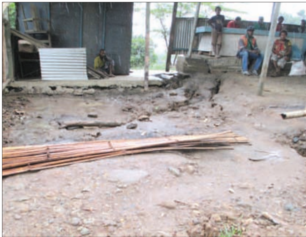
Graun bruk na simen long haus-maket tu i bruk long Kawawar maket long Madang-Ramu Haiwe.