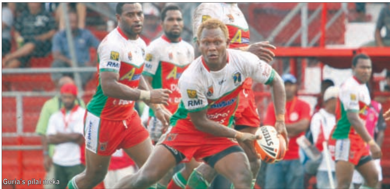
Guria's pilai meka