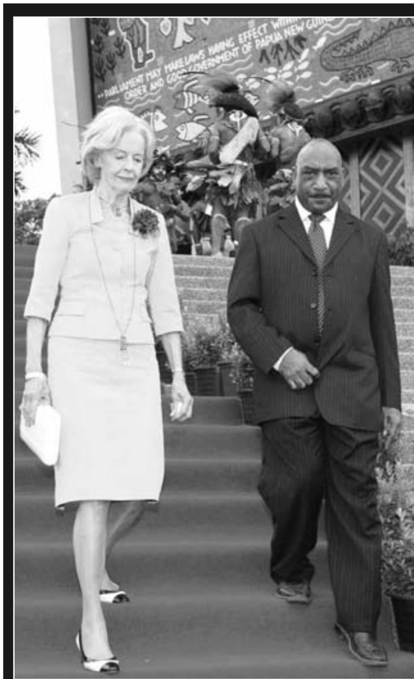
Ret Kapet: Gavana Jenerel bilong Australia Quentin Bryce i wok-about kam aut long palamen haus antap long retpela kapet wantaim wanpela protokol opisa bilong gavman long Trinde dispela wik.