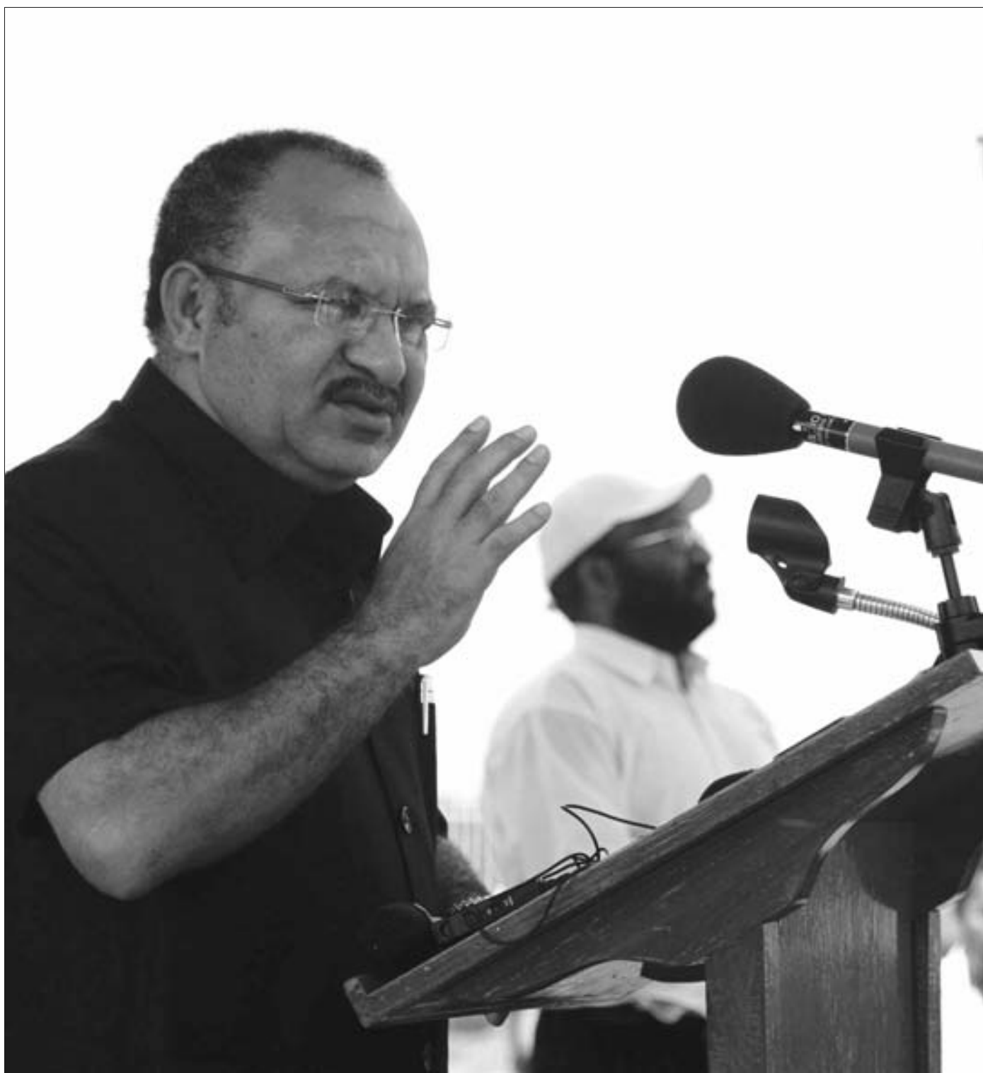
TOKTOK: Praim Minista O'Neill i tok gavman bilong em bai givim olgeta sapot long spots.

Yumi ken toktok tasol nogat wanpela gutpela samting bai kamap sapos yumi ol manmeri husat i go pas long kain wok i