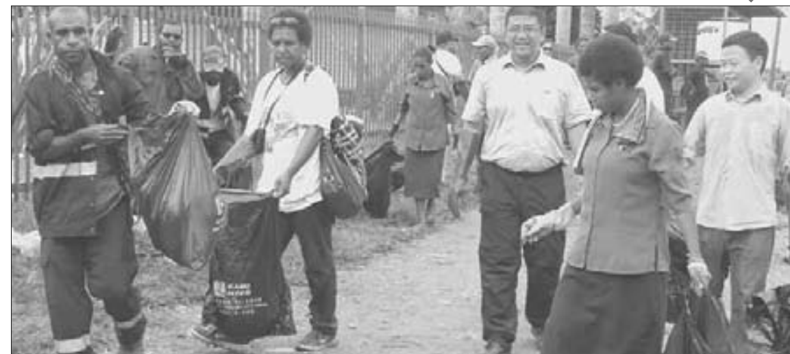
Ol Ramu NiCo na Raibus Enjiniaring wokman meri rausim ol pipia arere long Modilon Hausik.