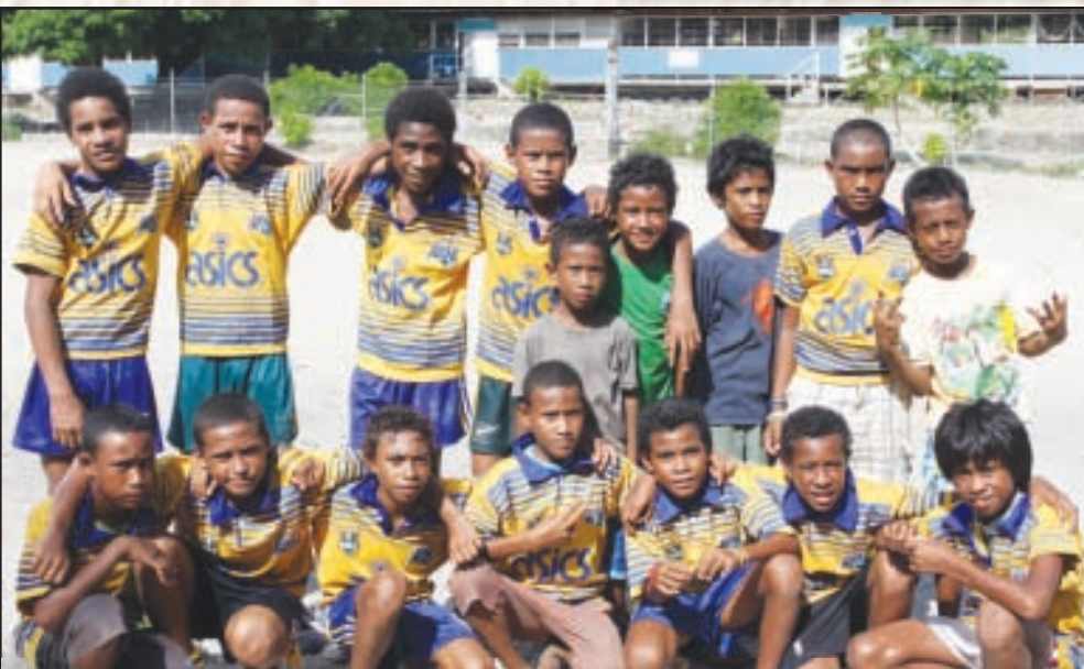
KBK: Junia lig i strong stret long Barakau, ol anda 13 bilong KBK kisim piksa bihain long ol pilai.