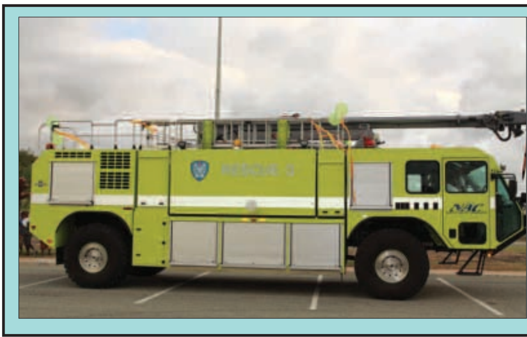
Nupela paia kar Nesanel Epot Kop-eresen (NAC) i kisim tripela nupela paia kar long helpim wok bilong ol long ples balus bilong Mosbi. Ol ples balus long Papua Niugini tu bai gat senis long ol. Mosbi ples balus i wok long go bikpela long wanem planti ol bikpela balus i wok long kam pundaun long en.