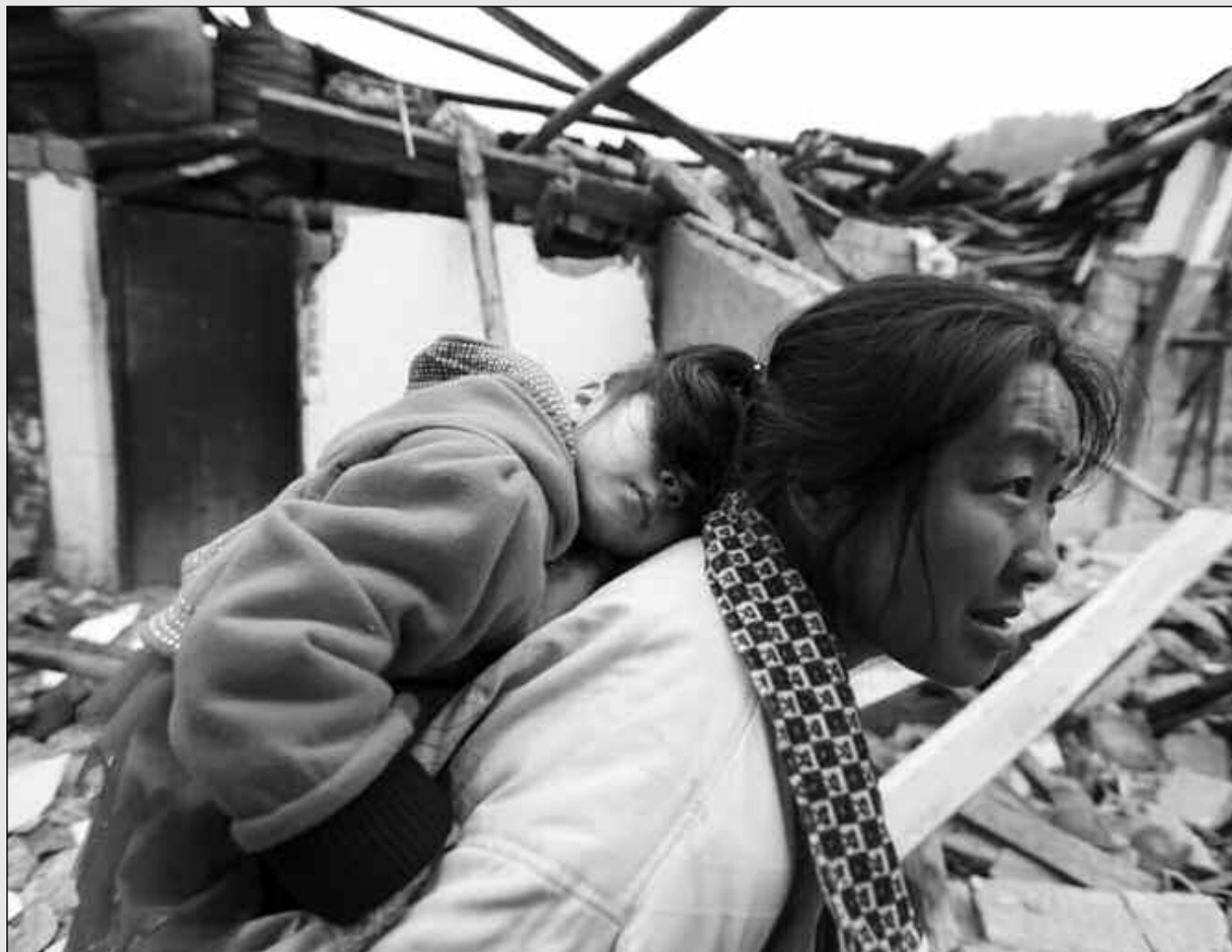
BIHAIN LONG BIRUA: Wanpela meri Saina bilong ples Ya'an long Sichuan provins i karim pikinini meri bilong em na abrusim bikpela bagarap i kamap bihainim wanpela bikpela guria i kamap long Baoxing kaunti long Mande dispela wik.