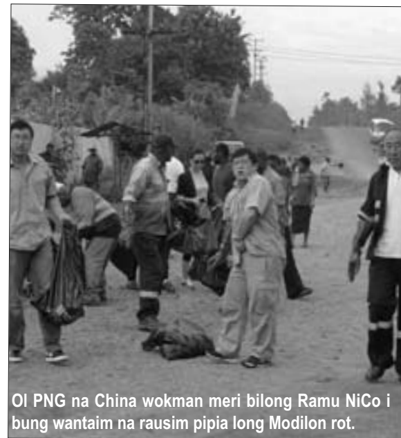
Ol PNG na China wokman meri bilong Ramu NiCo i bung wantaim na rausim pipia long Modilon rot.