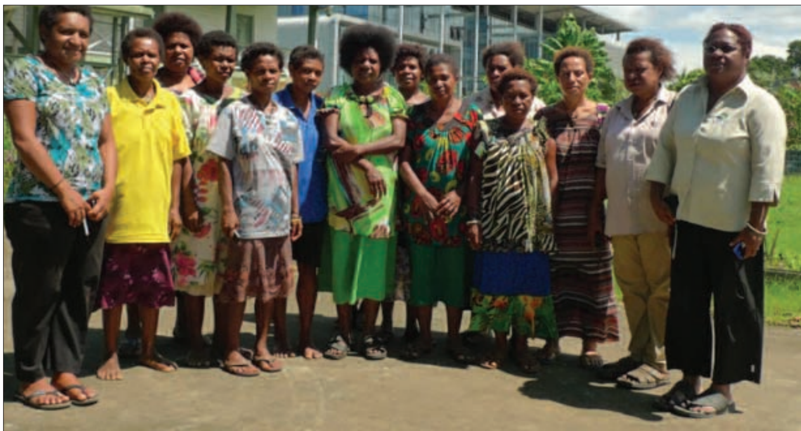
Ramu Nickel Wimen LOA eksekutiv lain wantaim ol trena bilong ol long Tunde.