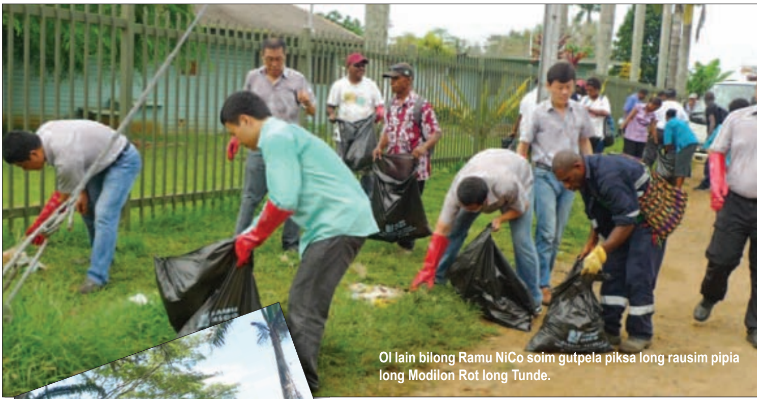
Ol lain bilong Ramu NiCo soim gutpela piksa long rausim pipia long Modilon Rot long Tunde.

Narapela samting tu em ol naispela nambis bilong Madang