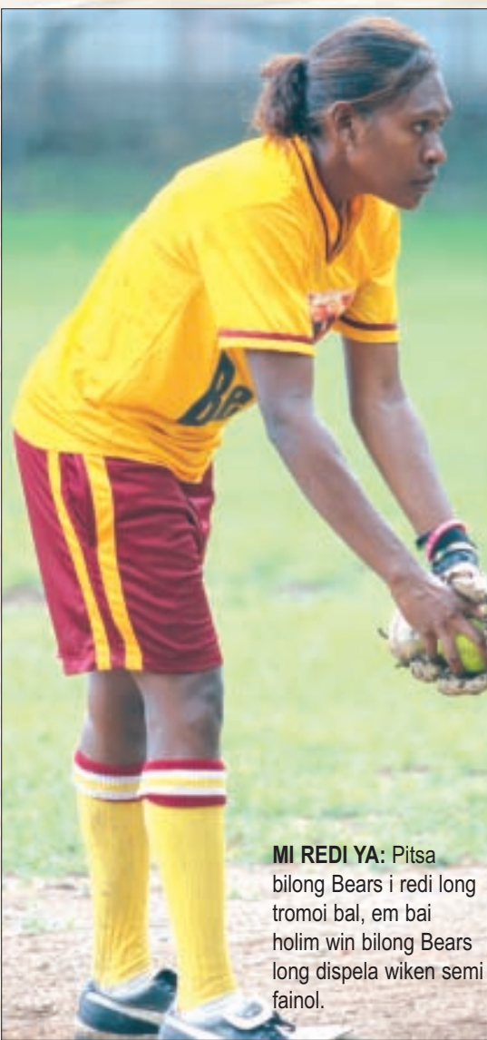
MI REDI YA: Pitsa bilong Bears i redi long tromoi bal, em bai holim win bilong Bears long dispela wiken semi fainol.