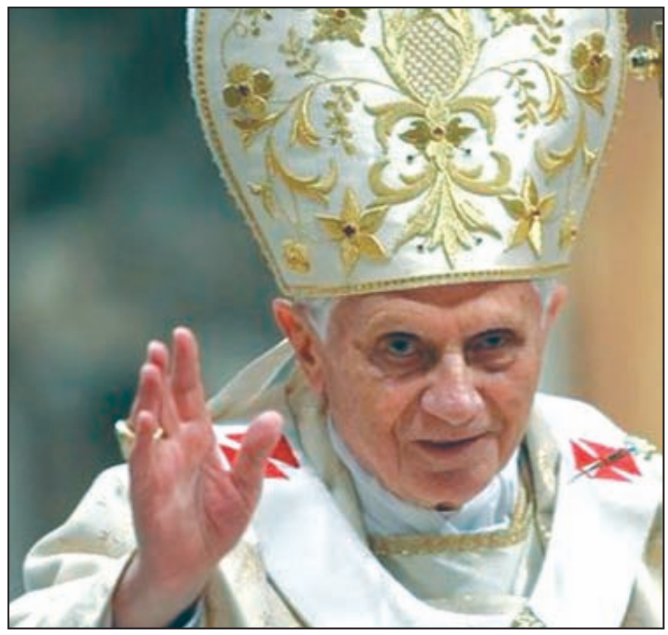
Long Nu Yia toktok bilong em i go long ol Katolik bilip manmeri na ol pipel bilong wol, Pop Benedict 16 i toktok long ol hevi i kamap long ples graun, we i kamap long pasin bilong wanwan ol manimanmeri i tingim ol yet tumas.

HETMAN bilong Katolik Sios long wol, Pop Benedict 16, i sutim tok long ol mani-manmeri na kantri long wol long ol hevi long ples graun.