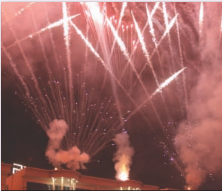
Paia woks em mipela ya: Oi wok manmeri bilong Lamana amamas long paia woks bilong ol.