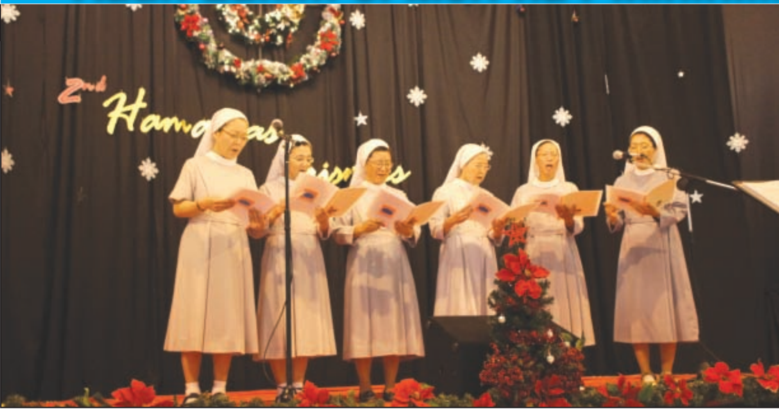
OL KEN SINGSING TU YA! Ol Sister ya i save mekim wok tisa long Caritas Gels Teknikel na Sekonderi skul long Nesanel Kapitell Distrik i gat gutpela nek long singsing tu ya! Hia ol singsing long fan resing konset bilong skul ol i kolim long Amamas Krismas, bilong kamapim mani bilong malti pepes skul hal, o hal we ol bai yusim long olgeta samting skul i kamapim long en.