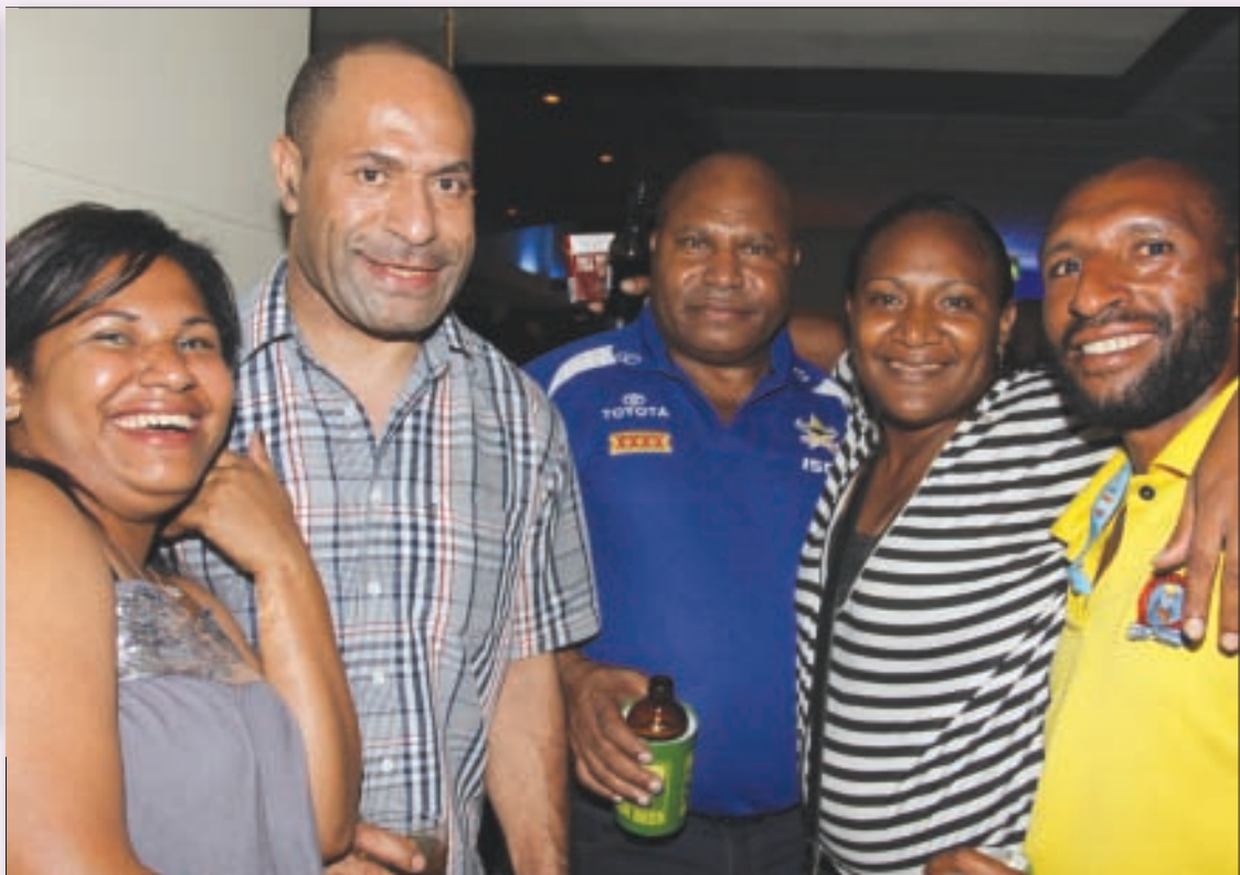
Oi bikipela pes i bung wantaim long amamas nupela yia.