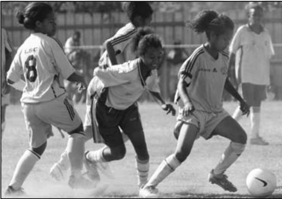
LSC pilaia wantaim bal i ron we long pilaia bilong Gabutu long gren fainol pilai bilong ol long EPC kap. Gabutu i win 4-1.