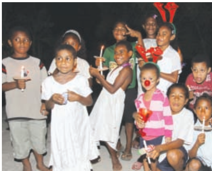
KAM GUT: Sampela ol liklik Wantok Kompaun pikinini i gat gutpela taim bilong amamas long Kerols nait.