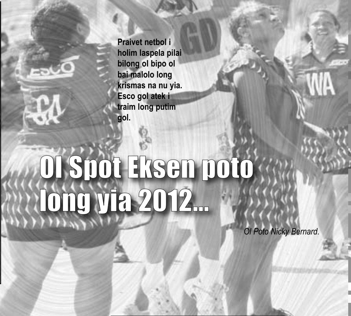
Praivet netbol i holim laspela pilai bilong ol bipo ol bai malolo long krismas na nu yia. Esco gol atek i traिम long putim gol.