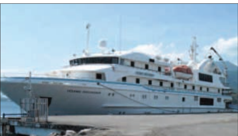
OL BAI KAM: Ol bikpela turisim krus sip bai kam long Milen Be.

Carnival Australia i lukautim P&O Cruises.