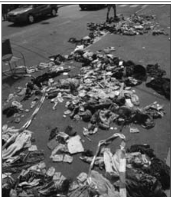
AMAMAS NA SORE BILONG NU YIA: Long lephan poto, London i soim stail bilong en wantaim ol faiawoks long Nu Yia, na long raithan sait, ol samting bilong moa long 60 manmeri long Ivori Kous long Afrika i lusim laip taim bikpela taim nogut i kamap taim ol manmeri i pulap long wanpela stedium long lukim ol faiawoks bilong makim Nu Yia.