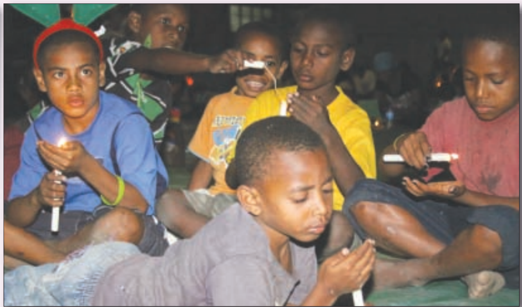
Kendol lait long 3-mail haus sik taim mekim Kerols bai kendol lait bilong ol. Oi pikinini na sik manmeri bin amamas tru.