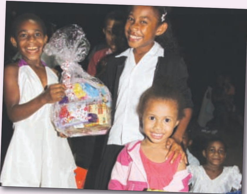
Senisim presen long krismas em bikipela samting long ol pikinini.