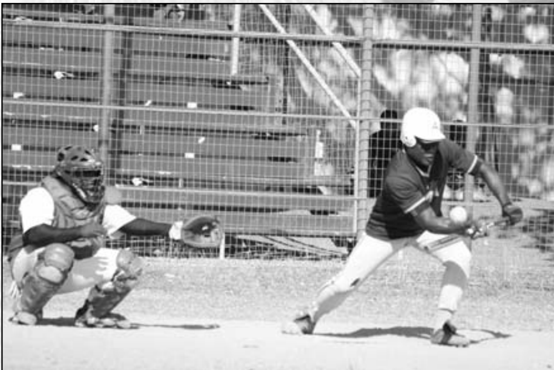
Sofbol eksen long bisini lukim beta bilong Manta Ray i traिम long stop bal long bet bilong em.