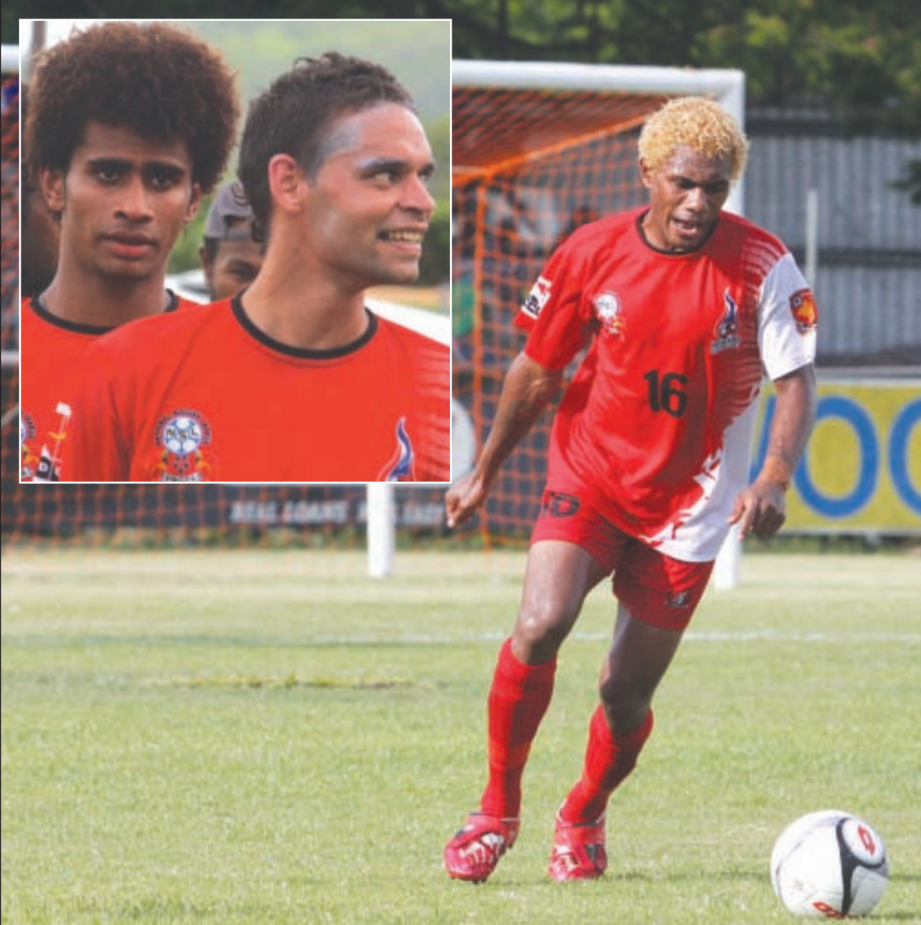
Insait: Ol bikpela pes bilong Hekari, na wanpela bilong ol husat bin sain long 2010 i holim bal long lek bilong em tai mol pilai wantaim tim bilong Solomon Ailan.

Dispela yia Hekari laik mekim nem bilong klab, kantri na Pasifik Ailan olsem sampela biknem pilaia bai pilai wantaim ol.