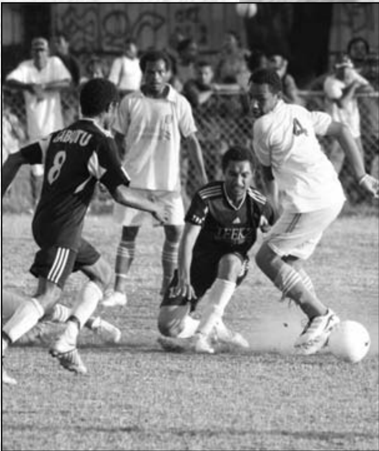
Gabutu pilai i pudaun taim em laik kisim bal. EPC kap bilong ol man i go bek ken long Gabutu namba tu taim.