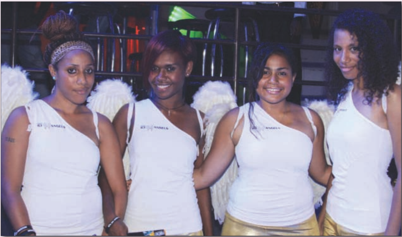
Oi wait enjel bilong SP Bruri amamasim ol manmeri wantaim promosen.