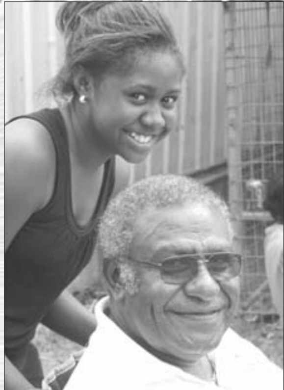
Kos na pilai bilong nupela tim Wholf.

TOKSAVE: Salim ol spots dro bilong yu kam long Feks; 325 2579, e-mel; bveo@wantok.com.pg o kam lusim long Wantok Niuspepa opis long Central Waigani, NCD.