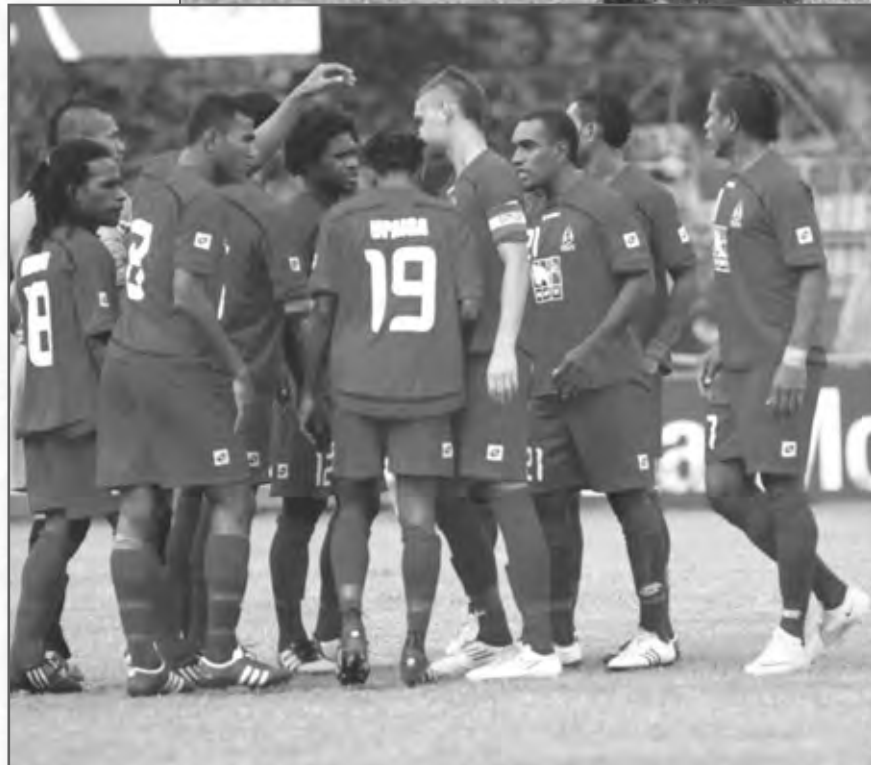
Hekari amamasim win bilong ol.