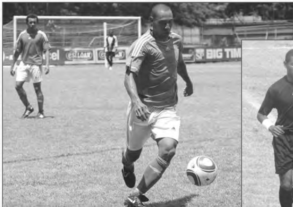
Sentral pilai wantaim bal, ol lus long Besta Yunaited long wiken long NSL soka resis.