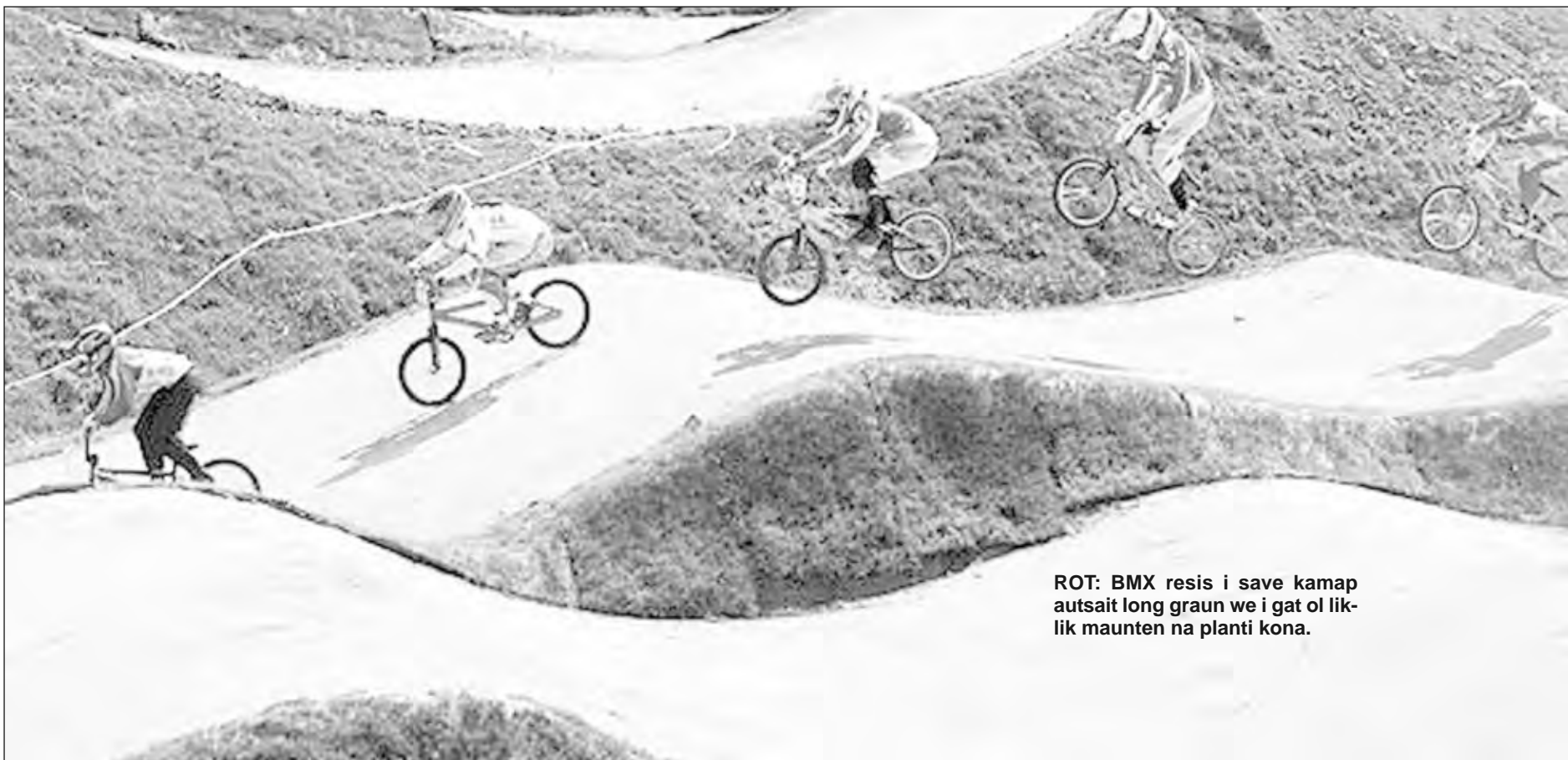
ROT: BMX resis i save kamap autsait long graun we i gat ol liklik maunten na planti kona.