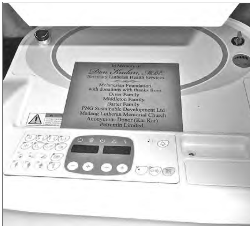
GAUBIN DONESEN: Wanpela long ol masin we ol lain nem bilong ol i stap i donetim i go long Gaubin Helt Senta long Karkar Ailan, Madang.