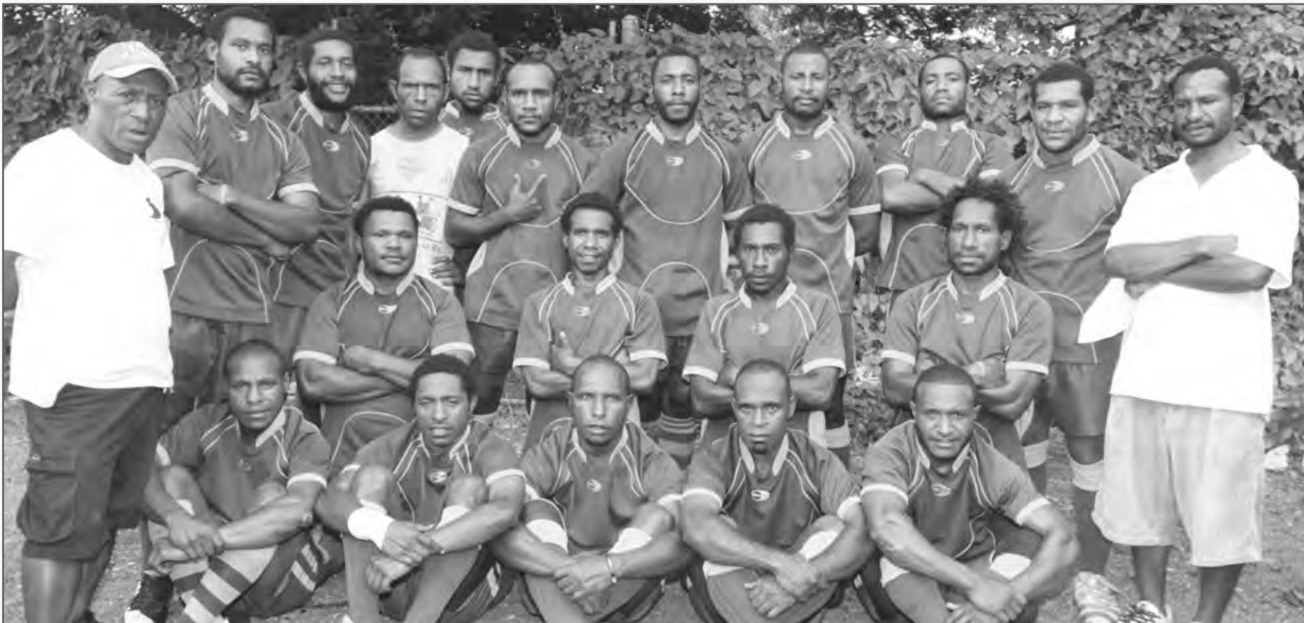
7-Mile Jets A gret tim redi tasol long pilai long Boroko ov sisen long Pot Mosbi