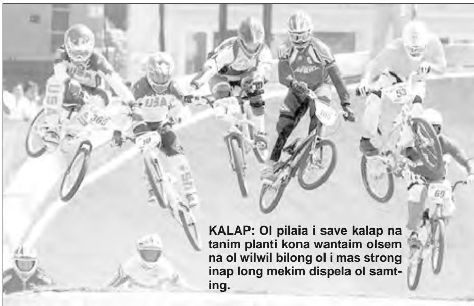
KALAP: Ol pilaia i save kalap na tanim planti kona wantaim olsem na ol wilwil bilong ol i mas strong inap long mekim dispela ol samting.

American Bicycle Association (ABA) i kamap long 1977 long lukautim dispela spot na long Epril, 1981, International BMX Fed-