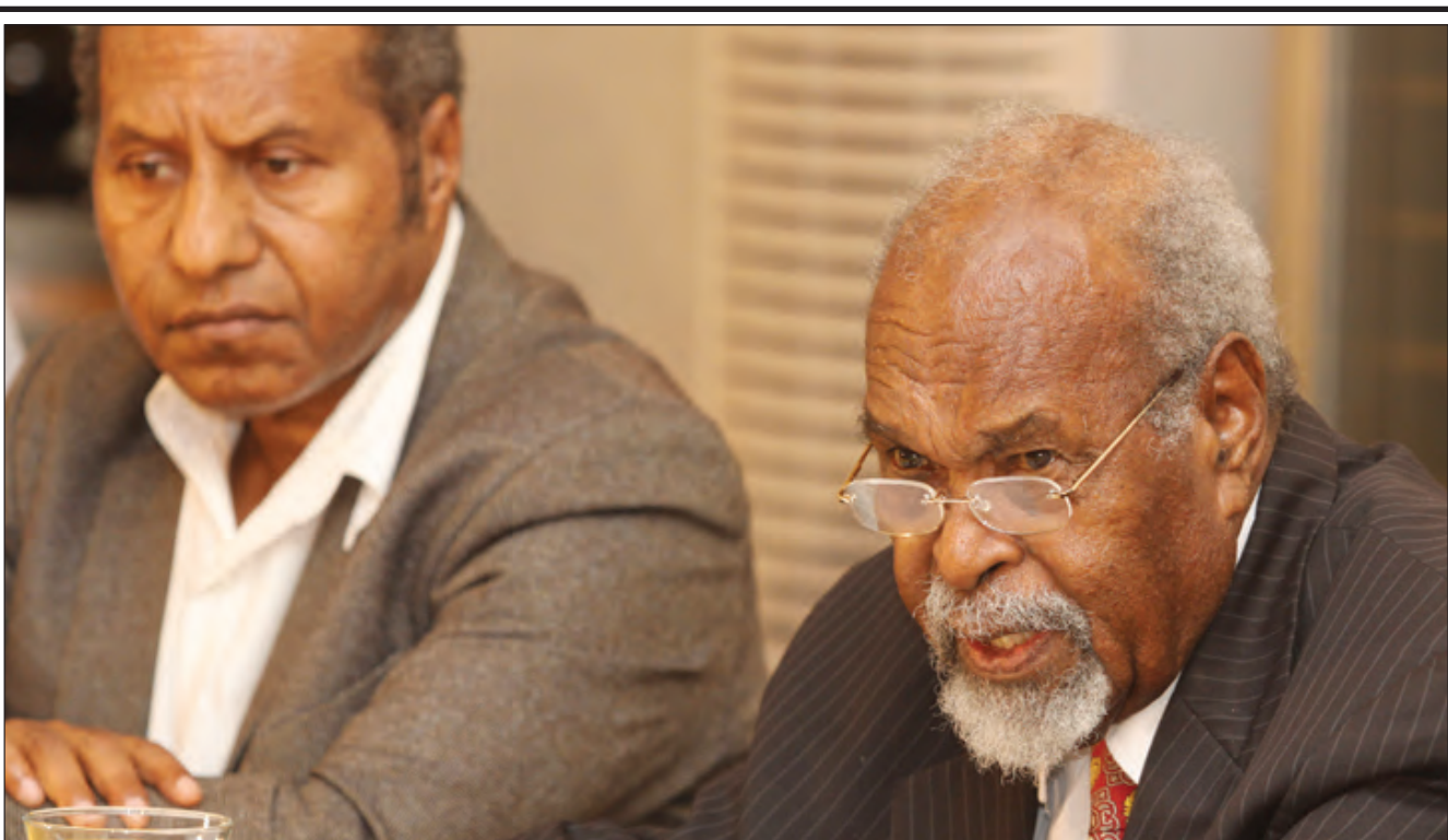
STRONG YET: Maski O'Neill-Namah kem i gat ol namba, na ol i tok ol em tru tru gavman bilong kantri, Gren Sif Sir Michael i strong yet olsem Suprim Kot i tok klia pinis long sindaun bilong en aninit long mama loa. Sir Michael na kabinet bilong em i sanap strong yet olsem ol i wetim tasol O'Neill na lain bilong em long lusim sia bilong gavman, bai ol i ken go bek long Palamen haus.