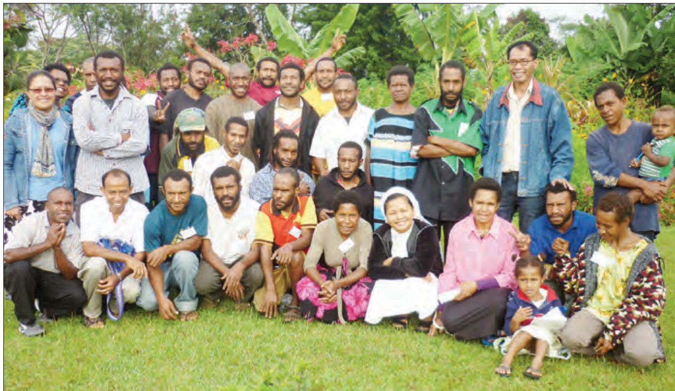
DRAG WOKSOP: OL lain i bin sindaun long drag na alkohol woksop long Kefamo.

NESENEL Katolik Famili Laip Apostulet (NFLA) long Goroka i bin helpim 24 pipel i bin sindaun long wanpela woksop long kisim save long luksave olsem drag o spakbrus i ken bagarapim laip bilong man.