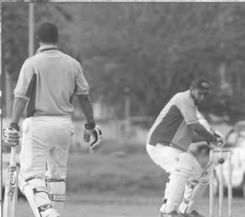
Kriket pilai wok kamap strong long Amini pilai graun long Mosbi, olsem dispela tupela pilaia bilong Kapa i soim.