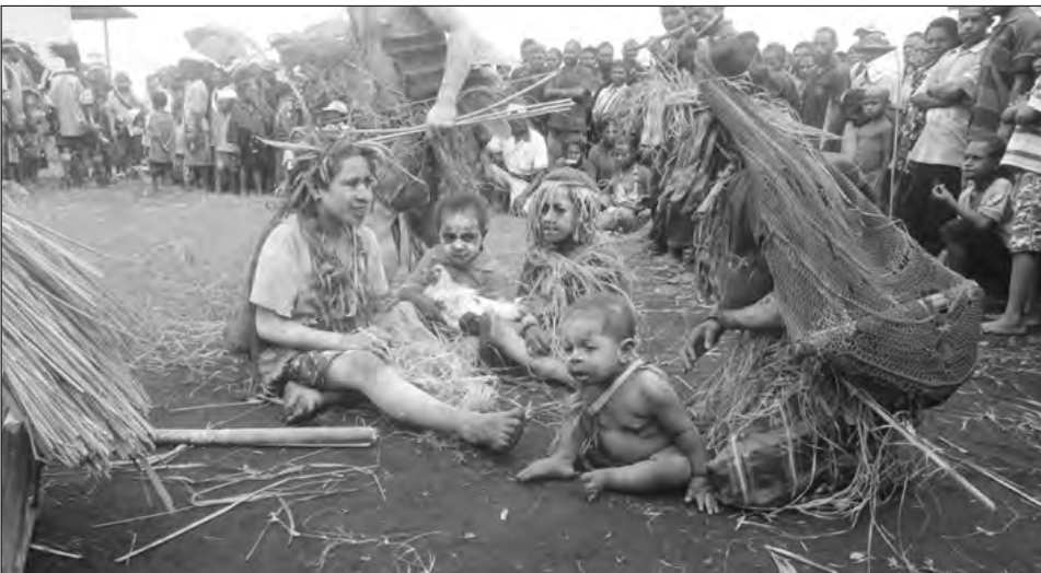
Wanpla liklik pikinini i stap insait long wanpela drama long taim bilong haus presentsen ol i givim nupela haus.