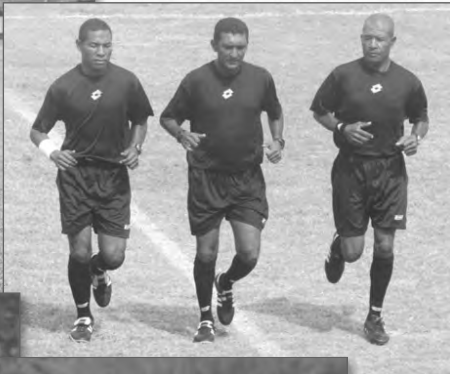
Ol refri tu save mekim liklik ekksesais long mekim ol fit long ron insait long pilai graun.