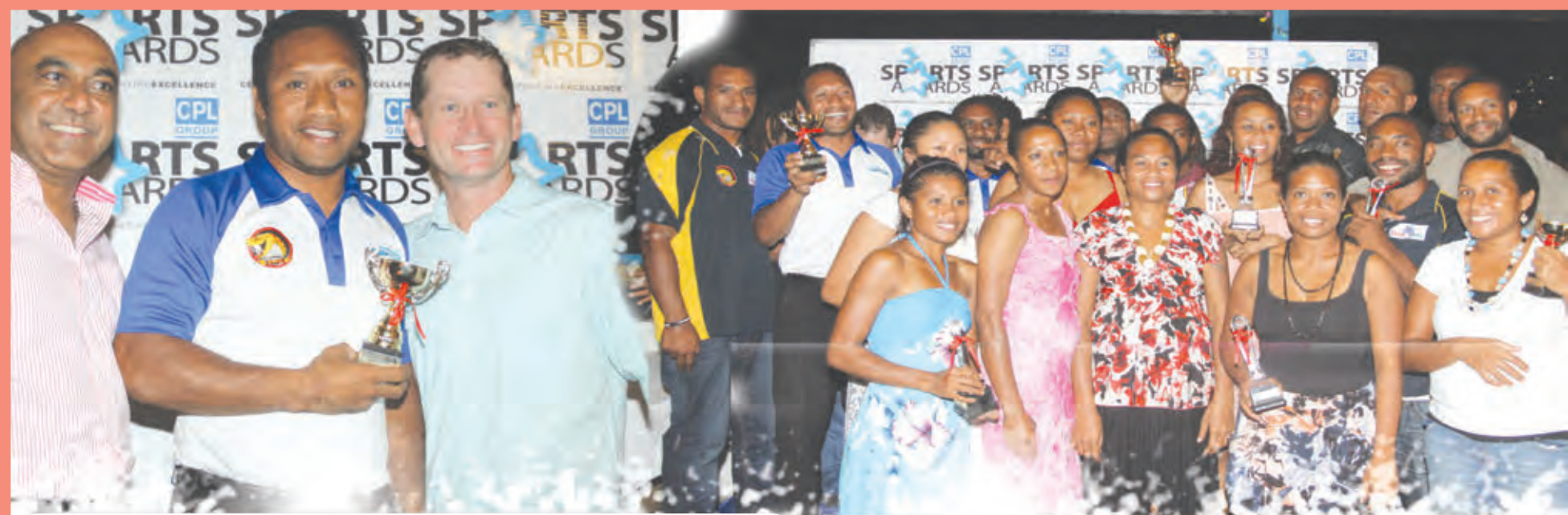
TOP FORWARD. CPL luksave long Kowu olsem top forward pilai bilong Stop N Shop Vipers.