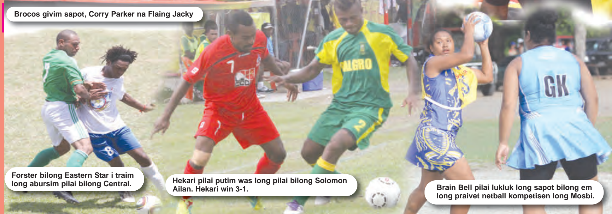
Forster bilong Eastern Star i traim long abursim pilai bilong Central.