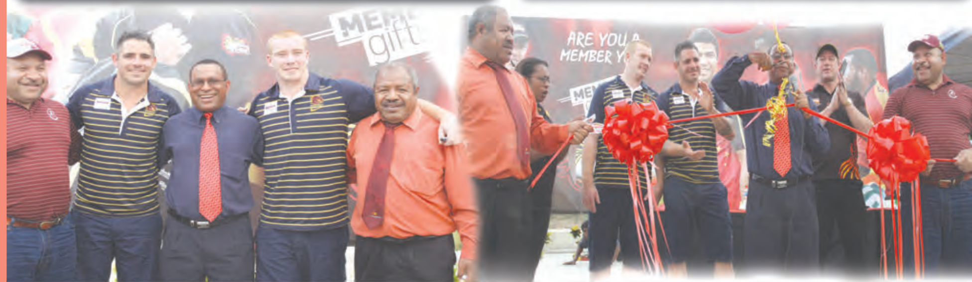
Strongim NRL Bit, Corry Parker na Jacky kam lonsim NRL Bit wantaim Gavana bilong NCD Powes Parkop wantaim ol komiti bilong NRL Bit long Pot Mosbi.