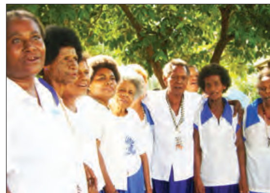
STAP WANTAIM: OL mama grup bilong ol sios i save wok bung na pas wantaim long holim famili, komyuniti, provins na kantri long gutpela taim na taim nogut, olsem dispela Angliken Sios mama insait long Nesenel Kapitel Distrik i soim long en.