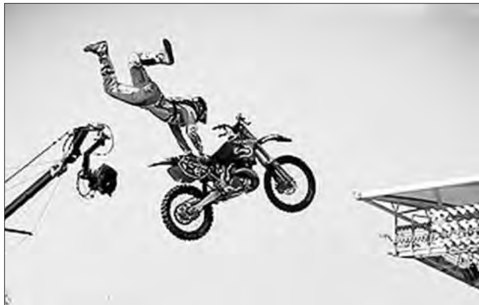
ANTAP TRU: Wanpela pilaia i kalap na mekim stail bilong em antap tru wantaim motobaik bilong em

Bikpela samting long kamapim dispela, em, i mas i gat laik na gutpela sapot bipo long kain pilai ken kamap long hia o long ol narapela hap long wol.