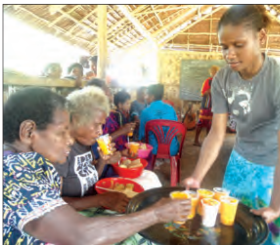
PASIN STAP: Dispela yangpela pikinini meri Manus i wokim gutpela pasin long sevim ol mama na bubu pastaim long wanpela bung.