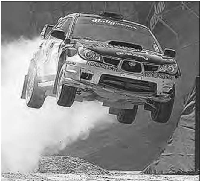
RESIS: i gat resis bilong ol kar tu insait long X-Games.