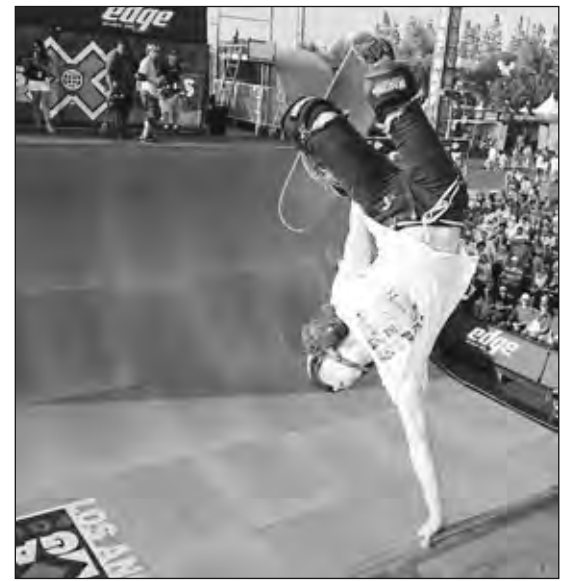
STAIL: Wanpela sket bod pilaia i sanap long han taim em i resis.