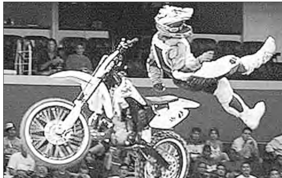
I NO ISI: Ol pilaia i save mekim planti ol stail na pilai we yu bai pret nating long mekim o lukim.