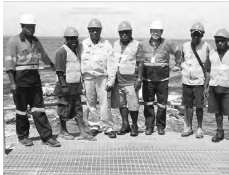
Ol siaman wantaim ol wokman bilong Ramu NiCo i sanap antap long miksing tenk bilong DSTP long Basamuk.

Kurumbukari main ples tu we kain luksave i mas stap.