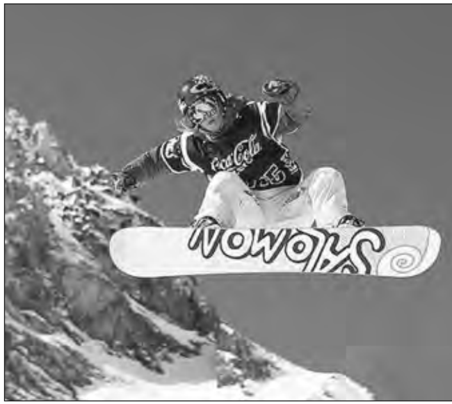
KOL PLES: Wanpela sno bod pilaia i kalap antap long ais long gem bilong em.