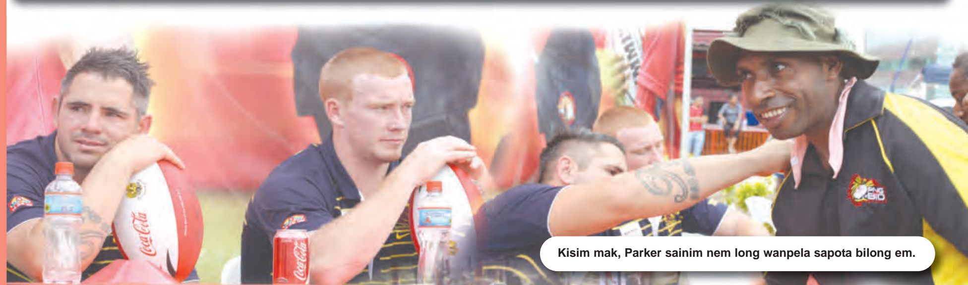
Kisim mak, Parker sainim nem long wanpela sapota bilong em.