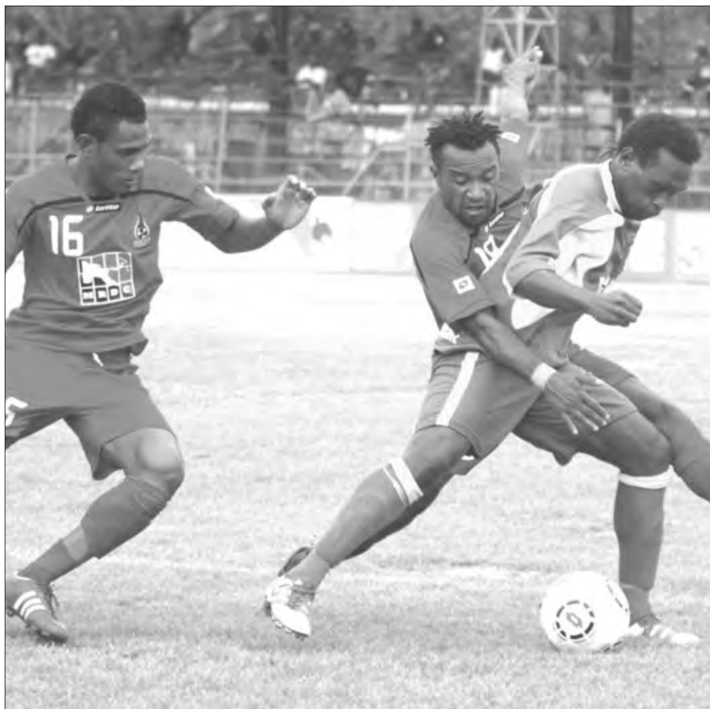
Tupela pilai bilong Hekari traim long pasim pilaia bilong Koloale long kisim bal go long gol mak bilong ol.

Long namba tu pilai bilong tupela tim i go strong stret,