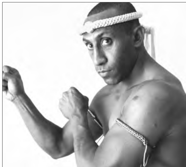
GO BEK LONG PLES: Garap i amamas tasol long kamap long ai bilong ol asples manmeri bilong em. WANTOK FOTO.

Ol i tok dispela tonamen i op tu long ol paitmanmeri bilong ol arapela masol ats stail olsem karate, taekwando, Kung Fu na ol arapela husat i laik stap insait long resis.