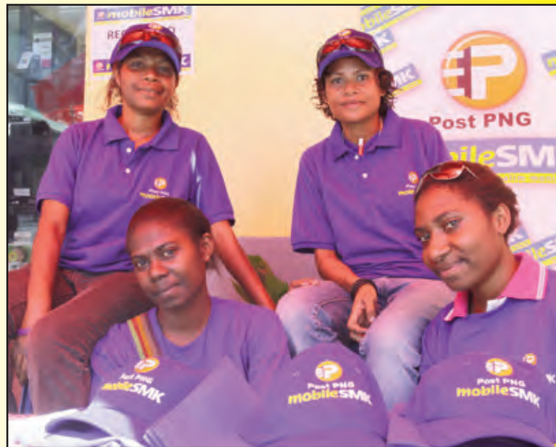
Em i isi long salim mani, ol wokmeri bilong Post PNG i tok ples klia.