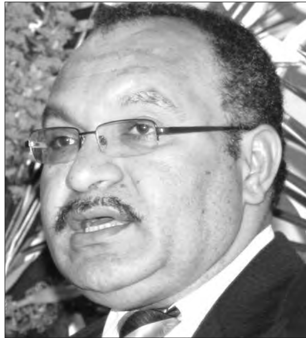
Praim Minista Peter O'Neill painim we long kisim bek moni.

"ExxonMobil em i kampani bilong Amerika. PNG LNG em i 15 bilian US dola projek. Lukluk gut, i no Australian dola. Mipela i toktok long US dola," Somare i tok.