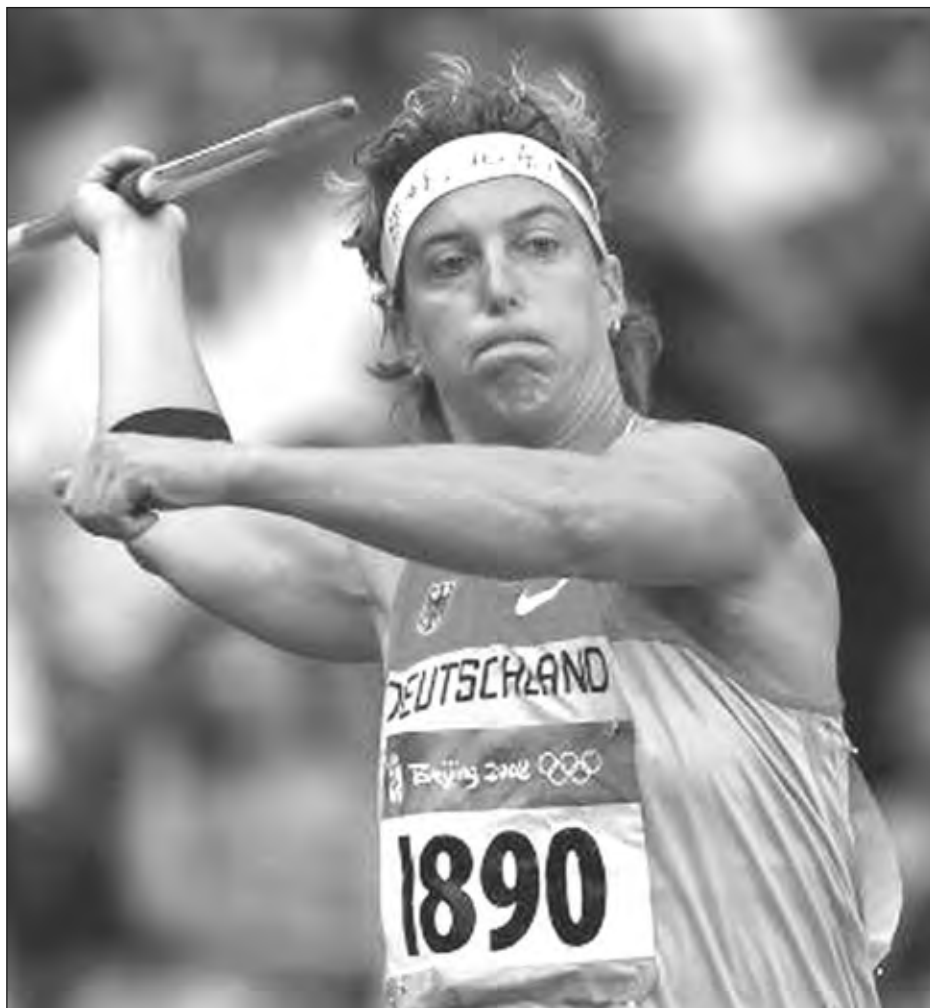
HOLIM: Taim yu kamap klostu, tanim na pulim han wantaim spia i go bek.