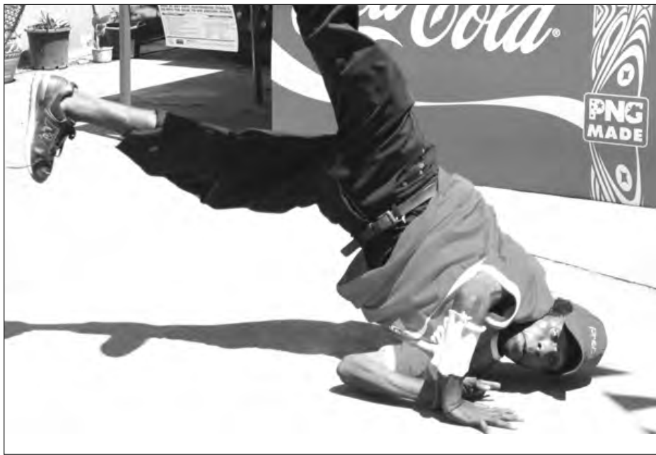
Wanpela long ol brek danis mangi i mekim promosen bilong koka kola long Mosbi.

mekim bai ol mekim tasol. Sapos yu no save long dispela danis, noken traim, nogut bai yu bagarapim sampela hap long bodi bilong yu na bahat long stretim long haus sik.