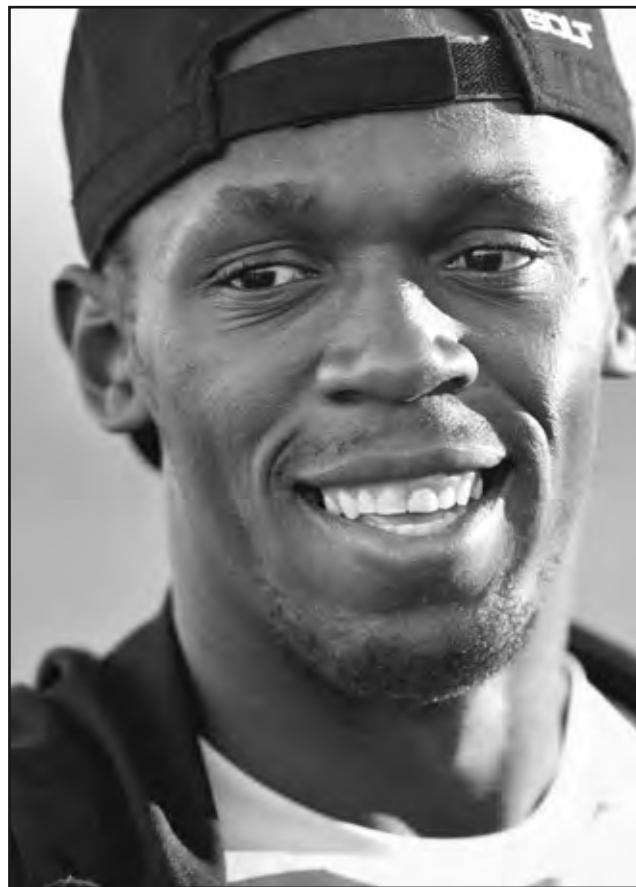
SPITMAN: Bolt bai resis 4x400m rile tu sapos ol i askim em.

Tasol em i bin kam bek long narapela resis long winim dispela taitol bilong em long 100m na nau i hangre long kirapim das gen long Olimpik gems long 2012. "Taim bilong Olimpiks i kam klostu nau na mi statim trening bilong mi wanpela mun i go pinis," Bolt i tok insait long ol nius ripot.