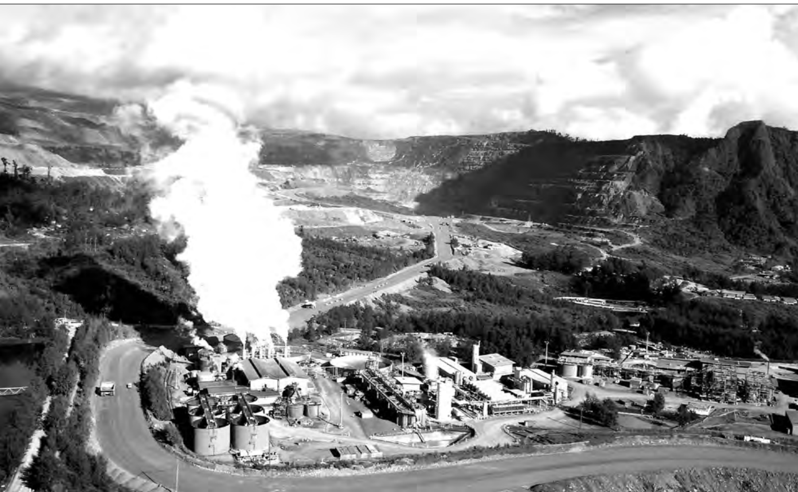
WOL KLAS MAINING: Barrick Gold i ronim Porgera na em i bikpela wol-klas gol maining long PNG bihanin long Lihir, Ok Tedi na Hidden Valley.