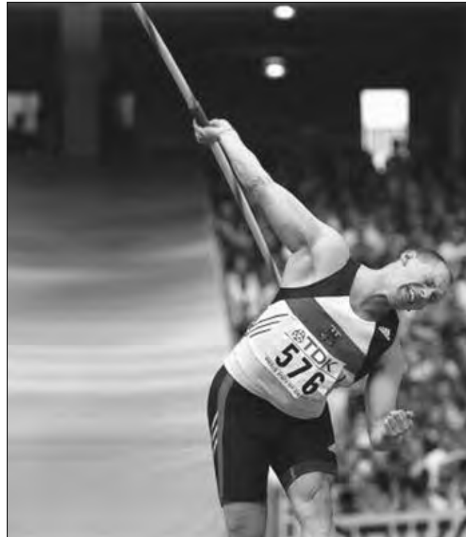
TROMOI: Taim yu kamap long mak, sanap strong long lek bilong yu na tromoi spia i go antap na longwe stret.