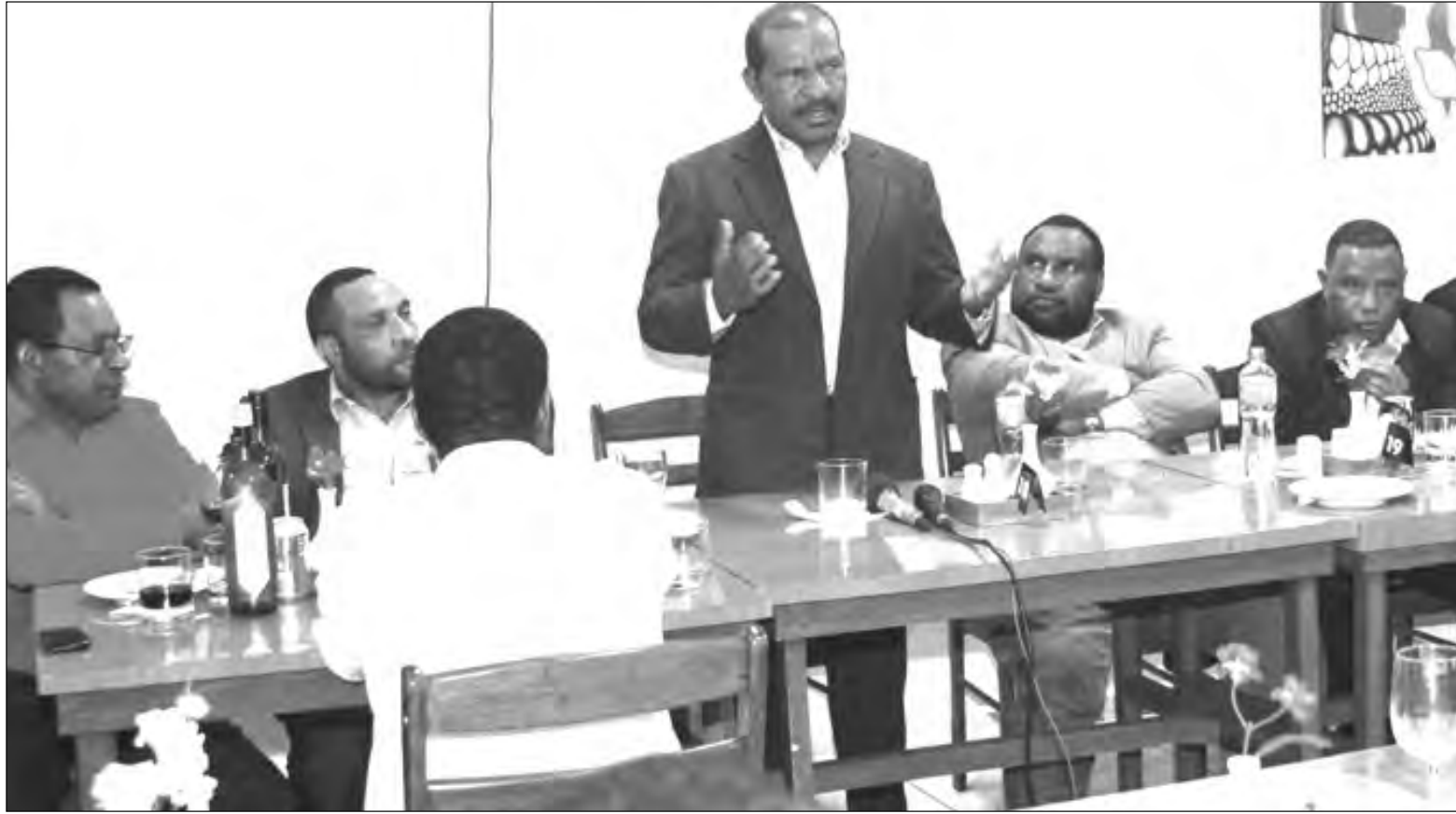
karim kaikai wantaim sapot bilong olgeta 83-pela memba.

Ol i tok karai na singaut bilong pipel bilong Jiwaka na Hela i nau