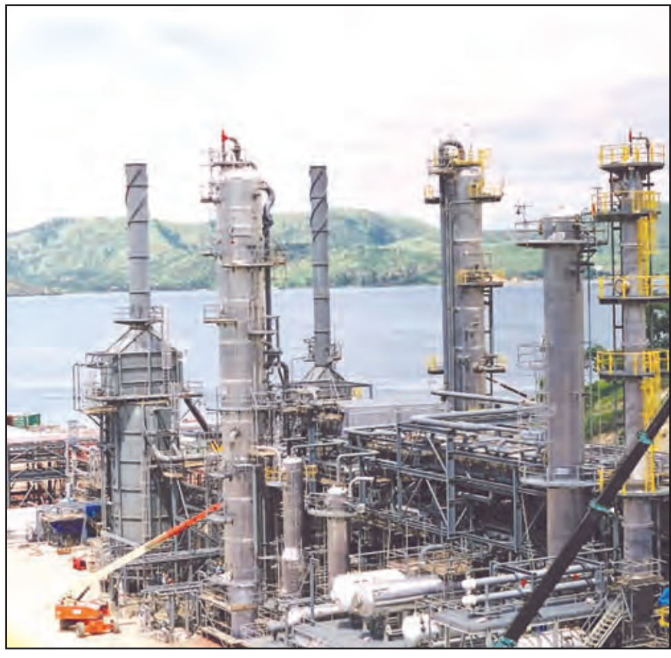
INTEROIL NAPANAPA RIFAINRI: PNG Gavman na InterOil Corp bai senisim pepa wok long pastaim agrimen long putim refaineri long Napanapa. Nupela refaineri bai stap klostu long Elk-Entelope ges fil long Galf Provins yet.

Ol bai salim 6.6 bilian tan bilong LNG olgeta yia, na bai kik statim prodaksen long 2014. Ol i sainim agrimen long salim LNG long China, Japan na Taiwan.