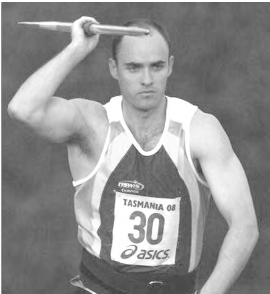
RON: Holim spia antap long solda na ron i go antap.