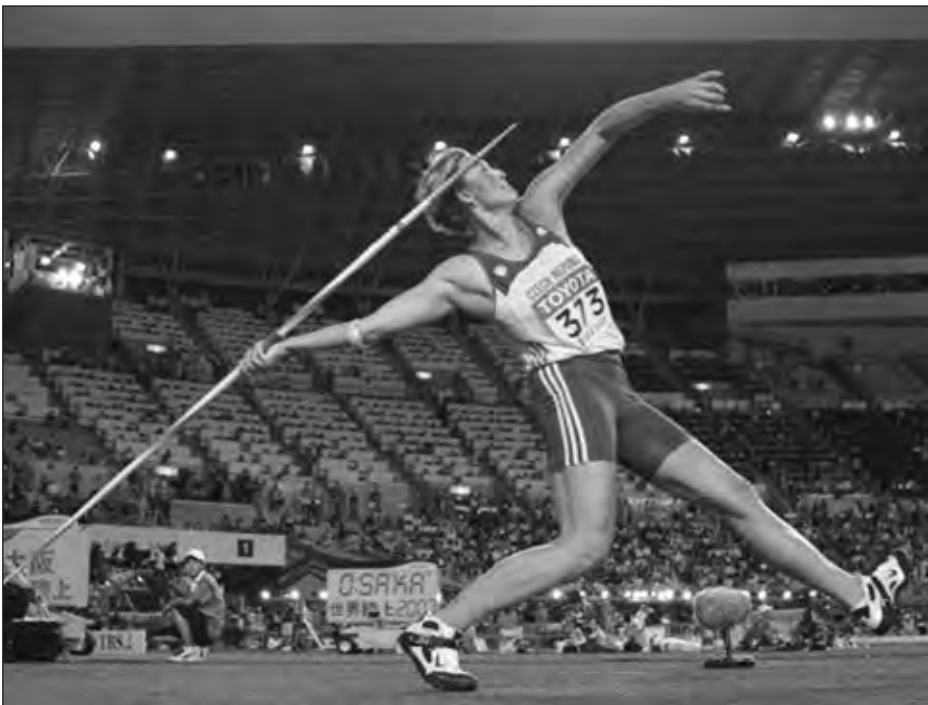
REDI: Taim yu kamap klostu long tromoi, holim gut spia na pulim i go bek stret na redi long tromoi go antap.

Dispela save i stap insait long yumi na i gat sampela ol manmeri long ol rurel ples husat