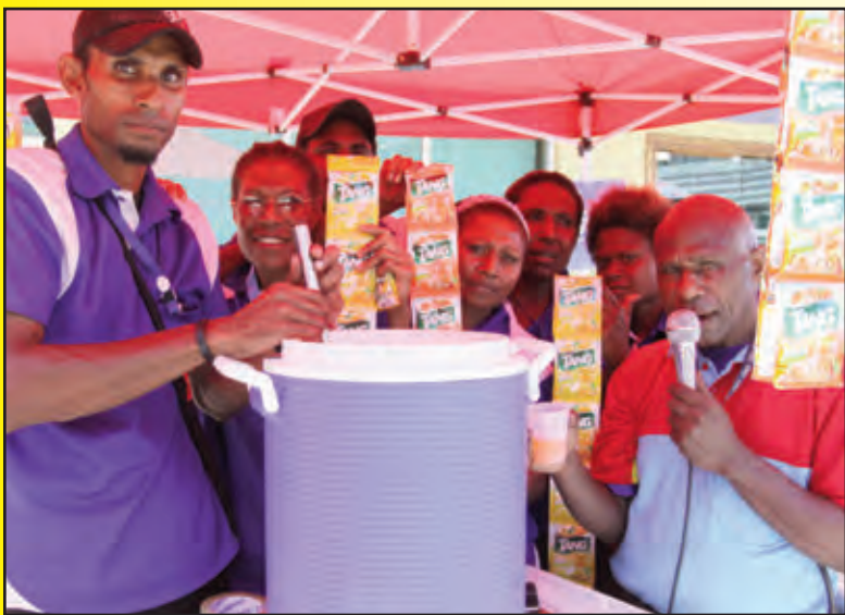
Ol sales lain bilong Seeto Kui i soim nupela tang jus.