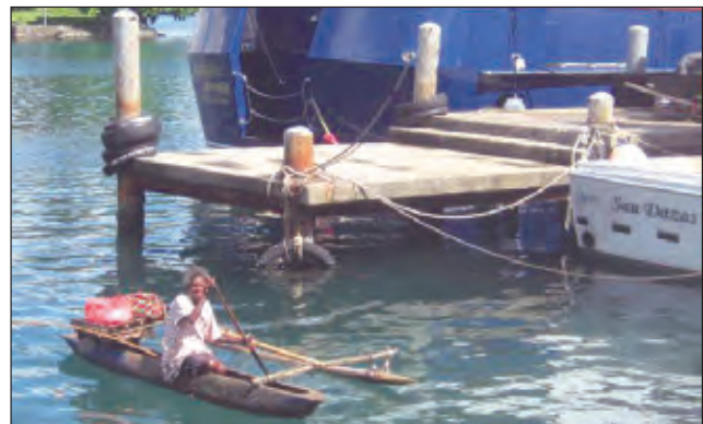
Wanpela mama bilong Kranget i pul kanu na bihainim ol liklik pis talai arere long sip i anga long liklik bris arere long Madang Risot.