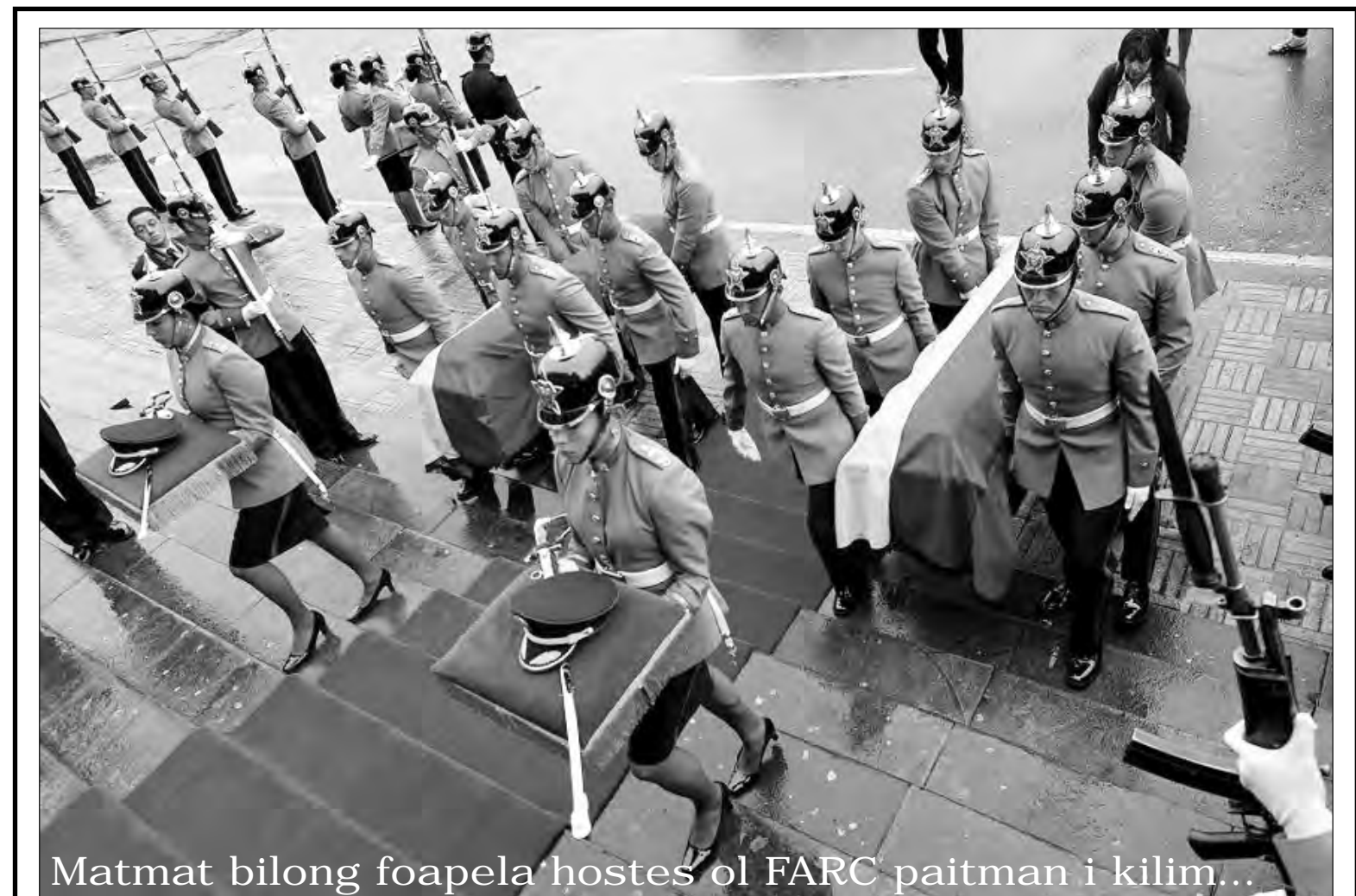
Matmat bilong foapela hostes ol FARC paitman i kilim...

OL kofin bokis bilong foapela lain ol paitman bilong rebol grup FARC i bin holim pasim na kilim ol. Foapela i kisim ol militari ona long Bogota, Colombia, long Novemba 29, 2011. Ol rebol i kilim ol biahin long ol i holim ol i stap moa long tenpela yia.