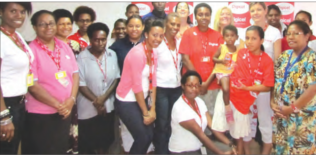
YUNAIT NA MEKIM SAMTING: Ol wok meri bilong Dijisel na sampela ol niusmeri bilong ol wan wan midia ogenaisesen long Mosbi i bung long belotaim kaikai long luksave na wok wantaim long stopim pasin bilong paitim na bagarapim ol meri long las wik Fraide, em Waitpela Riben De.

Planti ol kastoma i save amamas long kaikai ol liklik pis bikos i gat swit long en, olsem na ol mama i save laik long pulim ol dispela pis na karim i go fraim na salim long liklik maket bilong ol.