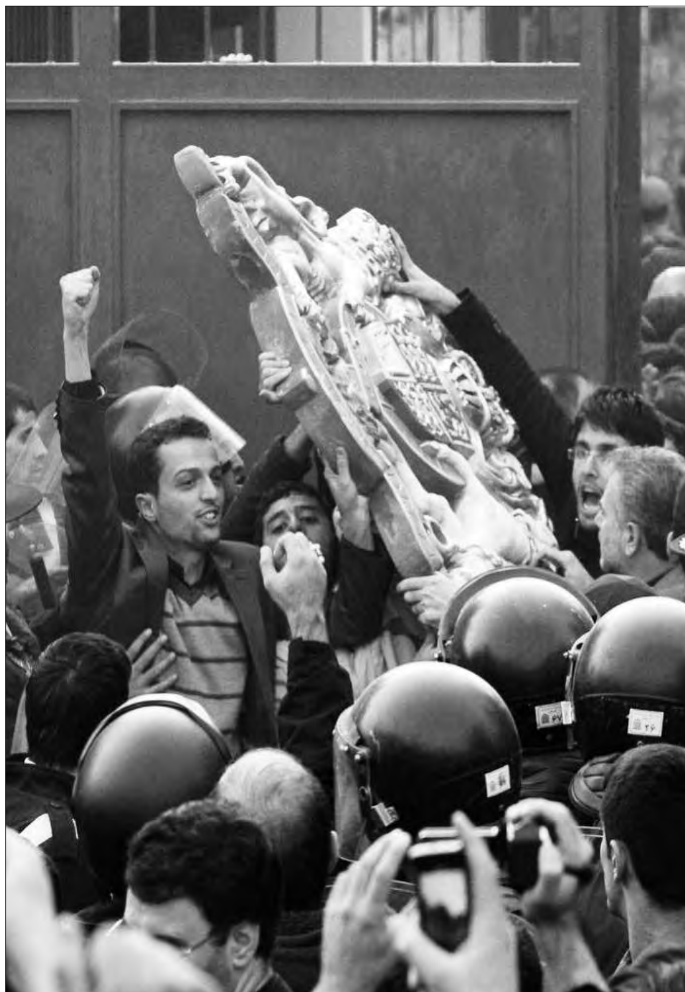
Ol protesta brukim Britis embasi long Iran OL protesta long Iran i karim kala na pisin bilong Britis Embasi long Tehran long Tunde dispela wik.

WANPELA man i wokabout lusim nupela hapsait daun klab haus, The Caracella Club, we i sanap olsem hap bilong ol nupela bilding developmen long Indirapuram, 30 kilomita saut is bilong Nu Delhi, India.