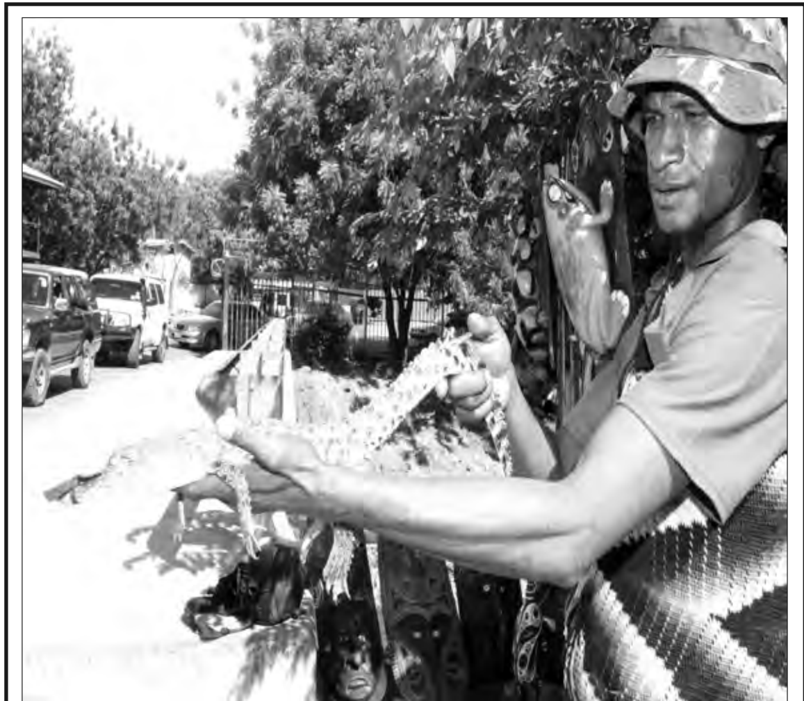
EM PUKPUK o KAVING: Dispela Kerema i karim puk bai yu ting em wanpela kaving, tasol go klostu bai save olsem pukpuk tru ol salim wantaim ol kaving i stap klostu.