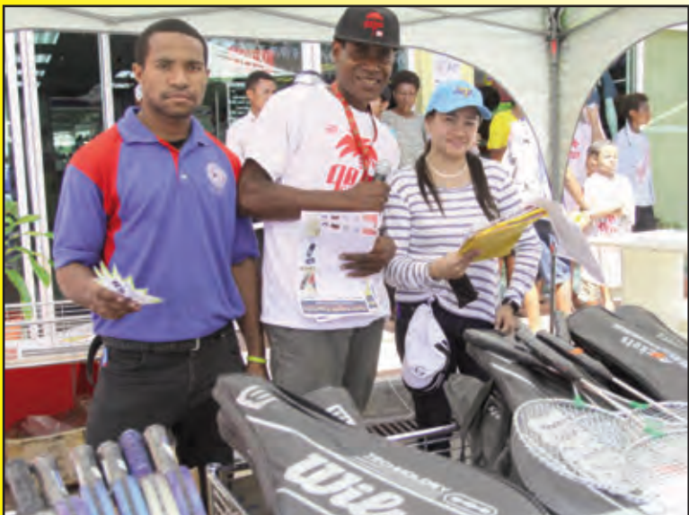
Ol Nambawan trophy i lukautim dispela liklik tred so, ol tu soim ol samting bilong ol.