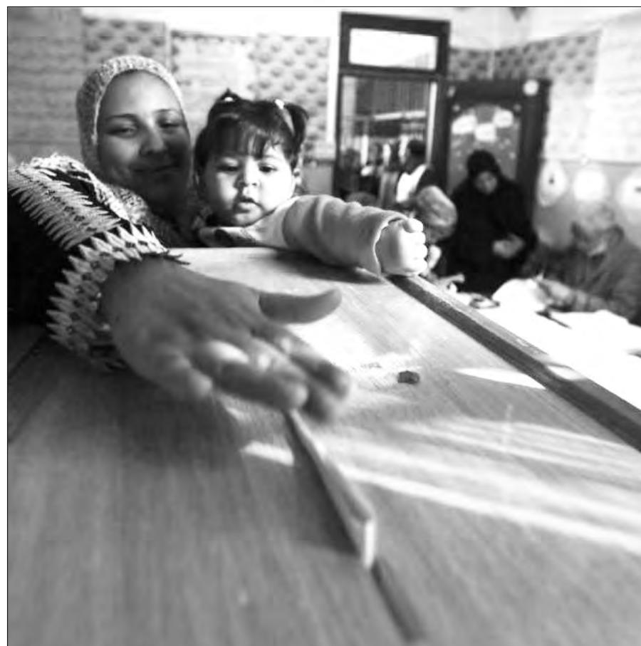
Meri vot long namba tu de ileksen long Ijip WANPELA meri long Ijip i karim pikinini bilong em na tromoi vot bilong em long wanpela poling stesen insait long palamen ileksen bilong ol long Cairo, Novemba 29, 2011.