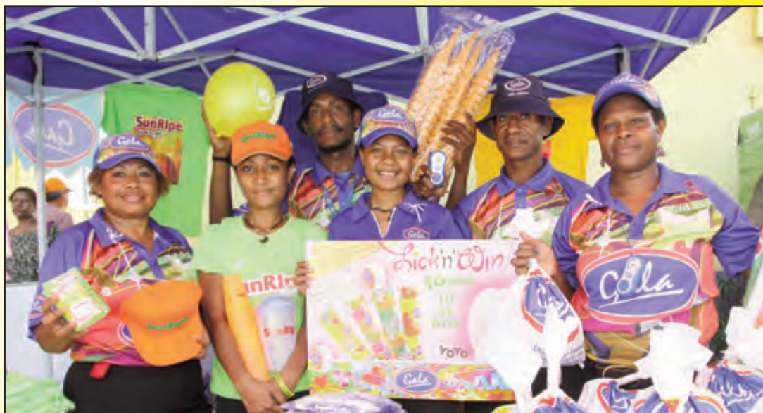
Gala gala yam, tru tru kala ol karim, ol soim olgeta kala bilong ol samting bilong ol.