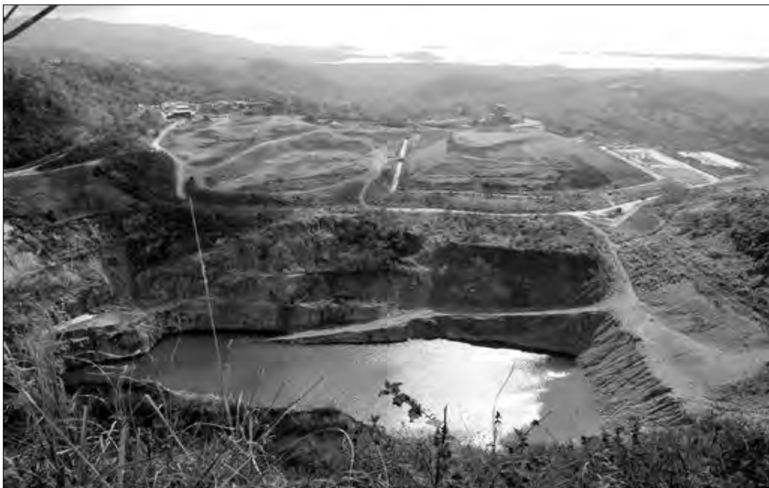
LUKAUTIM ENVAIROMEN: Teilings Dam bilong Hidden Veli Maining Projek em gutpela tru na bai no inap kamapim envairomen birua.

Gavman bai yusim dispela yusim fand long ronim kantri bihain taim gol, ges na wel i pinis wanpela taim. Stebilasesen Fan i bai balensim mani insait long kantri. Taim planti mani tru gavman i kisim long wel, ges, na gol i stap long kantri, dispela bai kamapim inflesen. Inflesen kamap taim, prais o mani mak bilong ol samting bai i go antap. Dispela bai kamap taim ol pipel bai nonap stap gut. "Long dispela tupela bikpela as tasol, gavman i nau kamap wantaim dispela tingting bikos sapos ol gridi lida na nogut gavman i no putim o yusim gut nesenel winmani i kam long planti maining na petroleum projek nau, kantri bai kisim bikpela taim long bihain taim," O'Neill i tok. "Olsem na long abrusim dispela bikpela birua, O'Neill-Namah Gavman i nau rere long kamapim loa bilong SWF na makim ol stretpela man long lukautim dispela fand," O'Neill i tok.