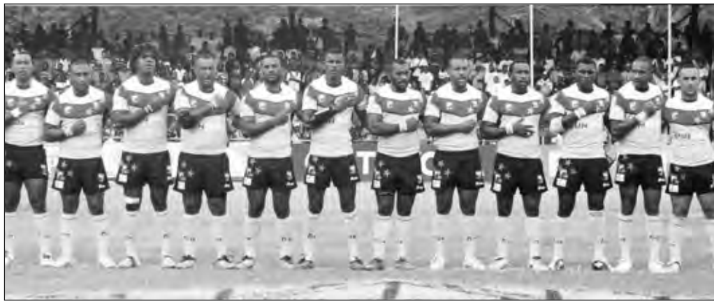
NESENEL TIM: Gutpela gem bilong ol Kumuls i soim olsem PNGRFL i wok long kamap gut gen.

long 2012 na i go tasol i no olgeta ragbi lig sapota i amamas tumas long en.