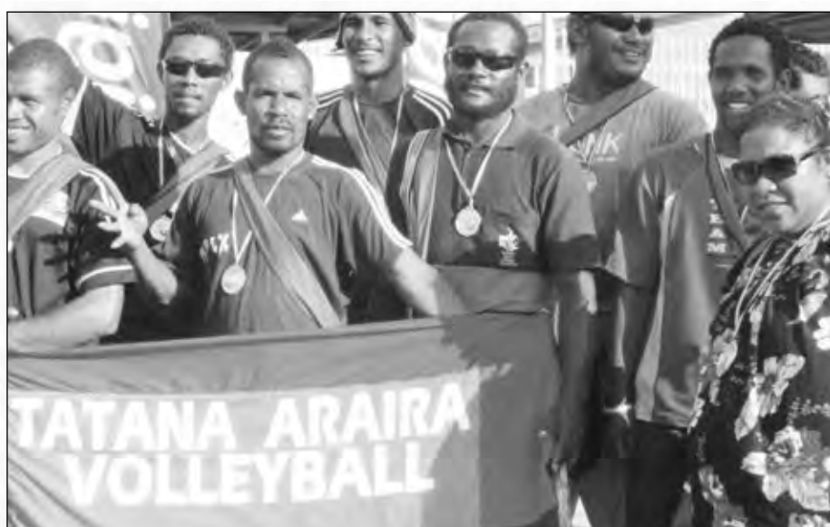
SEMPION: Sempion tim bilong Nesanel volibol sempionsip bilong dispela yia long anda 21 divisen em Tatana volibol asosiesen. Ol i bung wantaim long soim amamas bilong ol las wik Mande long Mosbi bihain long tonamen.