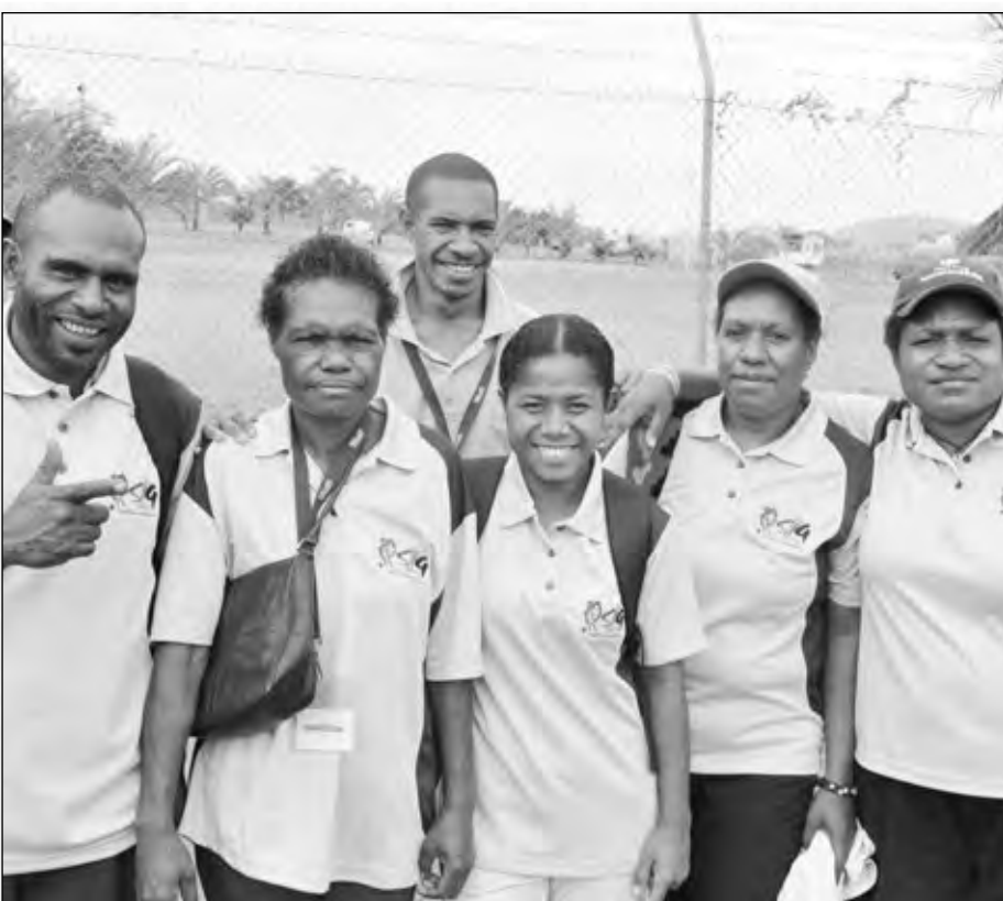
TIM: Basketbol tim bilong UPNG i redi long go long bikpela pilai bilong ol univesiti long Goroka.