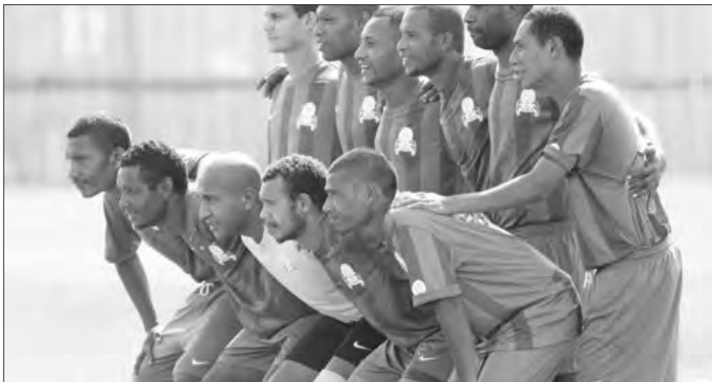
GO PAS: Gigira Central i go pas bihain long raun 6.

CPL Eastern Stars, husat ol i gat strongpela tingting long