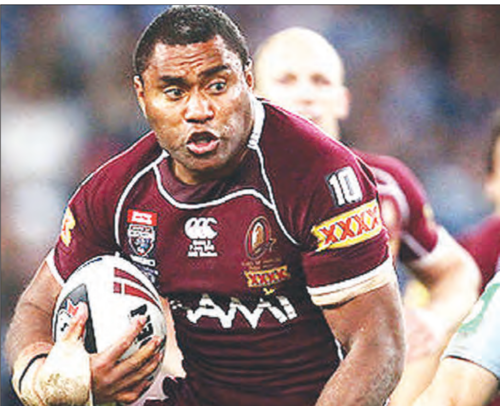
GO YET: Civoniceva i no pinis yet