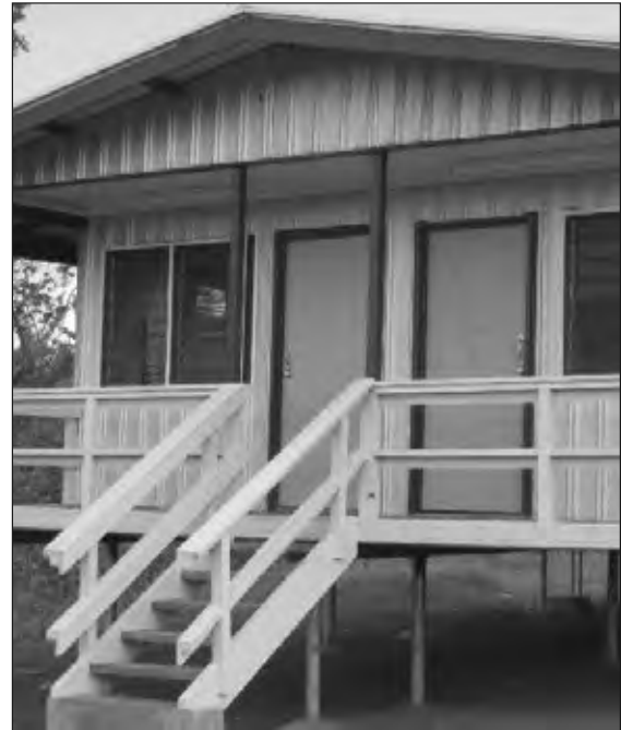
Nupela LOA ofis long Enekuai.