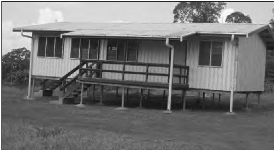
Ramu NiCo Glass Haus long Madang em bikipela opis bilong projek.

seremoni long Enekuai rilokesen eria i bin givim ki bilong 30-pela nupela haus i go long ol lain bilong long stap long en wantaim femili bilong ol. Kampani i karimaut wanpela spesel trening tu we ol Komyuniti Afes (CA) wokman meri i go givim skul toktok long wei bilong yusim na lukautim gut haus olsem long sait long pawa, yusim septic toilet, ples bilong waswas na kukim kaikai na ol narapela samting.