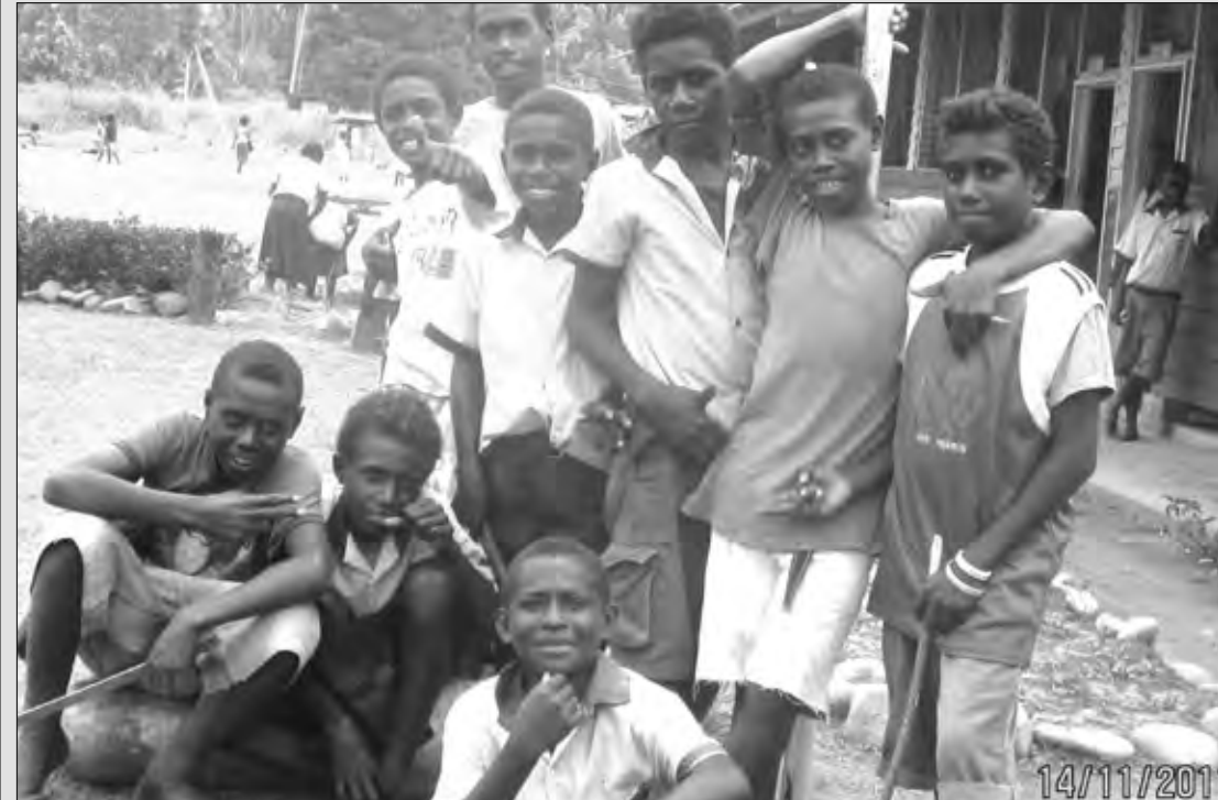
AMAMAS LONG SKUL: Sampela ol mangki sumatin bilong Wakunai Praimeri skul, Sentrel Bogenvil, long Otonomes Rijen bilong Bogenvil, i amamas long Wantok i kisim piksa bilong ol. Ol i stap long lans brek bilong ol.