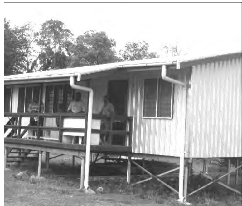
Nupela helt klinik long Enekuai.

Wankain samting tu bai i kamap long Danagari long bihain taim ol haus i pinis na ol manmeri i go stap long en.