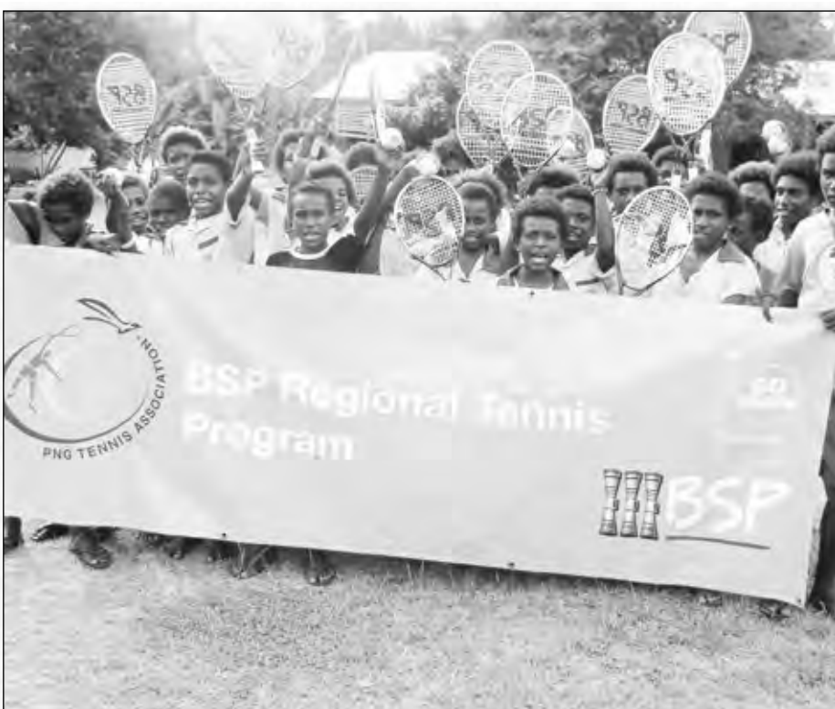
AMAMAS: Ol sumatin bilong Kavieng i amamas long lukim kosing klinik bilong Tennis i go gen long ples bilong ol. Dispela trening progrem i go bikpela na planti moa manmeri wok long lainim long pilai dispela spot.

TOKSAVE: Salim ol spots dro bilong yu kam long Feks; 325 2579, e-mel: amolen@wantok.com.pg o kam lusim long Wantok Niuspepa opis long Central Waigani, NCD.