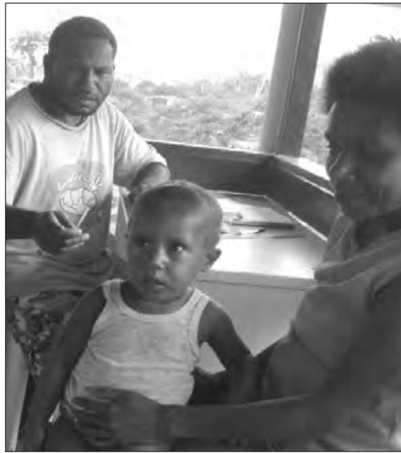
Wanpela mama na pikinini i kisim marasin long Enekuai klinik.

Long mun Mas long dispela yia Ramu NiCo insait long wanpela