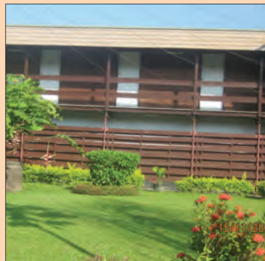
AWTTC: Ges haus na konprens na trening senta, Arawa Wimens Trening na Tekstail Senta i kam gut na givim gutpela sevis long ol ovasis na lokol turis, gavman na pablik bilong Bogenvil.