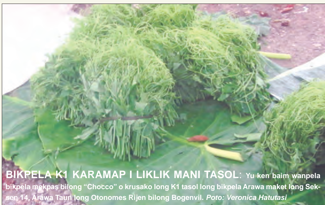
BIKPELA K1 KARAMAP I LIKLIK MANI TASOL: Yu ken baim wanpela bikpela mekpas bilong "Chocco" o krusako long K1 tasol long bikpela Arawa maket long Seksen 14, Arawa Taun long Otonomes Rijen bilong Bogenvil.