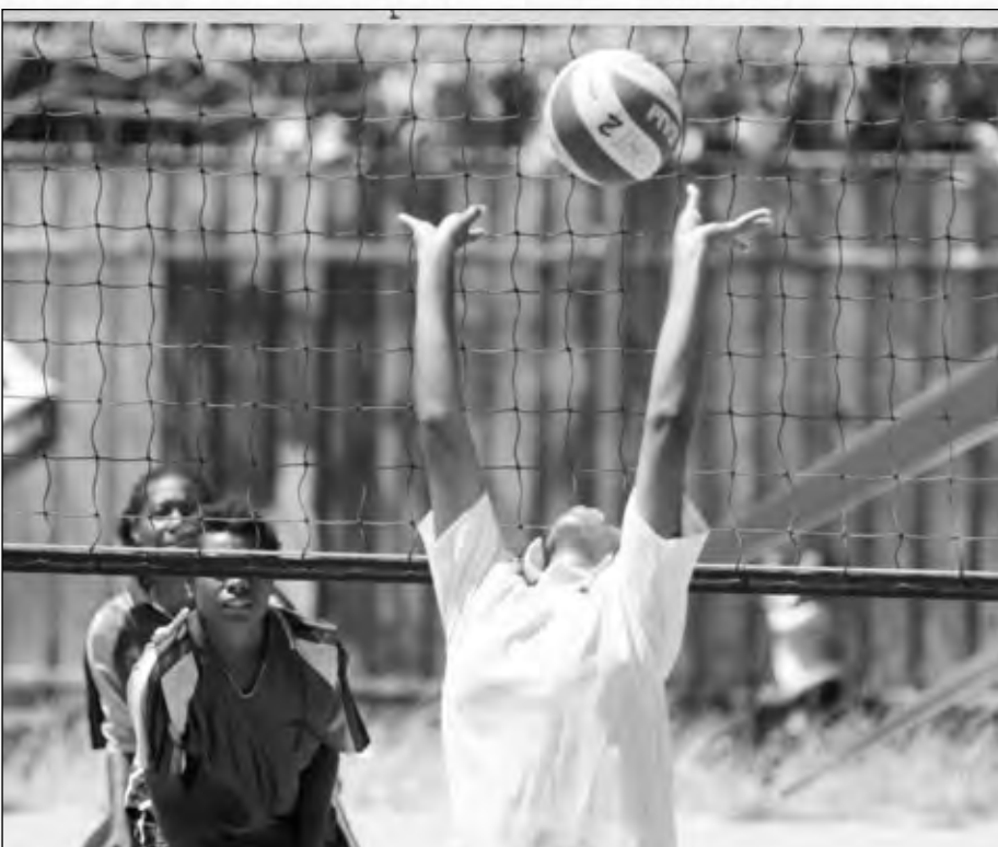
PUTIM: Wanpela Butibam pilaia i redim bal bilong wanpilai bilong em long paitim long gem bilong ol las wik Sarere long Mosbi long Nesanel Volibol Sempionsip.