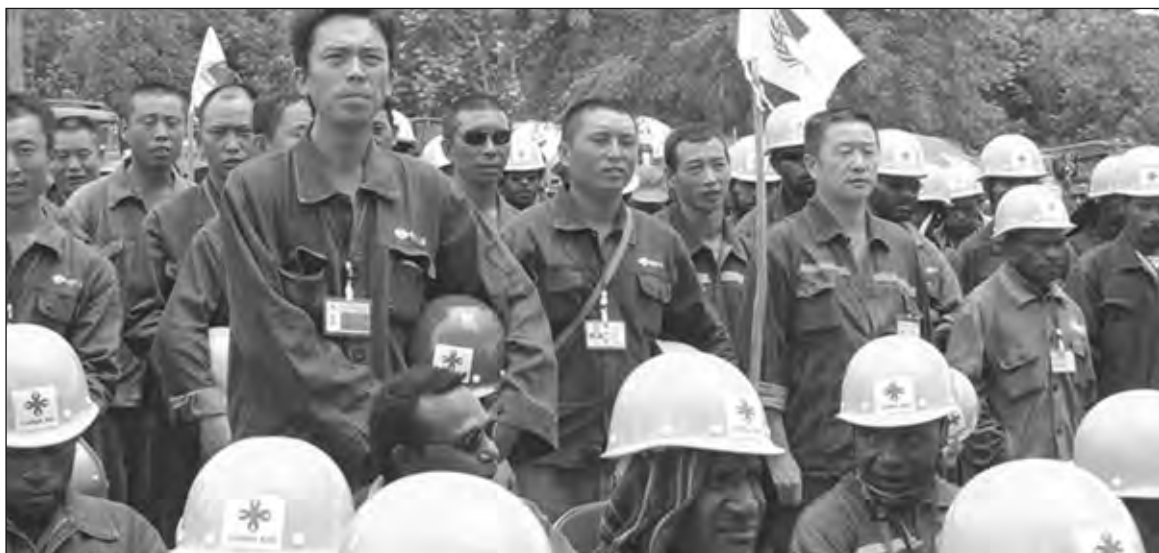
Ol kontraksen wokman wantaim ol wanwok bilong PNG i harim toktok long seremoni long las wik Fonde.