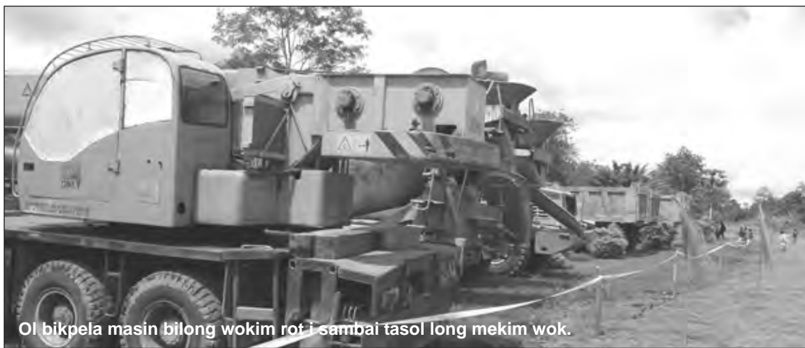
Ol bikpela masin bilong wokim rot i sambai tasol long mekim wok.