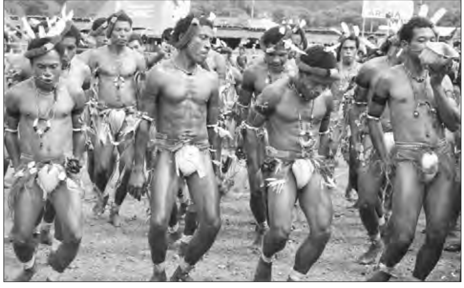
Ol Trobian dansas kilim skin long Kanu festival long Alotau.