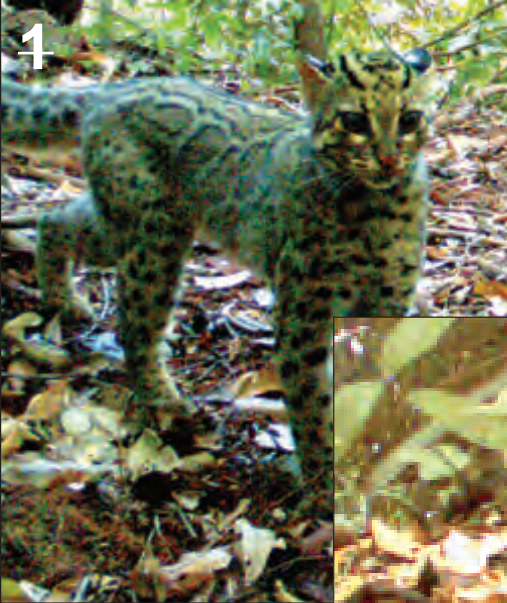
1. Marble wel pusi 2. Leopard wel pusi 3. Golden wel pusi 4. Sumatra taiga