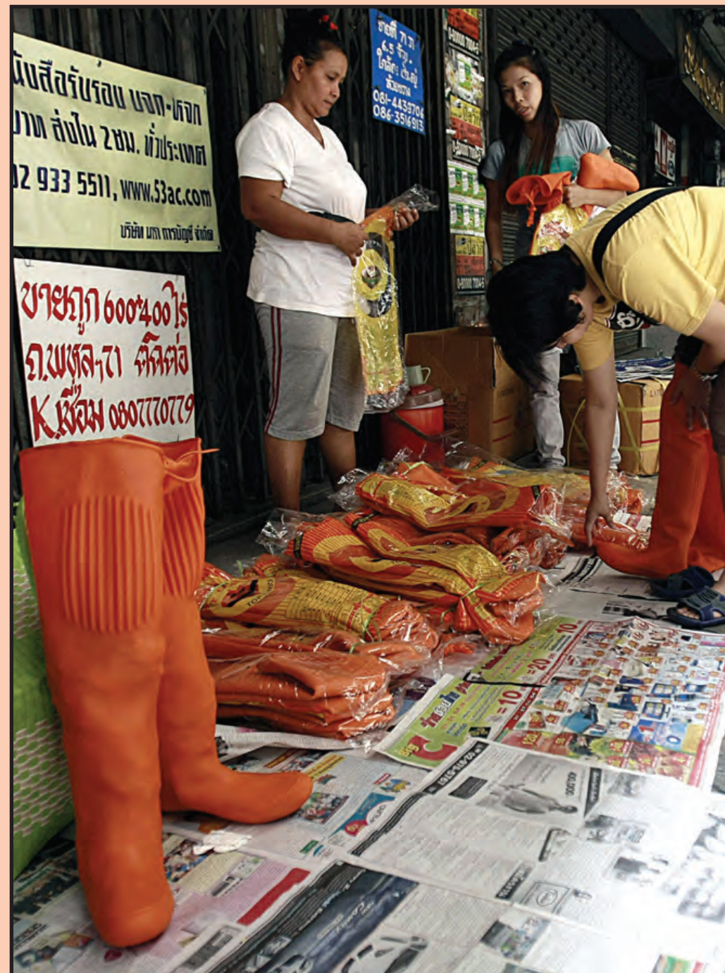
HAIWARA BISNIS: Ol haiwara hevi long kantri Tailen, i no wanpela hevi tasol. Ol lain manmeri long Tailen i wok long tanim i go kamap wok bisnis. Dispela meri i wok long salim ol raba but. Ol liklik bisnismanneri i wok long yusim dispela sans long mekim mani, na lus tingting long hevi bilong haiwara.