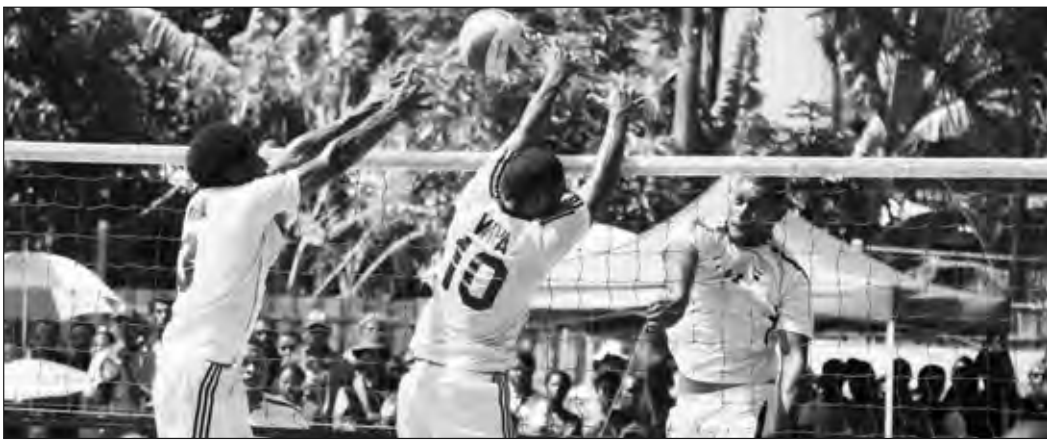
SEMPION TIM: OI VAVA pilaia i traim long pasim NCDVA long kwata fainol gem bilong ol las wik Sande.

Tasol ekspiriens na save bilong VAVA i helpim ol i sanap