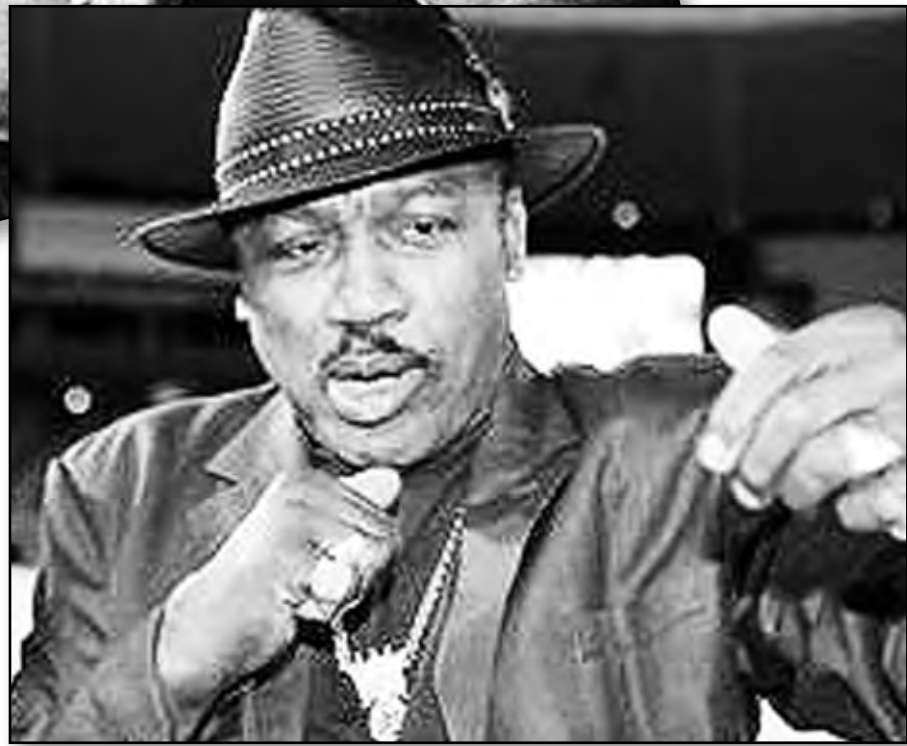
DISPELA YIA: Frazier long 2011 bipo long em i dai las wik.