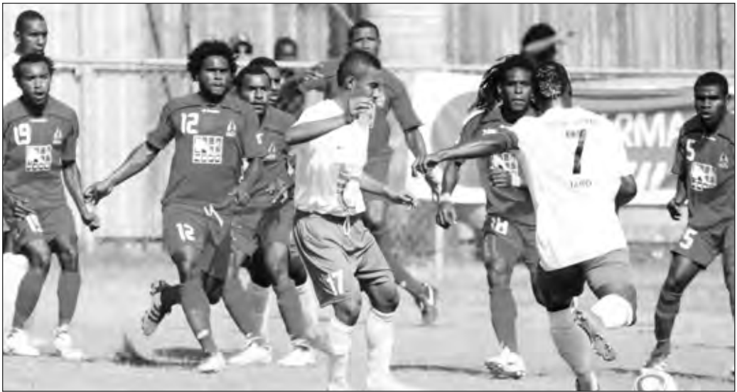
STRONGPELA GEM: OI Hekari pilaia i pasim wanpela fri kik bilong ol Stars long namba wan hap bilong gem.

Traim dispela ol samting mi tok, na lukim sapos em i wok gut long yu na Federesen bilong spot bilong yu.