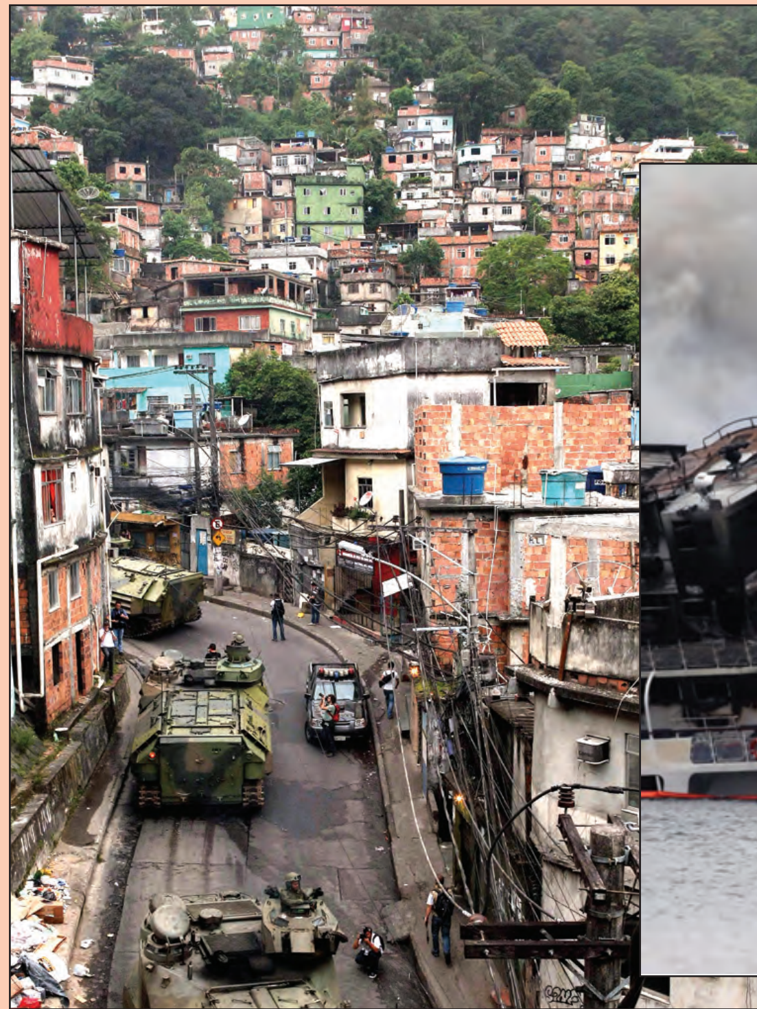
KLINIM SETELMEN: POLIS long kantri Brasil i wok long mekim bikpela operesen tru long dispela wik long klinim na rausim ol raskol man i stap hait insait long ol setelmen o Favela long biksiti bilong kantri, Rio de Janeiro. Siti bai lukautim 2014 Wol Kap, na nau gavman i laik kisim bek ol setelmen raunim siti long han bilong ol bikpela raskol geng husat i save salim ol paigan na strongpela drak olsem mariwana na kokein.