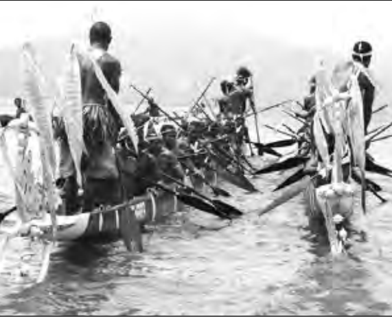
Ol kanu redi long resis..

Indipendens de bilong Papua Niugini, em planti save soim kala bilong wanwan provins bilong ol, ol bai bilas long provins bilong ol long soim olsem ol kam long dispela hap. Yumi mas strong tumbuna na kalsa bilong yumi long pulim planti turis, dispela ating wanwan lain long ples bai lukim sampela kain senis long laip bilong ol.