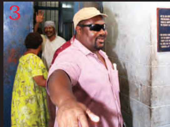
1: K5,000 BEIL: Mista Tiensten i wokabaut lusim rum gat long Boroko Polis Stesin long Tunde Apinun. 2: KISIM SAS: Pomio Memba Tiensten i kamap long Boroko polis stesen long go stap long rum gat. 3: TOK HALO: Tiensten i tok halo long ol midia lain bihain long loya man bilong em i kam wantaim beil pepa bilong em.