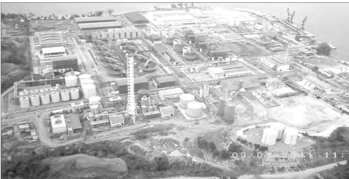
Basamuk refinery tete we supamaketai i sanap klostu long em.