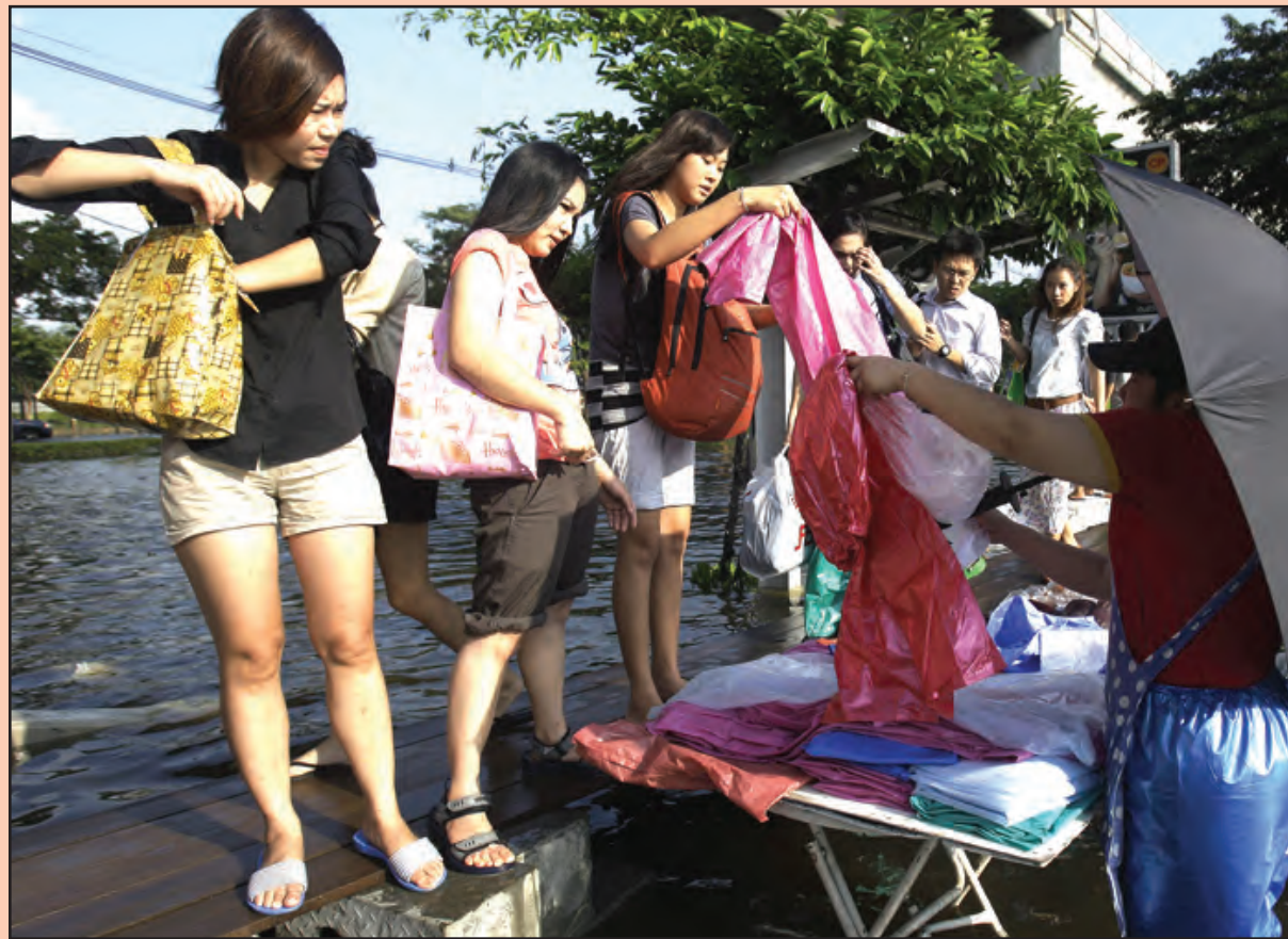
BAIM PLASTIK TRAUSIS: Taim bilong haiwara long Tailen, em i taim nau we planti manmeri i wok long painim klos we bai nap banisim skin bilong ol long wara. Ol meri Tailen i wok long sekim ol plastik trausis long sait bilong rot long Bangkok.