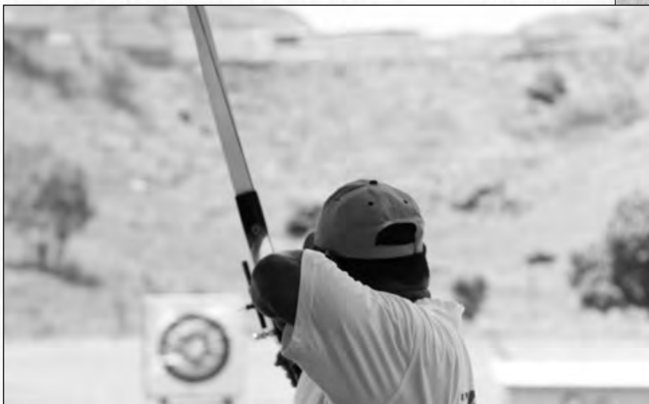
MAKIM: Wanpela asa (archer) i trening long sut wantaim bunara na spia long Mosbi las wik Sande.