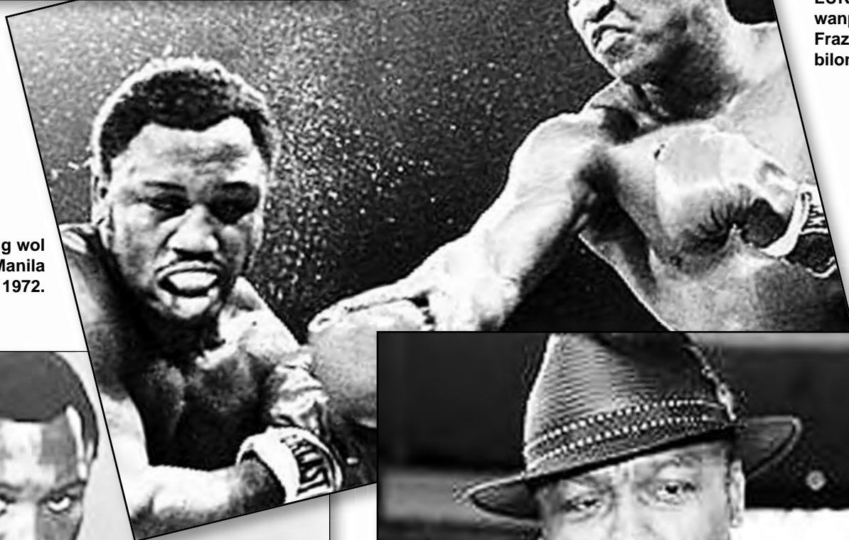
PAIT: Ali paitim Frazier long wol taitol pait bilong tupela long Manila long 1972.