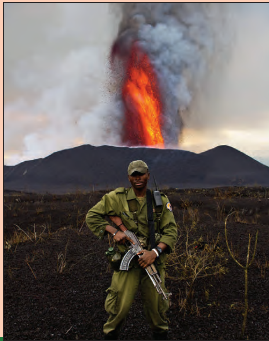
MAUNTEN PAIA: Dispela maunten paia long kantri Congo long Afrika, i wok long kamap olsem wok bisnis bilong turisim indastri. Maunten Nyamulagira i wok long tromoi ol hatpela ston na paia i go antap, na ol lain long Virunga Nesanel Pak i wok long askim ol turis long wanpela ovanait trek long wanpela kain pairap em i save mekim. We ol hatpela wara paia i ron i kam daun long sait bilong maunten paia.