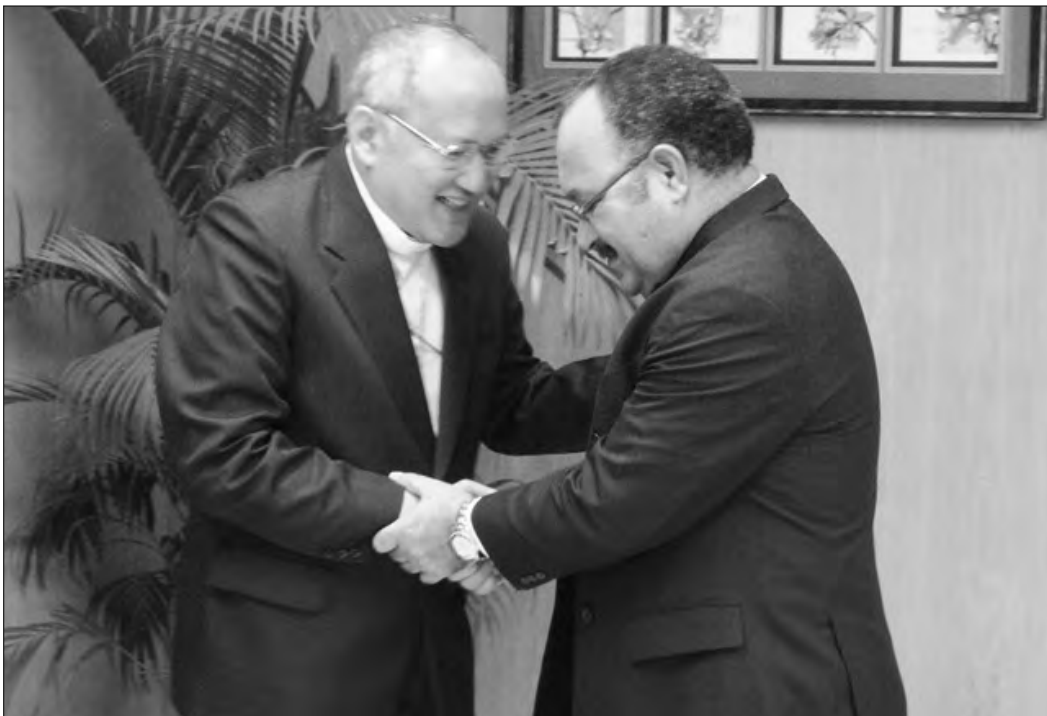
SEKAN: Nunsio Asbisop Francesco Padilla, i sekan wantaim Praim Minista O'Neill pastaim long bung.

"Ol sios i go pas long wok bilong kisim sevis i go aut na kon-