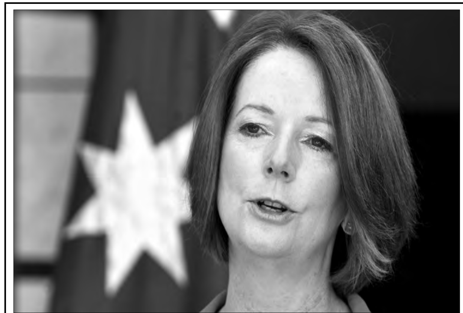
SENISIM LAIK: Gillard, i laik senisim polisi bilong Leba Pati, na salim yurenium long India. Maski India i no sainim yet Nuklia Non-Proliferesen Triti.

(IMF), i tok fainensal sistem bilong Saina inap bungim hevi long wanem long ol dinau nogut, moa praivet lending, na bikpela pundaun tru long ol prais bilong propeti.