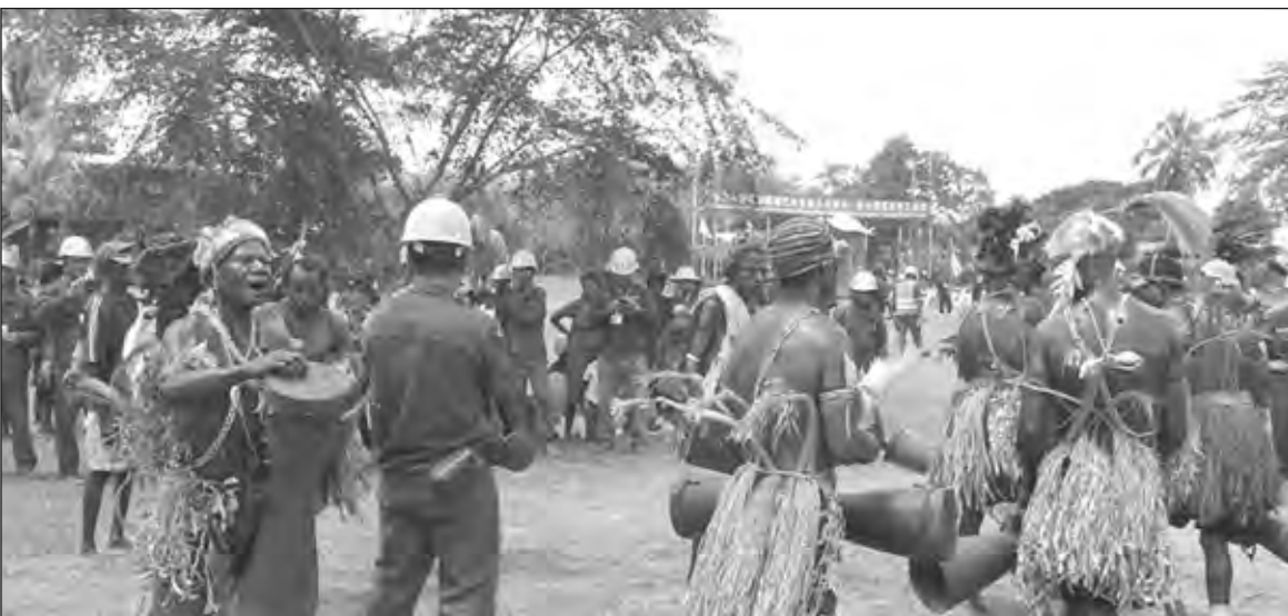
Ol singsing grup bilong Usino i samsam Ol China rot kontraksen wokman i mangalim ol lain i samsam.