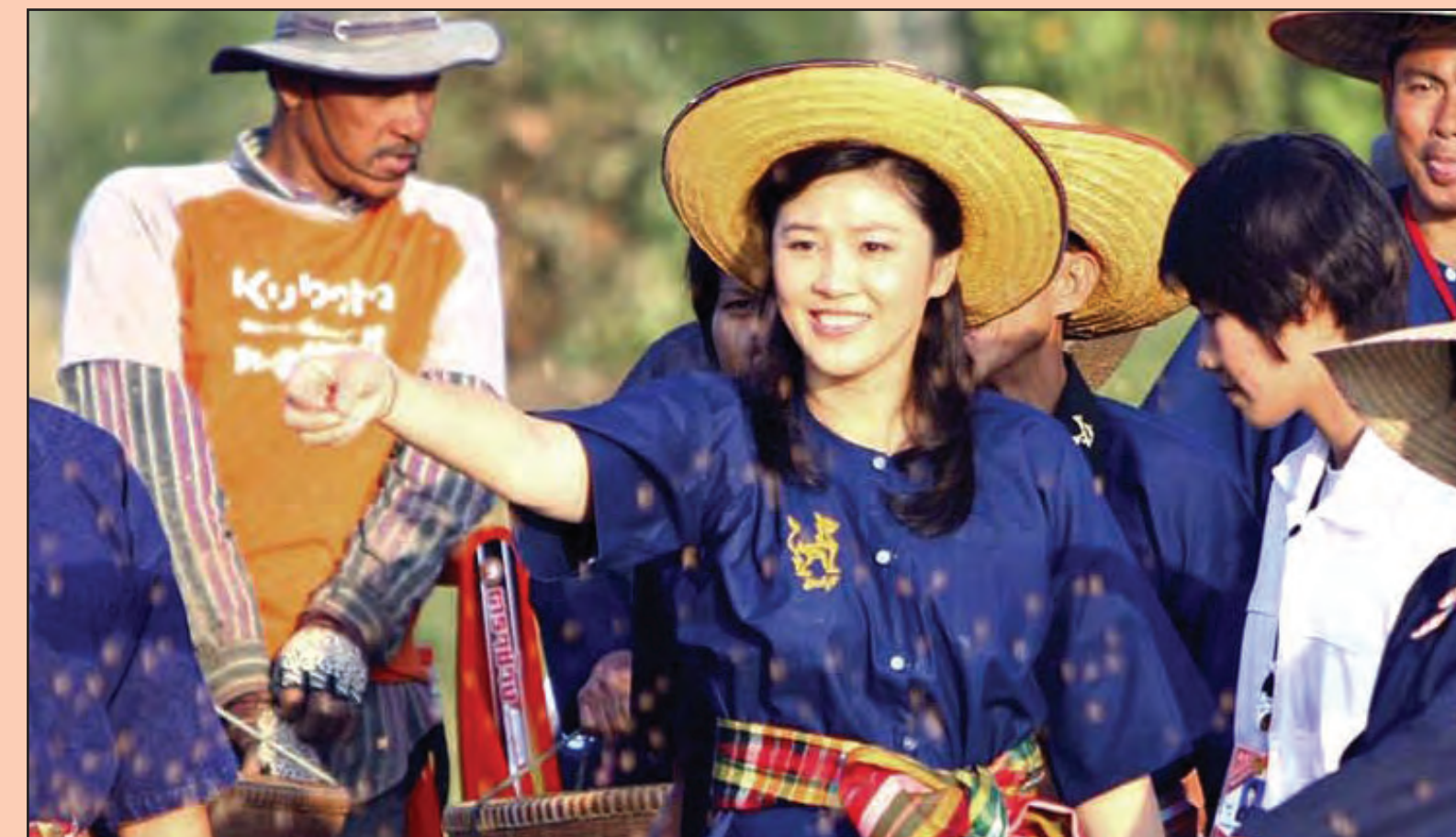
SHINAWATRA GO DAUN LONG PIPEL: Long Tunde dispela wik, Prait Minista bilong Tailen, Yingluck Shinawatra i werim klos bilong meri fama na tromoi ol lfektiv Maikro-ogenisim o EM bal long kilim ol binatang nogut insait long ol haiwara. Faiv handret manmeri i dai pinis long ol dispela haiwara, 3 milian pipel i karim hevi, na 15,000 indastrial fektori i pasim dua bilong ol.