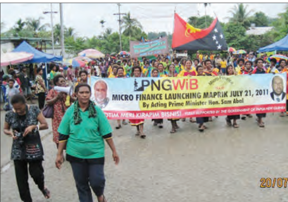
GO PAS: Ol meri Maprik i wokabout mas i go pas long bikpela bung bilong ol.