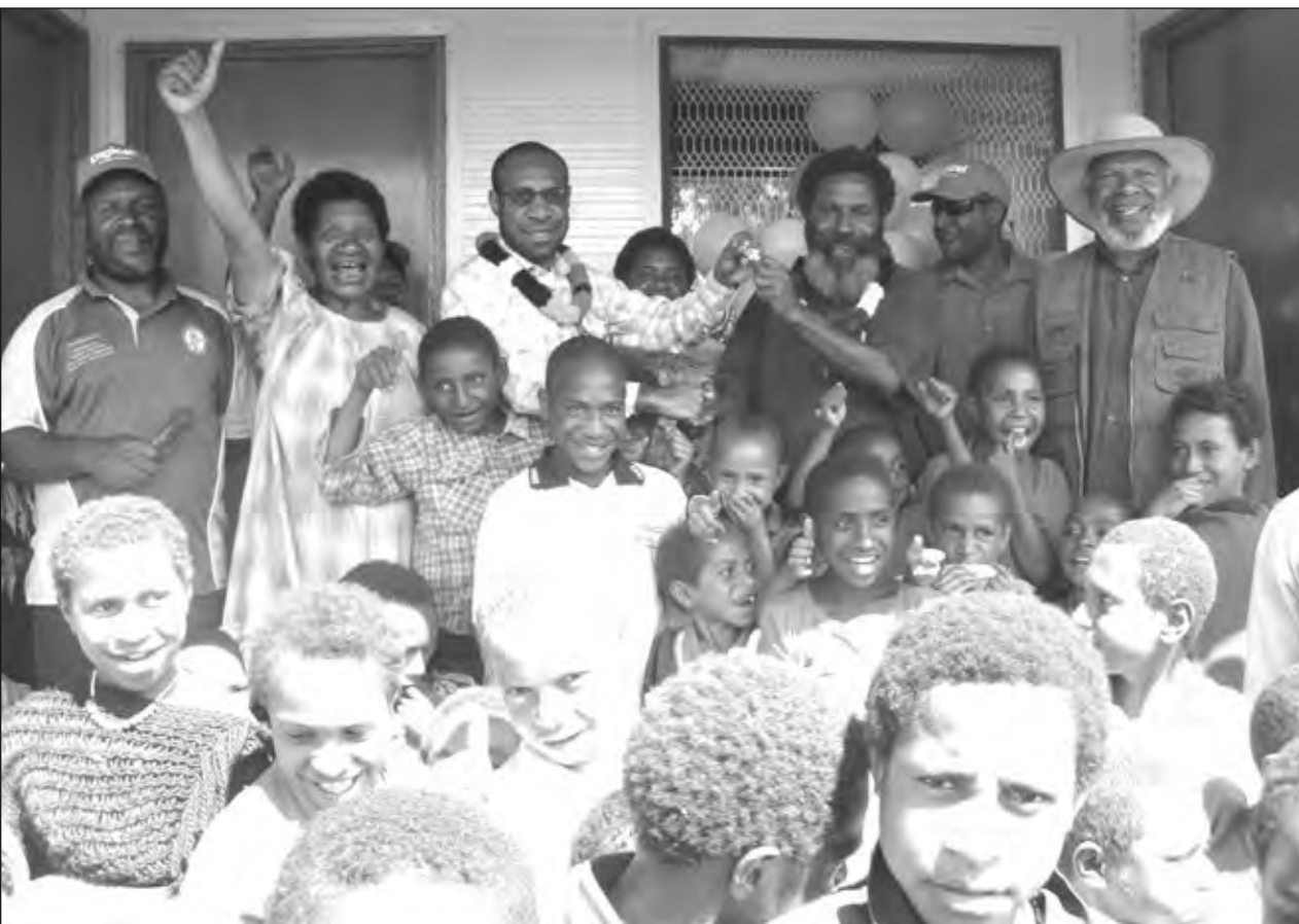
AMAMAS: Komyuniti na ol skul sumatin i amamas long nupela dabel klasrum bai helpim ol pikinini i kisim save.

sumatin long olgeta level na mani i stap, tasol ol woklain long edministresen i mas mekim wok long stretim na salim dispela hap skul bilong ol Nu Ailan sumatin long NPI, Lae long Morobe provins.