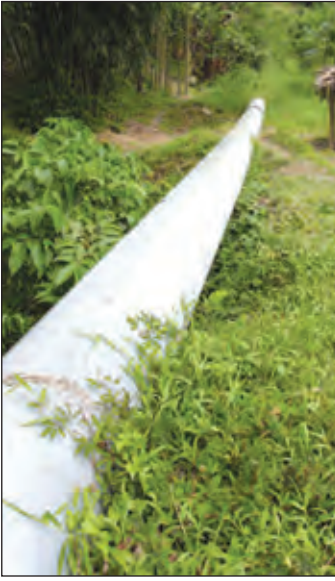
Paip bilong karim main pipia i go long solwara.

Sapos kot i tok nogat nau, em i bagarapim tingting bilong ol arapela kampani i laik kam wok long PNG. Olsem na ol i noken pasim Ramu Nikel long yusim paip na kampani i ken stat long tromoi main pipia i go long solwara long Madang.