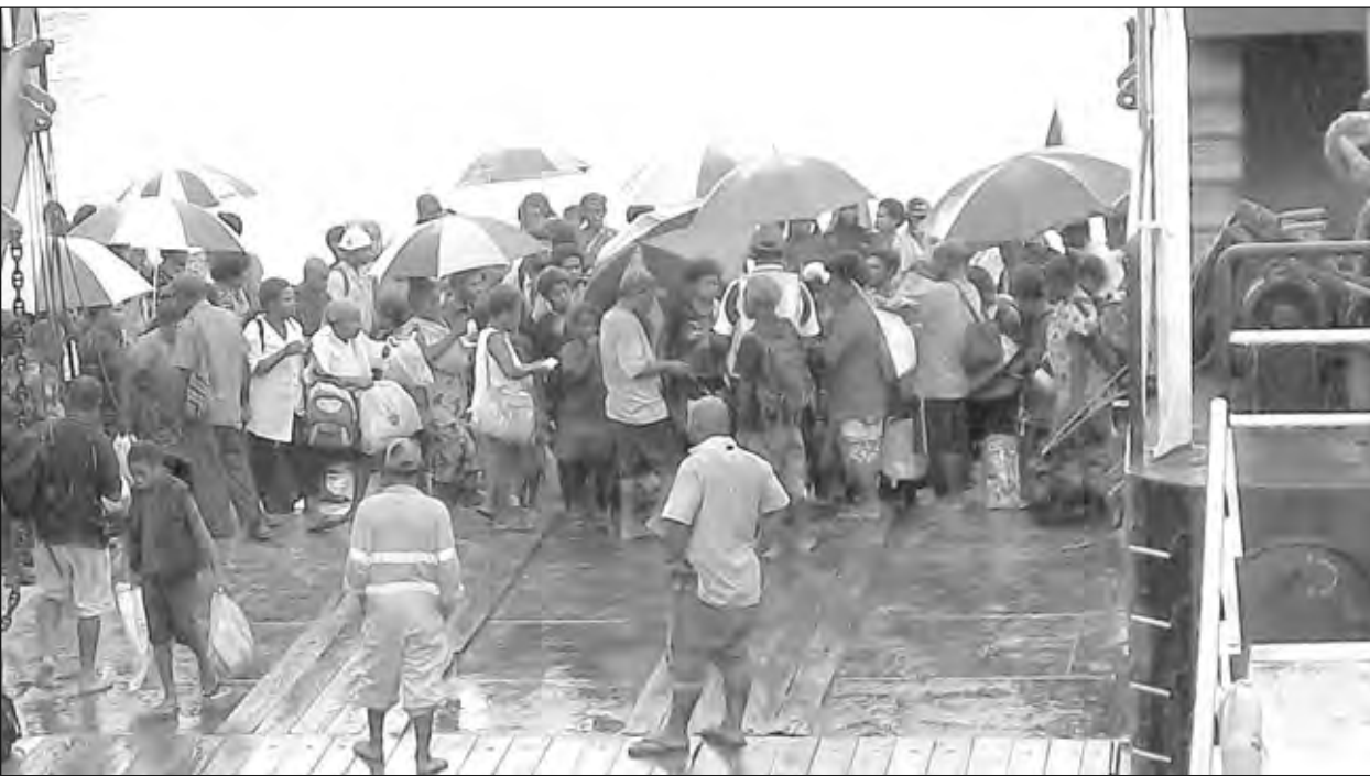
REDI LONG KALAP LONG SIP: Manus Bris i pulap long ol Katolik meri husat i laik kalap long sip na go long Kimbe.

Long taim bilong lonsim progrem, sampela meri Pasifik i bin tokaut long ol samting i kamapim hevi long ol komyuniti bilong ol. Em ol samting olsem ol yangpela meri i marit taim krismas bilong ol ino inap yet na vailens engensim ol meri.