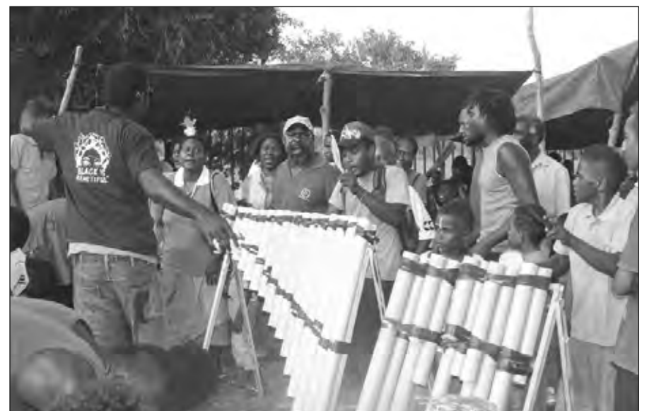
Ol Bogenvil bilong Rainbow Estet i soim kala bilong ol long Bogenvil De tupela wik i go pinis.

namba wan provins long holim bilong ol, bihain ol Oro provins na long wiken i go pinis ol Niu Ailan bin holim bilong ol.