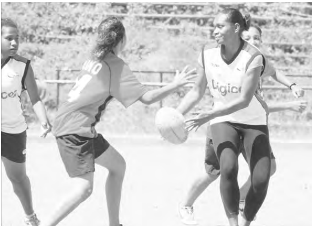
TROMOI: Wanpela pilaia bilong Digicel i laik tromoi bal long poro bilong em long tas ragbi gem bilong ol long Mosbi insait long ol semi fainol resis bilong Mosbi kopret tas futbol.