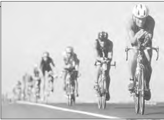
WILWIL: Bihain long wara, ol pilaia bai go stret long wilwil.