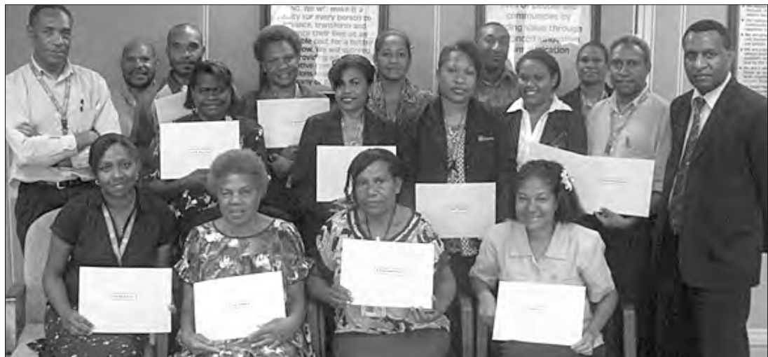
Participants of the MS Excel Training with their accomplishment certificates after undertaking the weeklong in-house MS Excel Intermediate training facilitated by Telikom.

Em i tok em bin kisim nupela save we em bai yusim long wok bilong em olgeta de.