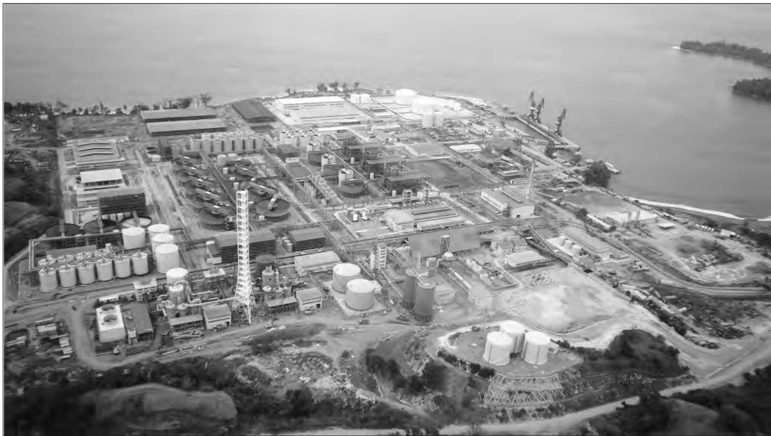
REDI: Basamuk refinari we DSTP bai kamapa

Oda we i stopim Ramu NiCo long Kamapim DSTP i bin stat long