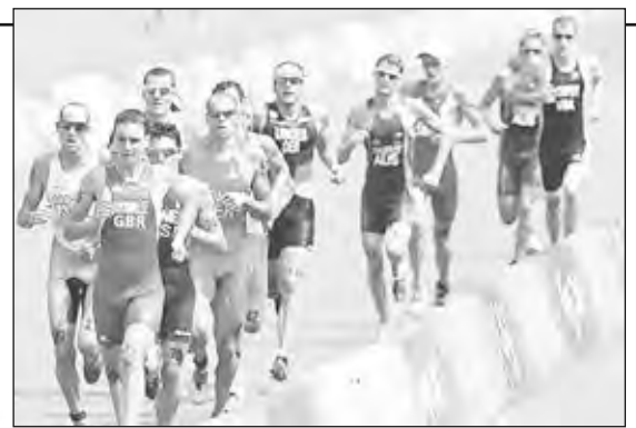
TROMOI LEK: Laspela hap bilong resis em long ron.