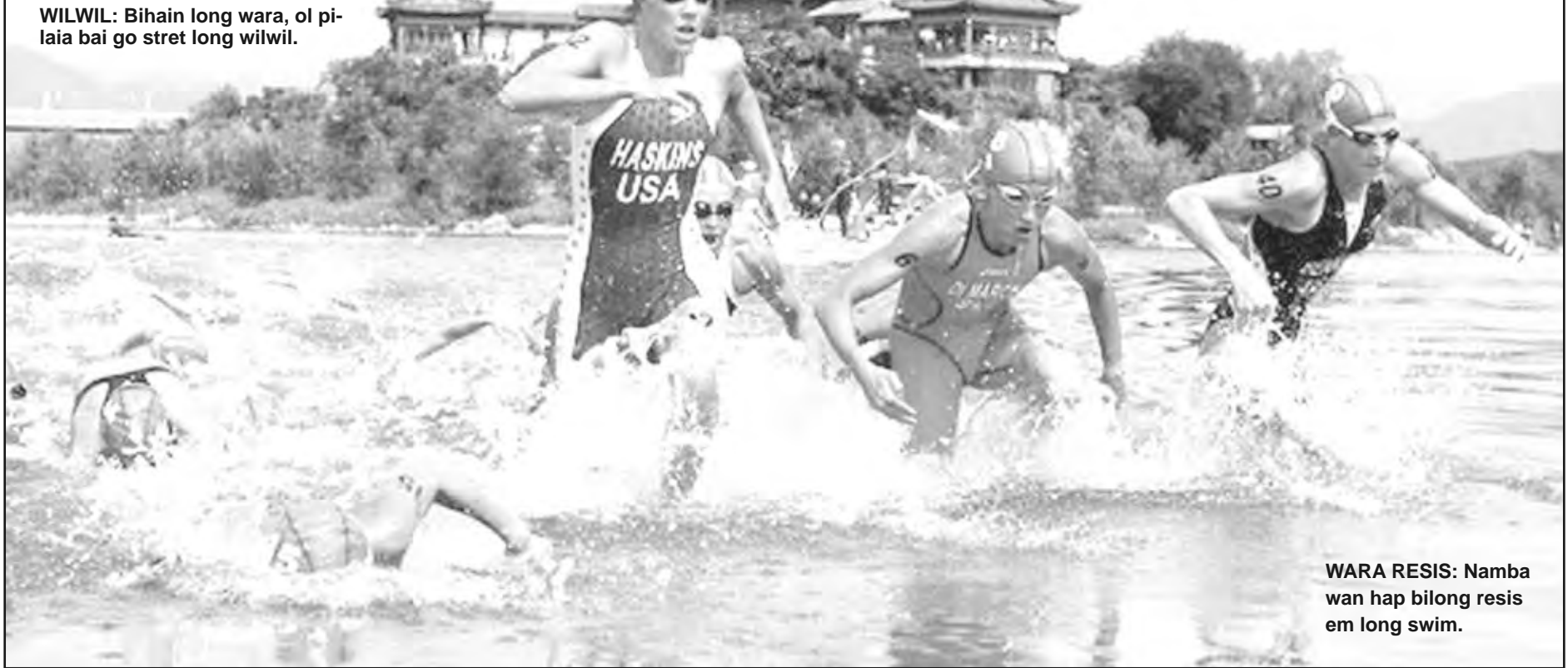
WARA RESIS: Namba wan hap bilong resis em long swim.