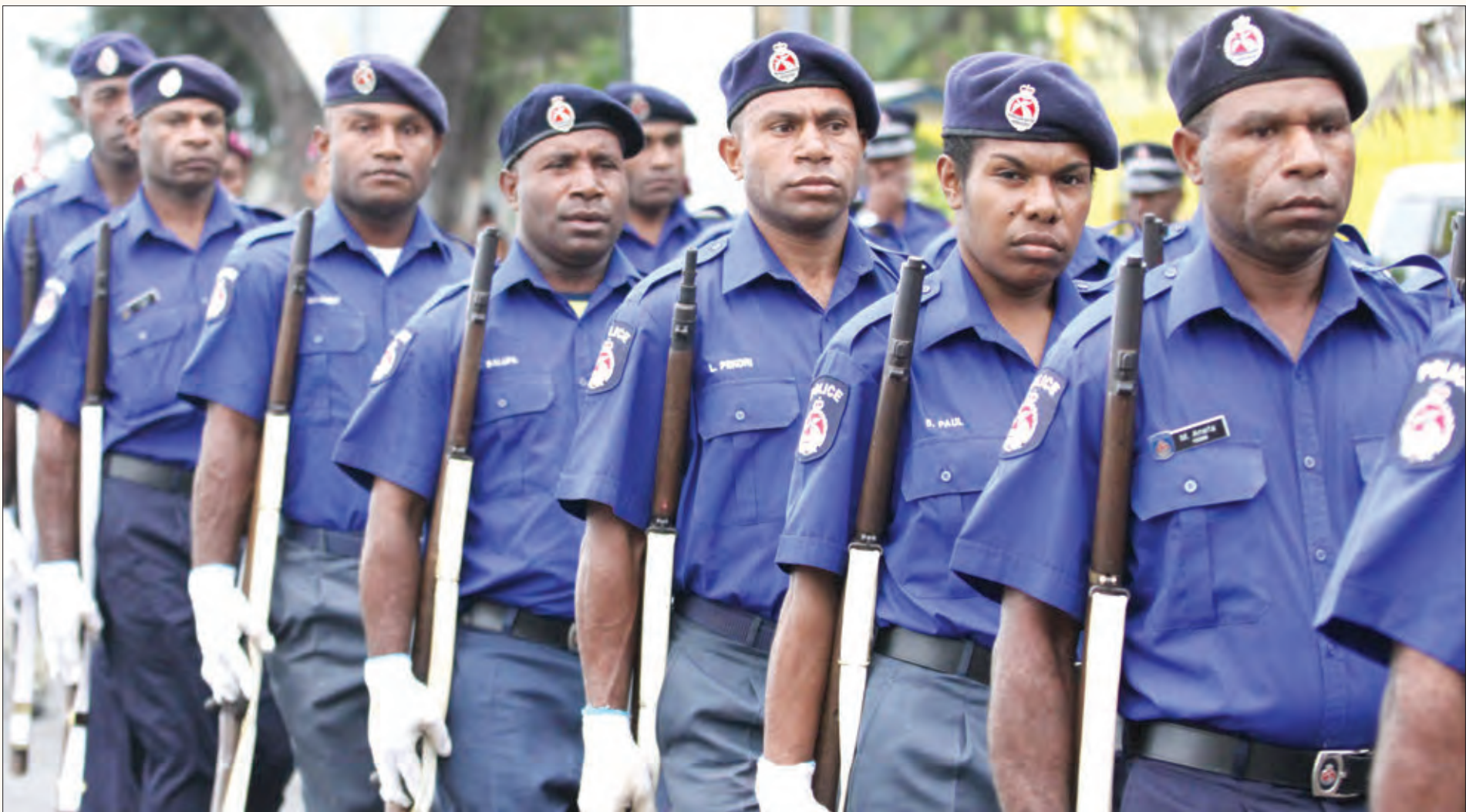
TINGIM PAITMAN: Rimembarens de em taim yumi save tingim ol paitman husat i pait long woa bipo. Long Sarere wik i go pinis, ol disaplin fos i mas Ela Nambis long Pot Mosbi long long tingim dispela de. Ol ami, polis na woda long Mosbi bin namba wantaim ol mas long longpela rot.