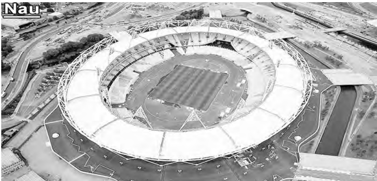
NAU NA BIHAIN: Piksa i soim wok i kamap yet long mama stedium bilong 2012 Olimpiks na piksa bilong em bai luk olsem wanem bihain taim.

"London 2012, nau i stap long gutpela ples bilong kamapim gutpela na strongpela gem na tu long givim gutpela luksave na bilip i go bek long ol manmeri bilong Briten," Rogge i tok.