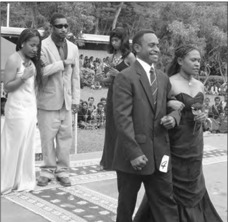
Ol lain sumatin i soim klos long werim na go aut long nait long ol pati o kibung.