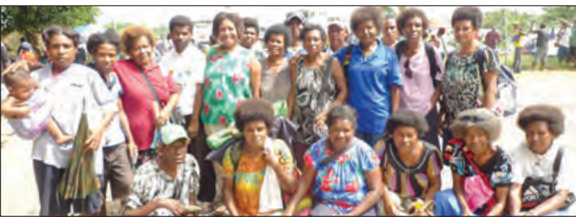
Ol meri bilong Madang husat i memba bilong PNGWiB i bin bung long Star Siping bris long kisim sip Kimbe Kwin long go long Wewak.