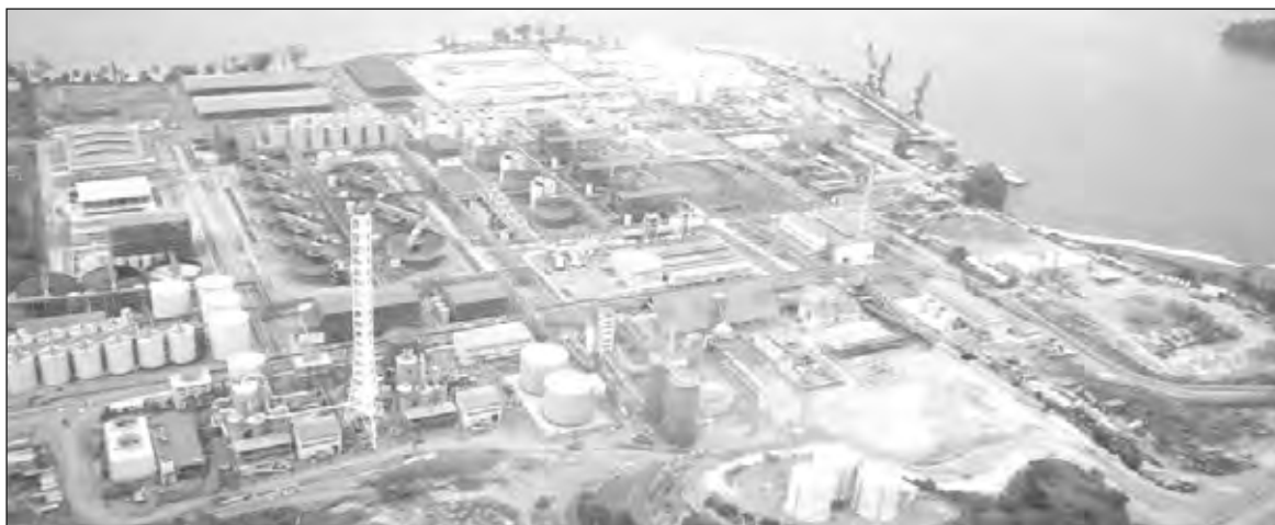
Basamuk refinery tete we supamaketa bai i sanap klostu long em

go aut long ovasis na Basamuk Entaprais Ltd em ambrela kampani bilong ol papagraun husat i stap klostu long Ramu NiCo rifaineri plent na i makim intares bilong ol papagraun long sait bilong komesal wok bisnis.