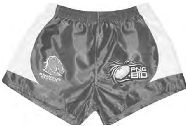
TRASIS: Mak bilong PNG NRL Bid i bin pas long trasis bilong ol Broncos long stat bilong dispela yia.

Dispela ol soks ol i werim nau bai bihainim kala bi-