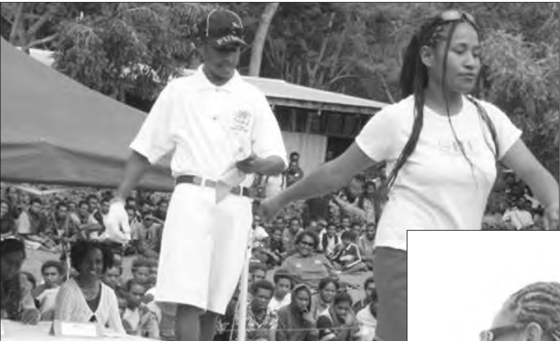
Gret 12 sumatin Debbie Seronte (raithan) i soim golf spot wea long stes wantaim arapela man sumatin.