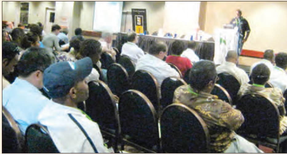
Ol lain i harim ol toktok long PNG Mains na Petroleum Semina long envairomen.