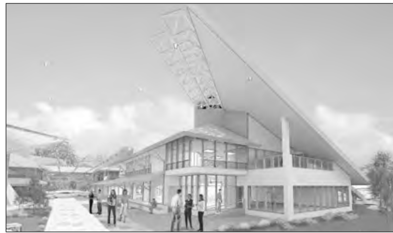
NUPELA SMIT INSTITUT: Nupela skul bai senisim pes bilong Tabubil.