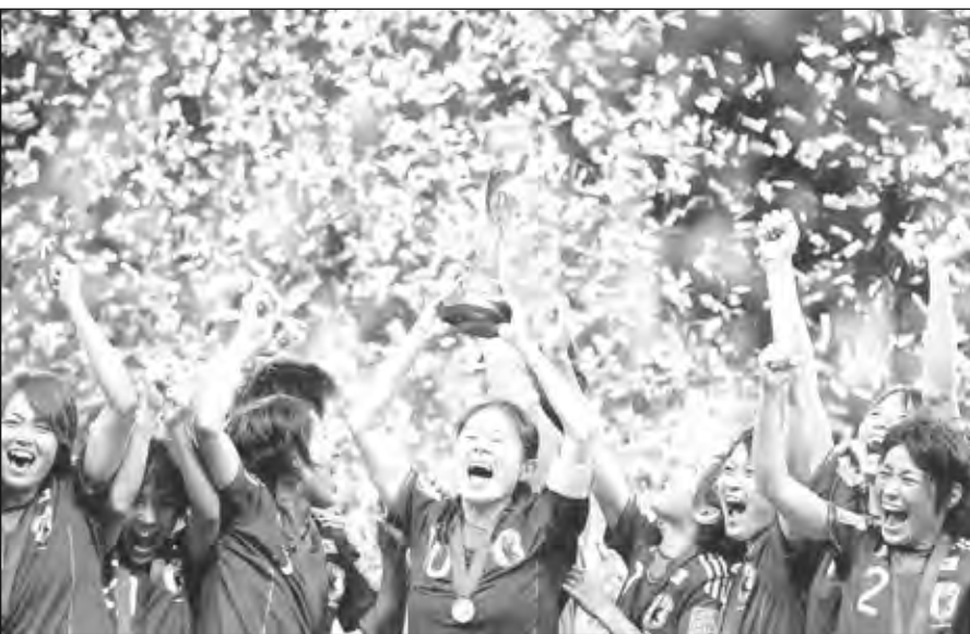
APIM: Siapan tim i amamas wantaim wol kap trofi.