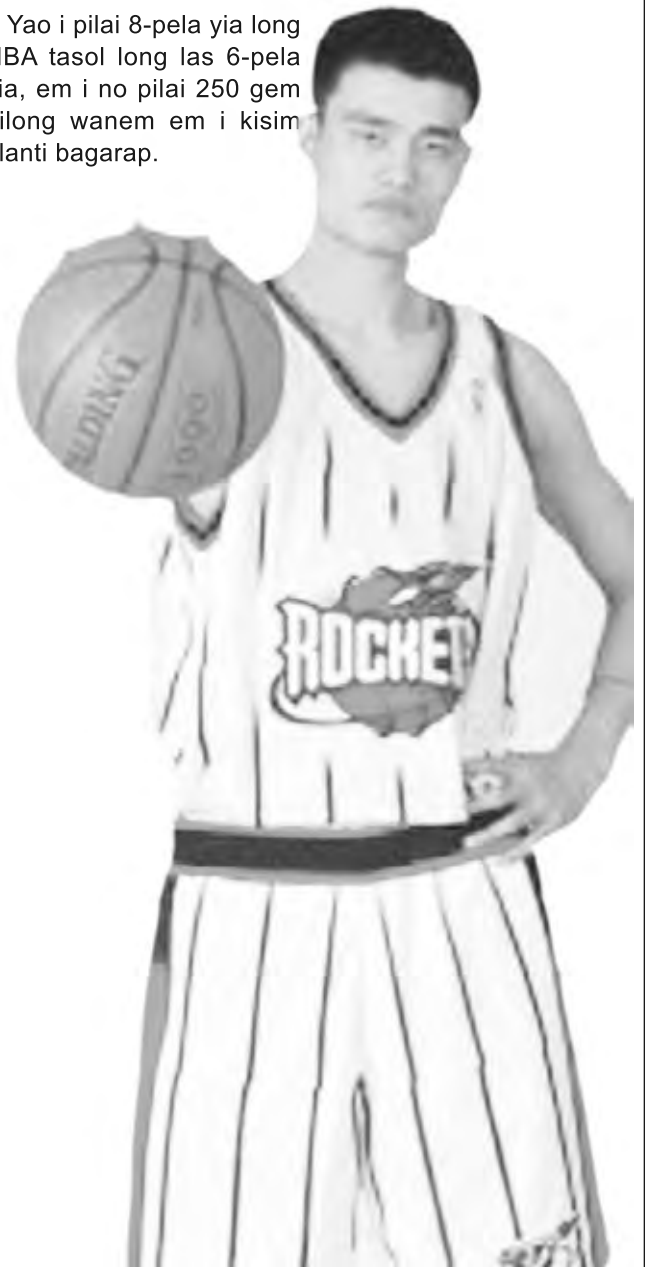
PINIS: Ming i tokaut dispela wik olsem em i pinis long pilai basketbol.

Yao i pilai 8-pela yia long NBA tasol long las 6-pela yia, em i no pilai 250 gem bilong wanem em i kisim planti bagarap.