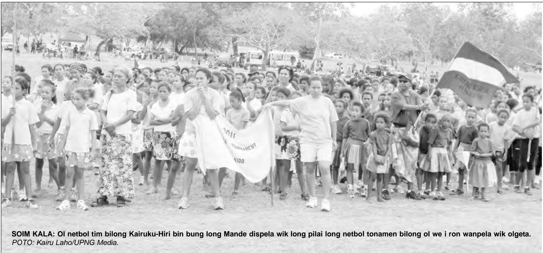
SOIM KALA: Ol netbol tim bilong Kairuku-Hiri bin bung long Mande dispela wik long pilai long netbol tonamen bilong ol we i ron wanpela wik olgeta.