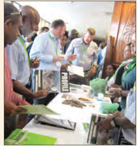
Ol lain i rejista long go long PNG Mains na Petroleum Semina long Tunde.