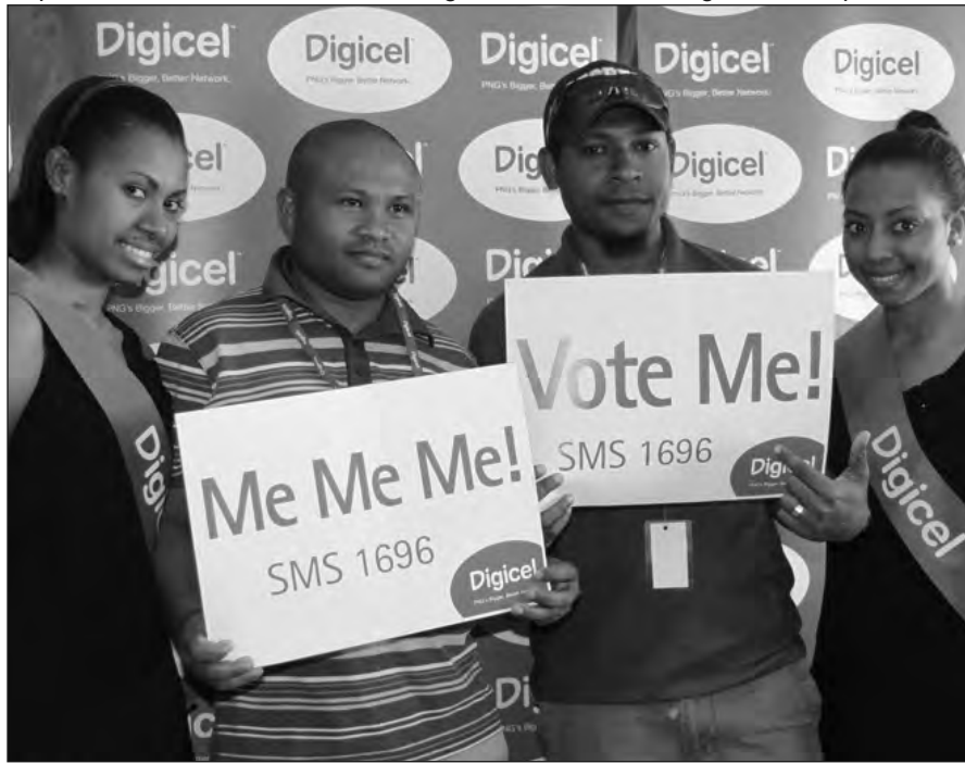
Nau yu ken SMS na votim feveret musik man o meri bilong yu...

Putim iau long Yumi FM na bai yu painaim aut long wanem taim yu ken SMS long makim singsing bilong yu na wanem musik manmeri yu save bihain.