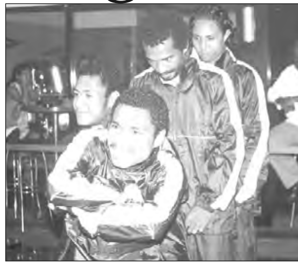
Antap: Ol mangi soim stail bilong ol.