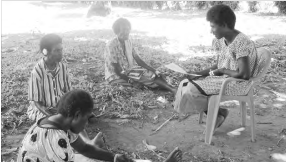
WOKSOP GRUP: Sampela ol meri i bin sindaun long woksop long Teoboana Wesleyan Metodis Sios, Teop, ARB.

Wanpela meri Uganda i bin statim dispela grup na olsem, ol