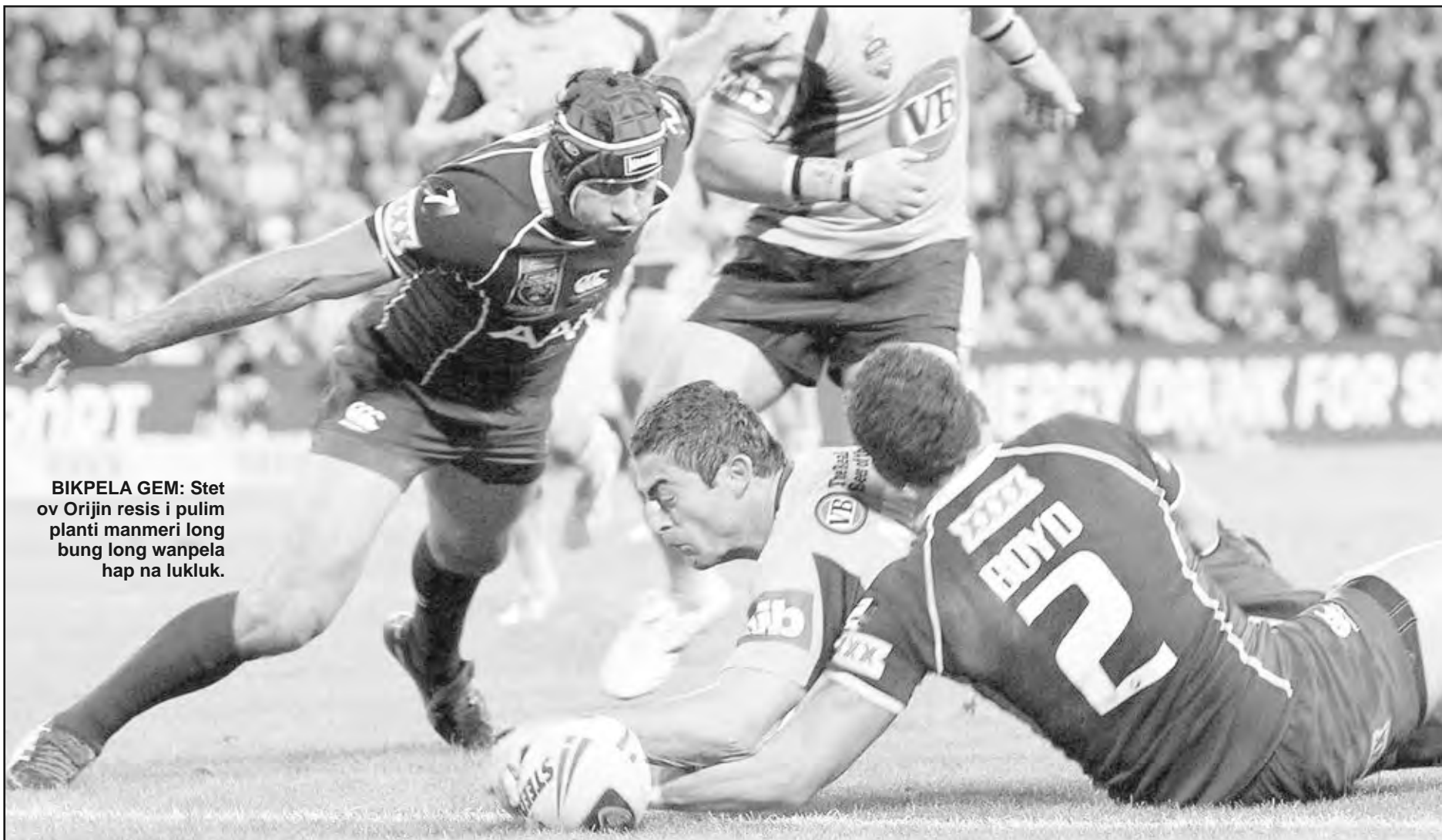
BIKPELA GEM: Stet ov Orijin resis i pulim planti manmeri long bung long wangepa hap na lukluk.