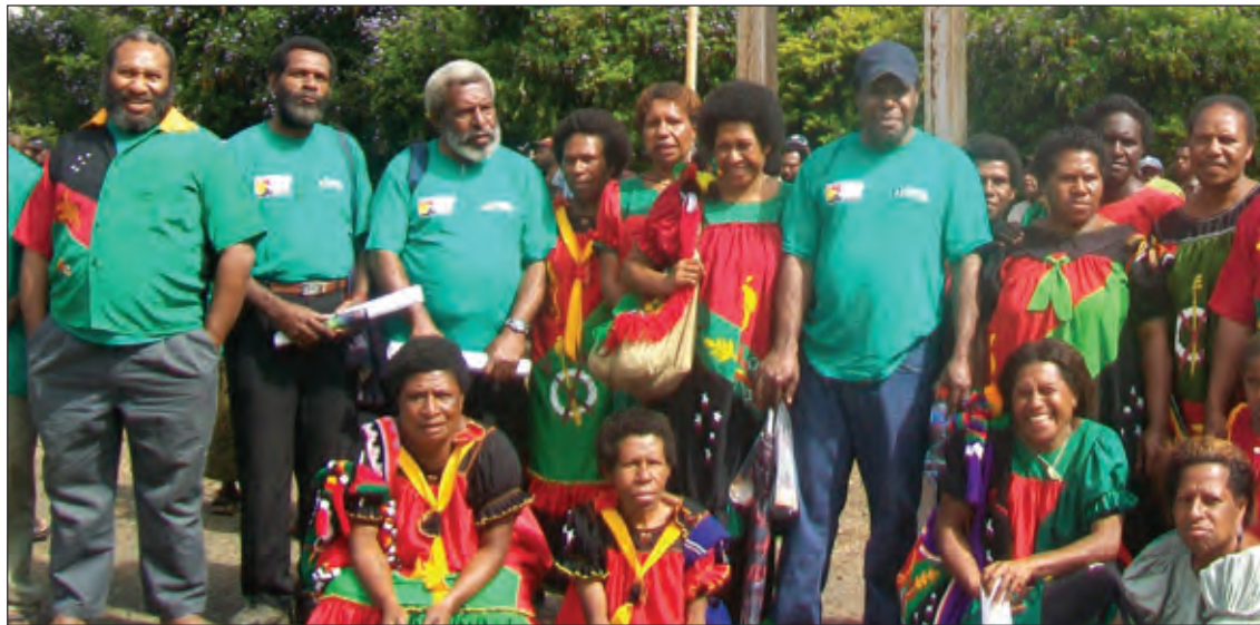
MIPELA REDI: NGO Simbu ileksen awenes tim i amamas wantaim ol ileksen opisa long kisim poto. awenes tim i amamas wantaim eleksen opisas long kisim poto.

Simbu i nau i soim tru wok bung wantaim gavaman na