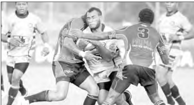
TAITIM BUN: Wangepa Vipers pilaia i traime long brukim banis bilong ol Isapea long Digicel kap gem bilong ol las wik Sande long Mosbi.