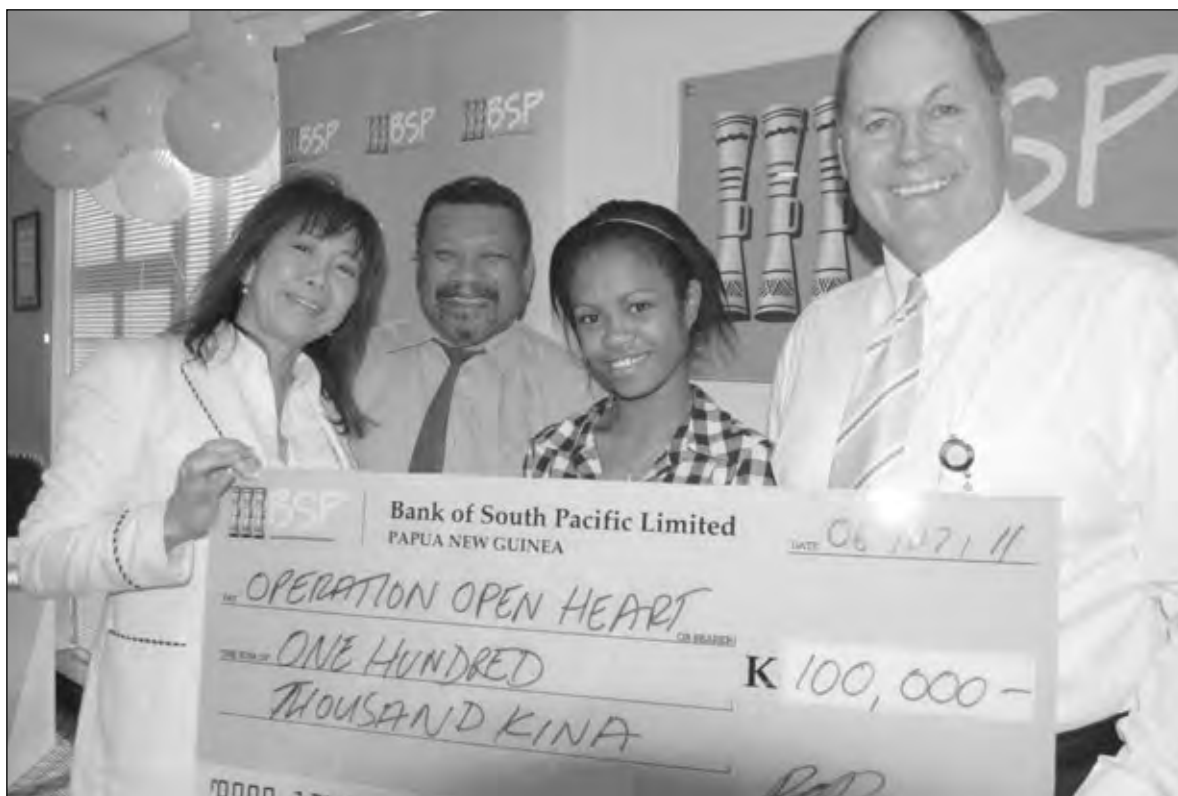
Operesen opim lewa kisim helpim kam long BSP.