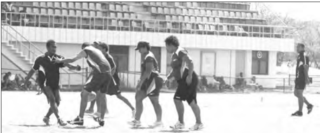
TAS: OI PNGSDP pilaia i tasim wangepa pilaia bilong ANZ long miks gem bilong ol las wik Sande long Mosbi.