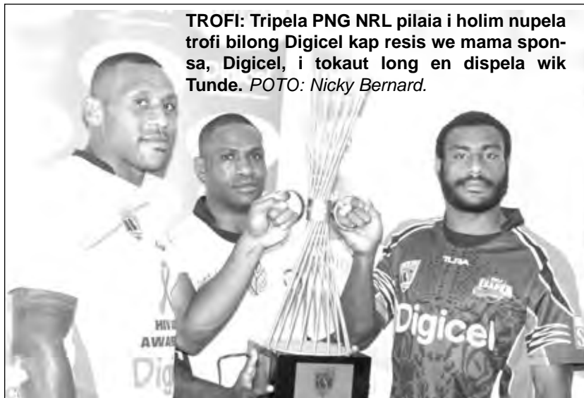
TROFI: Tripela PNG NRL pilaia i holim nupela trofi bilong Digicel kap resis we mama spon-sa, Digicel, i tokaut long en dispela wik Tunde.