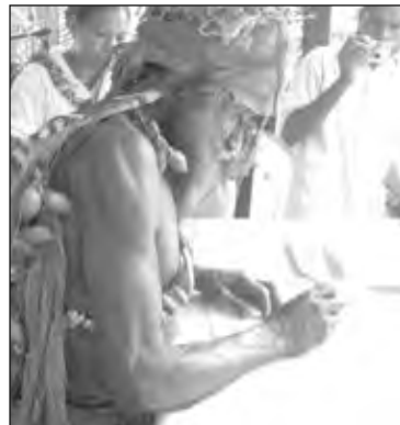
Lapun Sabua Obura bilong Gisa klen i sainim MoU.

dispela MoU, ol i bin amamas stret olsem bai i gat gutpla senis long ples bilong ol bilong wanem Usino-Bundi na Usino Mausrot em sampela hap we gavman sevis i no save go.