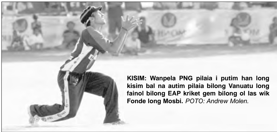
KISIM: Wangepa PNG pilaia i putim han long kisim bal na autim pilaia bilong Vanuatu long fainol bilong EAP kriket gem bilong ol las wik Fonde long Mosbi.