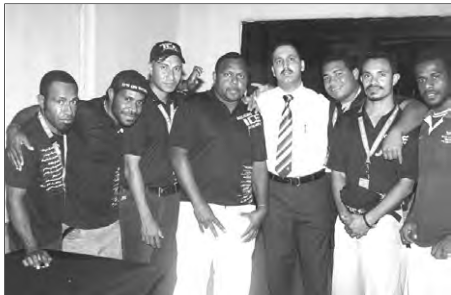
Tim bilong Ice Bia we ol i promotim Ice danis resis..

Sapos yu laik lukim ol dispela yangpela manmeri husat save danis, go long olgeta Sarere long Lamana Hotel na bai yu gat sans long lukim ol na winim sampela prais i kam long SP Bruri na Niugini Ice bia.