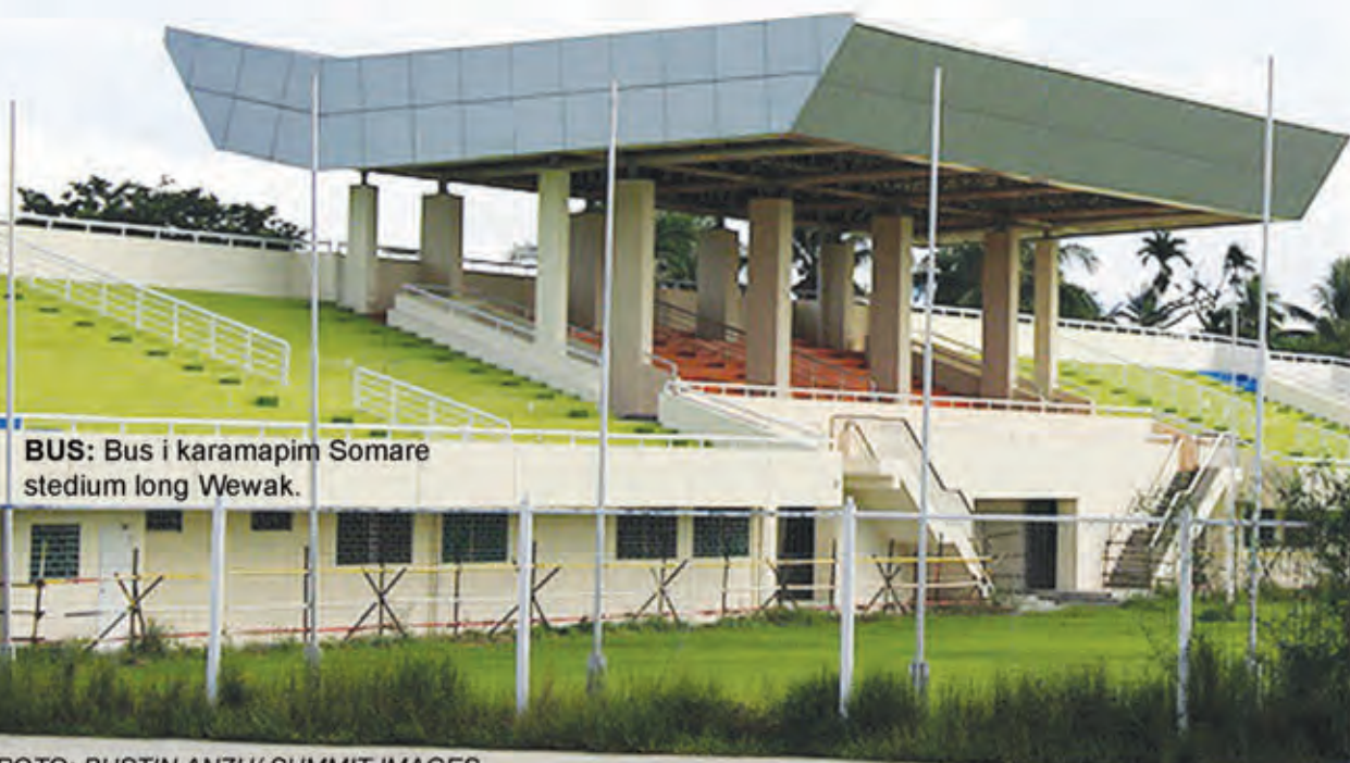
BUS: Bus i karamapim Somare stadium long Wewak.