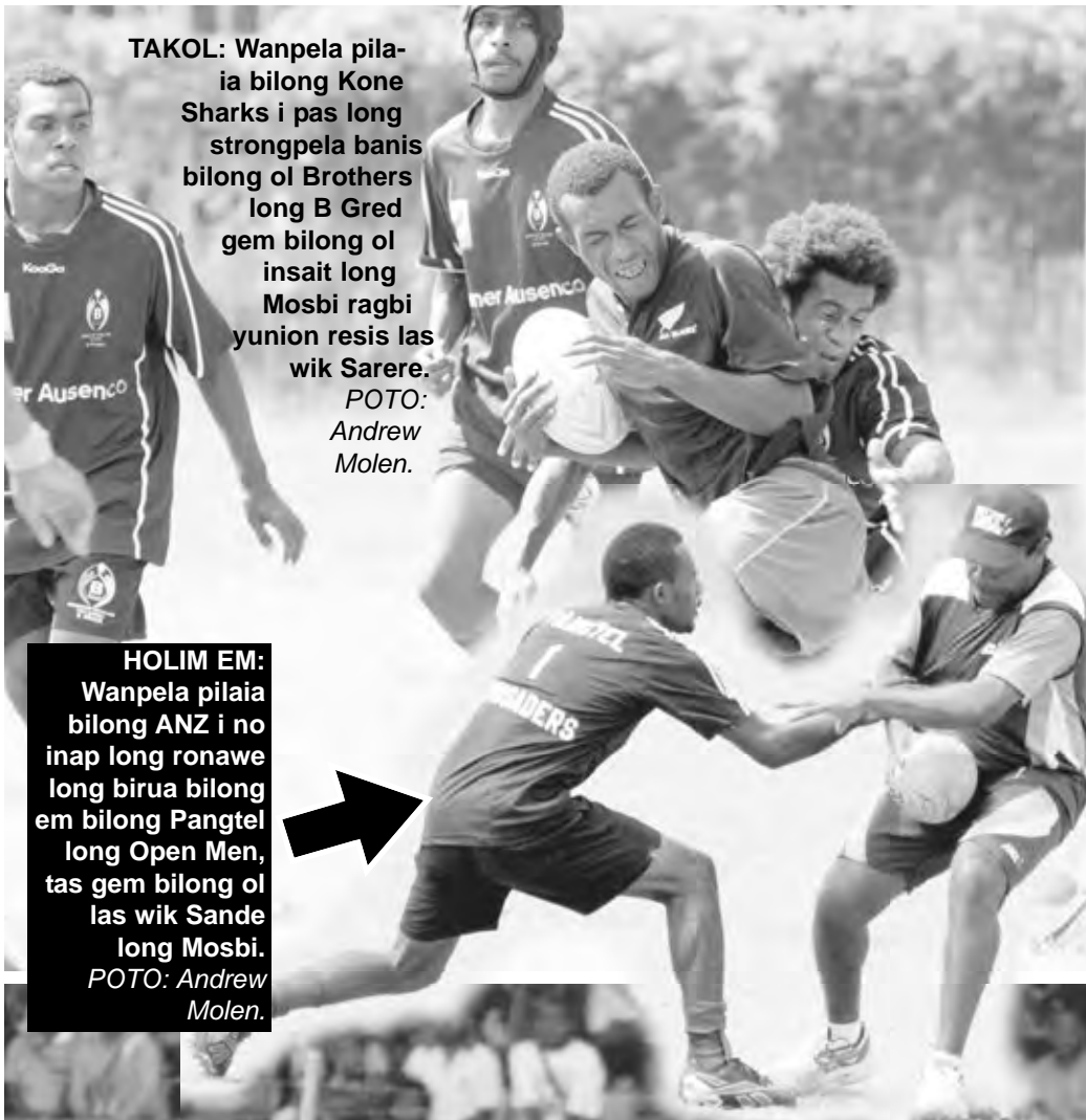
TAKOL: Wampela pilaia bilong Kone Sharks i pas long strongpela banis bilong ol Brothers long B Gred gem bilong ol insait long Mosbi ragbi yunion resis las wik Sarere.