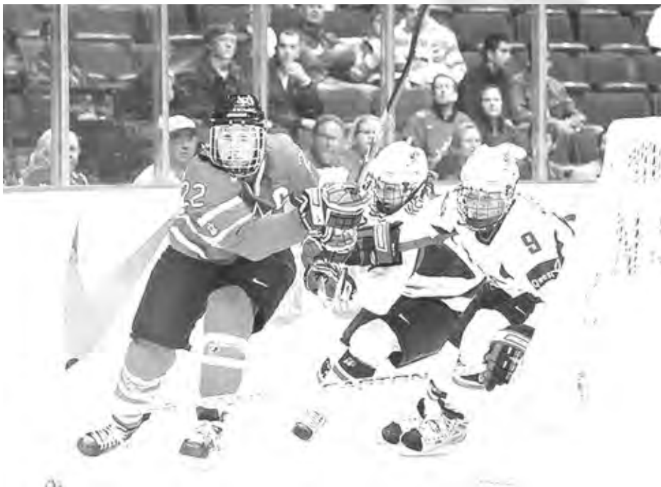
BILAS: Fil hoki (antap) i gat ol samting we ol pilaia i mas werim long lukaut bilong ol na tu long bihainim stail na rot bilong pilaim gem.