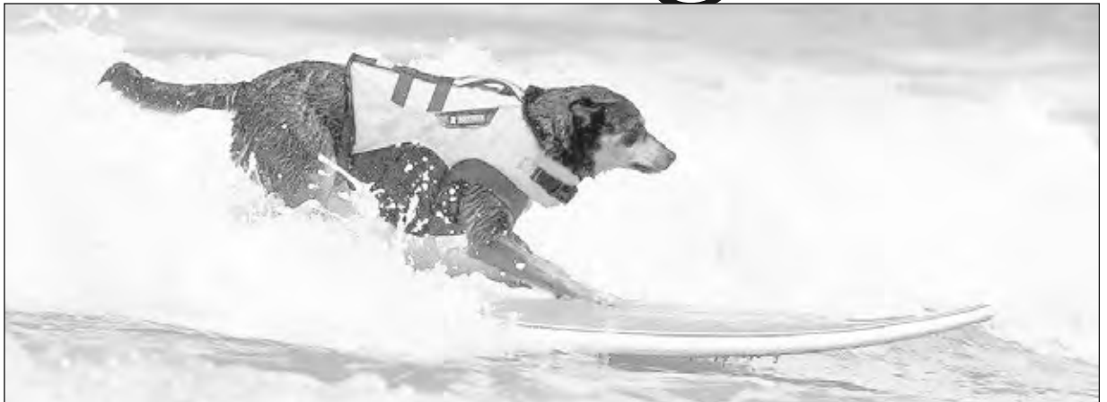
WASWAS: Wanpela dok i traim save bilong em insait long Loews Coronado Bay sef (surf) dok kompetisen long Imperial nambais long San Diego long Amerika long Jun 4, dispela yia. Dispela i bin namba 6 yia bilong dispela resis we i save kamapim olgeta yia. Ol dok i save kalap antap long wanpela sef bod olsem ol man na ron antap long solwara long traim na kisim poin long win.