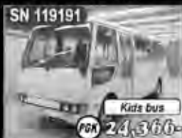
SN 119191 MITSUBISHI ROSA 1998 5.2ltr diesel, AT, white, 110,000km