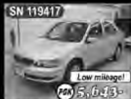
SN 119417 TOYOTA VISTA 2000 1.8ltr petrol, AT, silver, 51,000km