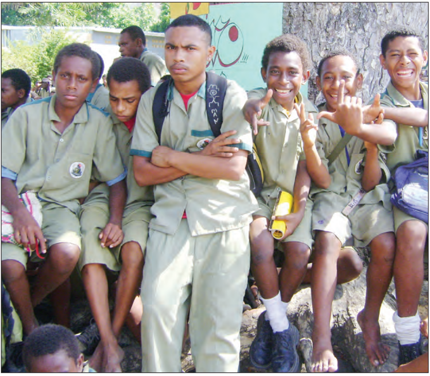
WOKIM SAMTING STRET: ol dispela skul sumating bilong Ted Diro Praimer skul Nesenel Kapital Distrik i sapatim tok long ol skul etministresen i mas givim ol trupela ripot.