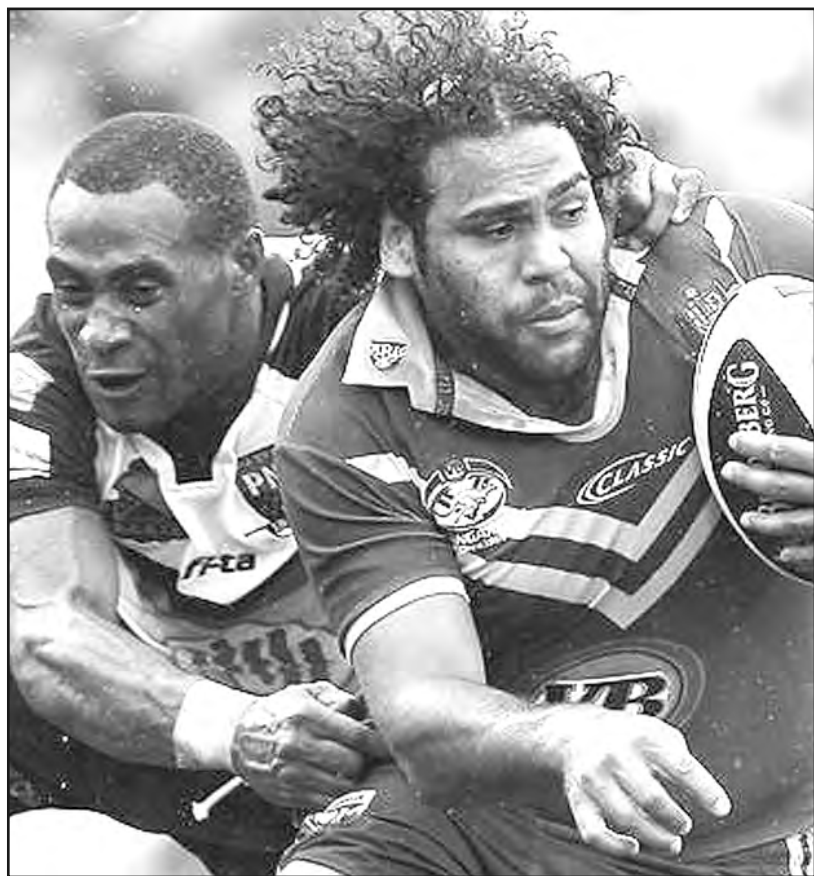
STAP YET: Kumuls bai bungim Kiwis dispela Sarere.

Kumul kosa, Stanley Gene i tok long ol nius ripot dispela wik olsem em i lukim planti gupela samting