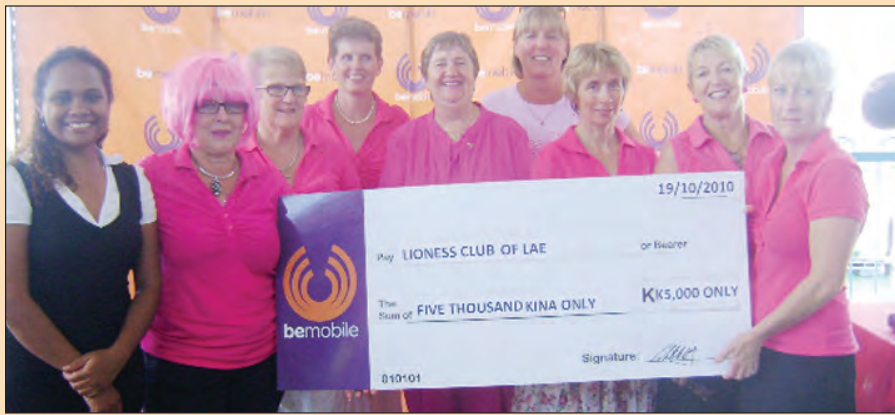
STAIL LONG PINK: Oi Lae Laiones long fan resing nait bilong ol.

KENSA yunit long Angau Memoriel Haus sik long Lae insait long Morobe provins i kisim helpim long wanpela fan resing koporet dina kaikai ol memba bilong Laiones Klab long Lae i bin kamapim.