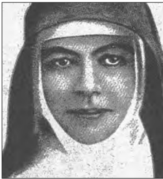
NAMBAWAN SANTU BILONG AUSTRALIA: Santu Mary of the Cross MacKillop we Pop Benedict 16 i bin wokim blesing na givim luksave wantaim 4-pela narapela santu manmeri long wol insait long wanpela bikpela seremoni long Rom.

Moa long 8,000 Katolik Pilgrim bilong Australia i bin wok-abaut i go long Rom na selebretim bikpela de bilong wanpela lain bilong ol i kisim dispela bikpela luksave long sios. Ol biknem Katolik sios lida long Australia olsem Kadinel George Pell, ol Sister i go pas long kongriksen bilong Santu Mary of the Cross MacKillop, Foren Afeas Minista bilong Australia em Kevin Rudd, sampela asples