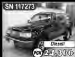
SN 117273 TOYOTA LANDCRUISER 1993 4.2ltr diesel, AT, green, 162,000km

PRICES IN PNG KINA, SHIPPING COST AND TAXES NOT INCLUDED.