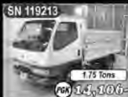
SN 119213 MITSUBISHI CANTER 1997 2.0ltr petrol, MT, white, 109,000km