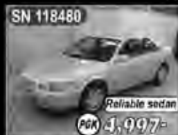
SN 118480 TOYOTA CAMRY GRACIA 1997 2.5ltr petrol, AT, silver, 83,000km