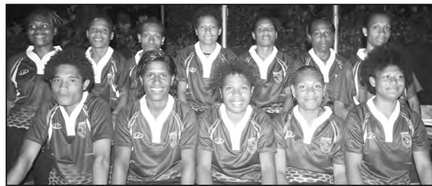
SEVENS SALENS: Meri sevens tim i laik mekim gut.

Ol kantri bilong Esia husat bai pilai long dispela tonamen em India,