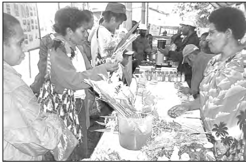
LAIKIM: Plaua i wanpela bisnis na i ken kamapim mani olsem long pote we ol meri Goroka i mekim long dispela mun long plaua so long Mosbi.

Arere long wok bilong kamapim na lukautim plaua, ol meri i kisim askim long strongim wok long wok bilong laipstok, rais, kopi na ol arapela wok didiman.