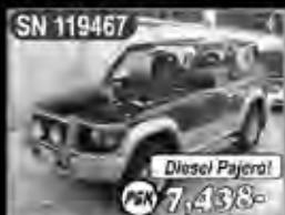
SN 119467 MITSUBISHI PAJERO 1994 2.8ltr diesel, AT, d-blue/silver, 91,000km, 3 doors