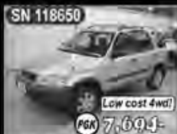
SN 118650 HONDA CR-V 1996 2.0ltr petrol, AT, silver, 91,000km