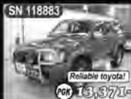
SN 118883 TOYOTA HILUX SURF 1993 2.4ltr diesel, AT, wine red/grey, 64,000km