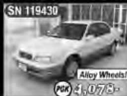
SN 119430 TOYOTA CAMRY 1997 1.8ltr petrol, AT, WhitePearl/grey, 69,000km