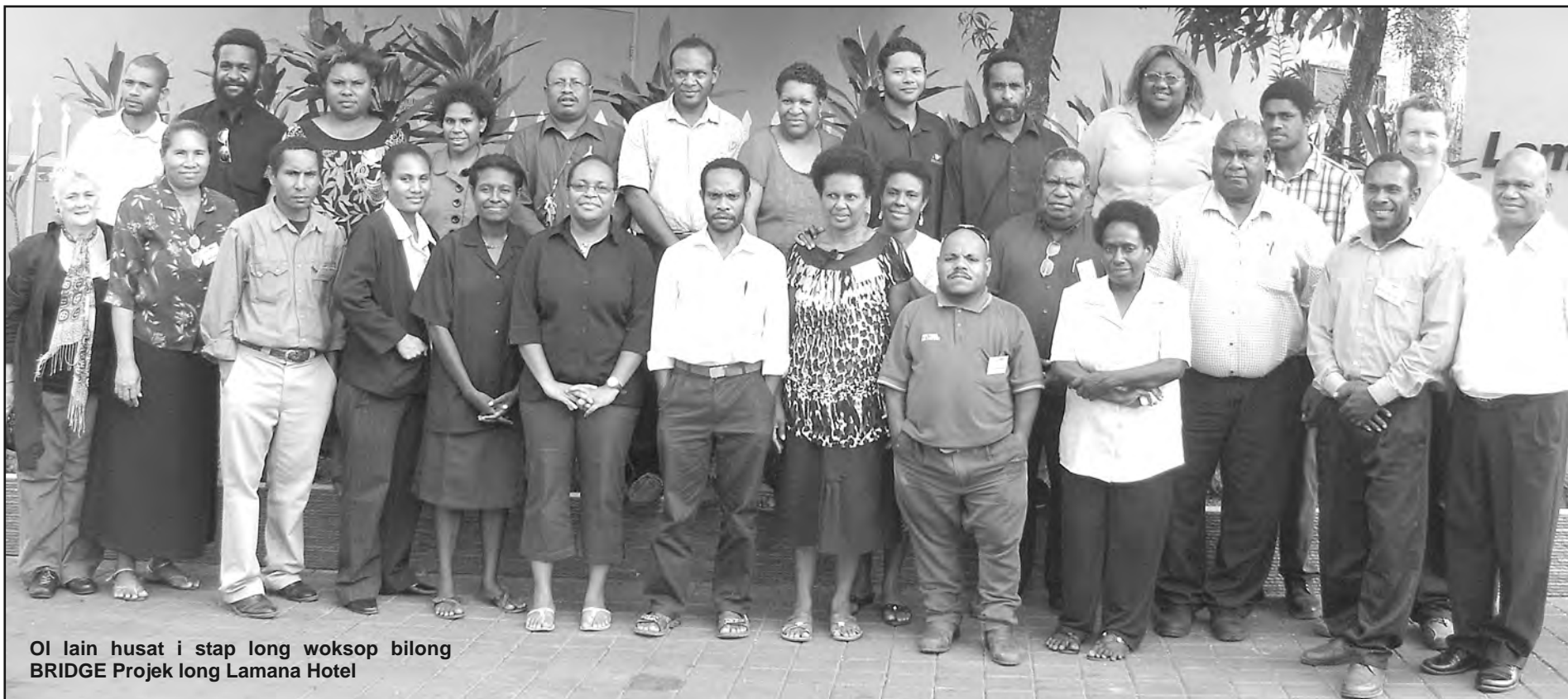
Oi lain husat i stap long woksop bilong BRIDGE Projek long Lamana Hotel