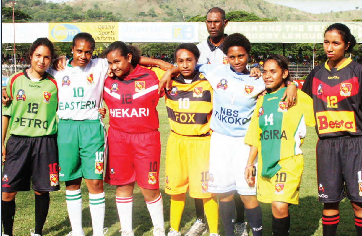
SOIM KALA: Ol model i soim ol nupela yunifom bilong ol tim husat bai stap insait long Nesanel Soka Lig (NSL) resis dispela yia. Namba wan gem bilong NSL dispela yia bai stat dispela Sarere.

TOKSAVE: Salim ol spots dro bilong yu kam long Feks; 325 2579, e-mel; amoln@wantok.com.pg o kam lusim long Wantok Niuspepa opis long Central Waigani, NCD.