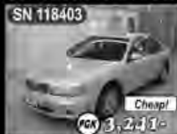
SN 118403 NISSAN CEFIRO 1997 2.0ltr petrol, AT, silver, 114,000km