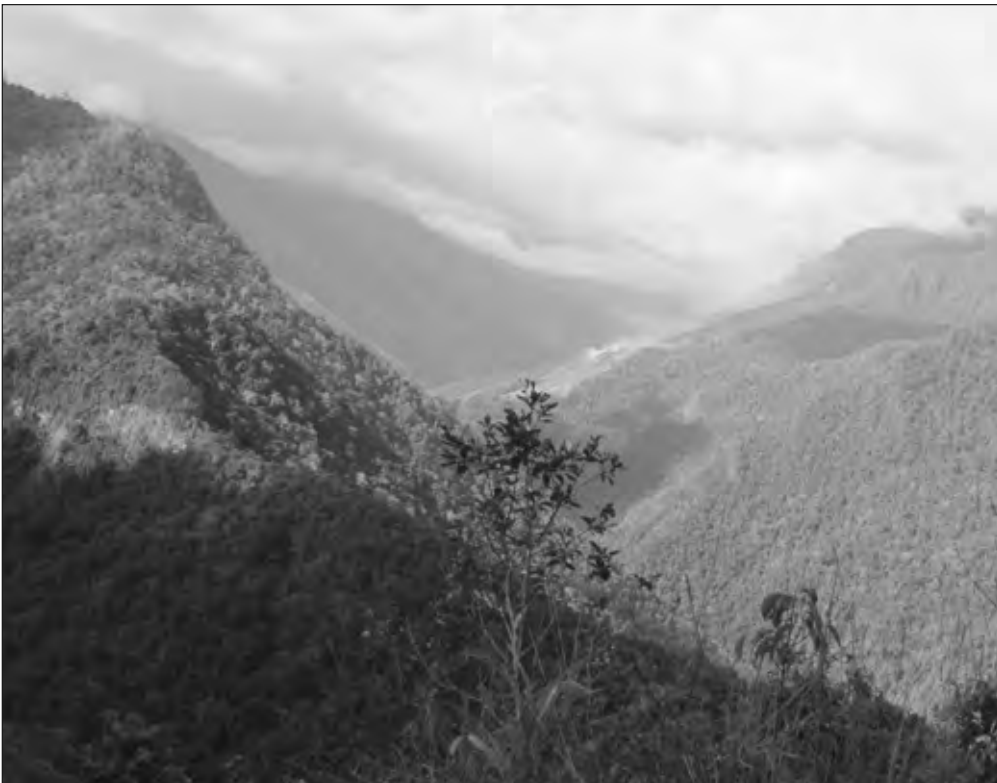
Maunten long piksa i soim hap sait long Fane na hap maunten we Tolukuma gol main i stap long en.