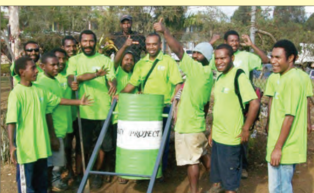
STAP KLIN: BSP Goroka Branch setting the drums up.

BIHAINIM tingting bilong Taun Kaunsil long lukim Goroka taun i stap klin BSP Goroka long las wik i stretim na sanapim 24 rabis bin long taun long larim ol manmeri i tromoi pipia i go insait.