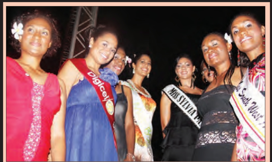
HELPIM RED KROS: Ol 8-pela yangpela meri husat bai resis long kamap mis PNG long dispela yia.

Ripot ya i soim tu olsem hevi we nau planti ol wokman meri long taun na siti long kantri save painim we ol i nogat gutpela haus o ples bilong slip i soim olsem len rifom mas kamap.