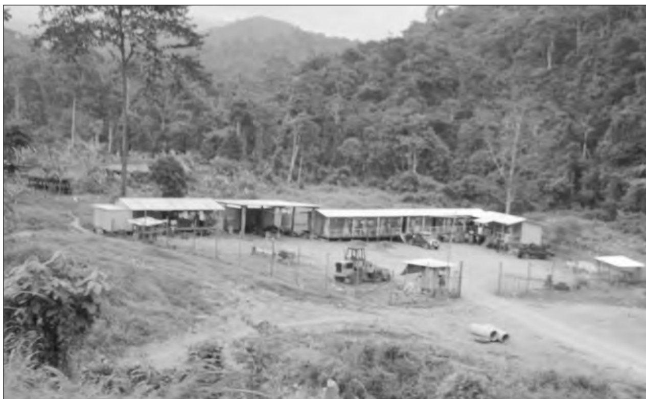
Dispela rot konstraksin kem i stap Utamala long bikpela bus tru namel long Mona Haiwe.

Yes, dispela raun bilong mi i go long Tapini em gutpela tru na em wanpela ekspiriens mi bai ino inap lusim tingting longpela taim.