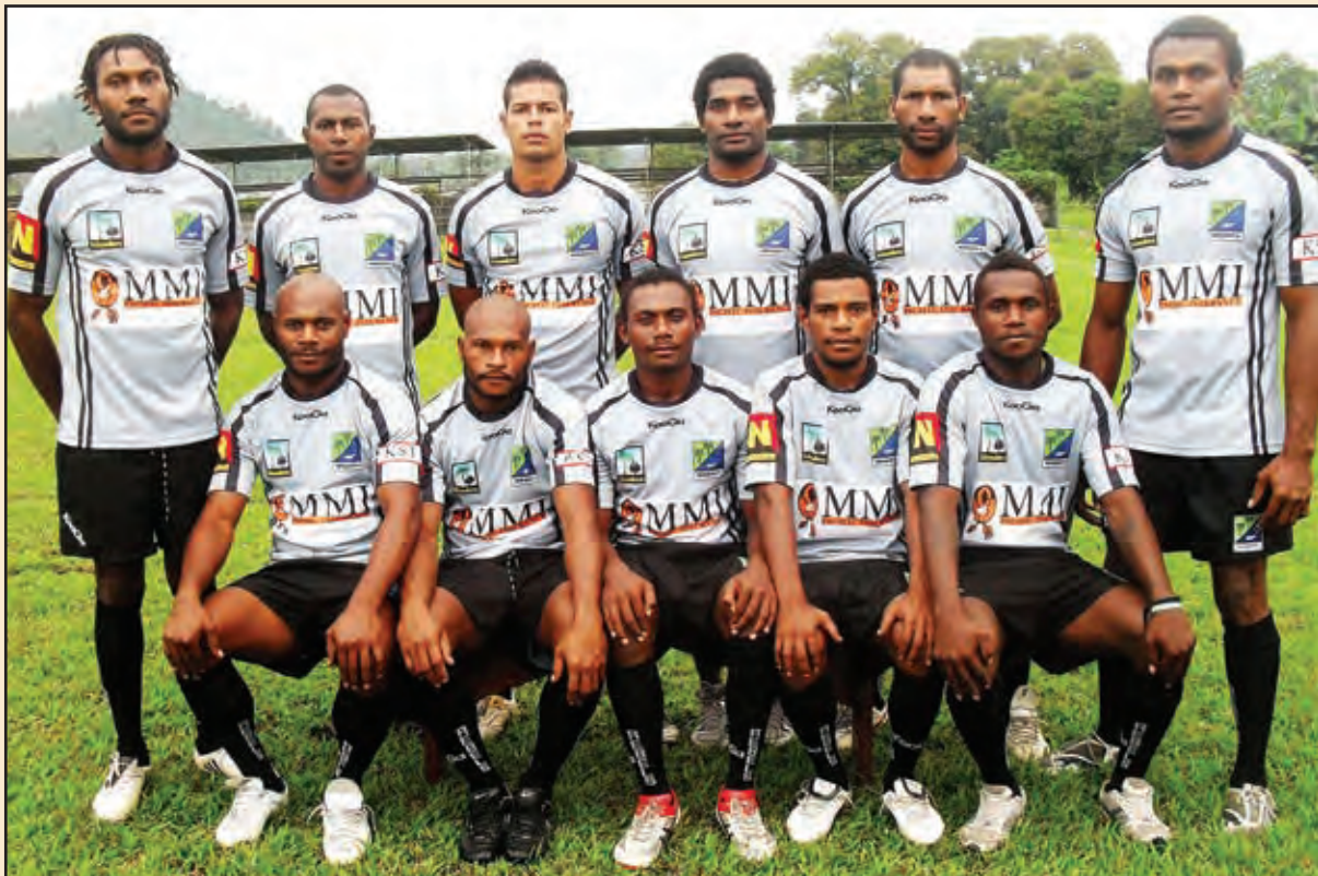
KALA: Ol Rebels wantaim nupela yunifom bilong ol.

"Dispela helpim bai mekim mipela inap long pulim planti moa yabngplea meri kam pilai netbol we i bihainim tu astingting bilong klap," misis Maliaki tok.