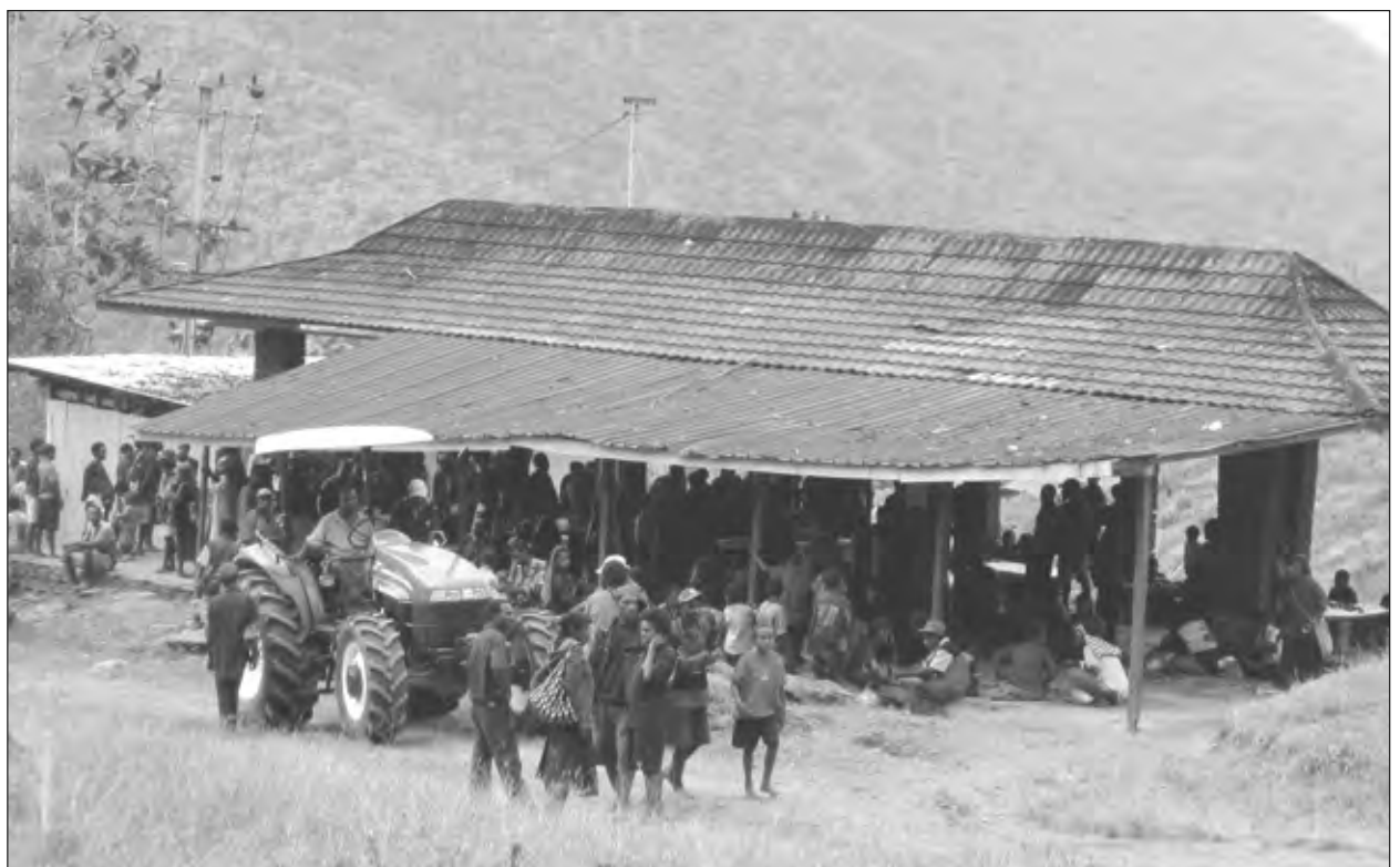
Haus maket long Tapini stesin we MP Poia i givim K690,000 pinis long wokim nupela maket.