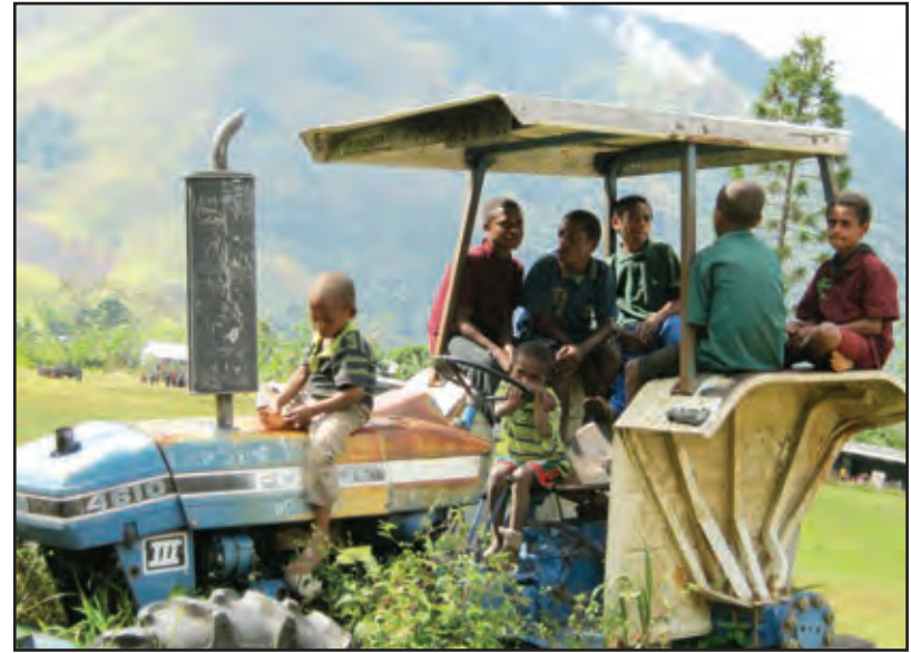
PILAI LONG TRAKTA: Ol sumatin bilong Santu Peter Torot i pilai long bagarap trakta arere long Tapini ples-balus long maunten bilong Goilala distrik.