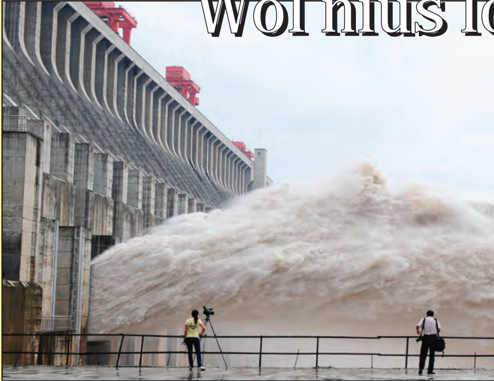
OPIM DUA: Ol niusmanmeri i kisim poto long bikpela hap wara i sut i kamaut long ol dua bilong Three Gorges Dam long Yichang long Hubei provins long sentral Saina long Tunde dispela wik. Ol reskiu wokman i wok painim 30 pipel graun i bin bruk na karamapim ol bihain long bikpela ren i pundaun na brukim graun.