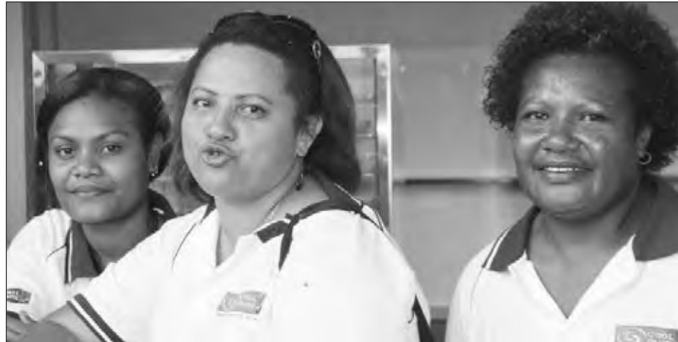
SOIM STRET: Hia ol meri pilaia bilong Orijinol Cool graphix i redi long pilai snuka.