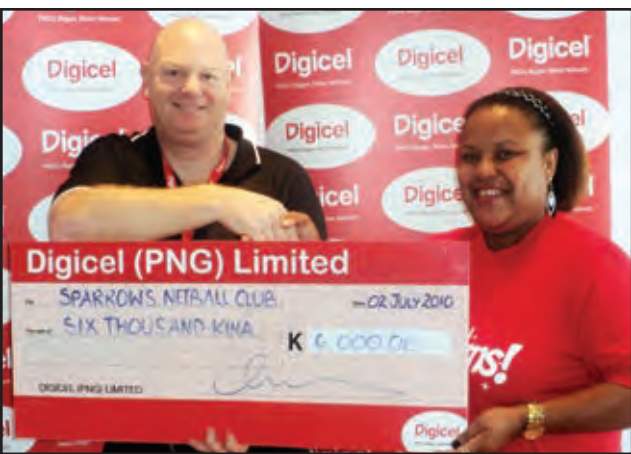
SEK HAN: Helpim bilong Digicel bai strongim pilai na wok bilong Sparrows.