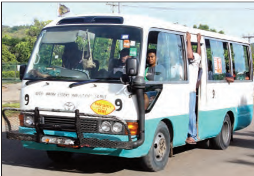
ABURUSIM BIRUA: Noken spid tumas taim yu holim stia