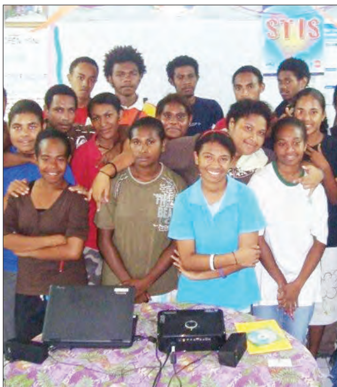
LAINIM LONG HELPIM OL PORO: Dispela em ol sumatin i bin sindaun long wanpela wik kos.