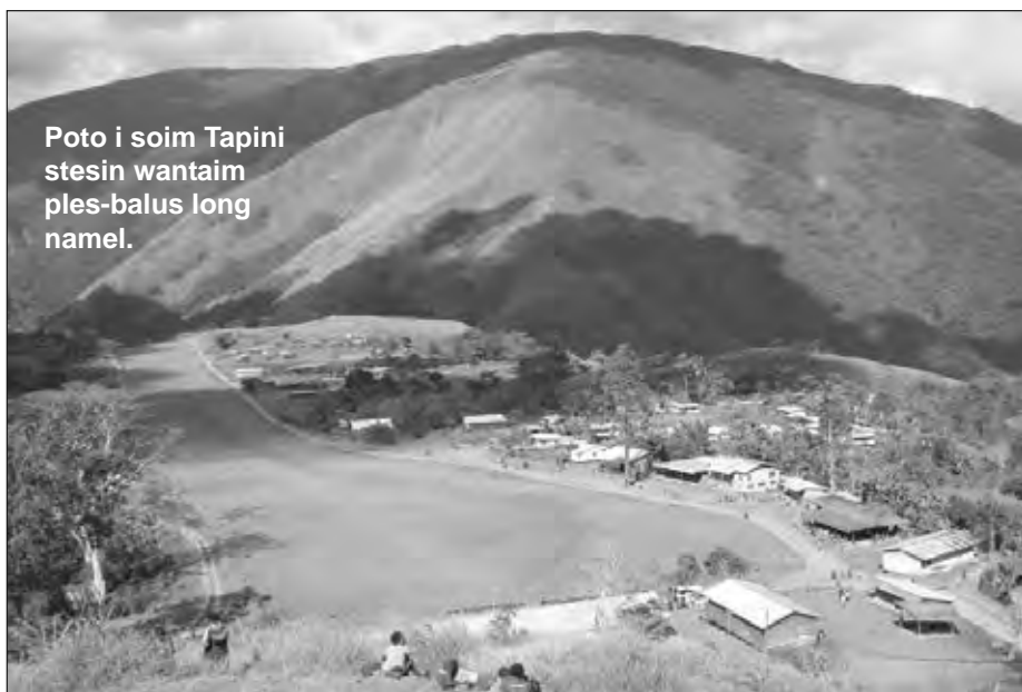
Poto i soim Tapini stesin wantaim ples-balus long namel.