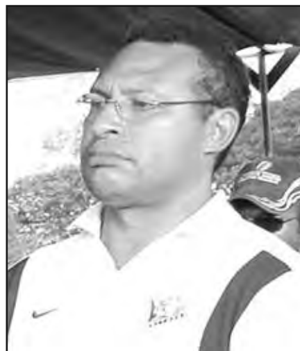
BIKPELA TINGTING: Amet i laik strongim bek POMRFU. FOTO: POMRFU.

pilai long Intanesenel level sapos yumi nogat gutpela resis long provinsol level bilong yumi yet,” em i tok.