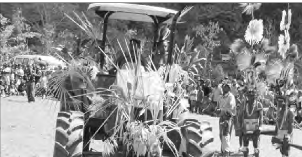
NUPELA TRAKTA: Ol hetman bilong Woitape singsing tumbuna na welkam long nupela trakta long Tapini las wik Fraide.