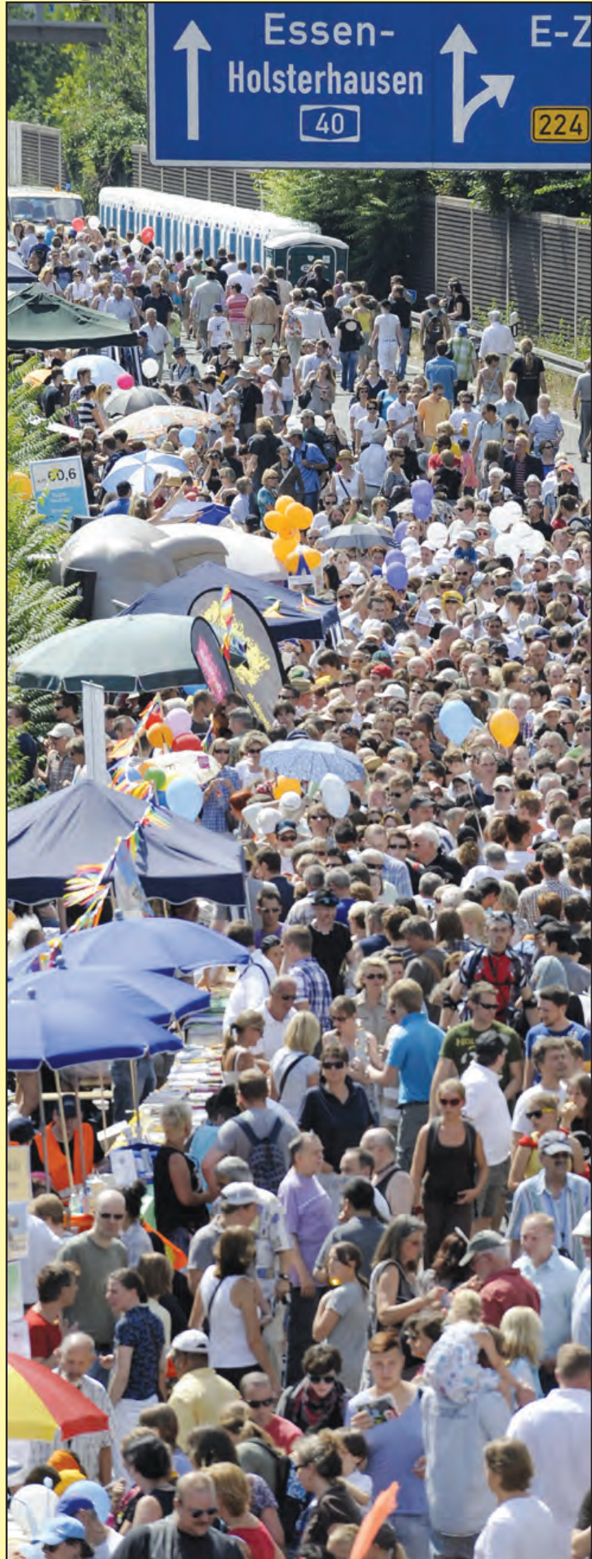
PASIM ROT: Long wanpela de long Jemani, ol i save pasim wanpela bikpela rot bilong ol nem bilong en Germany A40. Las wik Sande, ol i mekim dispela long makim 'Still Life'. Taim ol i sanapim 20,000 tebol long mekim namba wan bikpela kaikai long wol. Samting olsem wan milian turis na as-ples bilong Jemani i bin kam bung long Sande namel long ol siti bilong Dortmund na Duisburg long Jemani.