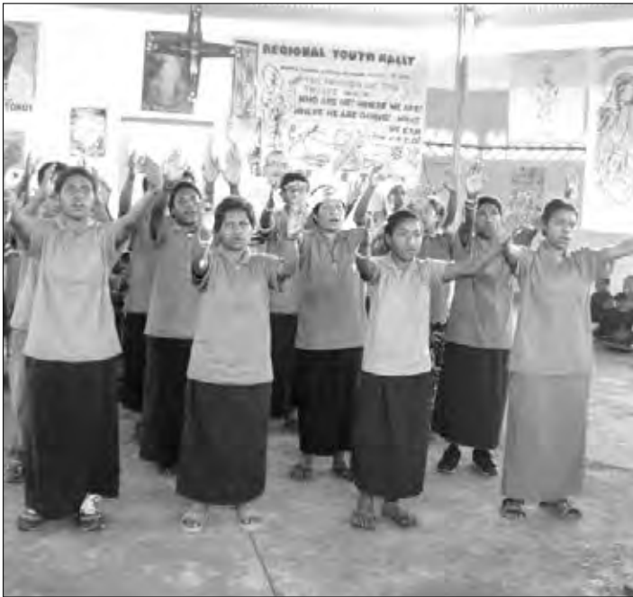
Ol Wabag Yut talen nait.