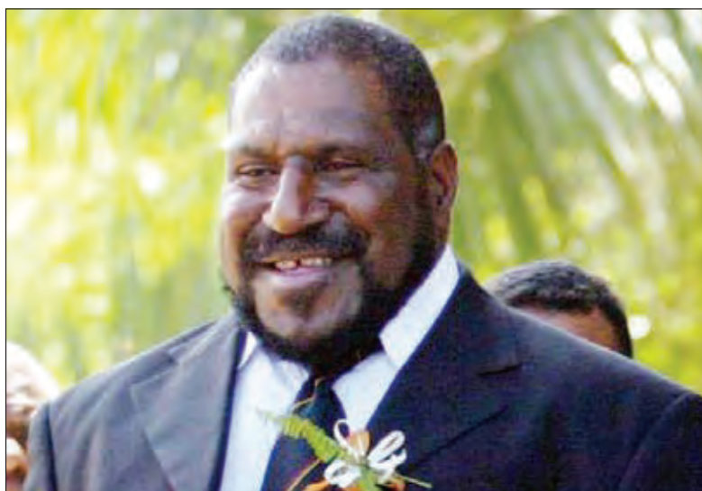
ROT PAS: Spika Nape.

Dispela i lukim Gavman i win wantaim 59 vot na Oposisen i gat 42 na larim Se Paulias i go het long mekim tok promis bilong em.