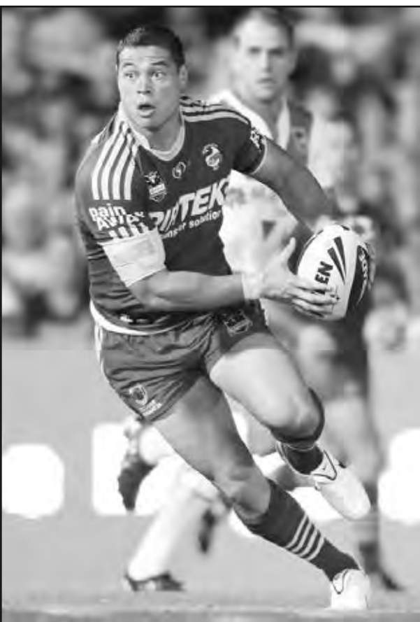
MALOLO: Tahu bai kam bek long trening long Fraide.