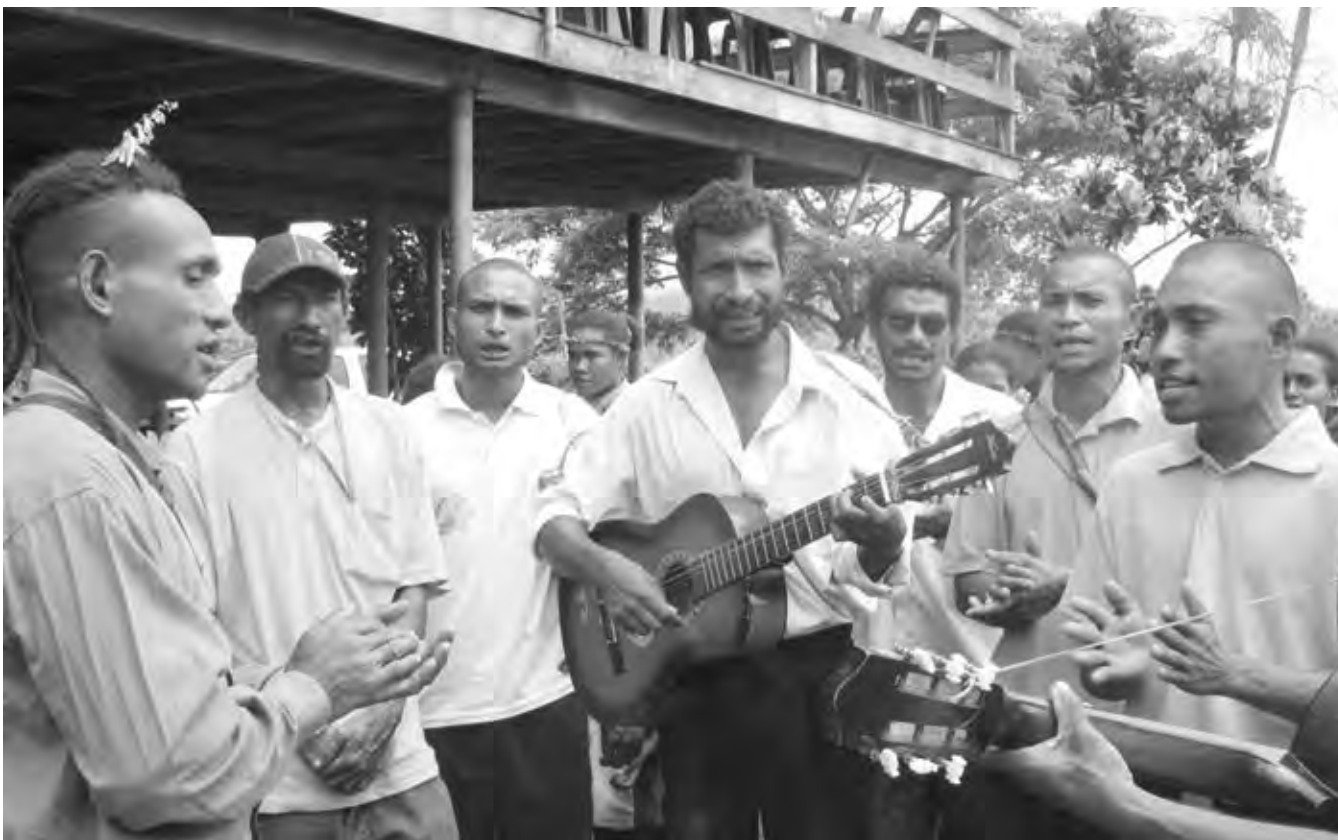
Sampela ol yangpela Kristen bilong ples Saroa long Sentrel provins i paitim gita na singsing long givim biknem i go long Papa God.