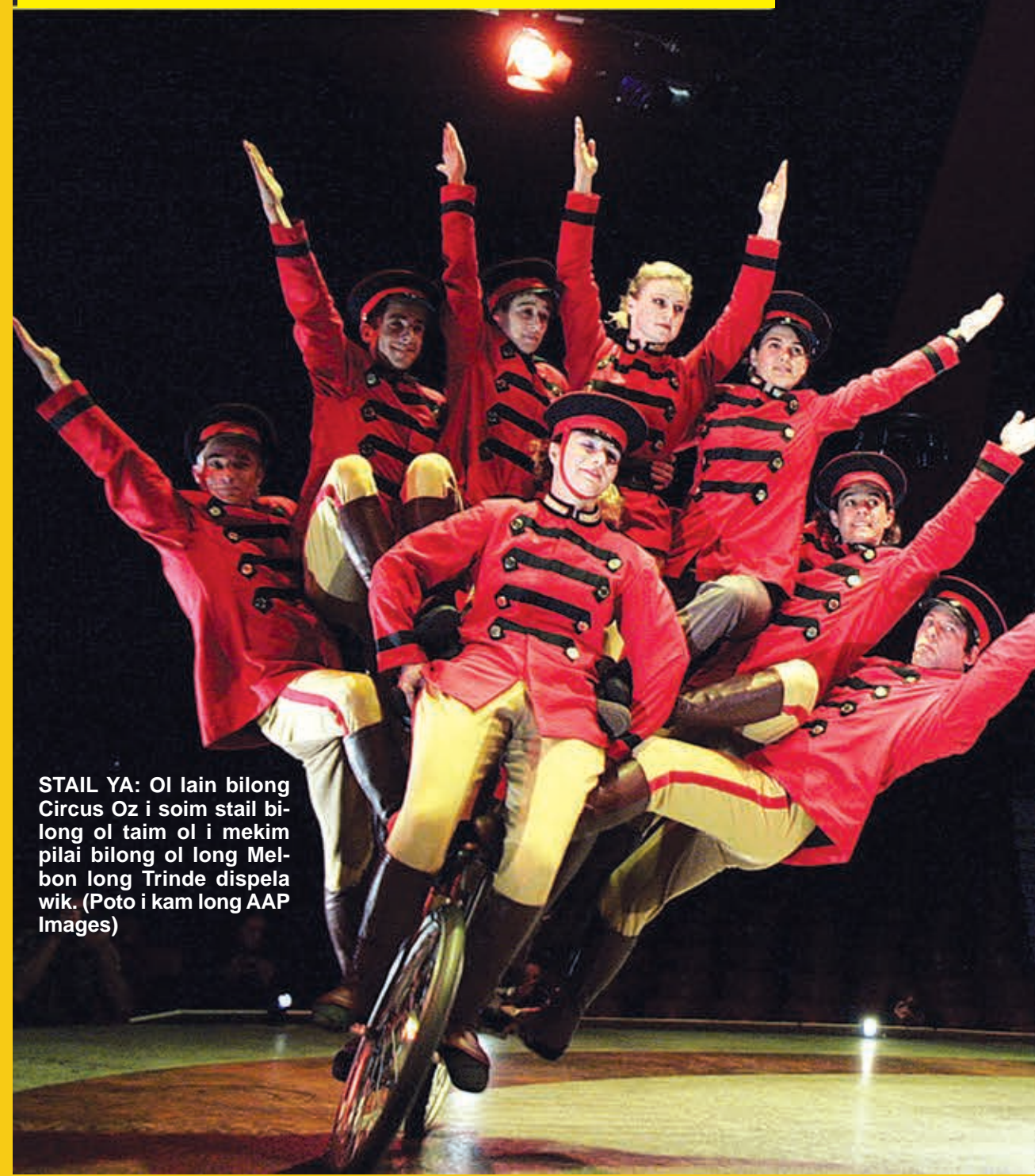
STAIL YA: Ol lain bilong Circus Oz i soim stail bilong ol taim ol i mekim pilai bilong ol long Melbon long Trinde dispela wik.