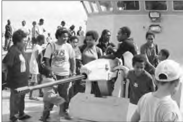
SIP KRUS? Nogat, sip tua! Ol mama pikinini i raun lukim sip bilong naval beis long Lanron Naval Beis, Mosbi.

Word Publishing i kamapim dispela bikpela de bilong amamas! Yu yet save yu husat, mi tok tenkyu gen! Tokwin tru!