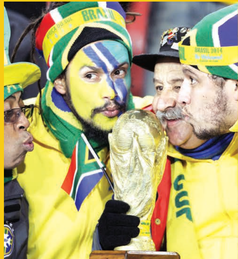
EM BLO MIPELA YA: Ol fens bilong Brasil i kis long wanpela giaman Wol Kap trofi pastim long gem namel long Brasil na Not Korea i kamap long Ellis Park Stadium long Johannesburg, Saut Afrika long Tunde dispela wik.