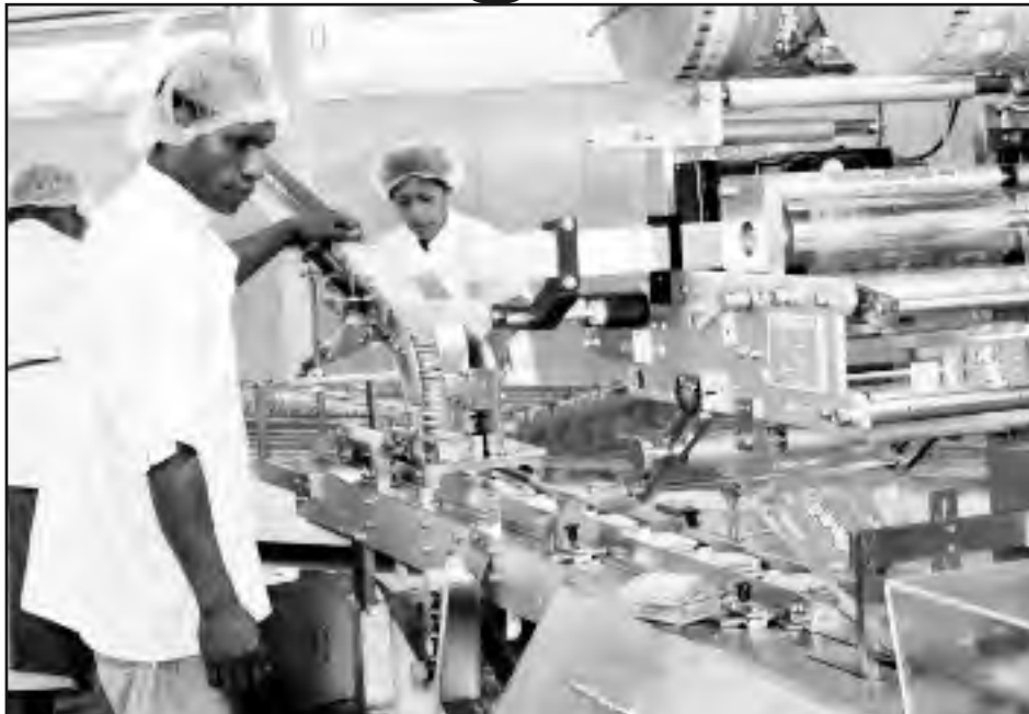
Nupela masin i muvim ol bisket long redim long fektori.