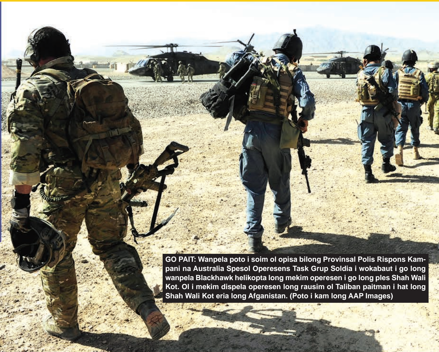
GO PAIT: Wanpela poto i soim ol opisa bilong Provinsal Polis Rispons Kampani na Australia Spesol Operesens Task Grup Soldia i wokabaut i go long wanpela Blackhawk helikopta long mekim operesen i go long ples Shah Wali Kot. Ol i mekim dispela operesen long rausim ol Taliban paitman i hat long Shah Wali Kot eria long Afganistan.