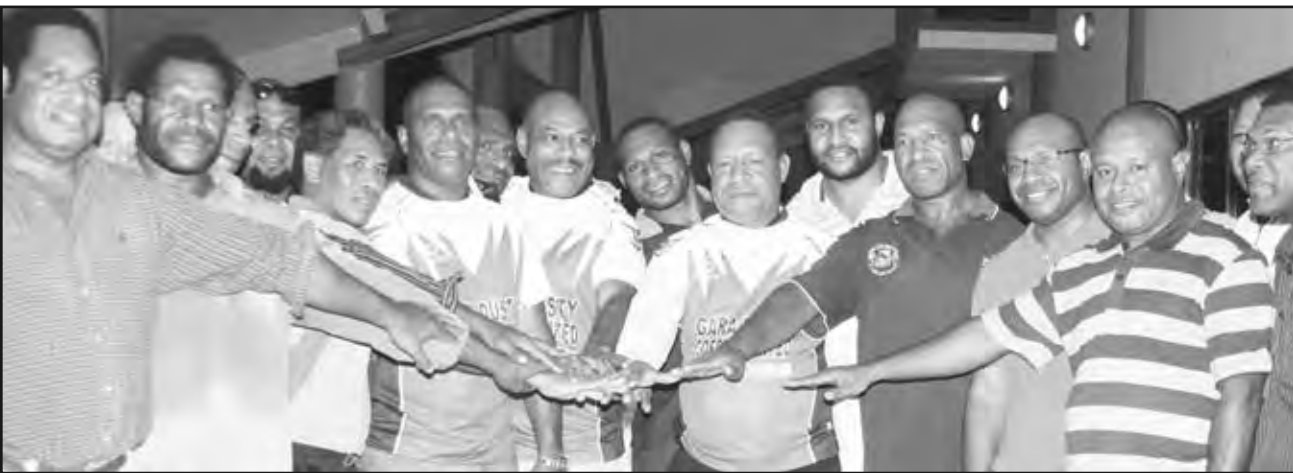
SOIM PAWA: Ol eksekutiv bilong Gara Dust Limited Brothers i soim sapot long bringim klap long resis bilong POMRFL.

Em bai gat ol bikpela na nupela samt-ing na bai givim luksave long PNG i go long wol we i ken helpim tu ikonomi bilong kantri.