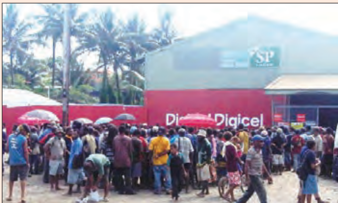
DIJISEL STAP WE! Ol kastoma i kam long kainkain kona bilong Kiunga taun, Westen Provins na askim long baim Dijisel mobail pon.

DIJISEL i go moa na strongim wok bilong em long mekim PNG i kamap bikipela na strong moa long kantri taim em i lonsim sevis bilong em long Westen Provins long dispela wik Tunde.'