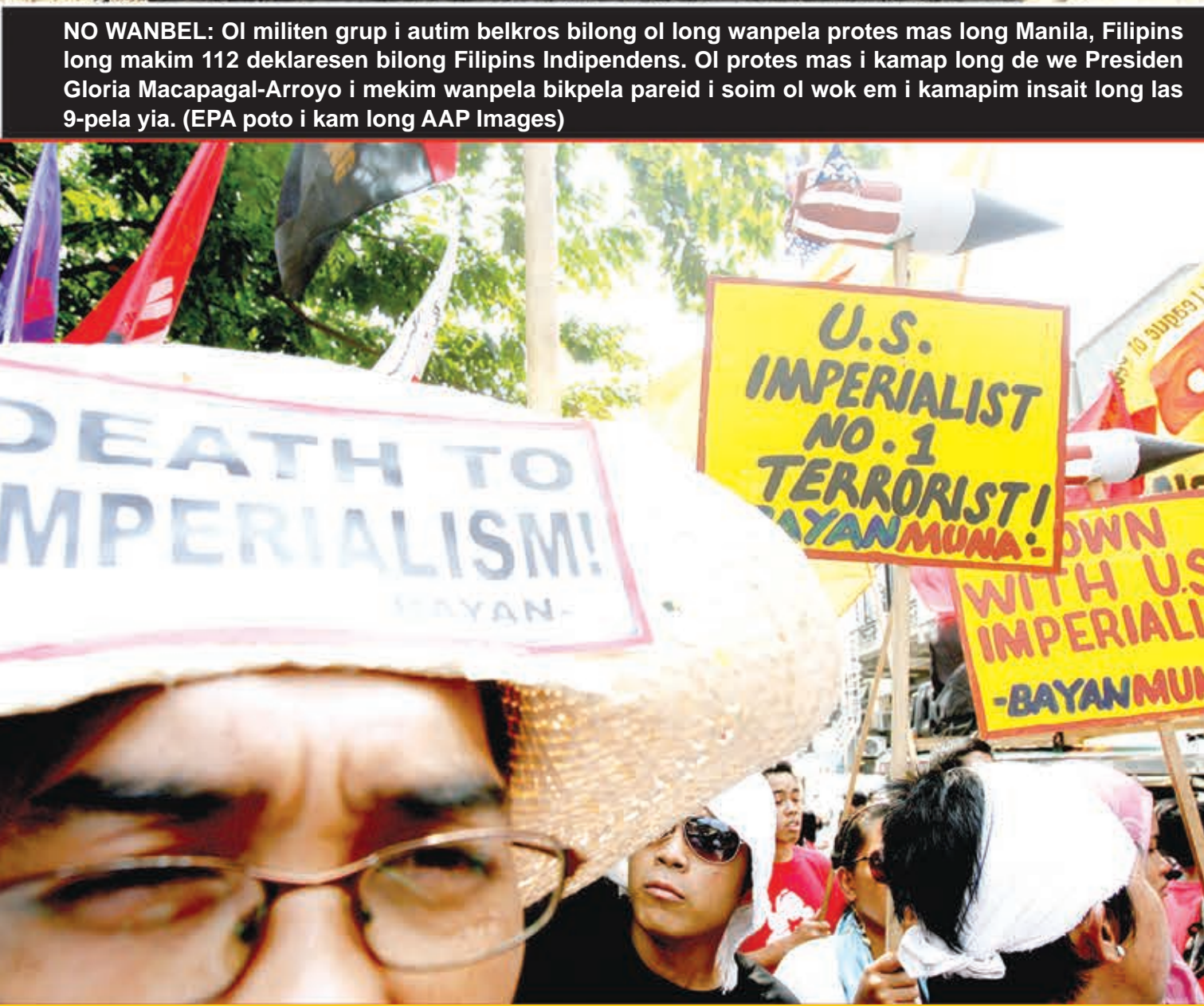
NO WANBEL: Ol militen grup i autim belkros bilong ol long wanpela protes mas long Manila, Filipins long makim 112 deklarisen bilong Filipins Indipendens. Ol protes mas i kamap long de we Presiden Gloria Macapagal-Arroyo i mekim wanpela bikpela pareid i soim ol wok em i kamapim insait long las 9-pela yia.