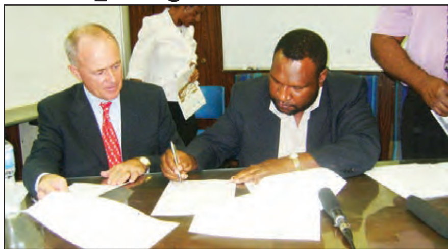
SAINING: Wanpela bikman bilong Exxon Mobil na Edukesen Minista James Marape i sainim ol pepa long Exxon Mobil i givim ki i go long Minista Marape o makim Edukesen Dipatmen.

Minista Marape i tok patnasip namel long praivet na pablik sekta i kamap long wanpela bikipela level taim Exxon Mobil i givim ki bilong mes, toilet ma tupela haus bilong ol woklain i go long Edukesen Dipat- men.