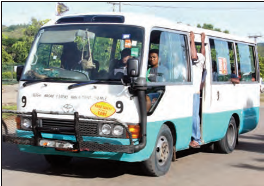
ABURUSIM BIRUA: Noken ova lod