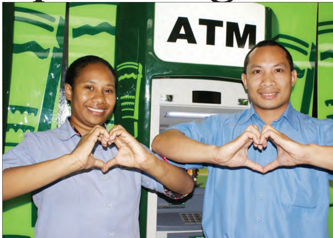
MEKIM OLSEM: Tupela marit i traime han long wokim lewa.

Long ol manmeri i kisim prais bilong ol i mas raitim gut kontek edress bilong ol.