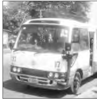
Ol PMV i no save bihainim rut bilong ol.

"Ol PMV long dispela taim i no bihainim rot na olsem planti ol manmeri i leit long go long wok o go long haus bilong ol," Mista Parkop i tok.