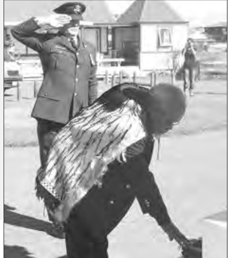
Wankain tu, ino gat helpim i kam long ol intanesinol komyuniti i go long ol papa bilong ol risoses long luksave long raits bilong ol long developmen i ken daunim gutpela tingting bilong ol long was gut na lukautim ol risoses bilong ol.

Tok-lukaut olsem, planti kain kain tingting we i stap long ol gaidlain ino inap gutpela na ino inap bringim gutpela samting long sait bilong wok-bung o koporesin. Ol dispela samting i ken kamapim banis long sait bilong Gavman long mekim wok long bringim sevis i go long ol pipel. ROT LONG MEKIM EM BIKPELA SAMTING WANKAIN TU LONG WANEM SAMTING I KAMAP.