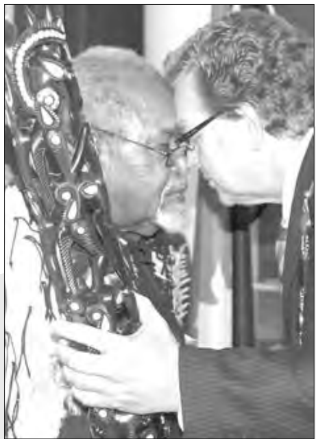
Dispela i kamapim moa nupela rot long bihainim na tu salens long ol kantri bilong yumi.

Em ples klia olsem, globalaisesin i min olsem ol kantri bilong dispela rijon nau i wok bung wantaim. Long wankain rot tu, ekonomi na ol fainensol institusen ino moa wok ol yet em i wok bung wantaim ol bikpela komyuniti long wol.