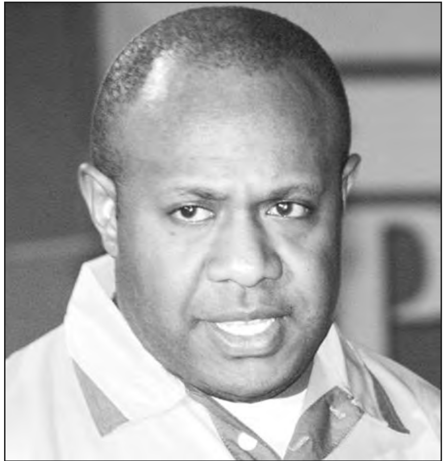
NUPELA GEM: Smare tokaut long nupela pilai insait long bemobile Cup we bai olsem Sate Of Origin bilong Australia.

long kamap long nupela eria na kain salens i gutpela long strongim ol pilaia long redi long ol bikpela pilai olsem 4 Nations we PNG bai stap insait long en dispela yia agensim Australia, Nu