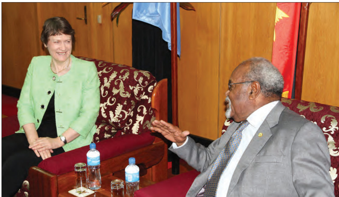
TUPELA LIDA TOKTOK: UNDP bosmeri na pastaim Nu Silan Praitim Minista, Helen Clark i toktok wantaim Praitim Minista Se Michael Somare.

Dispela em long ol rot olsem gutpela pe, sans long skruim skul na gutpela helt, givim moa pawa long ol meri, daunim ol sik nogut, lukautim gut envaironmen bilong ol pikinini na ol tumbuna i kam bihain na sanapim ol wok