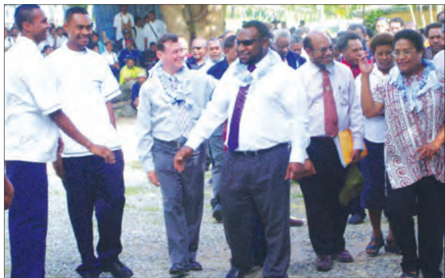
WELKAM LONG KILAKILA SEKONDERI: Ol sumatin bilong Kilakila Sekonderi i bungim na sekan wantaim Edukesen Minista James Marape na ol arapela bikman bilong edukesen.

"AOG na NEC bilong em long toktok gut wantaim edministresen bilong skul na OHE," opis i tok.