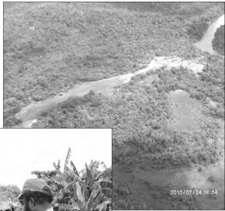
Poto i soim bus long Makapa fores eria long Westen provins.

long bus bilong PNG. Moa long en tu dispela timba eria long Westen provins em bikpela eria tru we kampani i save katim bikpela namba bilong diwai tru.