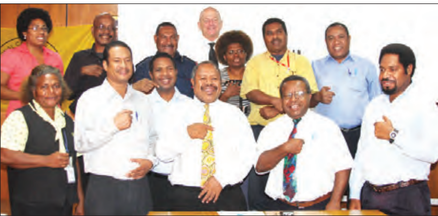
KAUNIM MI: NCD Gavana Powes Parkop wantaim ol menesa bilong NCDC opis soim we long Senses.