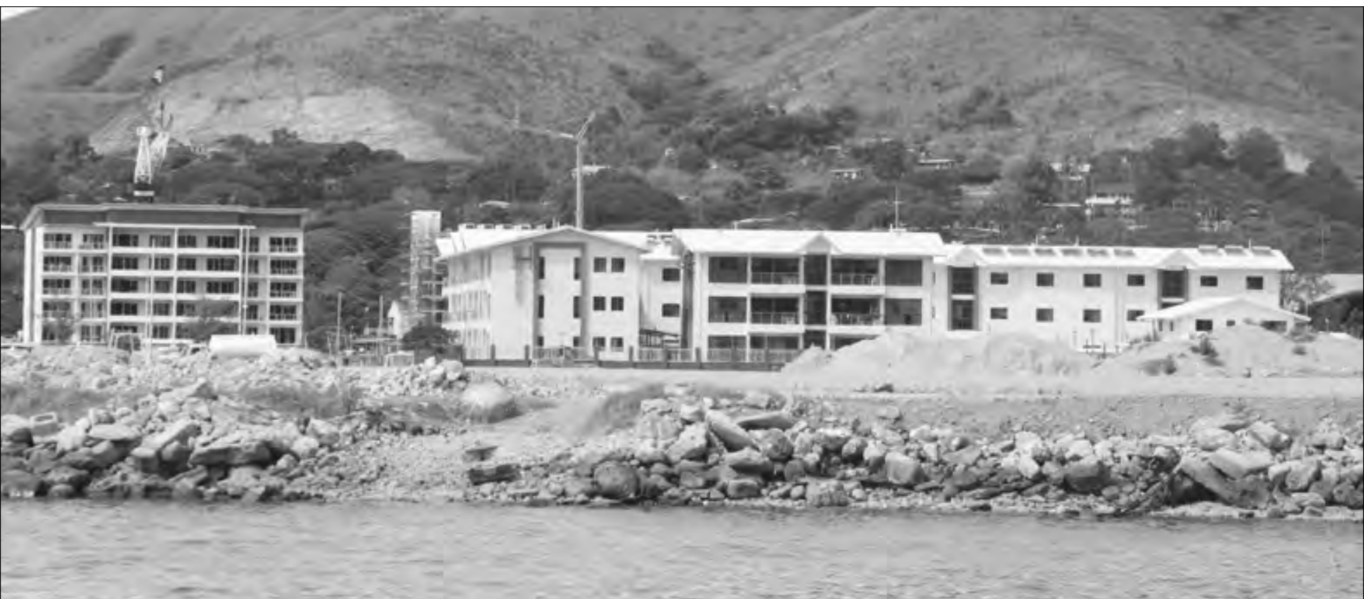
HAUS HIA: Nupela ol Nasfan haus long Haba Siti, Konedobu.