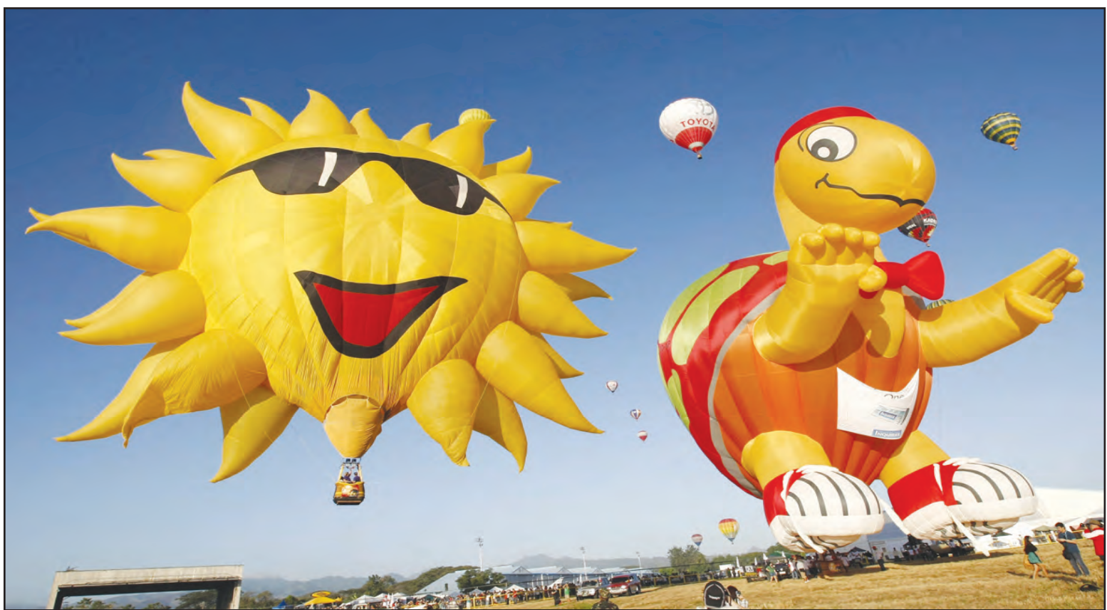
PILAI BALUN: Em long PNG ah? Nogat. Tasol sapos Gavana bilong Nesenel Kapitel Distrik, Powes Parkop i kisim gutpela tingting, dispela kain samting i ken bungim ol manmeri long Mosbi siti long lukim na amamas. Dispela em ol bikpela balun long wanpela Hot Ea Balun Festival i kamap long Angeles Siti, Pam-panga provins long Filipins. Dispela festival i save ron fopela de, na i gat ol kain pilai olsem kalap na plai long ol bikpela balun olsem, pulim kait na ol arapela samting bilong plai. Lukim moa Wol Nius poto long PES 14 na 15.

Ol tem na kondisen bilong Digicel i stap. Fri sabskripsin bai go long olgeta nupela BlackBerry sabskraiba stat long Februari 17 Igo Mas 31. Dispela sevis em wan kain olsem olgeta BlackBerry masin em Digicel i salim. Ringim Kastoma Kea namba long 123 long kisim moa infomesin.