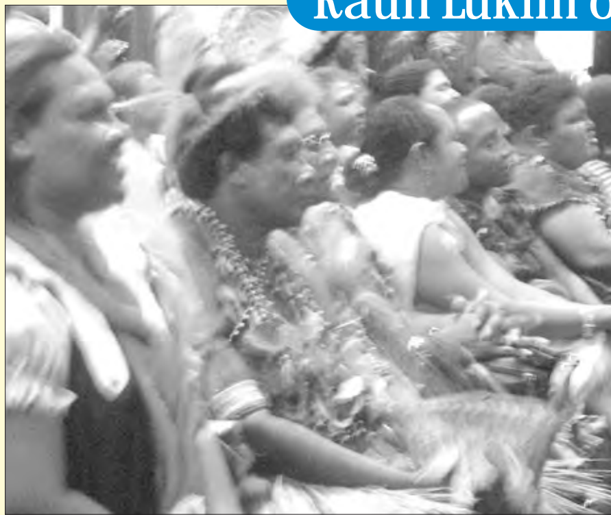
MERI BUNG: Ol meri i harim toktok bilong bik bosmeri bilong Yunaitet Nesens Developmen Progam long Nu Yok hetkota, Amerika na pastaim Praim Minista bilong Nu Silan, Helen Clark. Klostu 200 meri i bin stap long bung long haus Palamen long dispela wik Mande long harim ol toktok bilong bikmeri long Jenda na ol Milenium Developmen Gols we PNG i mas inapim kam via 2015.