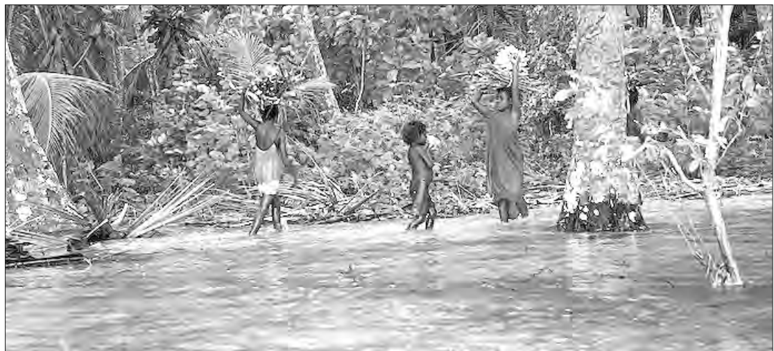
KLAIMET HEVI: Long PNG, plantil ples bilong yumi wok long karim pinis hevi bilong klaimet senis. Katerets Ailan long Bogenvil i wok lusim graun long ol ailan bilong en long wanem mak bilong solwara i wok go antap.

Insait long stetmen bilong PNGEFF ol plen long kamapim wanpela bikipela aweanes o rotso insait long 4-pela rijon bilong kantri long askim ol papa bilong ol fores long kamap na lainim ol samting ol yet na ol i ken mekim ol gutpela disisen long wanem rot ol i ken kisim gutpela mani o lukim wok i kamap long ol risos bilong ol.