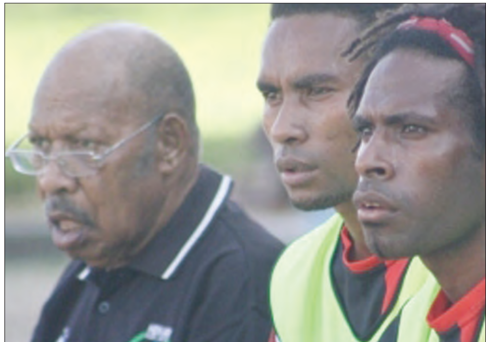
Se Kapi: Leit Se Kapi (lepan) i sindaun na lukim ol mangi bilong em i pilai. Em long dispela wokobaut tasol em i kam na kisim bagarap.

Bihain em i go skul long Toge Praimeri skul. Taim