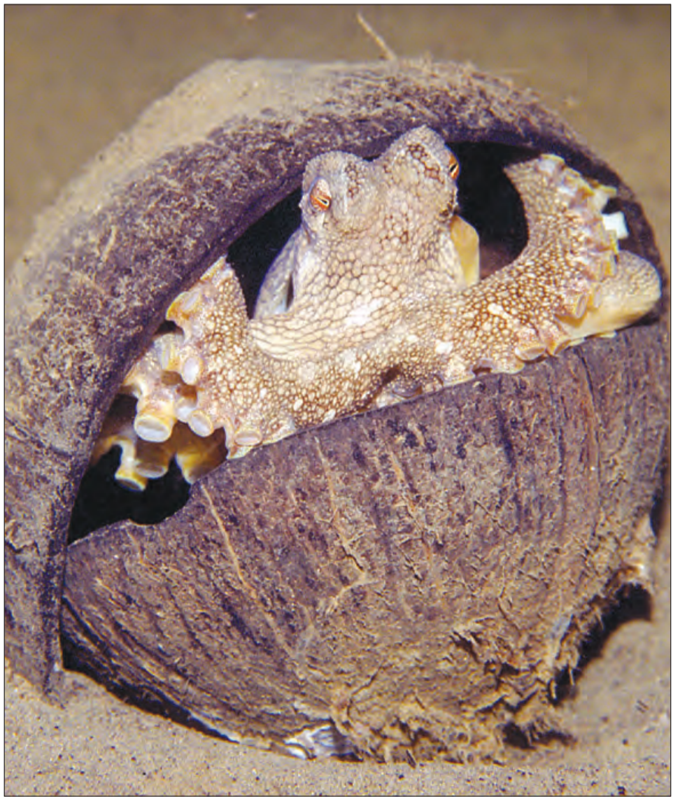
SAVE KILIM EM; DISPELA poto i soim wanpela nupela kain urita we ol saveman bilong glasim ol abus bilong solwara i tok em i namba wan taim ol i lukim wanpela kain solwara abus olsem i yusim samting olsem sel bilong kokonas long mekim haus bilong en. Ol i tok em i bikpela samting tru.