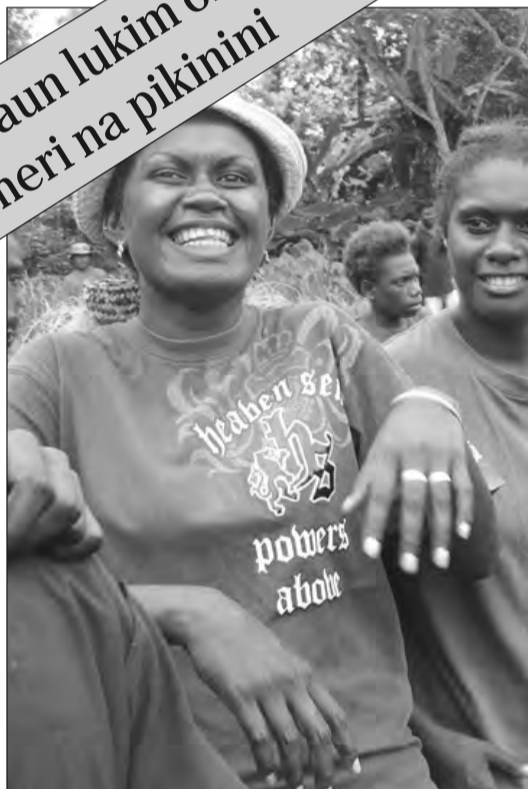
ANUEL YUT WIK: Sampela ol meri yut bilong Sentrel Bogenvil i go kamap long ples bilong stap na wokim ol