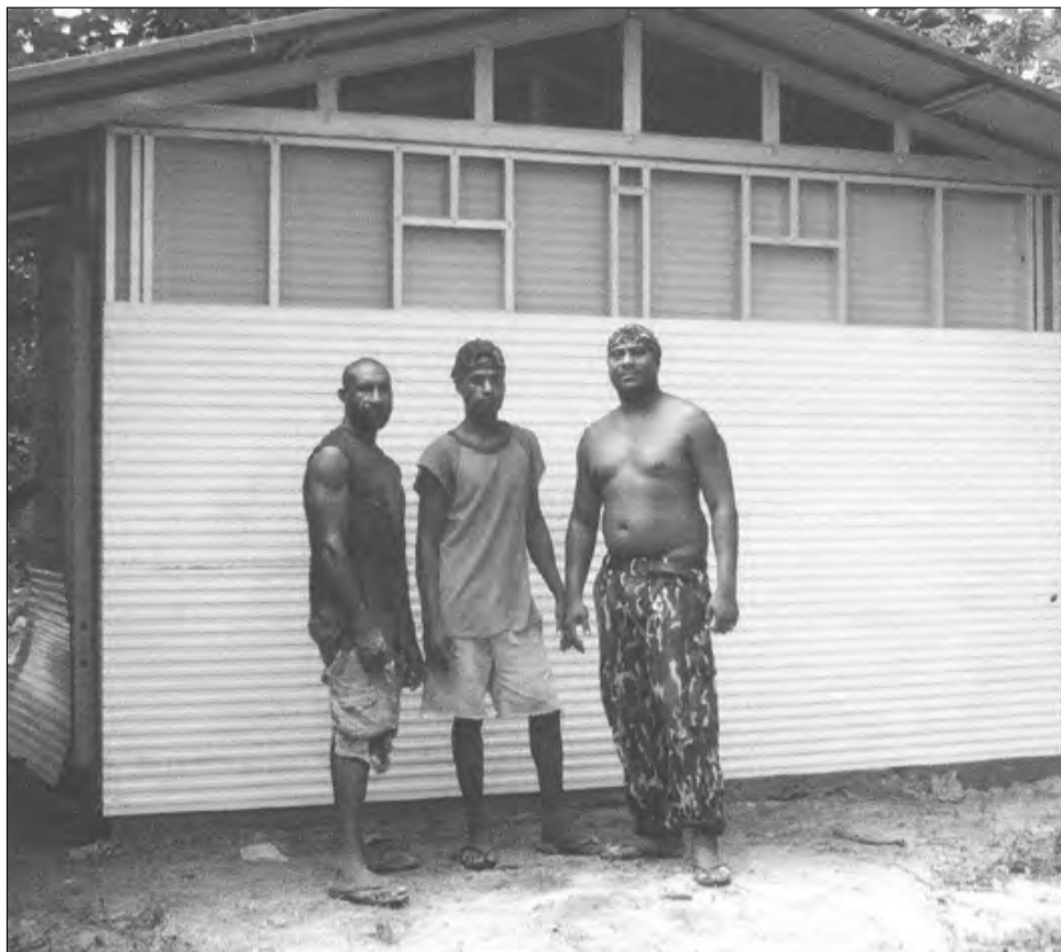
PABLIK TOILET: Wanpela long ol pablik toilet long ples Sohun long Nu Ailan.

Narapela projek em i lukluk long stretim long ol taun em ol ples bilong ol manmeri long wokabaut long rot.