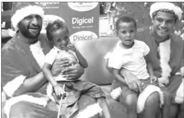
FADA KRISMAS KAM PINIS: Mobail telepon kampani, Dijisel, i amamasim planti pikinini long Mosbi na ol ausait provins taim em i holim ol Krismas pati bilong ol stat tupela wik i go pinis. Hia em tupela Fada krismas i sindaun na ol wan wan pikinini i wok long kisim poto wantaim ol, olsem dispela poto bilong tupela pikinini wantaim Fada Krismas i soim. Wanwan pikinini i bin kisim tu krismas presen i kam long Dijisel Faundesen i putim kamap dispela krismas pati bilong ol pikinini i nogat papamama na ol strit pikinini long UPNG Botenikol Gaden.