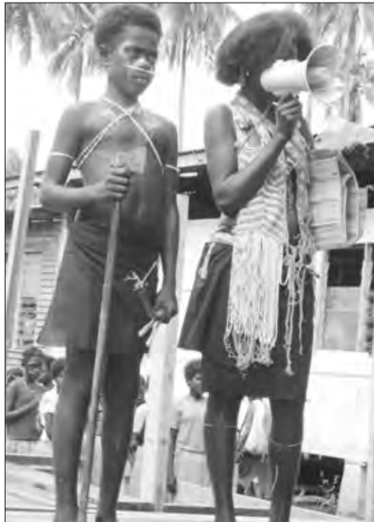
TUMBUNA PASIN: Hia nau em tupela Gret 6 sumatin bilong Monoitu Praimeri skul long Siwai, Saut Bogenvil soim pasin kastom we skul i holim strong nau yet.