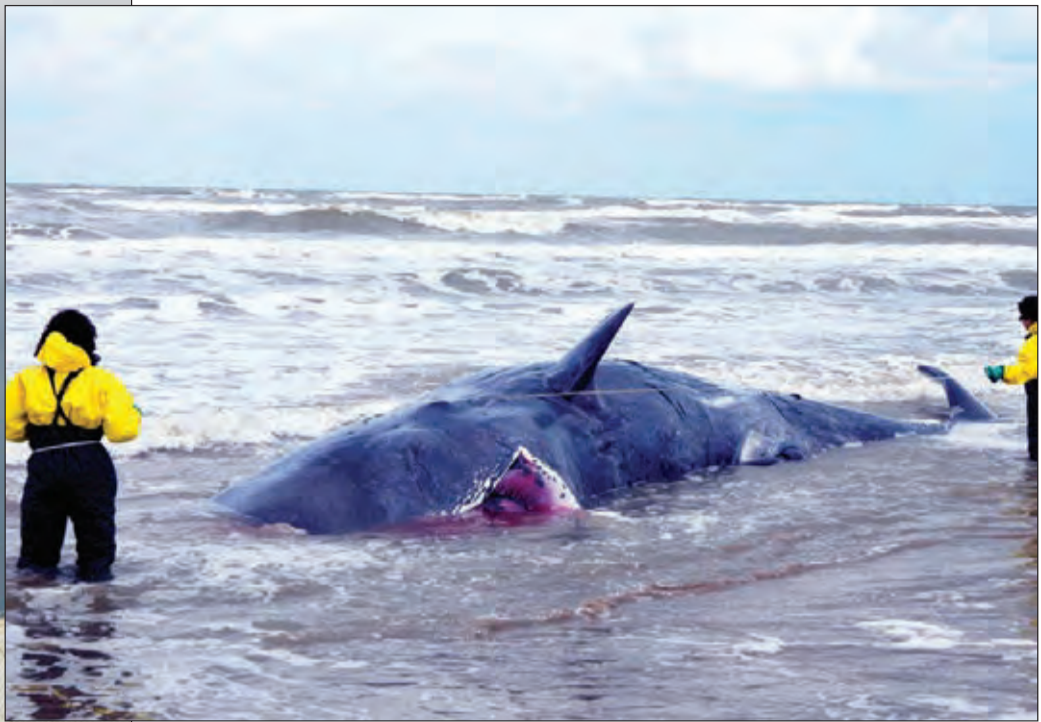
BUNGIM BIRUA LONG WESAN : OL saveman i makim longpela bilong dipela welpis we i bin kam antap long nambis long haiwara, na i no inap go bek long biksolwara. Dispela nambis em long Foce de Varano long Foggia siti long sauten Itali. Sevenpela welpis i bin sua, na long dispela, foapela i dai.