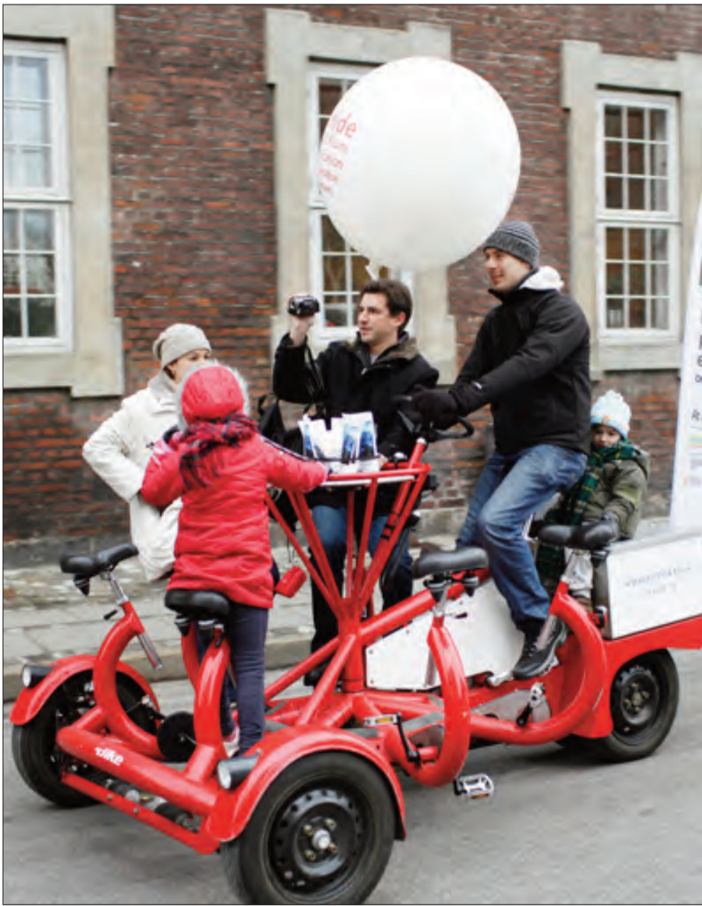
FAIVPELA-MAN WILWIL OL lain i sindaun antap long wanpela faivpela man wilwil na raun long Kopenhagen (Copenhagen) long Denmark. Dispela em i wanpela promosen bilong strongim tingting bilong ol manmeri long lusim ol motobaik na kar bilong ol na ronim wilwil i go long wok. Bikpela kibung bilong klaimet senis i kamap nau long Kopenhagen.