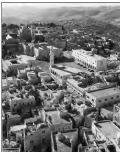
BETHLEHEM: Lukim hap long Bethlehem taun wantaim Basilika o sios bilong Nativity ol i bikdim long ples we Mama Maria i bin karim Jisas long en.

Ol Sister i redim ol pasel kaikai bai helpim planti tausen Kristen long Irak, moa yet, ol lapun, ol lain disebel o sampela hap bodi bilong ol i bagarap na ol lain i gat ol spesel nid, long amamasim dispela Krismas.