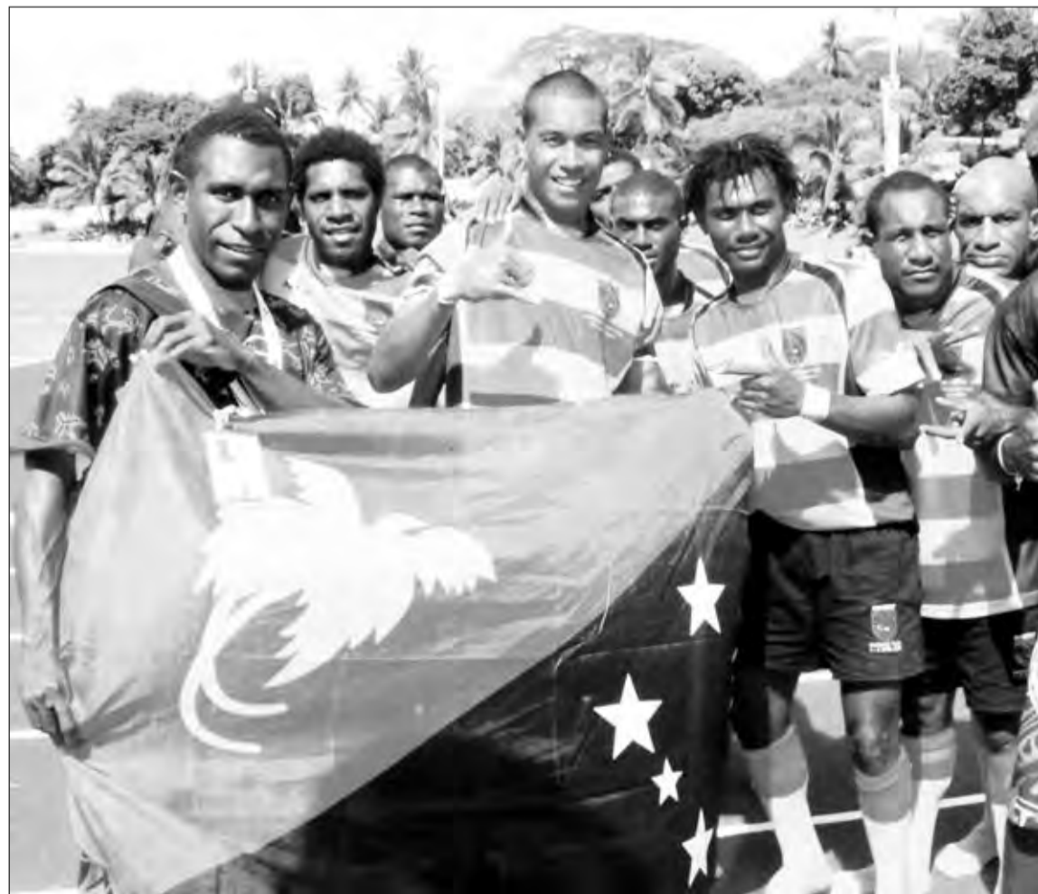
PNG TIM: Soim kala long pilai bilong ol.