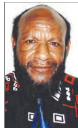
LOTU MAN: Mista Aluya i laikim PNG givim moa amamas na tenkyu i go long God.

noken tok tenkyu nating long maus na i no mekim wanpela samting.