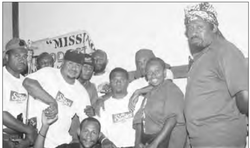
Missing in Action kru wantaim Vaviesi bilong Yumi FM.