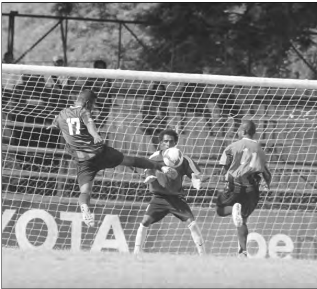
STRAIK: Wanpela pilaia bilong Eastern Stars i traim goli bilong Tukoko University Lae long NSL gem bilong ol long Mosbi las wik Sarere. Tupela i dro 1-1.