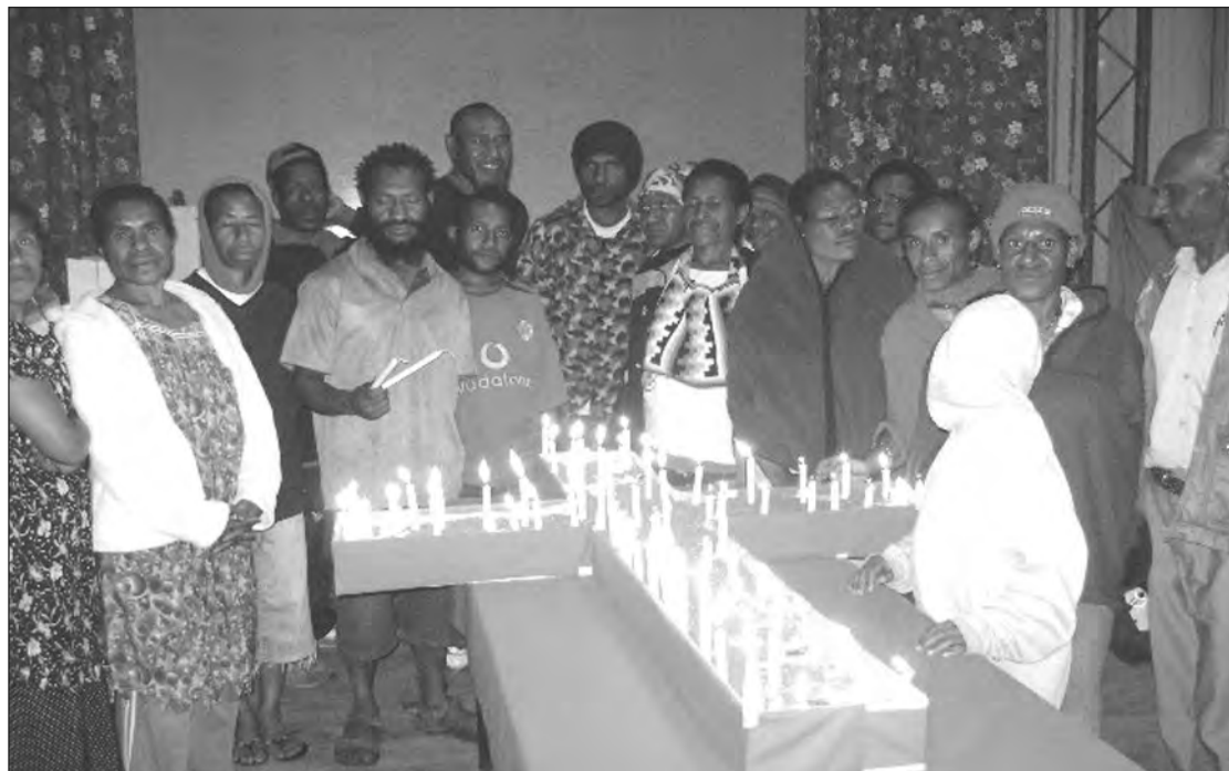
SELEBRETIM WOL AIDS DE: MINIVAVA grup i laitim kendal antap kruse na kofin i soim sik AIDS i save kilim manmeri.