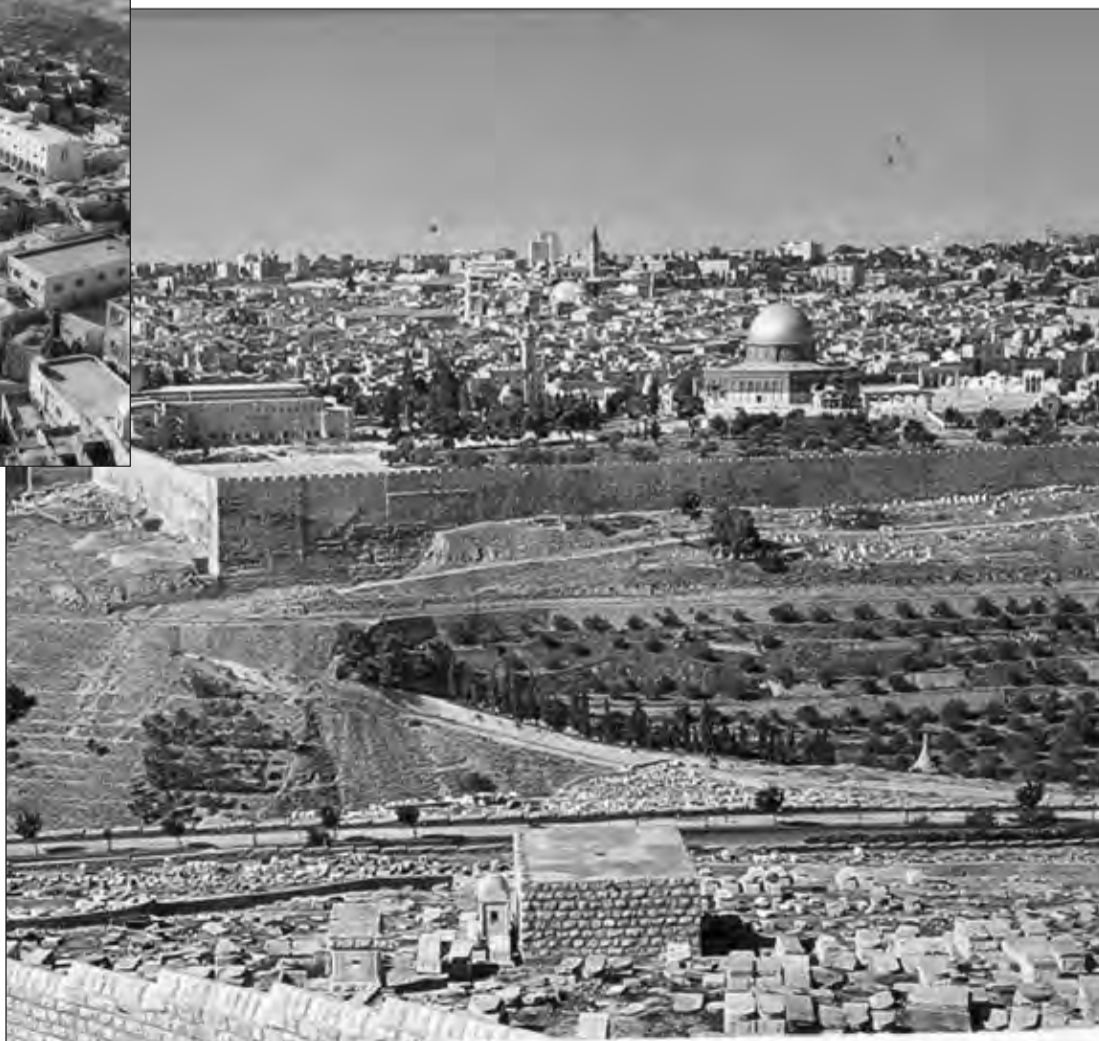
JERUSALEM: Lukim siti bilong Jerusalem long hapsait bilong saut is.