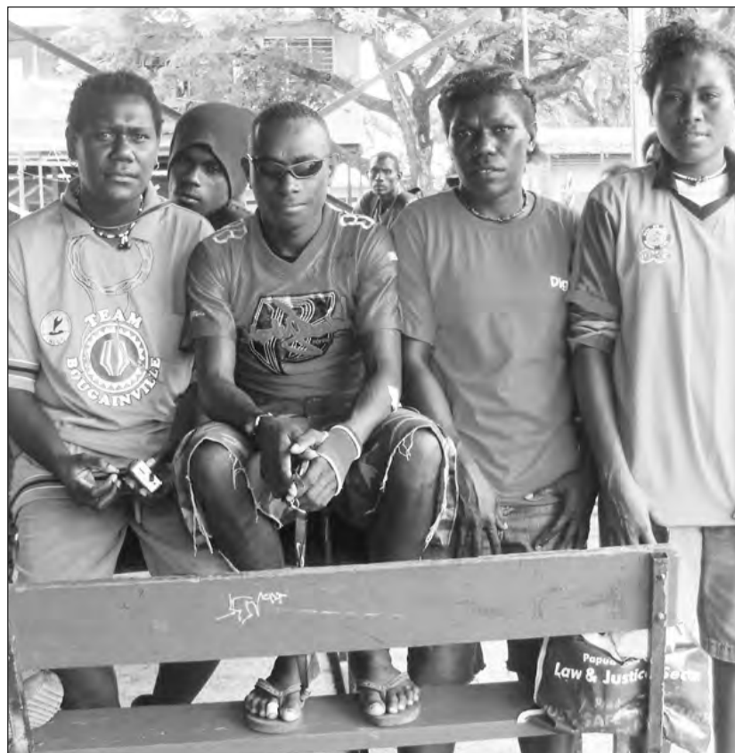
LUKAUT LONG OL MERI BUKA BOKSA: Tripela long ol meri boksa bilong Bogenvil i bin kisim ol (3-pela) silva medol. Oli sanap wantaim ol narapela man boksa na boksing tim menesa. Meri Wantok i kisim poto long Sen Peter Sanel Praimeri skul we Tim Bogenvil i bin stap

Long soka, tim bilong ol Bogenvil meri i bin wokim gut na kamap namba tri long winim brons medol bihain long ol meri Manus na Madang.