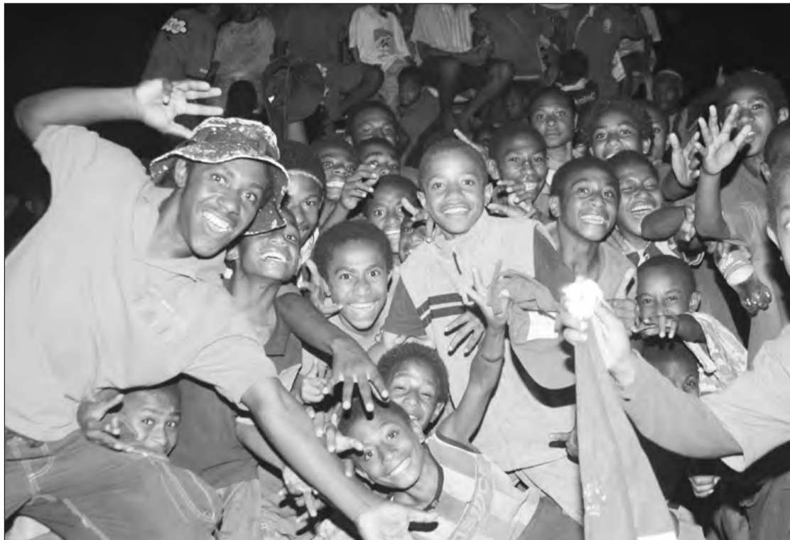
AMAMAS LONG NAIT: Ol yangpela mangi i no isi long bung na lukim ol muvi piksa long nait long Mosbi siti.

Nau em i mekim gen na kisim moa lait i kam, na long poromanim, ol i sanapim ol bikpela skrin tru na soim ol muvi piksa long amamasim ol manmeri.