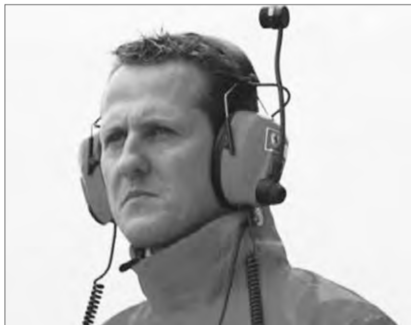
KAM BEK: Ol ripot i tok olsem bipo wol sempion fomuila wan (Formula 1) draiva, Michael Schumacher, 41 krismas i laik kam bek na resis gen.