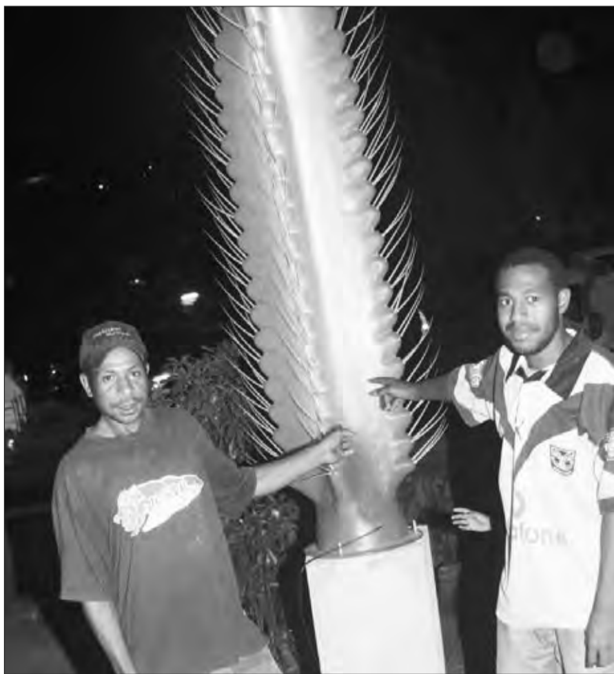
STAIL MOA: Dispela tupela man i wok sanap mangalim wanpela krismas lait i lukim olsem ol plaua bilong ples drai, taim Wantok Niuspepa i bungim ol.