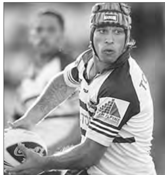
BIKNEM: Sapos NRL i no nap long holim Thurston bai em i go long narapela spot.

Nau em i laik yusim dispela save na ekspiriens bilong em long helpim ol arapela paitman long dispela spot na stail bilong pait.