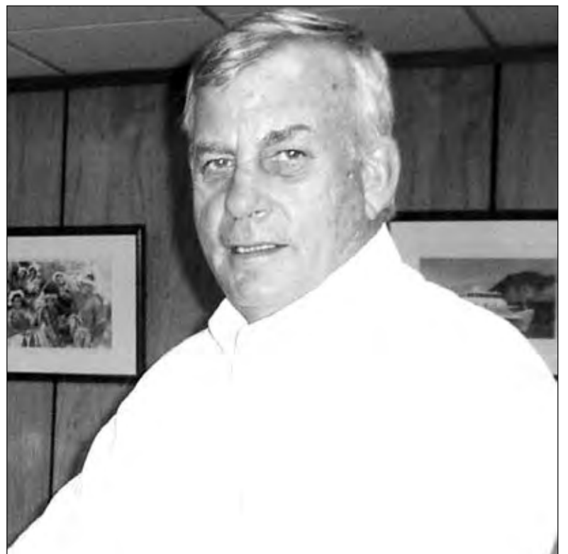
Madang pipel bai kisim taim nogut.

Em i tok inap long wanpela gutpela politikal lida i kamap na senisim rot bilong mekim olsem,