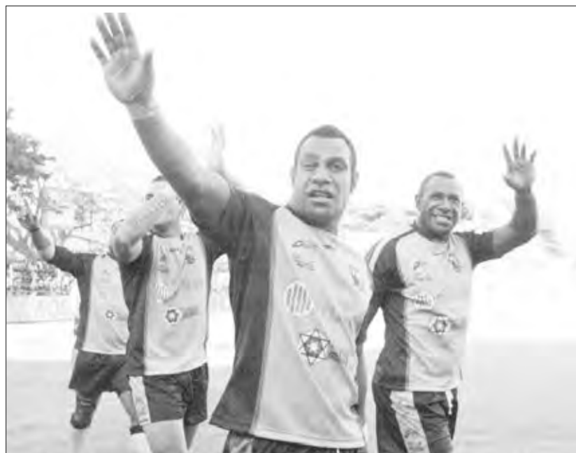
PILAI: Gande (lephan) bai tingim dispela gem olgeta taim. WANTOK POTO.

Wankain long PNG, ol i kisim ol pilaia long NRL na Supa Lig tu wantaim ol asples.