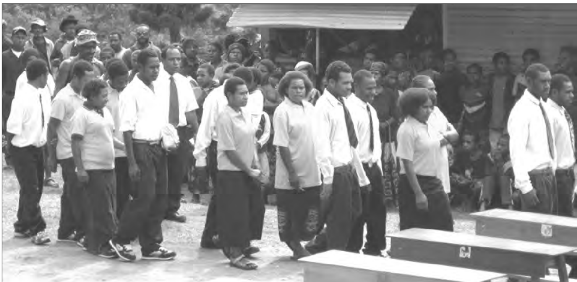
SKUL: Save long rit na rait i bikpela samting.

Em i tok olsem mak bilong ol manmeri husat i mas go long skul i stap daunbilo yet na i gat planti pikinini husat i no skul inap gret 6 o