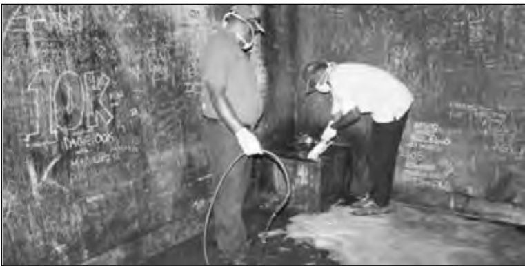
OL polisman meri long Lae i bin klinim Lae Polis Stesin sel long las wik Sarere. Sel ino op long klostu wan mun bihain long ol lain Helt i pasim taim sik kolera igo bikpela long las mun. sampela kalabus man i tok ol i painim dispela sik kolera taim ol i stap long sel na ol i bin kisim ol igo long Angau Hausik. Sel ino op na dispela i givim taim long ol polisman meri igo wok long wiken long klinim, stretim na wasim na mekim redi long ol stilman meri igo bek gen. Ol dispela poto i soim ol polisman i klinim insait long ol sel blok na autsait long polis stesin tu.