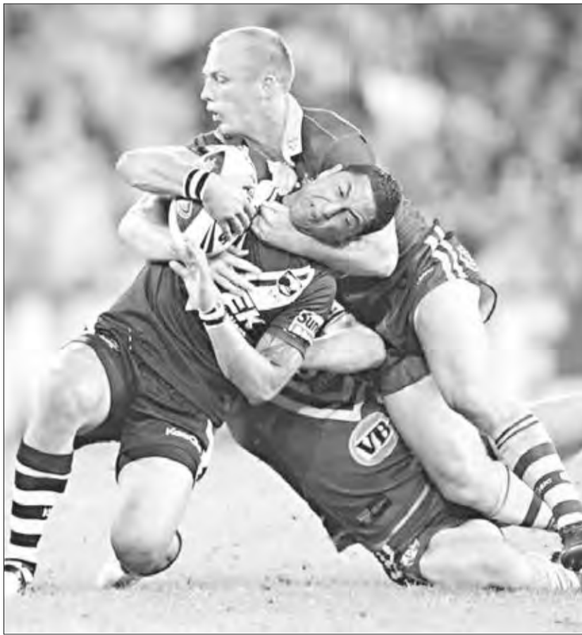
SALENS: Tupela kepten i pait strong long kantri bilong ol.

wanem mipela ino pilai wantaim tumas bipo long dispela gem olsem na em i kamap olsem.