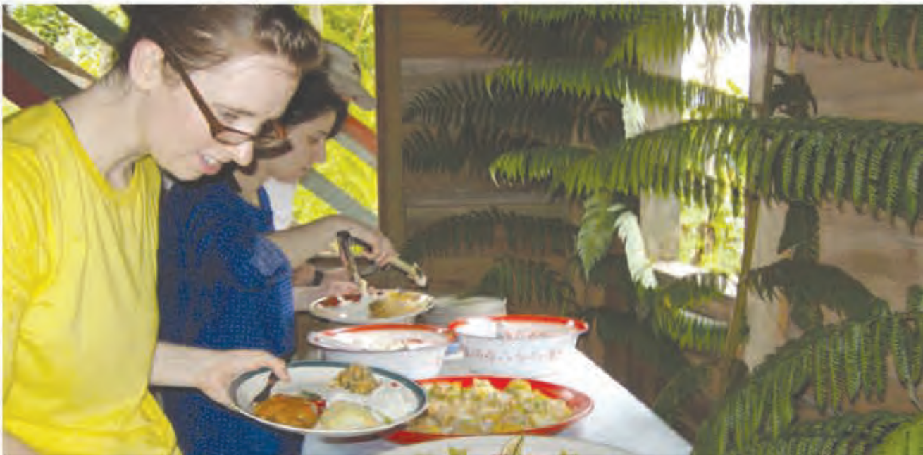
Lokal kaikai (Unu) i promotim Eko Turism long Morobe LLG

intanesinol na lokal maket ejen bilong Rural Eko-Turism na Kalsarel Prodaks. Em i tok tu olsem kampani bilong em bai lukluk strong long wok bilong bringim ol turis igo long ol nupela ples long Distrik we ol i ken amamas long lukim na tu long sait bilong sasteinabol na eko-turism wok. Kampani ya bai redim tu ol bookings, tua operesins na turism konsaltensi sevises.