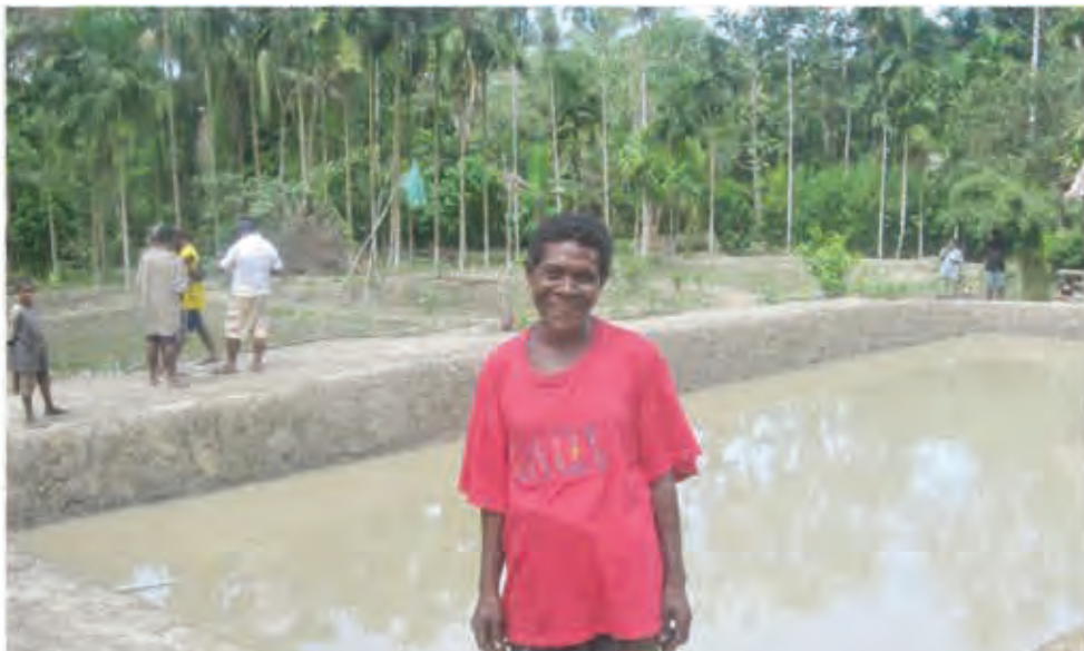
Wanpela meri fis fama bilong Ainse viles, Morobe LLG i soim wanpela fis-pond bilong em.

Dispela ol papa bilong ol projek o ol famas, sampela i stap insait long ol Koporetiv, kampani o bisnis nau i kisim luksave olsem ol lain i bihainim lo wantaim teknikal na menesmen save i kam long BK. Tasol ol i serim wankai ol hevi we ino gat fainensol helpim ol moni-helpim o lon bikos ol lain bilong givim mani ino inap givim na ol kondisen bilong ol i no gutpela long ol lain lokal pipel. Bikpela tenkyu igo long Memba bilong Huon Galp Distrik na Minista bilong Helt, Hon. Sasa Zibe long wanpela K500,000 em i givim igo long Nationwide Maikro Benk long givim igo long wok bilong ol famas insait long Huon Galp Distrik. Ol papa bilong ol projek o ol famas i wok long lukim ol gutpela wok kama long bruk lusim dispela ol tingting bilong 'fri hendaut'kalsa we i stap long hia longpela taim. Em i bikepela samting tu long lukim olsem dispela ol pipel i wok gut long kisim ol liklik dinau na i wok long bekim. Dispela i soim gutpela wok-mak na ol lain bilong givim moni i ken amamas long givim mani igo long ol famas.