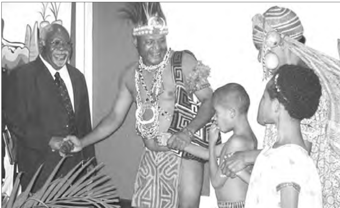
Ol lain bilong Watete Tieta Imekim pilai na karim ol gaden kaikai igo long Gavana Jenerol, Se Paulias Matane long taim bilong launsim bilong FPDA Koporet Plen.