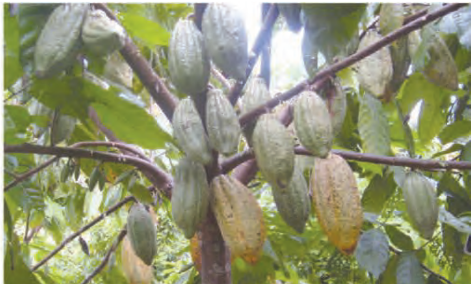
Praktikal wok bilong miksim fis na wokim ol fid long Potsie viles insait long wanpela wan wik trening bilong ol fis famas