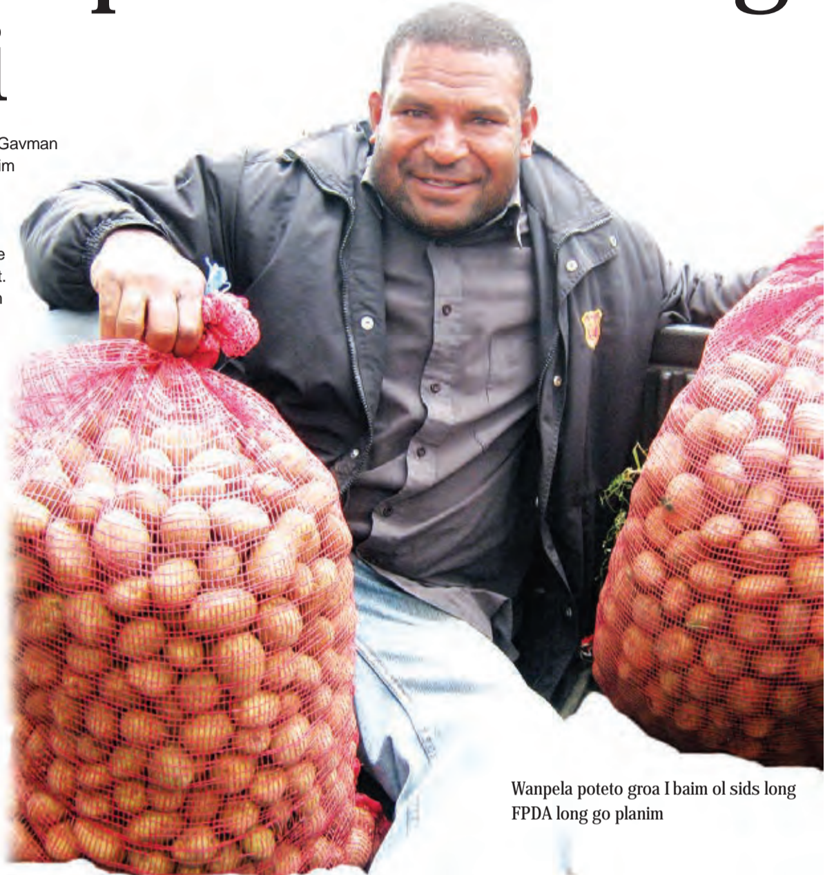
Wanpela poteto groa I baim ol sids long FPDA long go planim

Long painimaut olsem poteto I strong o nogat, em rabim skin bilong poteto wantaim pinga bilong yu. Sapos skin bilong poteto I tekewei, yu mas larim long graun liklik taim moa. Poteto bai karim namel long 8 igo 30 tan insait long wanpela hekta gaden. Wanpela hekta I wankain olsem wanpela futbol fil.