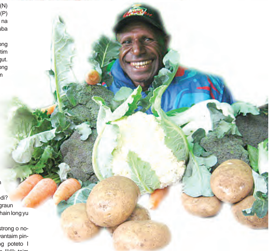
Wanpela viles extensin woka bilong FPDA I soim ol poteto na ol fres gaden kaikai long Tambul.