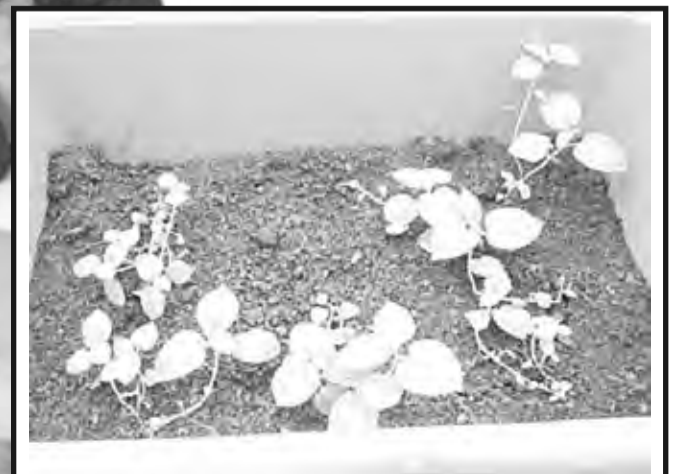
Ol nupela kru bilong poteto i gro insait long poteto sid skrin haus long Tambul.