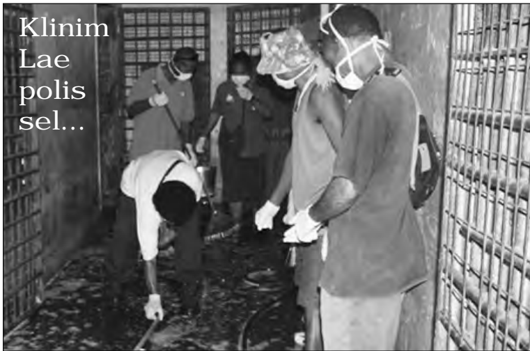
Klinim Lae polis sel...

Tupela projek ol i wok long em nau bai i pinis long pinis bilong dispela yia.