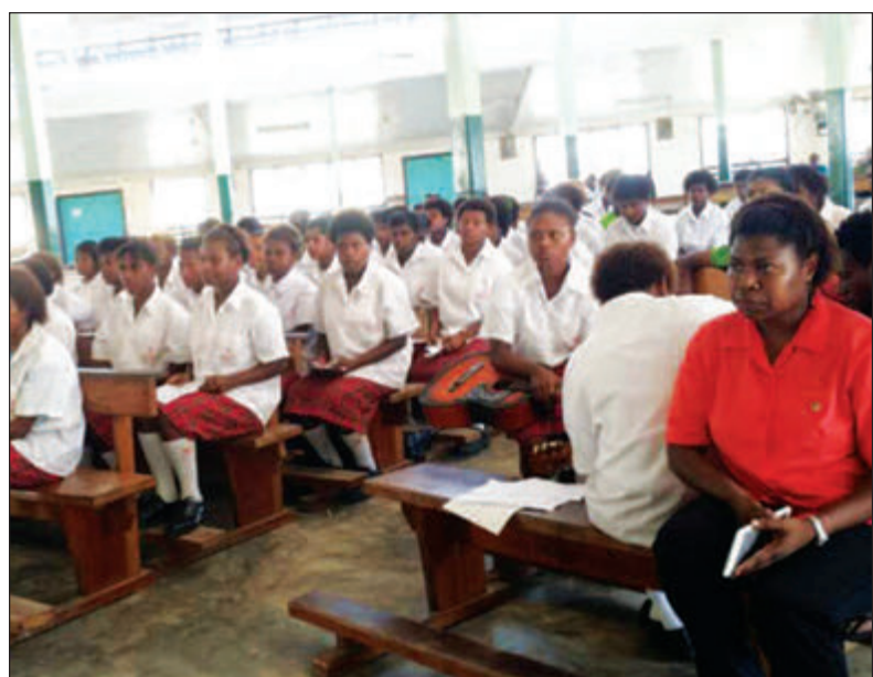
Students and teachers during a school mass.

Caritas Sisters of Jesus are asking your prayers for this newly started fragile mission in Papua New Guinea. Their first Kimbe 'convent' is still a wonderfully colored 20 tons red container!