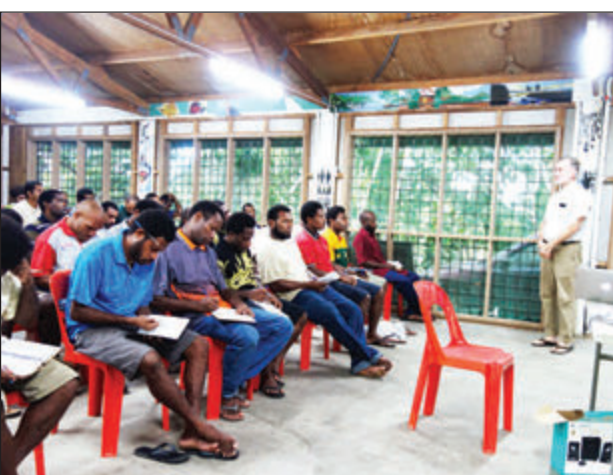
Seminarians during the formation session with Bp Libert.