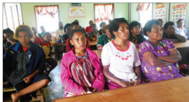
Mary Help of Christians Parish at Kefamo held a number of retreats during the time of Lent.

Mary Help of Christians Parish at Kefamo held a number of retreats during the time of Lent, focusing on the message from his Holiness Pope Francis, titled 'The word is a gift'. Other persons are a gift'.