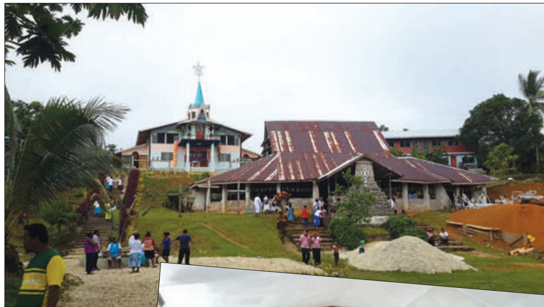
New church on top and old church at the bottom.

The bishop Luciano willingly approved the plan. Materials and labour from Bishop and his friends came up to SBD (Solomon Bank dollars) $500,000, and the rest, a whopping amount of SBD 700,000 came from the people, a major