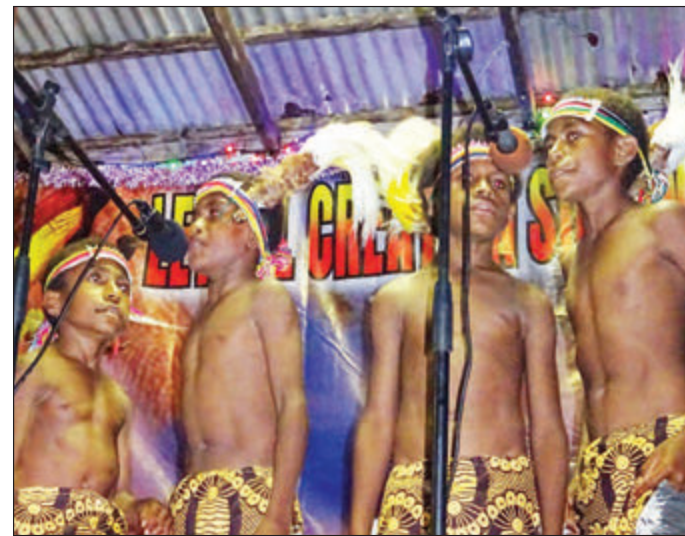
Singsing em mipela ya, ol pikinini i amamas na singsing.