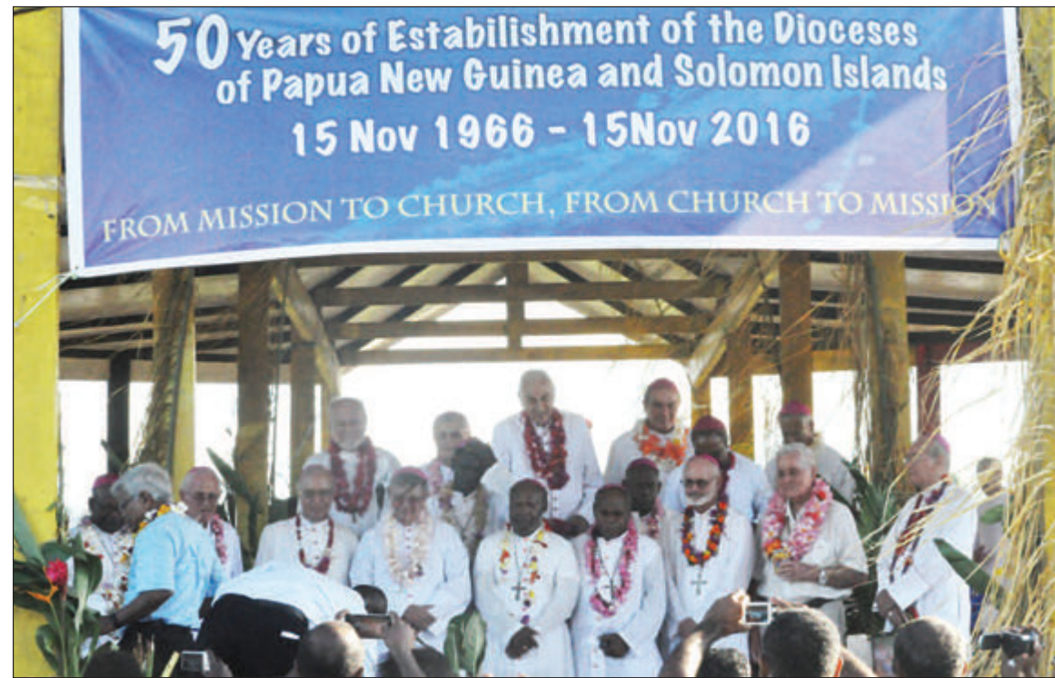
Bishops gather at the Vanimo AGM to celebrate the golden jubilee on the establishment of dioceses in PNG and Solomon Islands.

In 1844, the present territories of Papua New Guinea (PNG) and Solomon Islands (SI) were under the Vicariate Apostolic of Micronesia and Melanesia entrusted to the Missionary Congregation of the Society of Mary (Marists). In 1845 the Marists were in San Cristobel in the Solomons and in 1848 in the Siassi Island of Papua New Guinea. The Pontifical Institute of Foreign