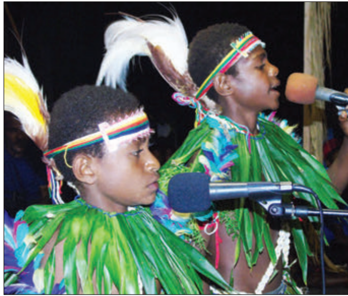
Ol pikinini i putim ol stail bilas na selebretim de bilong ol.

Em yet bipo em i bin singsing long kompetisen na