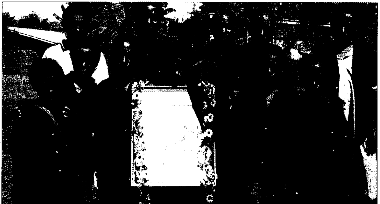
¶ Ol lapun na yangpela manmeri wantaim i bin save long na laikim tru Pop John Paul 2. Ol manki bilong strit long St Michael's Street Kids Literacy School (Santu Michael's Strit Kids Literesi Skul) long Eriku, Lae, Morobe provins, i holim wanpela piksa bilong Pop.

Ol bikpela wol na sios lida i bin stap namel long moa long 4 milien pipel husat i bin pulapim Vatiken na Sen Peter's Skwea long witnesim funerel bilong Pop i bin kamap long las Fraid. Moa long bilien pipel moa long wol i bin lukim misa bilong dai bilong em long TV taim moa long 4 milien i bin